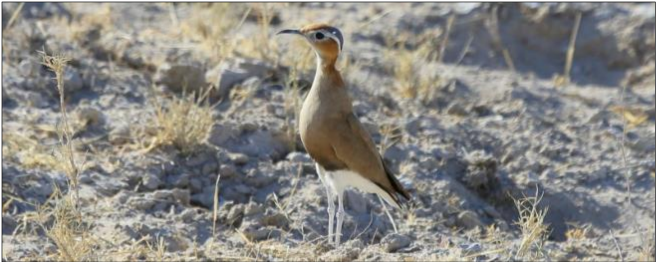
The nomadic Burchell's Courser

in the early morning light, we managed to track down and have good views of a female Hartlaub's Spurfowl. Also on the cards were calling Orange River Francolin (heard not seen), African Palm Swift, Swallow-tailed Bee-eater, Grey-backed Cisticola, a Bokmakierie devouring its breakfast and a confiding pair of Karoo Scrub Robins! After a hearty breakfast, we headed for Spreetshoogte Pass with the hopes of locating one of the most sought-after of Namibia's specials, Herero Chat. As usual the conditions on the pass during our descent were fairly cold and windy, which made birding challenging. However, our persistence paid off and we managed to spot and enjoy very good views of a pair of chats; one even allowed fairly close approach and gave good photo opportunities for a brief moment. Other species seen on the scrubby, rocky slopes included Dusky Sunbird, Long-billed Pipit, Great Sparrow, Black-throated