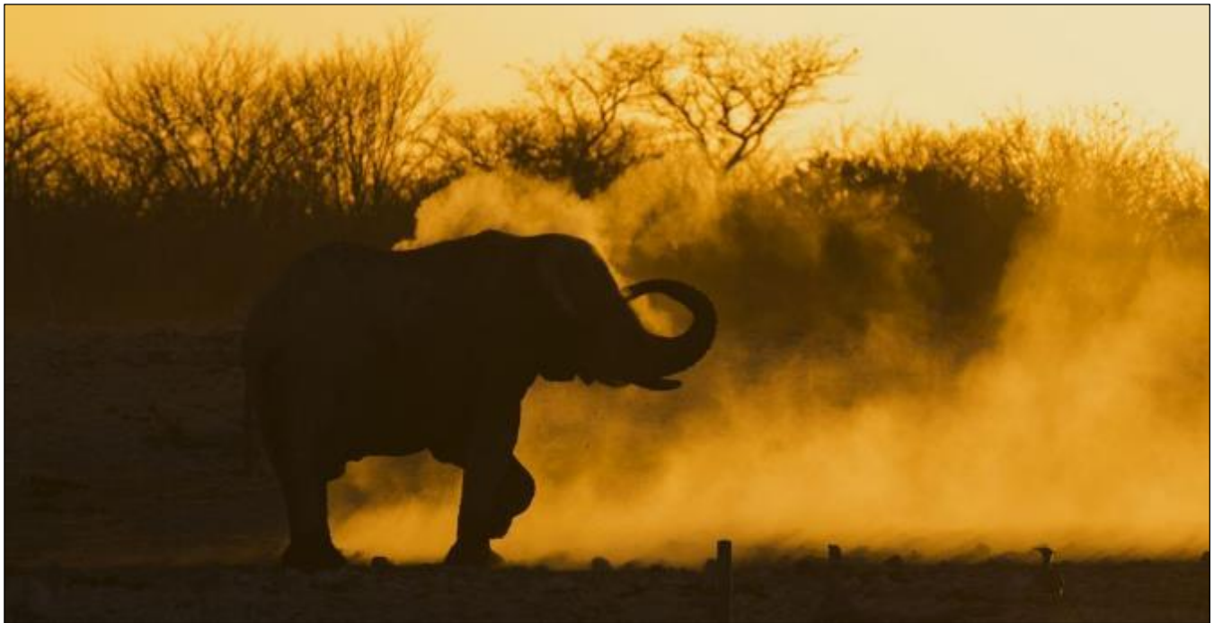
African Elephant dust bathing at sunset, Etosha National Park