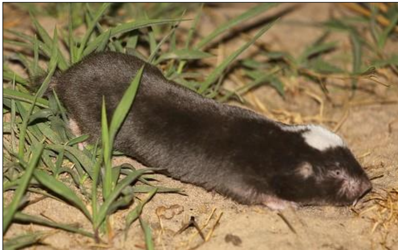
Damara Mole Rat

Our last few days in Namibia were spent in the far north eastern corner of the country in the vicinity of Katima Mulilo. Habitats in this area included riparian woodland/forest, Mopane woodland, seasonally