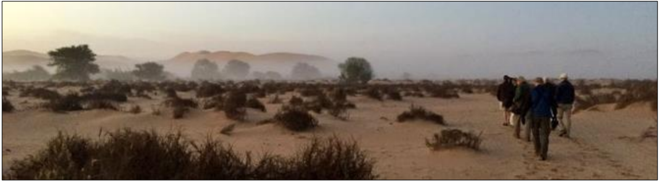
Searching for Dune Lark at sunrise south of Walvis Bay

coast. En route we observed Common Ostrich (truly wild birds), the nomadic and erratic Burchell's Courser, Lesser, Rock and Greater Kestrels, Cape Crow, Spike-heeled and Gray's Lark, Grey-backed Sparrow-Lark, Karoo Chat, Black-chested Prinia and half-a-dozen Rüppell's Korhaan.