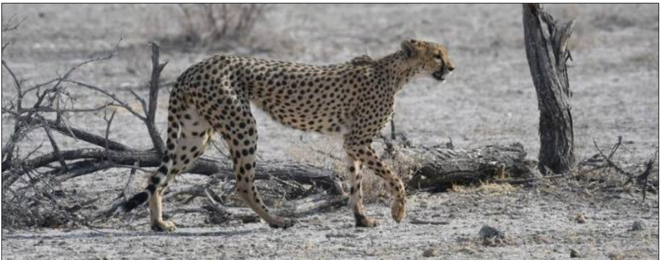
Cheetah, eastern Etosha by Mike West

Moving onto the eastern and north-eastern regions, we still had some highly sought-after birds and mammals to find. The Namutoni area, Andoni Plains and our private lodge outside the park yielded Barred Wren Warbler, numerous flocks of the attractive Burchell's Sandgrouse, 20 or so of the elegant Blue Crane, Caspian Plover, Golden-tailed Woodpecker, both Black-faced and Southern Pied Babblers, more Burchell's Courser, Martial Eagle and Chestnut-banded Plover. Mammalian highlights here were two