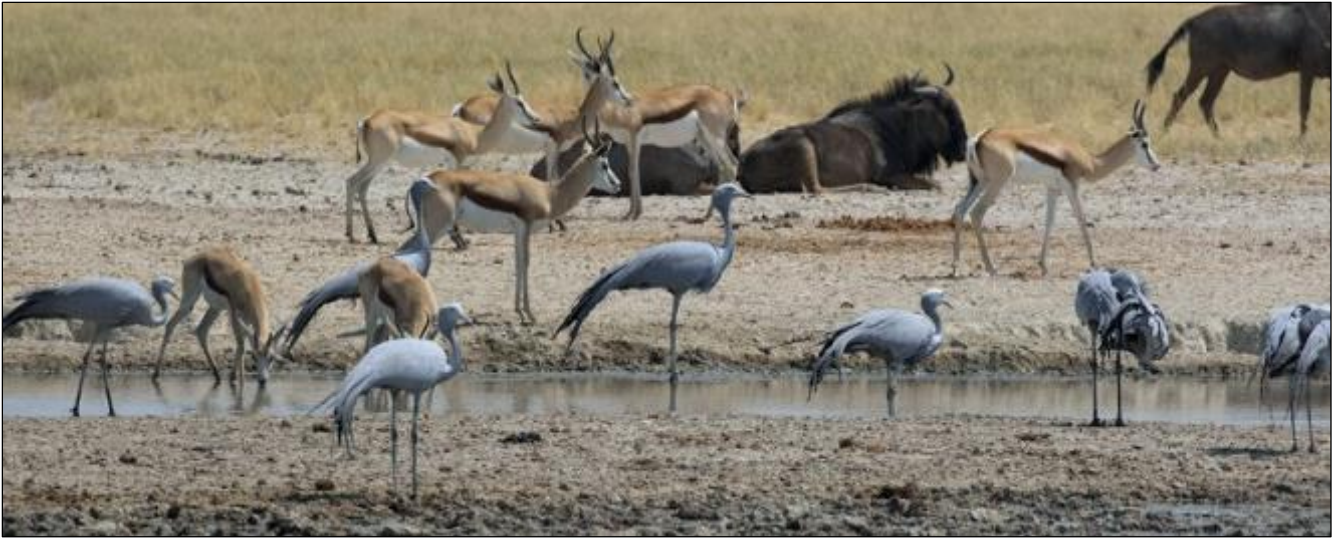
Flock of Blue Cranes alongside Springbok and Common Wildebeest, Andoni Plains in Etosha

Impala and Giraffe coming in to quench their thirst. After dark, the concentration of animals dissipated, however, we still observed African Elephant and several impressive Black Rhino.