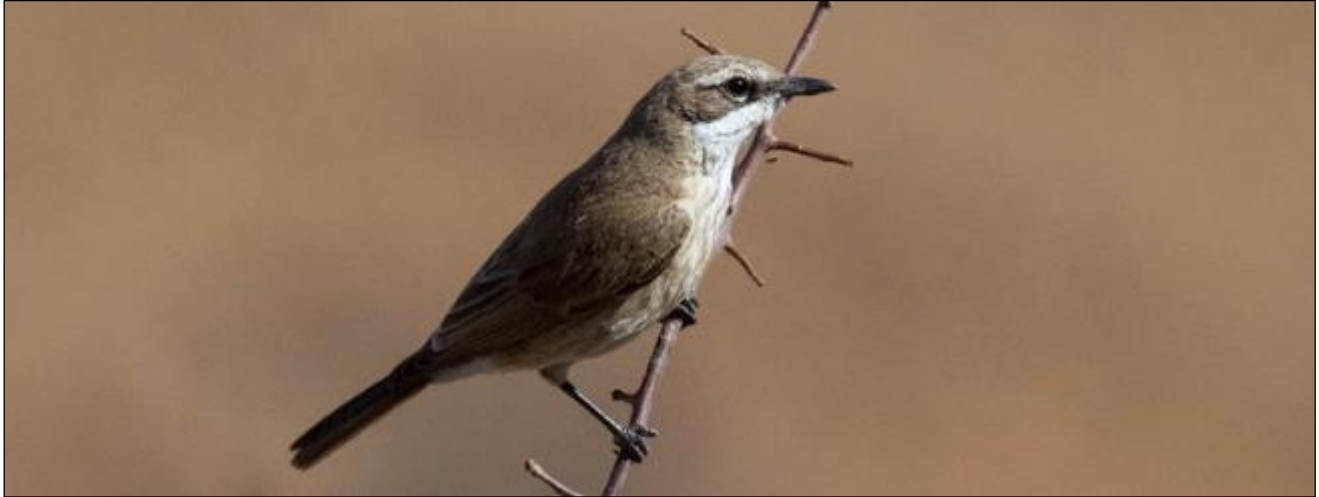
The highly sought-after Herero Chat

Just before dawn, we tried our luck at enticing in a Freckled Nightjar that was calling near our accommodations but alas, the bird was uninterested and did not co-operate. Continuing on the walk, now