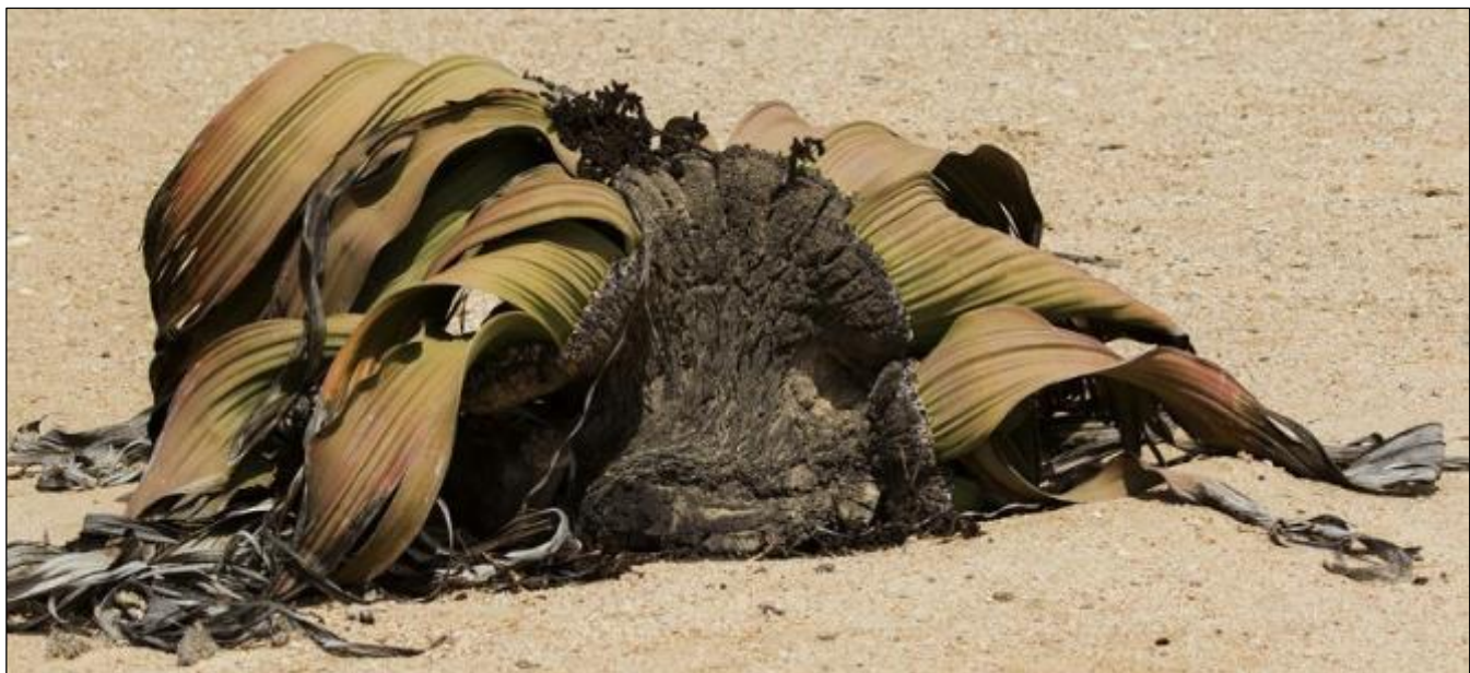
The bizarre Welwitschia