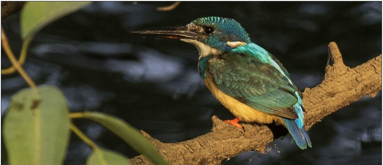
Half-collared Kingfisher

The final leg of our trip took us from Namibia into southern Zambia and after several hours of enduring a horrendously potholed road we eventually made it to Livingstone. The afternoon was spent at Victoria Falls which didn't have much water flowing over it but it was still an impressive site. The forest at the falls was very dry but we did manage to find Red-winged Starling, the vocal Trumpeter Hornbill and