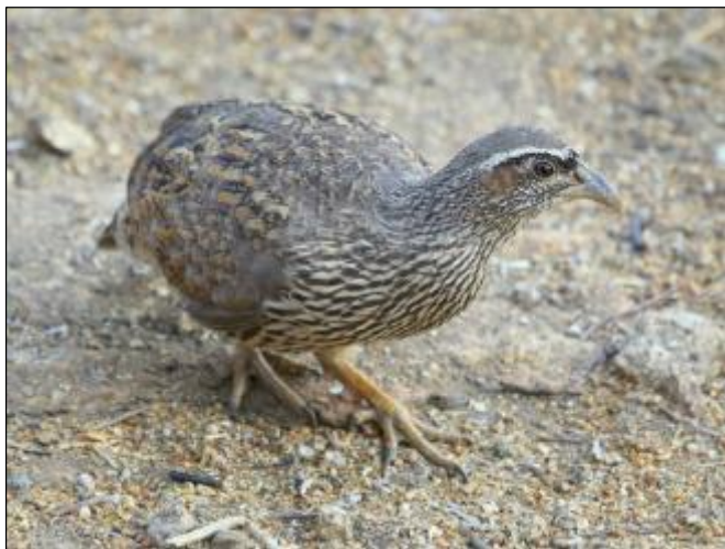
A male Hartlaub's Spurfowl, Erongo Mountains

Leaving the cold Atlantic behind, we ventured inland to the Erongo Mountains, an ancient massif of volcanic origins. En route we stopped in at the impressive Spitzkoppe to search for a handful of species.