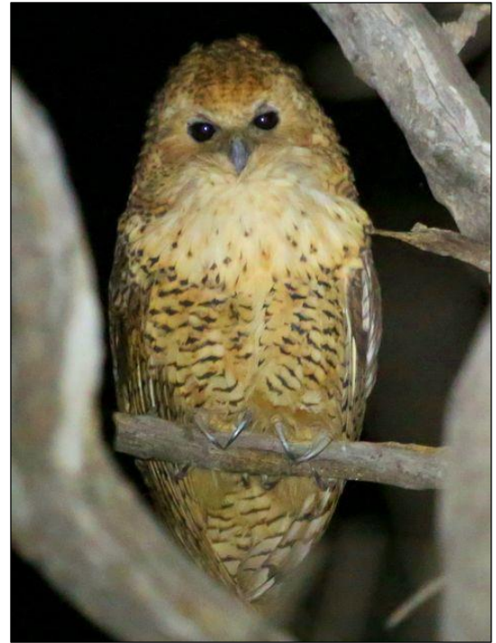
Pel's Fishing Owl by Chris Lester

Our last few days in Namibia were spent in the far north eastern corner of the country in the vicinity of Katima Mulilo. Habitats in this area included riparian woodland/forest, Mopane woodland, seasonally