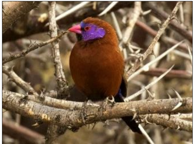
Violet-eared Waxbill male by Dave Semler

After lunch, we continued onto Gammams Water Care Works just outside Windhoek for the afternoon session and the obligatory sewage works visit of the tour. Waterfowl were common, as were Acacia associated species adjacent to the ponds. We racked up South African Shelduck, Southern Pochard, a White-backed Duck, Red-billed, Cape and Hottentot Teals, Purple Swamphehen, numerous Three-banded Plover, Grey, Black-headed and Purple Herons, Black-crowned Night Heron, African Darter and both White-breasted and Reed Cormorants. Aside from the hundreds of Wattled Starling - which kept us entertained with their mass flocking, we found Yellow-bellied and Burnt-necked Eremomela, a small family group of three Cape Penduline Tit, hordes of White-backed Mousebird, a pair of Pearl-breasted Swallow, Black-throated Canary and Red-headed Finch. All-in-all, a solid opening day on an unfavourable wicket!