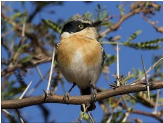
A female Pririt Batis by Dave Semler

Namibia is in the grip of a fairly relentless drought and this was clearly evident on our first day in this magnificent country. The vegetation was excessively arid (comparative to normal years) and the birding relatively quiet for Acacia woodland and scrub.