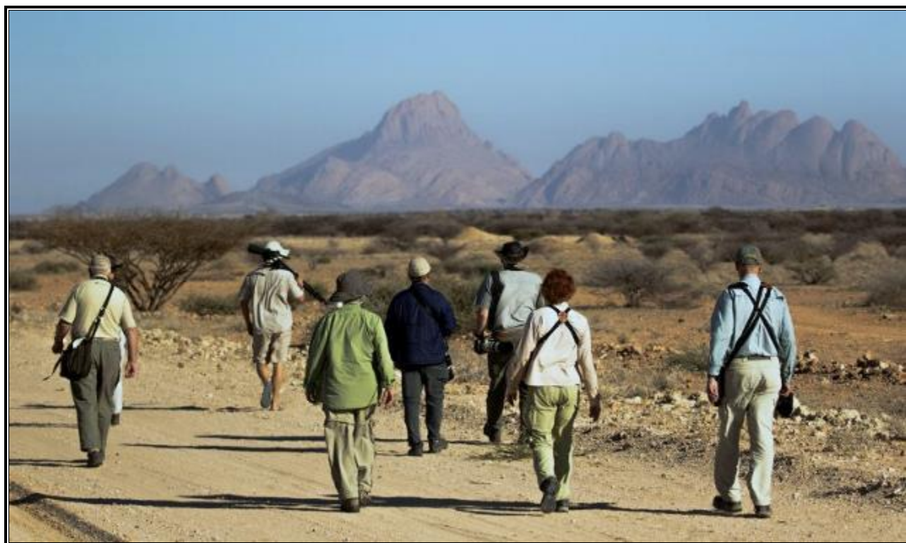
Group birding gravel plains & Acacia scrub near Spitzkoppe