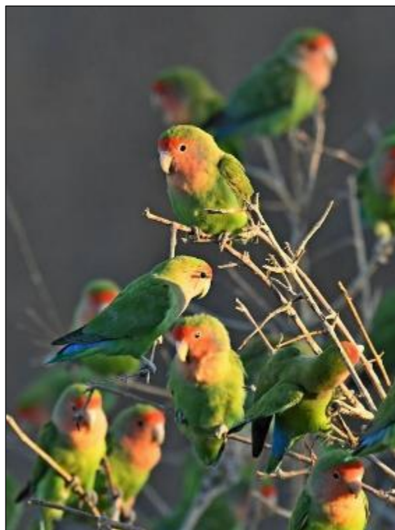
Flock of Rosy-faced Lovebirds, Erongo Mountains

Our strategy for Etosha National Park was to spend time in two of the park's rest camps, namely Okaukuejo and Halali, and another private lodge on the eastern boundary. By doing so, we afforded ourselves access to most of the park and a diversity of habitats. Working the arid grassland and scrubby bushes of the south-western region produced most of the desired targets, and these included half-a-dozen species of lark with Eastern Clapper, Stark's and Pink-billed being the highlights. Other noteworthy birds seen were 15+ Burchell's Courser, numerous Double-banded Courser, Namaqua Sandgrouse, a pair of nesting Spotted Eagle-Owl, Greater Kestrel, Red-breasted Swallow and the delightful Rufous-eared Warbler. Of course, a visit to Okaukuejo is not complete unless several hours were spent at the camp waterhole, and we did just that. In the heat of the day it was an endless procession of game, with Springbuck, Greater Kudu, Plains Zebra, Gemsbok,