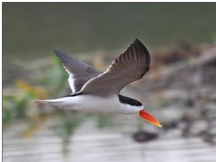
African Skimmer by Mike West

associated species we spotted the diminutive Hottentot Teal, Little Grebe, Striated, Grey and Squacco Herons, Little Egret, African Darter, African Marsh Harrier, the secretive African Rail, African Snipe, Black Crake, African Swamphen, Three-banded Plover, stunning Greater Painted-snipe, Little Stint, Ruff, Marsh Sandpiper, scores of Wood Sandpipers, Malachite and Pied Kingfishers, the striking and highly vociferous Swamp Boubou and Lesser Swamp Warbler. Later on, we reached our lodgings on the banks of the Okavango River with views into southern Angola. An evening session here was also productive and yielded good numbers of new trip birds including Yellow-billed Stork, African Openbill, Little Bittern, Collared Pratincole, African Black Swift, Giant Kingfisher, Yellow-bellied Greenbul, Wire-tailed Swallow, Arrow-marked babbler, melodious White-browed Robin-Chat and Southern Brown-throated Weaver.