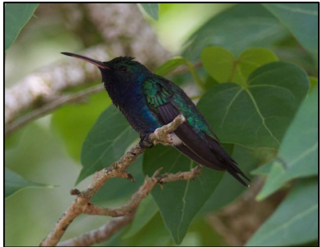
Sapphire-bellied Hummingbird by Clayton Burne

Some of the group started the day a few km up the road above the lodge. As it got light we heard a calling Mottled Owl and managed to get good looks. A Slaty-backed Nightingale-Thrush and Sierra Nevada Brush-Finch were seen on the road. Our main target was the endemic Santa Marta Antpitta; we heard a couple calling and managed to lure one to dash across the road, but shortly after we saw one close in the undergrowth that climbed the roadside bank allowing reasonable views. Two White-tailed Quetzals called and fed in roadside trees. After breakfast we started back down the road towards Minca. We made a stop to try and see Rusty-breasted Antpitta and the whole group enjoyed fabulous prolonged views at this wonderful little antpitta. Further down we enjoyed some flocks and caught up with the delightful diminutive Scaled Piculet. Two roosting Black-and-white Owls were watched in the scope before we stopped at the Hotel Minca for lunch.