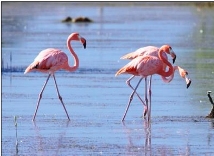
American Flamingo