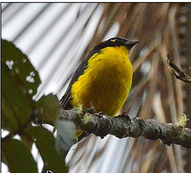
Santa Marta Mountain Tanager

In the afternoon we birded around the lodge area picking up the endemic Sierra Nevada Brush-Finch and seeing the Band-tailed Guans that abound. A quick walk up the road added the Santa Marta Toucanet. After dinner owling was very tricky with a very bright moon - we heard and had flight views of 2 Santa Marta Screech-Owls but they were always perching far into dense foliage and could not be seen perched.