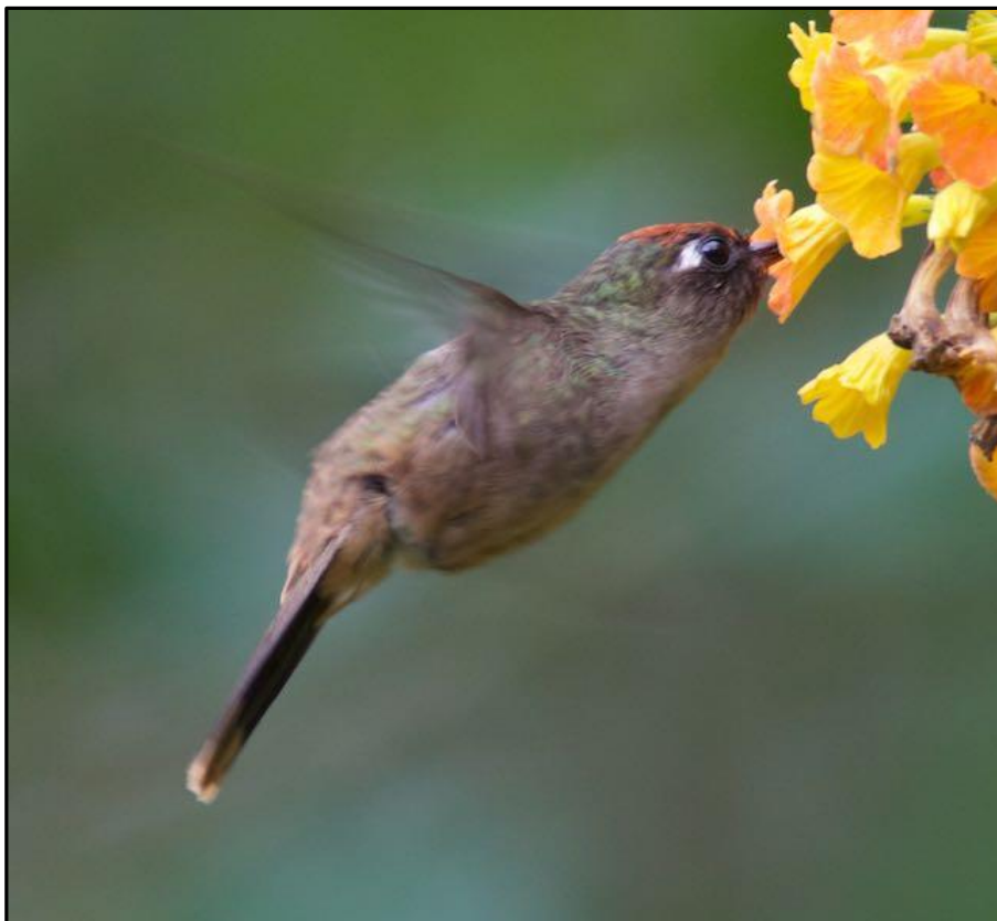
Santa Marta Blossomcrown