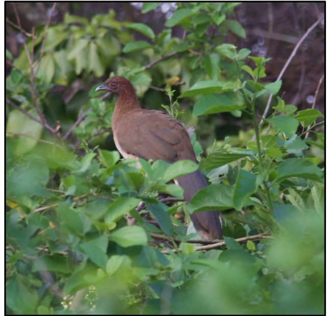
Chestnut-winged Chachalaca by Clayton Burne

Mangrove trail and were rewarded with Bicoloured Conebill, an immature Bare-throated Tiger-Heron, Pied Puffbird and many Prothonotary Warblers. Back around the visitor centre we enjoyed great looks at Panama Flycatcher before we finally pinned down the Critically Endangered Endemic Sapphire-bellied Hummingbird. We headed on to the track at km 4. This area was hit hard by the rainfall during the recent hurricane and we had time to walk in and out along the somewhat muddy track. The birding was great though and in addition to good numbers of many waterbirds we caught up with a good variety of landbirds including the endemic Bronze-brown Cowbird and the delightful Stripe-backed Wrens. It was getting hot so we headed back to the hotel to freshen up and then on for a delicious lunch before going to the airport for our flights to Bogota.