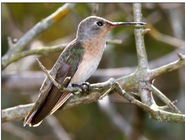
Buffy Hummingbird by Adam Riley

After lunch we worked hard but eventually teased out the local Black-backed Antshrike. Heading down to the coast we stopped and enjoyed great looks at about 10 of the endemic Chestnut-winged Chachalacas. As we headed west an impressive thunderstorm developed and we made a few stops to view waders and waterbirds from the bus en route to Barranquilla.