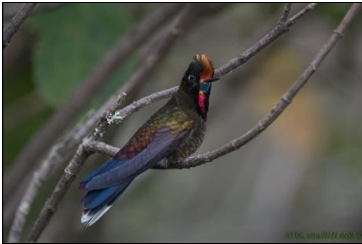
Rainbow-bearded Thornbill by Rob Williams

Yellow-eared Parrots as they flew back to their roost. Scarlet-fronted Parrots were feeding in trees along the trail and we also enjoyed good looks at Chestnut-capped Brush-Finch, Azara’s Spinetail and Flame-rumped Tanager.