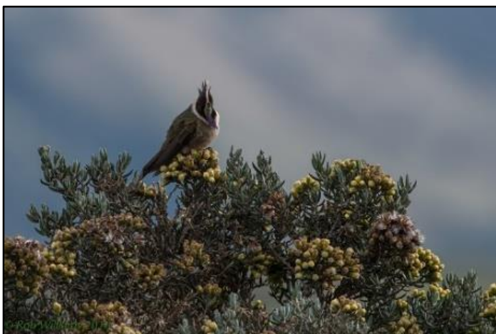
Buffy Helmetcrest