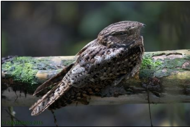
Chuck-will's-widow by Rob Williams

The three ranges of the Andes of Colombian and the adjacent lowlands are home to the most diverse avifauna on earth and the Colombia Highlights tour targets these areas in search of the endemic and spectacular species that can be found here. Staying in a diverse range of hotels - from downtown in cities to rural lodges or small typical Andean towns - we explored some of the most beautiful landscapes and habitats found in the Andes and the Magdalena and Cauca valleys that separate them.