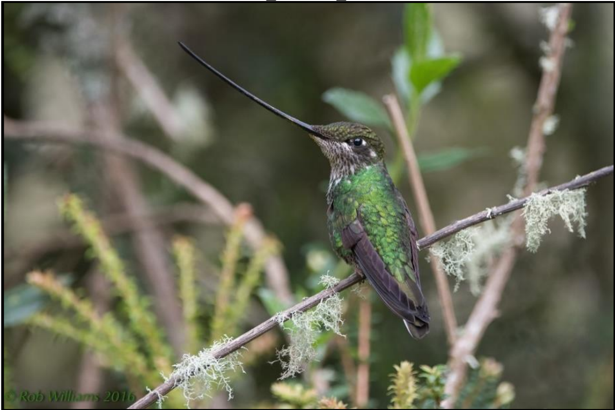
Sword-billed Hummingbird