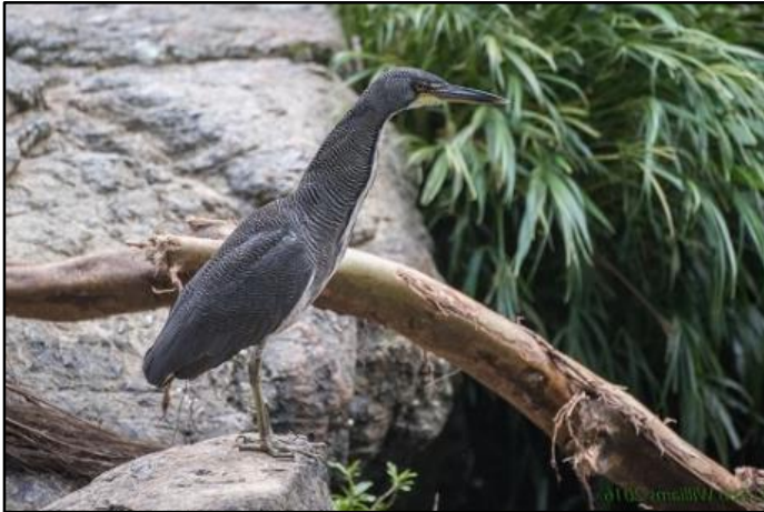
Fasciated Tiger Heron

Olivaceous Piculet, Cinnamon Woodpecker, Collared Araçari, Dot-winged Antwren, Olivaceous Flatbill, Black-billed Flycatcher, Fulvous-vented Euphonia and Yellow-backed Tanager, amongst others.