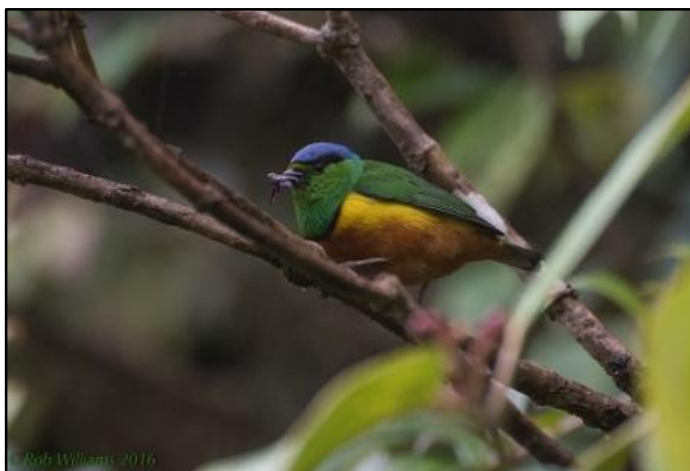
Chestnut-breasted Chlorophonia

Day 5: Friday 18 November 2016 - Rio Claro area: We enjoyed a fantastic morning birding along the Rio Claro valley. Our predawn start gave us a fly-over Crested Owl and looks at Perched Spectacled Owls, twice. As dawn came, we started enjoying the fabulous birding that this beautiful river canyon provides. Just before breakfast we enjoyed fantastic views of a singing Magdalena Antbird at close range. And after breakfast, an adult Fasciated Tiger-Heron. During the morning, we enjoyed a lot of great birds, including Rufous Motmot, White-tailed Trogon, Gartered Trogon, Chestnut-backed Antbird, Antioquia Bristle-Tyrant, Black-capped Pygmy-Tyrant (the world's smallest passerine), Bronze-tailed Plumeleater, Rufous Mourner and Buff-rumped Warbler. We also saw several groups of the endemic Silvery-brown Tamarin monkeys. In the late morning we headed to a nearby road and birded down a particularly good ridge, rapidly finding our target birds, the endemics, White-mantled Barbet and Beautiful Woodpecker. We also found the fabulous Citron-throated Trogon,