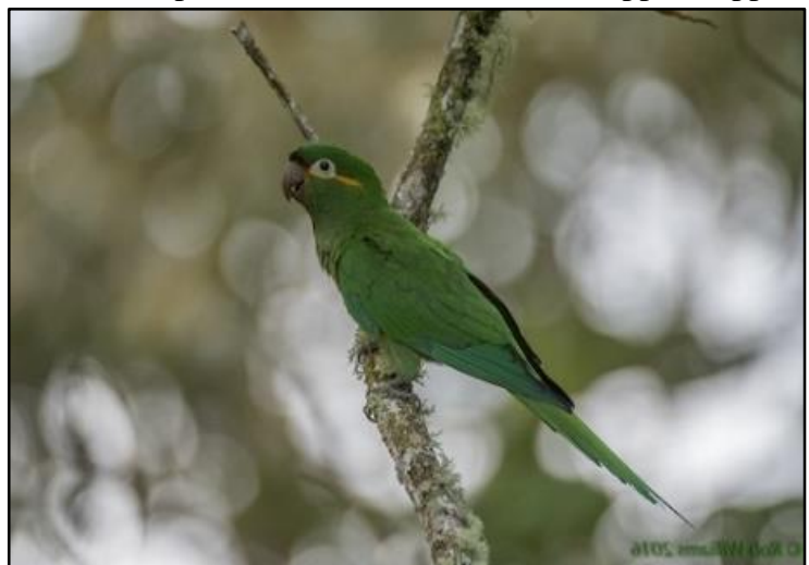
Golden-plumed Parakeet

Day 11: Thursday 24 November 2016 - Los Nevados National Park: Dawn saw us driving on to Los Nevados National Park where the Nevado del Ruiz volcano was smoking on the horizon. The higher elevations gave us fabulous views of a male Buffy Helmetcrest, as well as Tawny Antpitta, White-chinned Thistletail, Stout-billed Cinclodes and Andean Tit-Spinetail. In the valley above Termas del Ruiz, after climbing the slope above the road, we found a flock of Rufous-fronted Parakeets feeding quietly