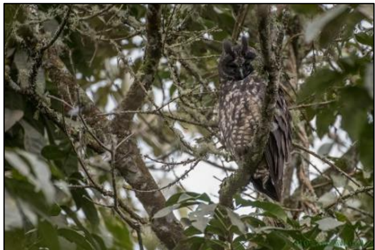
Stygian Owl by Rob Williams

Day 8: Monday 21 November 2016 - Jardin area: Our early start to get up to the area for Yellow-eared Parrot was thwarted by a large landslide that completely blocked the road. We breakfasted at the landslide and then birded our way back down towards Jardin. It was hot and sunny and the birding was very quiet but we enjoyed more looks at the endemic Red-bellied Grackle and found White-naped Brush-Finch and a variety of tanagers and flycatchers. We then headed back to Jardin and took some time to look around and have a coffee on a pleasant sunny day. After lunch, we headed to the Morro Amarillo, where we managed to get flight views of a flock of about eighty