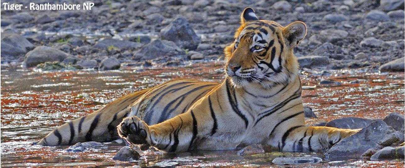
Tiger - Ranthambore NP