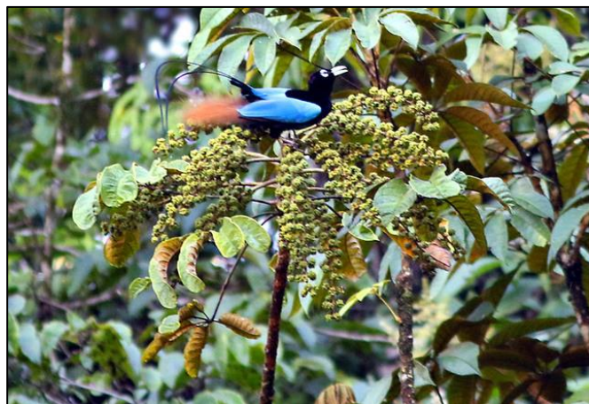
Blue Bird-of-Paradise by Don Roberson

by a Ribbon-tailed Astrapia . The afternoon saw us making an excursion to Murumuru Pass. The inevitable afternoon rains started just as we left the vehicle, but the steady drizzle kept the birds active. Another male Brown Sickiebill was a good find and we spent a fair bit of time trying to keep up with an active group of three Mottled Berryhunters. Most people eventually obtained a good view and we certainly all heard their wonderful song, loud and clear! A flowering tree held both Plum-faced and Orange-billed Lorikeets. A most surprising sighting was a male Archbold's Bowerbird, alas it only flew through the clearing! By late afternoon, we returned to the lodge where we had another night of heavy rain.