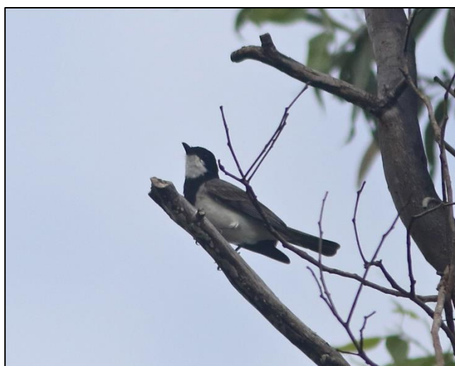
White-bellied Whistler