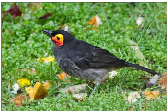
Common Smoky Honeyeater

A female Superb Bird-of-Paradise also paid a visit to the same tree, although we had to wait some time until the male Superb finally made its appearance - it did eventually show quite well for us! While waiting around, we had plenty of interesting birds to keep us entertained: Amboyna, Bar-tailed and Great Cuckoo Doves, Fan-tailed Cuckoo, Marbled Honeyeater, Mountain Myzomela, Buff-faced Scrubwren, Mid-mountain Berrypecker, Island Leaf Warbler and all-too-brief MacGregor's Bowerbird and Blue-faced Parrotfinch. Well pleased with our haul at this spot, we returned to the vehicle and drove back up to the lodge. We tried a spot for Lesser Melampitta and in no time at all, we had a pair dancing circles close around us, giving really good views, although a bit tough to keep up with! A bit of relaxed time around the lodge was highlighted by great views of the female Brown Sickbill visiting the feeding table, accompanied