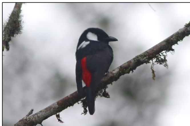
Mountain Peltops by Don Roberson

a very rarely seen species in PNG! We then boarded the vehicle and drove a short distance up the road. A Mountain Cuscus running across the road was a good find, and then we found our target for the excursion: an Archbold's Nightjar perched up on a bank. Initially seen just as eye-shine, it allowed a close approach and good views.