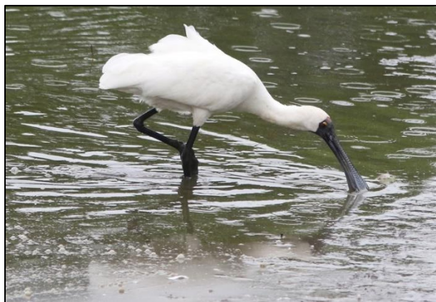
Royal Spoonbill by Don Roberson

males faded back into the forest, egos bruised! What a start to the day!