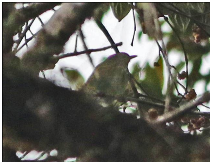
Female Mottled Berryhunter by Don Roberson

three occasions, but never lingered! We bumped into a slow-moving flock which held some interesting species, including Black-winged Monarch, Yellow-breasted Boatbill and Grey Whistler. Shortly after this flock, a rather heavy rain set in and we walked the rest of the trail in wet conditions. Arriving back at the clearing, the last surprise was a Black-billed Brushturkey that flushed up into a tall tree. It kept to the densest part of the tree, but everyone got some sort of view. And with that, we returned to Port Moresby for our final dinner of the trip.