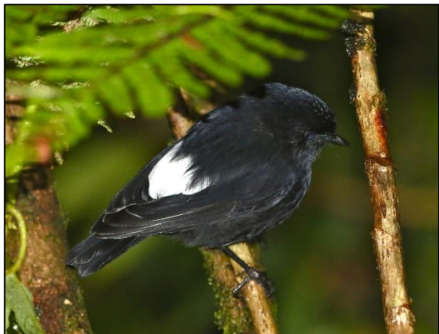
White-winged Robin by Don Roberson

tree and we also recorded female Superb Bop, female Lawe's Parotia, several Princess Stephanie's Astrapia, and another Spotted Berrypecker, along with good views of a Rufous-throated Bronze Cuckoo, White-bibbed Fruit Dove, and unbeatable views of Mountain Peltops! Don was fortunate in seeing a Short-tailed Paradigalla - the only one of the trip. The rain overnight was especially heavy, incredibly good for moth-watching on the lodge walls, if not for night birding possibilities!