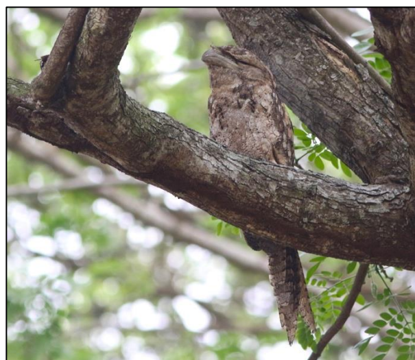
Papuan Frogmouth by Don Roberson

We bumped into two flocks on the way down, both being dominated by Chestnut-bellied Fantails. Other birds picked up in these flocks included Black Butcherbird, Black Berrypecker, Frilled Monarch, Little Shrikethrush, and three species of Gerygone: