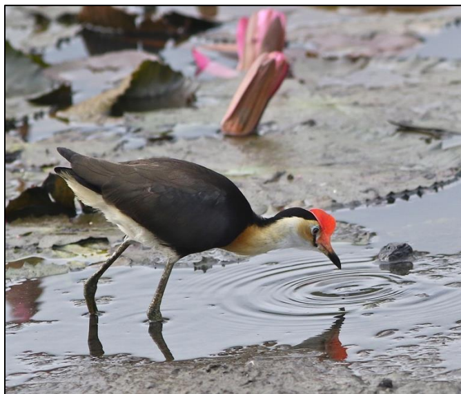
Comb-crested Jacana

The group assembled at our comfortable lodgings in Port Moresby and headed out for a relaxing afternoon of birding at the Pacific Adventist University. We made a quick stop at a small wetland near the entrance where we saw a congregation of waterbirds, namely Great, Little, Cattle and Intermediate Egrets, Pied Heron, along with 3 Straw-necked Ibis, Masked Lapwings and some endemic Gray-headed Mannikins. Moving on to the PAU grounds, we embarked on a short walk and eventually found some Yellow-tinted Honeyeaters. We then had a look at the bower of a Fawn-breasted Bowerbird, before moving on to the ponds area. As usual, there was a multitude of waterbirds present, including Plumed and Wandering Whistling Ducks, Pacific Black Ducks, Little Pied and Little Black Cormorant, Australasian Little