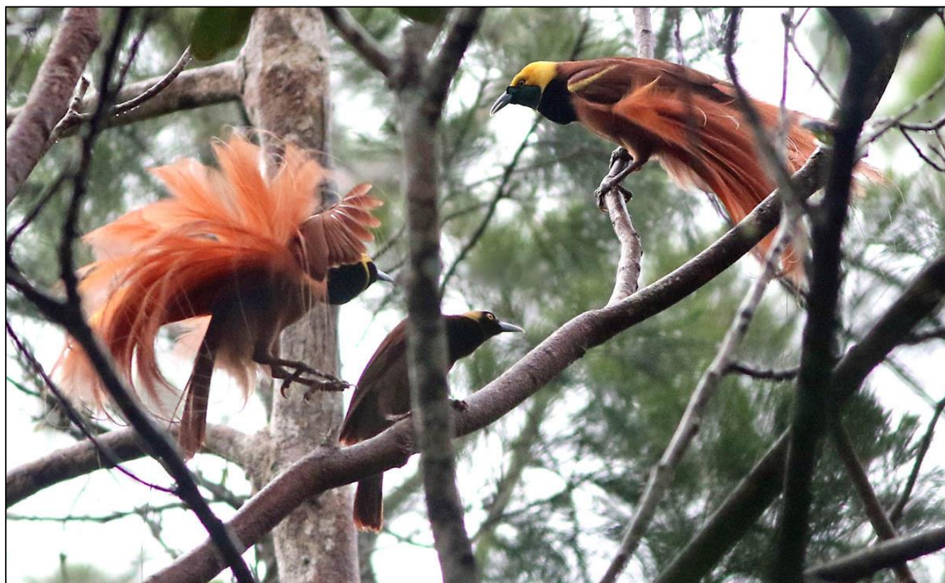
Raggiana Bird-of-Paradise