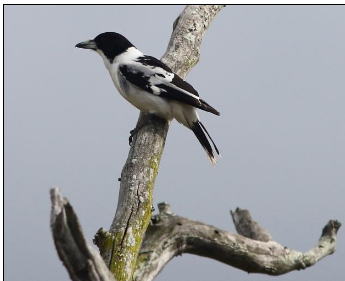
Black-backed Butcherbird by Don Roberson

An early start kicked off a long day's birding in Varirata National Park, one of the country's premiere birding locales! We headed straight up to the famous lekking site of the Raggiana Bird-of-Paradise. The birds were already on site when we arrived, but our arrival flushed them off for a short time. Four males soon returned and had just done a small bit of displaying when a female arrived on scene and chose a male, who she inspected very closely. After some posturing, the pair eventually engaged in copulation, while the other three