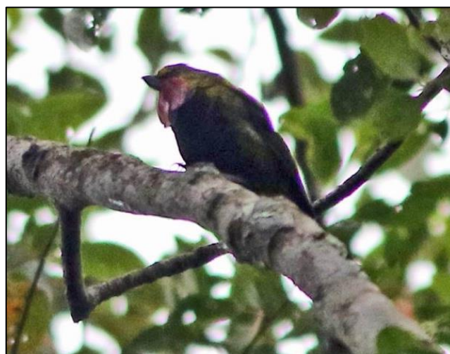
Male Wattled Ploughbill

The scarce Papuan Treecreeper showed well to some, apparently in response to the call of the similar-sounding Spotted Jewel Babbler. Further along, a real Spotted Jewel Babbler did approach very closely but proved difficult to see well. A stunning male Crested Satinbird also put in an appearance but was only seen as an orangey-red flash flying through the forest. A female Fan-tailed Berrypecker was more cooperative! With another very successful morning winding down, it was time to return to Ambua for lunch. After lunch, we headed back to the Gap. Rain threatened and it was not long before the rain had us moving down the mountain, seeming to catch up with us every time we got off the bus for birding. A stop in yesterday's ploughbill area held, rather remarkably, a male Mottled Berryhunter this time - singing at close range and showing quite well. In fact, it was initially found foraging on the ground and then sat on a low, open perch, but soon resumed its typical furtive behaviour! Eventually, the rain chased us right back to Ambua Lodge, but the late afternoon birding there was really good in between bouts of rain. A female Blue Bird-of-Paradise put on a pretty good show in a fruiting