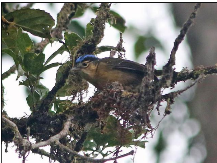
Blue-capped Ifrit by Don Roberson