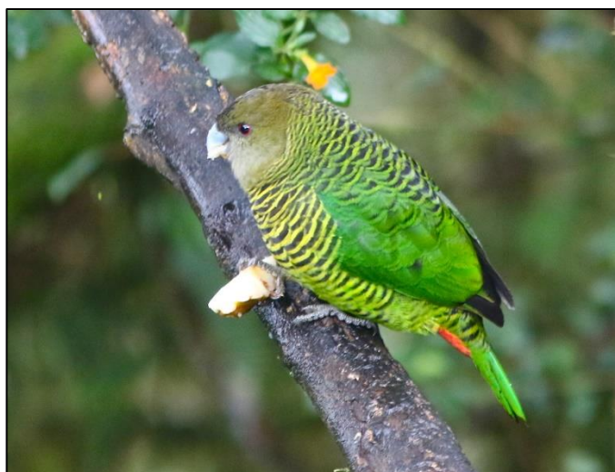
Brehm's Tiger Parrot by Don Roberson

After breakfast, we headed out to the Mt Hagen airport. Our flight was a bit delayed but we arrived in Port Moresby in time for lunch and set out for a return visit to Varirata NP. We walked the overlook trail again. A shy Papuan Scrub Robin was persuaded to cross the trail on