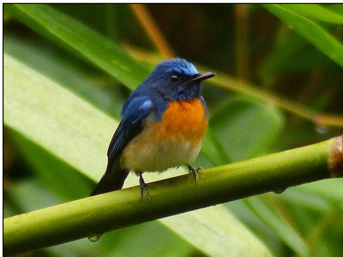
Blue-fronted Blue Flycatcher by Wayne Jones

Tesia. The following morning was equally quiet, although we did enjoy sublime views of a pair of Himalayan Cutias moving about the mossy branches.