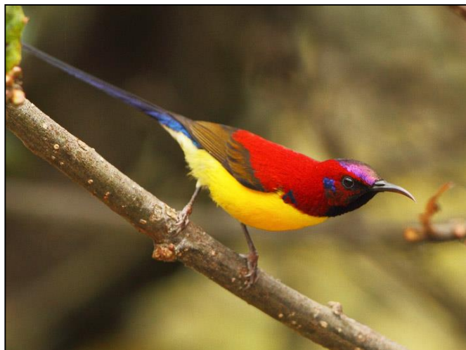
Mrs Gould's Sunbird

close to the road. Further down in the valley we found a Common Green Magpie on its nest. What a pleasure to be able to really examine this gorgeous – and usually hyperactive – species.