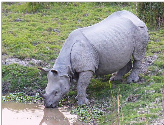
Indian Rhinoceros by Wayne Jones

While trying to locate a calling Long-tailed Broadbill alongside our camp the following morning, we were rewarded with a Spotted Elachura instead. This shy bird eventually granted everyone nice looks as we took turns shifting into position while trying not to slide down the muddy slope or grab hold of a stinging nettle! Elavated by this good fortune, we set out to bird the road below and (later, when it was misty) above our campsite. Despite the occasional intrusion of poor conditions birdlife was abundant and we saw: Great Barbet; Bar-