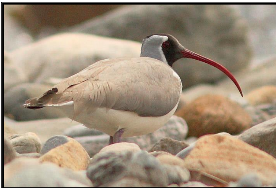
Ibisbill by Markus Lilje