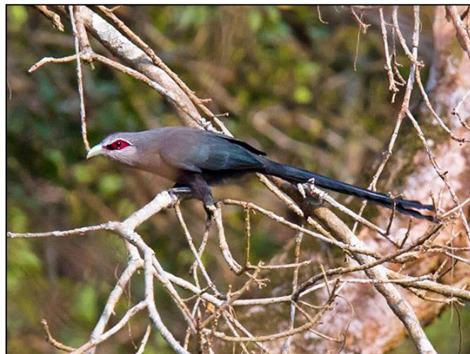
Green-billed Malkoha

In between our excursions to search for the heron we paid a visit to the country's most revered dzong, where coronations, royal weddings and other high-profile celebrations take place. The massive structure is situated at the picturesque