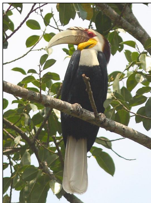
Wreathed Hornbill by Markus Lilje

The following afternoon everyone opted for a pleasant – and cool! – boat ride down the Jia Bhorelli, rather than slogging through the hot jungle anymore in search of the duck. We disembarked the dinghies in a remote part of the river to look for Kentish Plovers and Small Pratincoles and, as luck would have it, we also found a pair of White-winged Ducks! The two birds were uncharacteristically sitting at the edge of a quiet, but