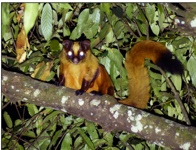
Hodgson's Giant Flying Squirrel

The next day, in contrast to the usual plan, we headed back down to the middle Lingmethang