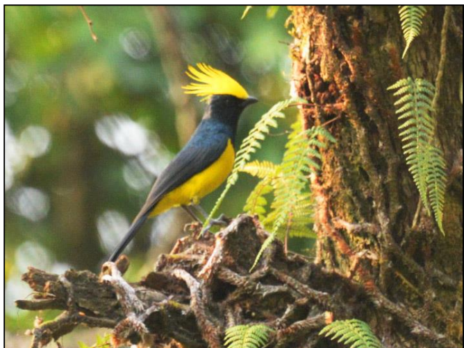
Sultan Tit by Neil Lamb

however, preferred lying in jheels all day with just their faces and colossal horns peeping out the water. One of the mammalian highlights was a group of 10 Smooth-coated Otters that we saw – and heard squeaking – playing in a river. When we passed by the area a bit later they had pulled out onto a sandbank and were sunning themselves.