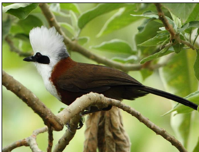
White-crested Laughingthrush

From Morong we moved to Trashigang, stopping at the little market village of Narphung where some of us gleefully discovered pre-packaged chocolate croissants for sale. A stroll further up the road yielded: a highly cooperative Crimson-breasted Woodpecker; Black-faced Warbler; Ashy-throated and Whistler's Warblers; Red-billed Leiothrix; White-tailed Nuthatch, and Chestnut-bellied Rock Thrush. Plus we had Blue-winged, Red-tailed and Bar-throated Minlas all in the same tree. Then, a little later, there was a Large and a Small Niltava – both males and also both in the same tree! Apart from their sizes, these two species are visually almost identical so it was great to be able to compare them. Past Khaling we