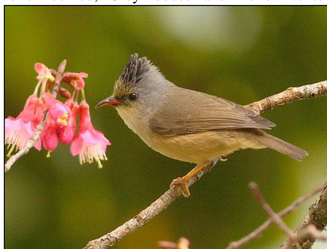
Black-chinned Yuhina by Markus Lilje

For our full day in the Tingtibi area we visited Royal Manas National Park and a stretch of road leading to Zhemgang. The lowland forest and bamboo groves of the national park yielded: a dark morph Crested Honey Buzzard; Blue-throated Blue Flycatcher; Plaintive Cuckoo; Blue-throated Barbet; Black-naped Monarch; Black-crested Bulbul; Rufous-faced, Yellow-bellied, Grey-hooded and Yellow-vented Warblers; Common Tailorbird; White-browed Scimitar Babbler; Grey-throated Babbler; White-hooded Babbler; sought-after Pale-billed Parrotbill, and Streaked Spiderhunter. The broad-leaved woodland along the Zhemgang road served up even more treats: Barred Cuckoo-Dove; Pin-tailed Green Pigeon; Asian Barred Owlet; Blue-bearded Bee-eater; Rufous-necked Hornbill; Fulvous-breasted, Rufous and Grey-headed Woodpeckers; Lesser Yellownappe; Bar-winged Flycatcher-shrike; Large Woodshrike; White-bellied Erpornis; Striated Yuhina; Chestnut-bellied Nuthatch; Orange-bellied Leafbird, and Rufous-necked Laughingthrush. A small group of Great Hornbills delighted us as they fed in some trees