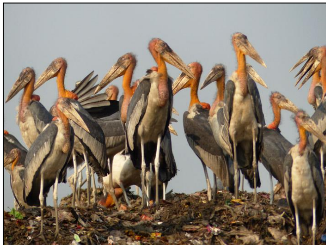
Greater Adjutants

There can hardly be a greater contrast between the starting and ending points of a birding tour than this one! We began our tour of the serene, clean and forested eastern Himalayas in the Indian city of Guwahati, and more specifically, at the Guwahati dump. This large rubbish tip is probably the best place in the world to find the grotesque, endangered Greater Adjutant. Although the dump is not quite as disgusting as one would expect, we were still thankful to find a crowd of these large storks right at the entrance, so we didn't have to wander around too much. This also freed up time to inspect the surrounding area, which yielded: Striated Grassbird; nest-building Common Tailorbirds; Black Kite; Brown Shrike; Zitting