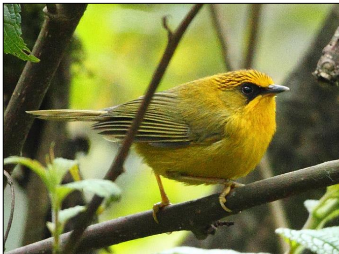
Golden Babbler by Markus Lilje

winged Flycatcher-shrike; Grey-chinned, Short-billed and Scarlet Minivets; Blyth's Shrike-Babbler; Bronzed and Ashy Drongos; Grey-headed Canary-flycatcher; Yellow-cheeked Tit; Scaly-breasted Wren-babbler; Brown-flanked and Aberrant Bush Warblers; Black-throated Bushtit; White-spectacled, Greenish, Grey-hooded, Blyth's Leaf and Grey-cheeked Warblers; Golden Babbler; Himalayan Cutia; Scarlet Finch; Bhutan and Striated Laughingthrushes; Spotted Forktail; Little Pied Flycatcher; Rufous-breasted Accentor, and Yellow-breasted Greenfinch among others.