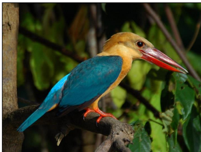
Stork-billed Kingfisher

very open, corner of the river. We all had lengthy looks at these sought-after birds before they took off, revealing their snow-white wing coverts.