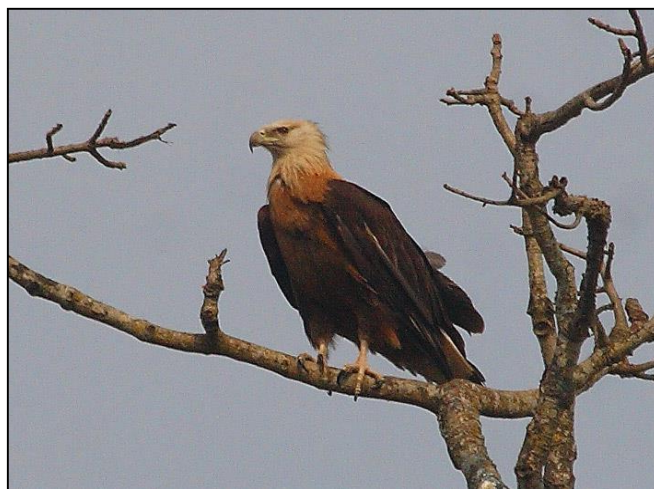
Pallas's Fish Eagle

From Nameri we moved to Kaziranga National Park where our stay coincided with both a royal visit AND an earthquake! On the day that the Duke and Duchess of Cambridge (William and Kate) entered the park, that section was closed off to other visitors, which resulted in a little schedule rearrangement for us. On our way to the other sections of the park, still open to us, we passed numerous TV crews and marveled at how 'spick-and-span' the highway looked, but got not even the slightest glimpse of the royal twosome. That evening, while doing our checklist in the hotel restaurant, the ground started shaking. A second, more severe rumble followed, causing the lights to go out as we rushed outside. The tremor didn't last