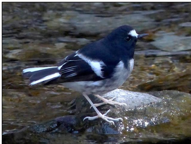
Little Forktail by Wayne Jones

highest tarred pass in the country, in search of Himalayan Monal and we needed to be in position before the roads got too busy. Our strategy paid off as we came upon two iridescent male Himalayan Monals in an open grazed patch alongside the road. We also saw a total of 10 beautiful Blood Pheasants which gave us more prolonged views than the monals. As we drove higher and higher traffic on the narrow highway increased. It turned out to be a public holiday in honour of the fourth king's birthday and many people were visiting the pass for a nice day out. Thank goodness we'd got there early!