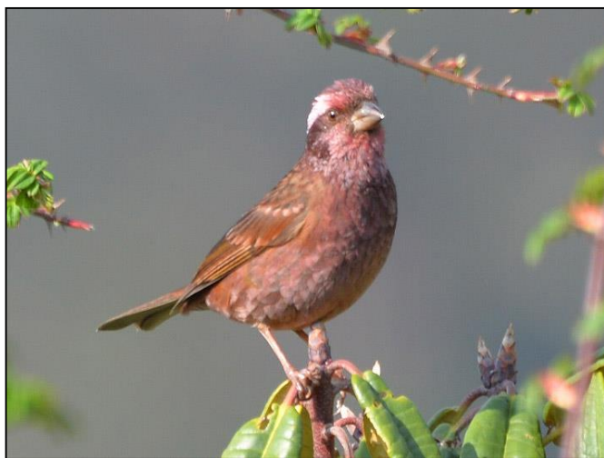
Dark-rumped Rosefinch

Road. We'd been unable to connect with Beautiful Nuthatch, Ward's Trogon or Slender-billed Scimitar Babbler and, after our success the previous afternoon, we had the time to do it. Annoyingly the weather was, once again, not on our side. We didn't find any of the three main targets, but in spite of the rain and ever-present mist we still saw eight new species: Long-tailed Broadbill; Chestnut-headed Tesia; Large-billed Leaf Warbler; Coral-billed Scimitar Babbler; Long-billed Wren-Babbler; Black-throated Parrotbill; White-browed Shortwing, and Blue-fronted Robin. The wren-babbler, especially, gave us brilliant views and was probably worth the cold slog all on its own. Late that afternoon we again went searching for tragopans along the roadside. This time we had better views, albeit mostly of females.