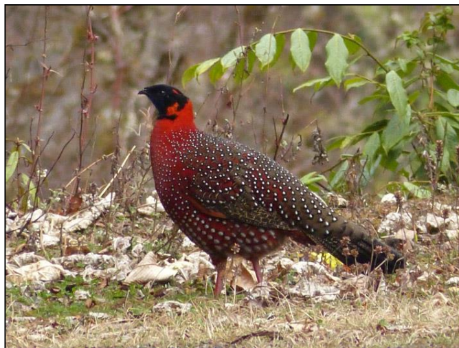
Satyr Tragopan by Wayne Jones

Before departing the Bumthang Valley we visited a patch of bamboo outside of town where about 8 Brown Parrotbills gave us quite a show. The neighbouring Chumey Valley is well known for the quality of woven goods produced there, so we could not pass through without making a stop to load up on souvenirs. With the shopping done - for now - we continued on to Yutongla. Here we admired the distant Black Mountains and dodged construction trucks to find: Grey-sided and Pale-footed Bush Warblers; Hume's Leaf Warbler; Black-faced Laughingthrush; Bar-throated Minla; Slaty-blue Flycatcher, and Green-tailed Sunbird. We made it to Trongsa by lunchtime and visited the Trongsa Dzong shortly thereafter. Two of our local guides took us around the temple-fortress, dressed in ghos - Bhutanese men's formal attire. We learned the basics of Buddhism, but were unable to visit the inner temple as it was closed at the time. Following this cultural interlude we returned to our birding ways and visited a patch of forest to the south of town. It didn't even begin to live up to its promise, however, with the most notable species being Maroon Oriole and Grey-bellied