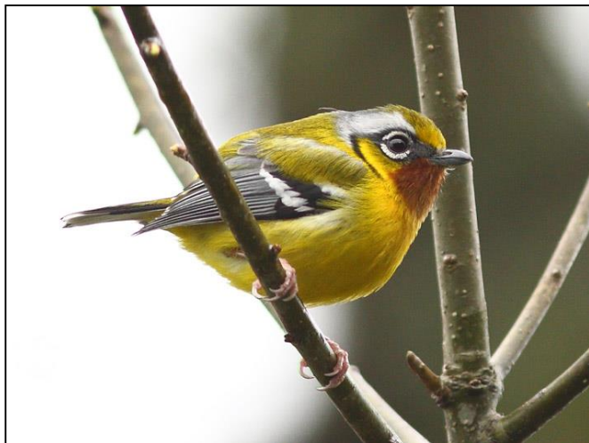
Black-eared Shrike-babbler by Markus Lilje

coloured individual); Rufous-necked Hornbill; Greater and Lesser Yellownapes; Bay Woodpecker; White-bellied Erpornis; the lovely Black-eared Shrike-Babbler; Lesser Racket-tailed Drongo; Mountain and Striated Bulbuls; Pygmy Wren-babbler; Rusty-cheeked and Streak-breasted Scimitar Babbler; Rufous-throated Wren-Babbler; Sikkim Wedge-billed Babbler; Nepal Fulvetta; Grey-sided and Chestnut-crowned Laughingthrushes; Hoary-throated and Rusty-fronted Barwings; Golden-breasted Fulvetta; Dark-sided Flycatcher; Lesser Shortwing; Little Forktail; Ultramarine Flycatcher; Fire-breasted Flowerpecker (14 in one flowering tree alone!); Green-tailed Sunbird; Russet Sparrow; Golden-naped Finch, and White-breasted Parrotbill.