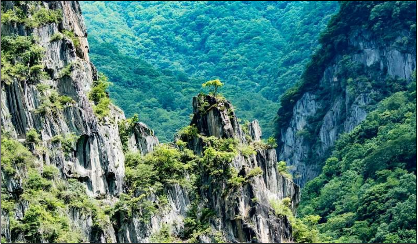
The magnificent scenery at Tangjiahe National Nature Reserve

Our second full day in Tangjiahe began early in the drizzly weather. After breakfast we began the drive up to the area where we'd seen the female Golden Pheasant the day before. The overcast and rainy weather was actually on our side this time, as soon after starting up the track the shouts of Golden Pheasant bellowed from the bus! There at the edge of the road were two gorgeous, adult male Golden Pheasants in all their glory! We watched them for several minutes and were even able to exit the car and walk closer for amazing photographic opportunities and views. Continuing along the track we soon