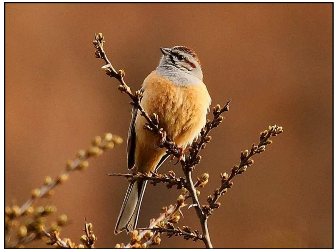
Godlewski's Bunting at Zixishan by Glen Valentine

Swifts on the extension. Also with them were Asian House Martin and House Swift. We continued up, scanning the road edges very carefully for our main quarry - the spectacular Lady Amherst's Pheasant. A stop for some passerines flitting about in the road yielded: a gorgeous, but shy, male Rufous-bellied Niltava; as well as Yellow-throated Bunting, and White-browed Fulvetta. A short stop and leg stretch at the top before our journey back down gave us a rather hyper-active pair of Streak-breasted Scimitar Babblers that finally showed very well in the dwindling evening light. Also on show here were a few White-collared Yuhina, another eye-catching species that proved to be rather common and showy later in the trip. Elliott's Laughingthrush, an abundant bird in Sichuan,