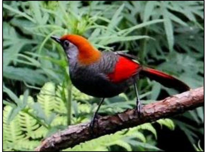
The usually shy and rarely seen Red-tailed Laughingthrush at Gaoligongshan