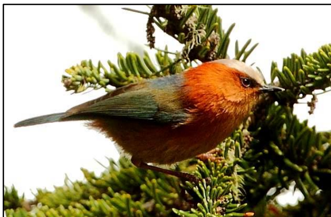
The brilliant Crested Tit-Warbler at Mengbishan