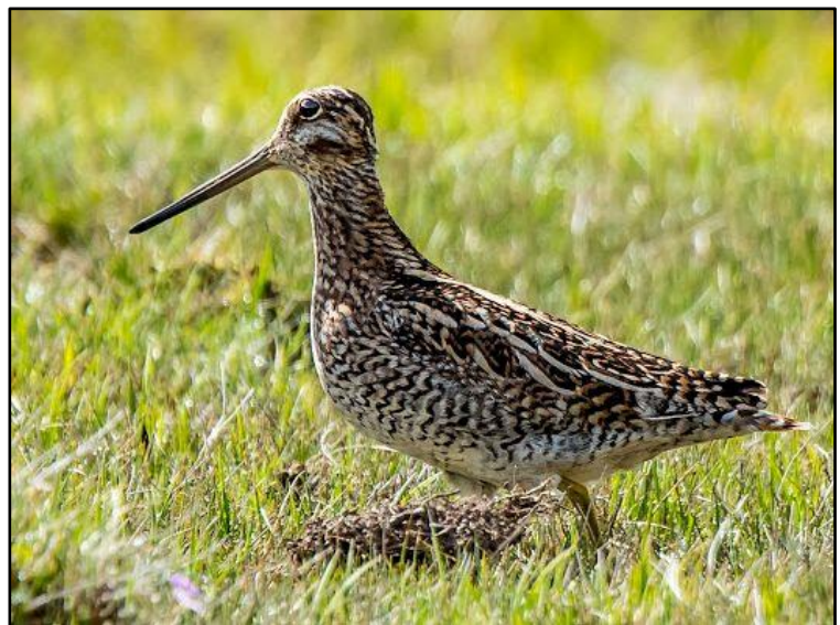
The elusive and rarely seen Solitary Snipe on the Tibetan Plateau by Dennis Braddy

After a very productive and enjoyable time on the Tibetan Plateau it was time to make tracks for the lower lying forests, streams and lakes of Jiuzhai Valley National Park - an incredibly scenic reserve situated just off the edge of the plateau in northern Sichuan and still within "Tibet". Our journey took us via the Baxi Valley, where we spent our final morning but did not pick up anything ultra-special that we had not already been seen on our prior visit there. We then crossed over the plateau and wound our way down the Gong Gang Ling Pass to the town of Jiuzhaigou where we spent the next three nights at our very pleasant and rather grand hotel. From this wonderful base we made day excursions into the national park, utilizing the park's very efficient but busy public transport system to get around between the various scenic and birding sites situated within the two valleys that make up the main parts of the reserve. We visited several areas in both the Arrow Bamboo and the Long Lake Valleys searching for the many specialties for which the reserve is famous. Birding at Jiuzhaigou is rather a case of quality over quantity and can be tough at times, especially with inclement weather, which we unfortunately experienced on both days. Although we did not see a huge number of species during our two days in the reserve we did find some real top quality ones and highlights in the higher-lying coniferous and bamboo dominated forest included: the scarce and