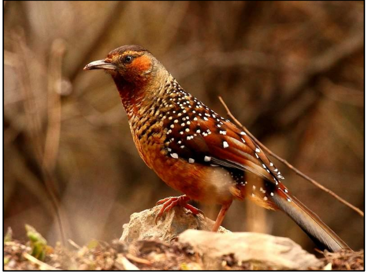
The impressive Giant Laughingthrush in the Wolong area by Glen Valentine

In the afternoon we journeyed back up Balangshan Pass in search of a few high altitude goodies that we were still missing and came up trumps with a group of Alpine Chough that was followed by a very showy Plain-backed Thrush (soon to be split as Sichuan Thrush) that fed in the open, in an area of snow-covered grass and rocky scree at the edge of an alpine stream. A pair of Red-fronted Rosefinch was later scoped higher up the pass along with Alpine Accentor and a herd of twenty-three Blue Sheep (Bharal). We also found another three Snow Partridge, as well as more mountain finches and choughs but unfortunately only heard Tibetan Snowcock - this species would just have to wait for tomorrow.