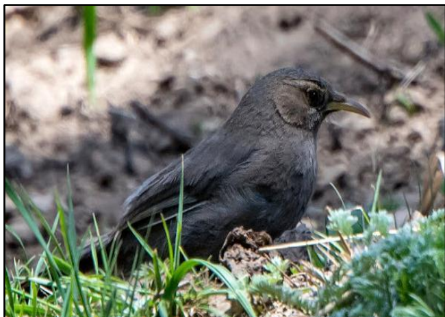
Plain (Pere David's) Laughingthrush in the Baxi Valley