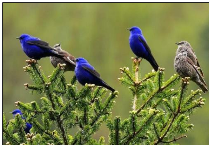
Flock of Grandala above Wolong by Glen Valentine