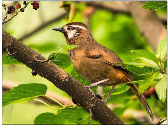
White-browed Laughingthrush in the Chengdu Botanical Gardens