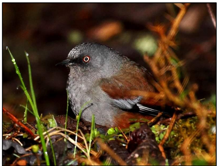
Maroon-backed Accentor at Gong Gang Ling by Glen Valentine: A fairly easy bird in Sichuan but very difficult throughout the rest of its limited range

Our first full day saw us birding the lower lying areas along the rivers that meander through this forested reserve, but the birding in general was fairly quiet despite the superb-looking habitat. However, we did still manage to find some good birds. Highlights were: a brief female Golden Pheasant for some of the group; an unexpected Striated Heron; a flock of around ten Speckled Wood Pigeon; a female Asian Koel; a spectacular adult Tawny Fish Owl on the day roost along with a very cute and fluffy juvenile bird perched nearby; three Crested Kingfishers; a pair of Grey-capped Pygmy Woodpecker; Mountain Bulbul; a very showy Rufous-faced Warbler; Several Kloss's Leaf Warblers; vociferous but rather elusive Alstrom's Warblers; a pair of Chinese Hwamei; a flock of White-throated Laughingthrush; Vinous-throated Parrotbill; Chestnut-flanked White-eye; Rufous-bellied Niltava; Blue Whistling Thrush; Brown Dipper, and Mrs. Gould's Sunbird. On the mammal front we also encountered a troop of large and rather intimidating Tibetan (Milne-Edward's) Macaque and more Reeve's