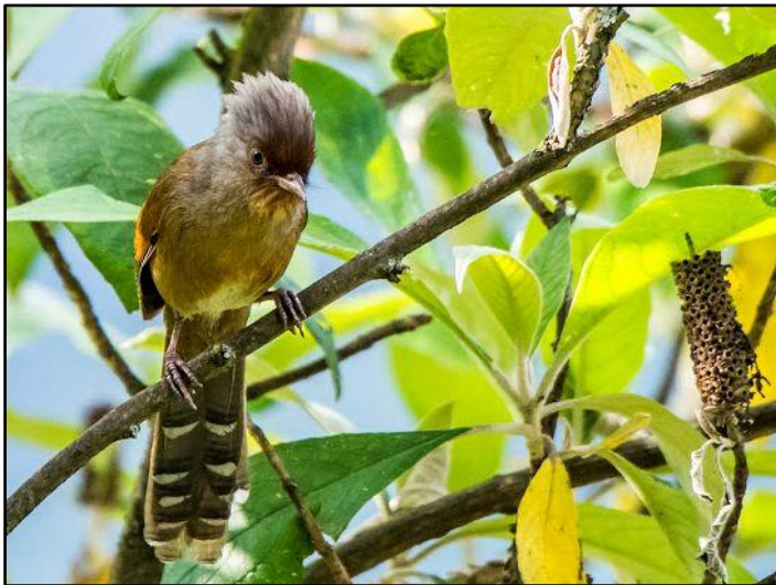
The handsome Rusty-fronted Barwing at Gaoligongshan

Our next full day at Gaoligong saw us heading up into the primary forest at dawn to maximize our chances of some rarer species in this beautiful habitat. The birding was, however, fairly quiet for the most part despite such stunning habitat, but we still managed to pick up a number of great birds. Several skulkers revealed their presence with their distinctive calls and included Grey-bellied Tesia and Pygmy Wren-Babbler, both of which ended up showing remarkably well. A few Yellow-throated Fulvetta also whizzed around us in the dense undergrowth and we also managed to track down: several Beautiful Sibia; a pair of brightly-coloured Chestnut-crowned Warblers; Bar-throated and Red-tailed Minla;