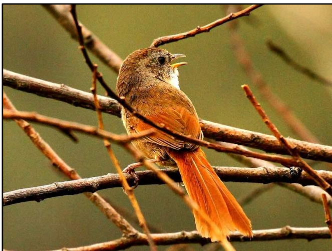
The scarce, unique & endemic Rufous-tailed Babbler (Moupinia)

Our next morning had us driving back up Cangshan for further views of Lady Amherst's Pheasant, and a slim chance of the elusive Mrs. Hume's variety. We scored again with another female Lady Amherst that was admired at length on the roadside, with many males heard calling from the surrounding forest undergrowth during the morning. After a picnic breakfast at the top, and some pleasant interruptions in the form of: a gorgeous male Collared Grosbeak; singing Aberrant and Russet Bush Warblers; more Black-headed Greenfinches, and several, rather flighty, Mrs. Gould's Sunbirds, we took a short walk along the track that skirts the upper slope of the mountain and found some more great birds. These included: a few singing Bianchi's Warblers; wonderful, close and prolonged views of the scarce and endemic Rufous-tailed Babbler; several Japanese White-eyes; Common Rosefinches, and a Rufous-breasted Accentor. Lower down the mountain we scored with: more Rusty-capped and Yunnan Fulvetas; as well as a singing male Slaty-backed Flycatcher, and a single Spectacled Fulvetta that showed well,