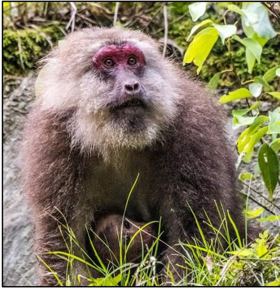
Tibetan (Milne-Edward's) Macaque at Tangjiahe

In the mid-morning we departed Gong Gang Ling and crossed another section of the vast Tibetan Plateau until we finally reached the Big Snowy Mountain Pass at just over 4000m (13000ft). The scenery here was like most of Sichuan, absolutely spectacular, and a short photographic opportunity and leg stretch gave us: more Bearded and Himalayan Vultures; Alpine and Red-billed Choughs, and Rosy Pipits. We continued down the pass and wound our way lower and lower through some beautiful, broad-leaved evergreen forest, past broken down trucks and through several streams that were flowing right over the road to our lunch stop at a quaint little homestead and family-run restaurant. Here we enjoyed a delicious lunch with locally made cherry wine and two great birds: a singing, male Black-faced Bunting and the rare Collared Crow that perched up for scope views - Fantastic! After lunch we continued the long drive to Tangjiahe with a few random comfort and ice-cream stops producing: a singing Rufous-faced Warbler; a pair of Swinhoe's