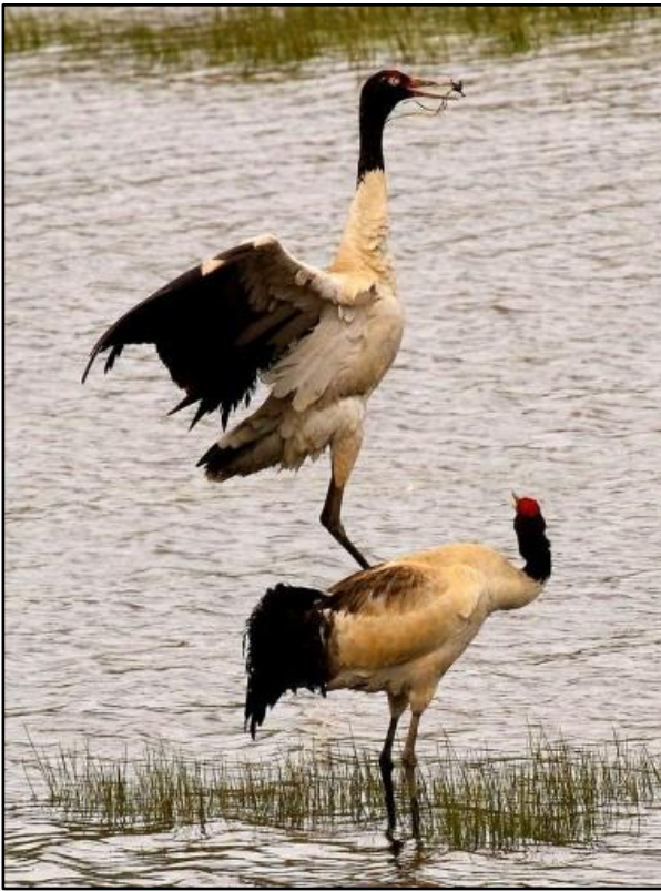
Dancing Black-necked Cranes on the Tibetan Plateau by Glen Valentine

China has firmly placed itself on the birding map as one of Asia's top destinations - and rightly so! Very few countries boast a bird list of over 1000 species and China is sitting on over 1300 and counting. Within this vast and bird-rich country, the provinces of Yunnan and Sichuan are unrivalled in terms of species numbers and the quality of birds that they harbour. We were fortunate to enjoy a month in these wonderful birding regions and the list of specialties and highly sought-after species seen during our time there was truly spectacular. Of the numerous birding highlights and 406 species recorded, the following were just some of the most memorable and desirable species seen: Tibetan and Snow Partridges; Tibetan Snowcock; Verreaux's Monal-Partridge; the spectacular Temminck's Tragopan; Chinese Monal; White Eared, Blue Eared, Blood, Golden and Lady Amherst's Pheasants; dancing Black-necked Cranes; the rarely seen Solitary Snipe; sky-pointing Eurasian Bittern; the magnificent Tawny Fish Owl; Darjeeling and Black Woodpeckers; Swinhoe's Minivet; Chinese Grey Shrike; White-browed and Pere David's Tits; Crested and White-browed Tit-Warblers; Black-streaked Scimitar Babbler; Rusty-capped, Yellow-throated, Spectacled, Chinese and Golden-breasted Fulvettas;