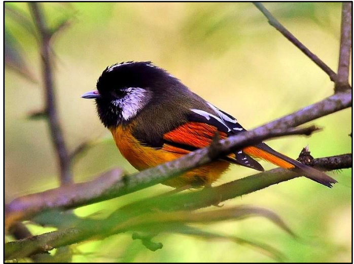
The exquisite & fast-moving Golden-breasted Fulvetta at Longcanggou

Our early mornings in the higher-lying forest, dominated by bamboo and conifers, turned up highlights such as: Great, Brown and Three-toed Parrotbills; several extremely vocal Himalayan Cuckoos; the fast-flying White-throated Needletail; Himalayan Swiftlet; Crimson-breasted and Darjeeling Woodpeckers; Long-tailed Minivet; Yellow-browed, Coal and Pere David's Tits; Brown-flanked, Yellow-bellied, Aberrant and Brown Bush Warblers; Buff-throated and Bianchi's Warblers; Elliott's and Red-winged Laughingthrushes; superb Golden-breasted and Grey-hooded Fulvettas; White-collared Yuhina; Eurasian Wren; a very brief and shy Emei Shan Liocichla; nesting Hodgson's Treecreeper; singing White-bellied Redstart and White-browed Bush Robin; the exquisite Mrs. Gould's Sunbird, and Vinaceous Rosefinch. The primary and secondary forest lower down the mountain gave us: a female Lady Amherst's Pheasant feeding in the road; as well as the impressive Red-billed Blue Magpie; Sichuan Bush Warbler; Alstrom's Warbler; Brown Bullfinch; Red-billed Starling; Yellow-throated Bunting, and more Ashy-throated Parrotbills.