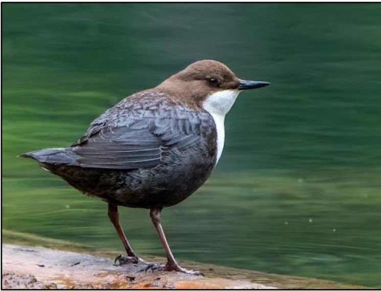
White-throated Dipper at Jiuzhai Valley National Park

recently described Sichuan Treecreeper; the localized Chinese Nuthatch; superb Pere David's Tit; Chinese Leaf Warbler; an unusually obtrusive Spotted Bush Warbler; the handsome White-throated Dipper; Grey-headed Bullfinch; Vinaceous Rosefinch; Tibetan Serin; some very tame Elliott's Laughingthrushes, and several beautiful singing Indian Blue Robins. In the lower lying forest and reedbeds, several small groups of: Spectacled Parrotbill; the endemic sinensis race of Eurasian Nuthatch; Sooty Bushtit; Yellow-bellied Tit; Collared and White-winged Grosbeaks, and Brown Dipper entertained us. We did also encounter a reasonable number of widespread, but no less attractive, and enjoyable species during our time in the park. Highlights included: Crimson-