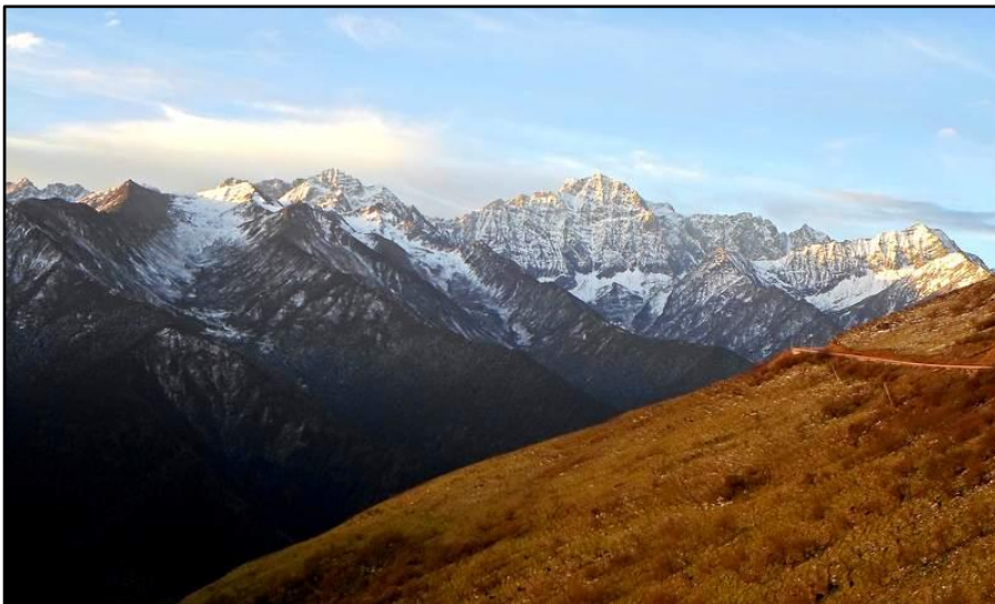
Balangshan Mountain Scenery by Glen Valentine

We had a spectacular full day's birding on Mengbishan the following day with the early morning starting