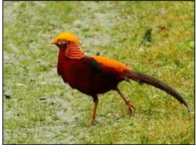
It’s very rare indeed to see the superb Golden Pheasant this well!

We finally reached the top in the mid-morning with a howling wind and persisting drizzle. We walked the two short trails at the top with the very slim hope of encountering the very rare and ridiculously localized Przevalski’s Parrotbill, but the less-than-ideal weather made our chances almost non-existent. After some nuts (actually edible nuts (Almonds and Peanuts) and not the leaders or the group...although that’s debatable) and Snickers bars we began the hike back down the mountain. A great treat was instore for us though, when we reached the bottom a small, mixed flock yielded a singing Emei Leaf Warbler that performed wonderfully for us and which had previously only been heard earlier in the trip at Longcangou. Cold and wet from the morning’s walk, we enjoyed a cup of hot coffee and tea and a bite to eat before making our way back to the warmth and comfort of our hotel. Those that opted for the late afternoon stroll around the lodge grounds enjoyed good views of Alstrom’s Warbler, a female Blanford’s Rosefinch and Yellow-bellied Tit.