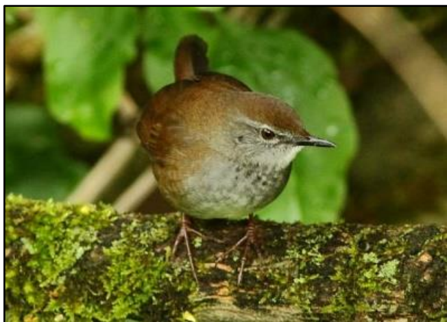
The shy and often difficult-to-see Spotted Bush Warbler at Jiuzhaigou by David Hoddinott