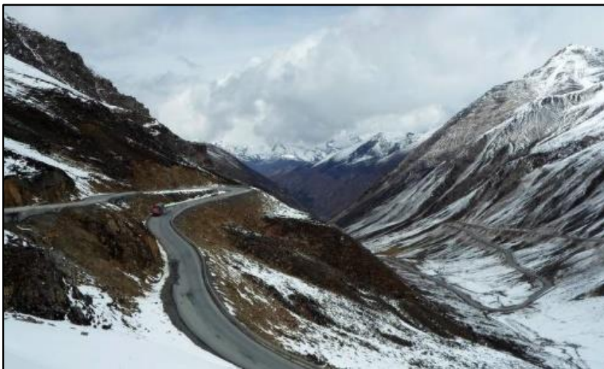
The habitat of Snow Partridge & Tibetan Snowcock: Balangshan Pass Scenery

surrounded by a massive flock of male and female Grandala! These brilliant birds had obviously been forced lower down due to the inclement weather and we were absolutely blown away by the sheer number of these beauties, as well as how tame they were. We spent a good deal of time savouring the views of these indescribably beautiful, and bright, blue birds and even after walking away from them we were followed down the road by a flock of around a dozen birds for the next hour - Absolutely amazing! Other great birds seen after the Grandala explosion