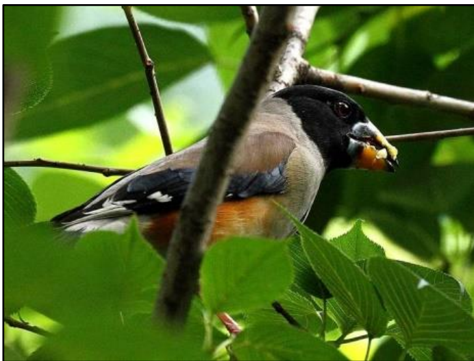
Chinese Grosbeak in the Chengdu Botanical Gardens

Our Sichuan birding tour began in earnest with a drive down south towards Mt. Emei and the forest reserve of Longcanggou - which lies on the other side of the same mountains as the famous birding site of Wawushan, which is, unfortunately, currently closed to tourists. We arrived at our rather quaint guest