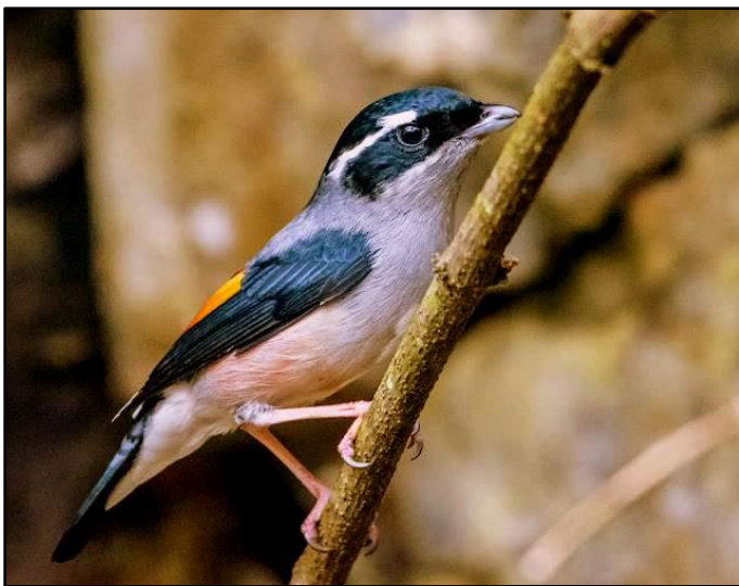
This particular Blyth's Shrike-Babbler was especially showy at Gaoligongshan

Our full day in the Lijiang area had us driving up early into the foothills of the Jade Dragon Snow Mountains in search of a few rare species, several of which we managed to find during our morning excursion. We'd hoped for more male Lady Amherst's Pheasants, but unfortunately didn't find any and after a picnic breakfast and a couple of transient Eyebrowed Thrushes we began birding along the road back towards town. A few small mixed flocks popped up here and there and these harboured: Black-browed and Black-throated Bushtits; a pair of Streak-breasted Scimitar Buntings; Japanese White-eye, and a singleton of the extremely localized and recently split Black-bibbed Tit, but unfortunately the rare, localized and declining White-speckled Laughingthrush evaded us. In some drier, secondary scrub lower down we enjoyed good views of a flock of Chinese Babax - that turned out to be a lovely bonus. Our afternoon