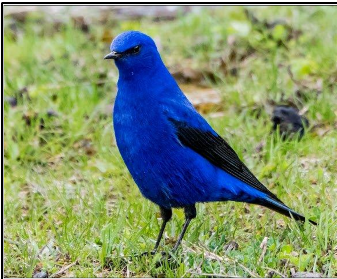
The spectacular male Grandala