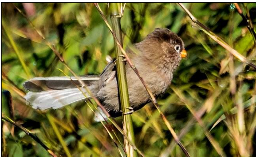
The rare and endemic Three-toed Parrotbill at Longcanggou

town was a lovely surprise and birding stops along the drive up the pass were extremely productive with every stop producing at least one top-quality new bird. The brilliant little White-browed Tit-Warbler hopped around in the dense, scrubby thickets along with: Pink-rumped, Himalayan Beautiful, Chinese White-browed and Streaked Rosefinches; Alpine Leaf Warbler and Sichuan Tit; Snow Pigeons fed in small groups in open, muddy areas with Brandt's and Plain Mountain Finches. Several stunning male White-tailed Rubythroat were admired as they