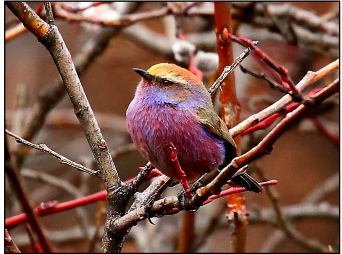
The immaculate White-browed Tit-Warbler on Balangshan Pass

On the mammal front we encountered several very endearing Himalayan Marmots scurrying over the grassy slopes. As we descended the pass on the Wolong side we encountered a very handsome Snow Partridge standing on a bank right at the edge of the road. We ground to a halt and jumped out, and quite amazingly the bird did not budge. Crippling views of this highly sought-after species ensued and eventually after several minutes of point-blank views it decided to make its way a little further up the grassy slope - Tremendous! A little further on we arrived at our road-side lunch stop where some of us were greeted by a male Temminck's Tragopan that jumped out from the forest onto the road and made a dash across and up the slope on the other side, showing its immensely bright colours for a few seconds to a lucky few. Himalayan Vultures soared overhead, while a short birding stop in a narrow valley a little lower down produced another huge surprise for this area in the form of a female Swinhoe's Minivet that was watched feeding low down amongst some small bushes and even on the ground, along with fair numbers of: Slaty-backed and Rufous-gorgeted Flycatchers; Blue-fronted Redstart; Himalayan Bluetail, and Chestnut Thrush.