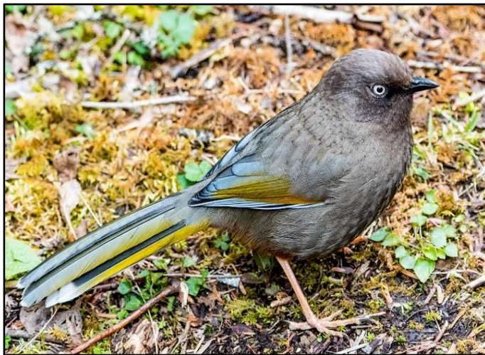
Elliott’s Laughingthrush at Jiuzhai Valley National Park

Alas it was our last morning of the trip and it was time to make our way back to the bustling city of Chengdu, where our wonderful journey would end. We did however have some time for a short bit of birding around the hotel grounds before departing and our exploration of a nearby stream gave us two excellent new birds in the form of Little and White-crowned Forktails. The drive back gave us little else other than: Black-throated Bushtit; Daurian Redstart; White-browed Laughingthrush; Red-billed Starling, and a few Collared Crows.