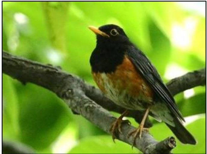
The rare and beautiful Black-breasted Thrush at Gaoligongshan by David Hoddinott

called a few times and showed ever so briefly for a lucky few. The light was now fading rather quickly and it was fast becoming the perfect time for pheasants, so we scrapped the general birding and concentrated on Lady Amherst. Before long a female Lady Amherst was seen bolting across the road in front of our bus - Exciting stuff! A little further on a pair of these unbelievable pheasants were spotted at the road edge, but they only showed for a few seconds before walking off into the dense montane forest undergrowth. Finally, to end off an amazing afternoon with these beauties, another male was sighted walking right down the middle of the road and then rounding a corner before disappearing - Wow, what a bird! To end off a superb day we ground to a halt due to a pair of Black-streaked Scimitar Babblers that crossed the road and then clambered up into the pine trees, calling incessantly as they moved - Awesome! We arrived at our very comfortable, and well-appointed, hotel in old Dali rather late, but with an amazing suite of great birds under the belt and after checking in, we made our way into town for a delicious and festive dinner.