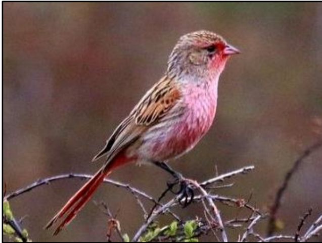
The monotypic and endemic Przevalski's Finch (Pinktail) on the Tibetan Plateau

Secondly we paid an afternoon visit to a well-appointed and wonderfully productive wetland reserve known as Flower Lake that lies just north of Ruoergai. The wetland and environs absolutely teemed with birds and we encountered a large number of expected species as well as a good suite of notable surprises! Greylag Geese; Red-crested Pochards; Common Terns, and Brown-headed Gulls were abundant and we also found smaller numbers of: Gadwall; Northern Shoveler; Ferruginous and Tufted Ducks; Eurasian Teal; Common Pochard; Pallas's Gull, and Whiskered Tern. Chinese Pond Herons sporting their immaculate full breeding plumage fed around the flooded, grassy edge along with the brilliant, black-backed race of Citrine Wagtail, two separate Brown-cheeked Rails (a major surprise!) and several transient waders, all showing off their superb breeding nuptials: Pacific Golden Plover; Common Redshank; Curlew Sandpiper, and Dunlin. Other highlights included: a very confiding Pale Martin that refused to budge from the path; two Whooper Swans in the distance, and several sky-pointing Eurasian Bitterns that were scoped at length - Fantastic! The surrounding grassland harboured White-rumped and Rufous-necked Snowfinches and displaying Tibetan Lark. We also encountered a female Hen Harrier quartering low over the marsh.