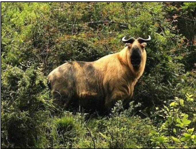
Tangjiahe National Nature Reserve remains the only place on Earth where one stands a good chance of seeing the rare Golden Takin in the wild

Our second full day in Tangjiahe began early in the drizzly weather. After breakfast we began the drive up to the area where we'd seen the female Golden Pheasant the day before. The overcast and rainy weather was actually on our side this time, as soon after starting up the track the shouts of Golden Pheasant bellowed from the bus! There at the edge of the road were two gorgeous, adult male Golden Pheasants in all their glory! We watched them for several minutes and were even able to exit the car and walk closer for amazing photographic opportunities and views. Continuing along the track we soon