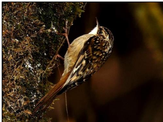
The recently described and endemic Sichuan Treecreeper at Jiuzhaigou