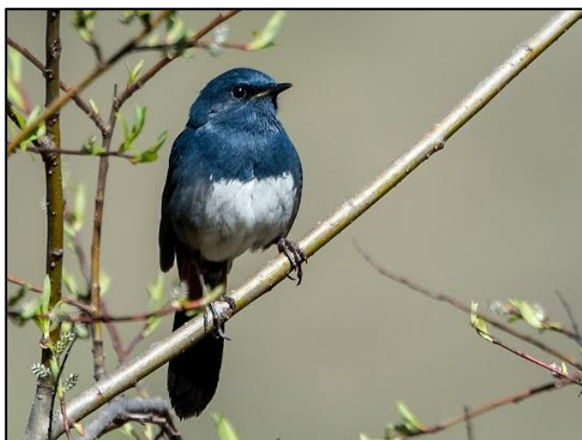
The often shy and secretive White-bellied Redstart showed amazingly well in the Baxi Valley