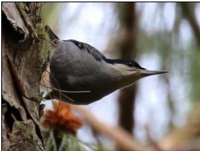
The range-restricted & generally rare Giant Nuthatch at Zixishan

After an excellent morning we departed Zixishan and made our way further west towards the interesting town of Dali - situated at the base of the impressive Cangshan Mountains. This was our destination for the late afternoon and as we began the drive up the mountain we came across our first of several Cook's