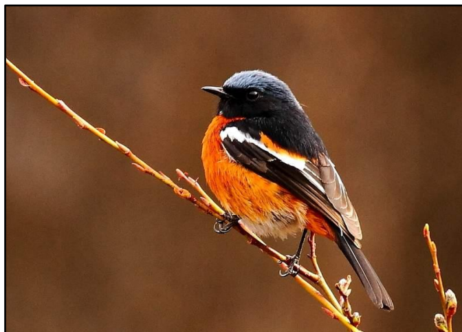
The attractive White-throated Redstart in the Baxi Valley