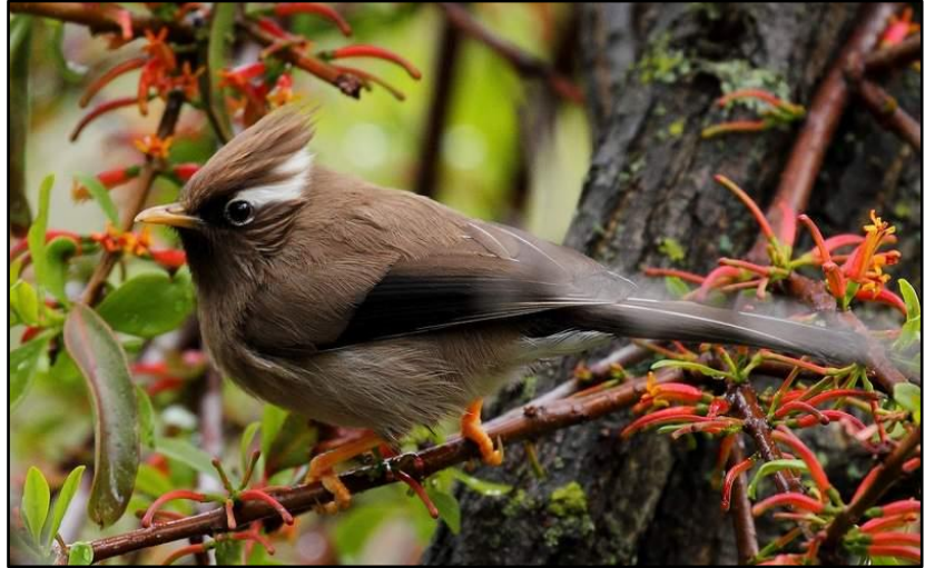
The striking White-collared Yuhina

Mammals seen in the Gaoligong area included Pallas's Squirrel and the very impressive Black Giant Squirrel. It was, however, time to move on to our next destination - the town of Lijiang - situated at the base of the Jade Dragon Snow Mountains in north-western Yunnan, and our final locality of the Yunnan Extension. The drive was a long one and took us most of the day, but we did make a few unexpected birding stops with one such stop in the early morning producing a fine selection of new birds that included: the striking black-and-chestnut Crested Bunting (the reason for stopping in the first place); a male Rosy Minivet; Grey-breasted Prinia, and White-throated Kingfisher. Several Richard's Pipits, an Indian Roller and small numbers of Crested Myna were also encountered along the drive before reaching Lijiang in the late afternoon. After quickly checking into our comfortable hotel, we paid a short visit to some scrubby habitat at the edge of a nearby wetland. This area was teeming with birds and we were delighted to find: a few Black-faced Buntings; an Eastern Yellow Wagtail; several immaculate breeding plumage Citrine Wagtails; a few Little Ringed Plovers; Common Snipe; Wood Sandpiper; Rosy Pipit, and a surprise group of four Grey-headed Lapwing.