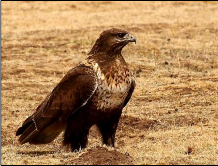
The eagle-like Upland Buzzard on the Tibetan Plateau by Glen Valentine

winged and Eurasian Magpies; Daurian Jackdaw; Northern Raven; Oriental Skylark; the strikingly plumaged Horned Lark; the miniscule Twite; our first of a total of twenty-seven stately Black-necked Cranes for the day (several of which were watched dancing and calling in the crisp morning air. This handsome species also turned out to be Tom's 6000 th bird – well done Tom!), and our only Tibetan Roe Deer of the trip. The many small waterbodies alongside the road yielded widespread waterfowl such as: Ruddy Shelduck; Ferruginous Duck, and Common Merganser, while the highlight of our road-side lunch stop was undoubtedly finding a rather showy and cooperative Tibetan Partridge.