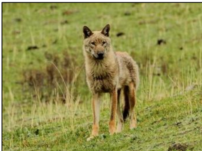
We were extremely fortunate to have had two separate sightings of Grey Wolf on the Tibetan Plateau.