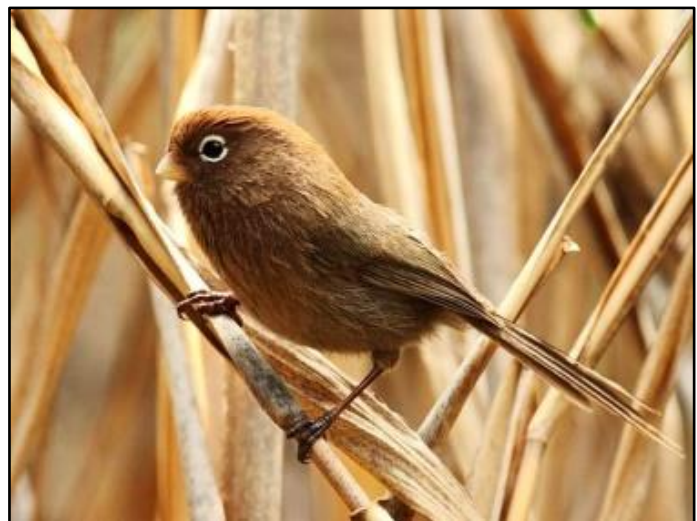
The endemic Spectacled Parrotbill at Jiuzhai Valley National Park

Despite some challenging birding, rainy weather and throngs of tourists, we still enjoyed our time in the Jiuzhai Valley, but the moss-draped mountain forests of Tangjiahe beckoned and so it was time to bid farewell to Jiuzhaigou and continue our journey further east towards our final destination of this mammoth birding adventure - Tangjiahe National Nature Reserve. Tangjiahe, like Jiuzhaigou, does not teem with birds, but the quality of species on offer and the staggeringly beautiful and awe-inspiring scenery makes the journey here well worthwhile. Our drive to Tangjiahe took us via the Gong Gang Ling Pass once again and a short, post-breakfast, birding stint down the pass produced some great birds like: Maroon-backed and Rufous-breasted Accentors; several pairs of Crested Tit-Warbler; male and female Three-banded Rosefinch; Hodgson's Treecreeper; Rufous-vented and Grey-crested Tits; Alpine and Sichuan Leaf Warblers; the entertaining Goldcrest; Kessler's and Chestnut Thrushes; a briefly perched Northern Goshawk, and a Blue Eared Pheasant that sat up right on top of the roadside barrier - Amazing!