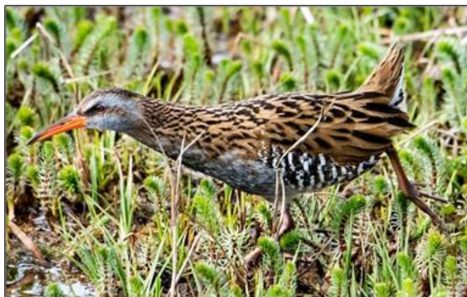
Brown-cheeked Rail at Flower Lake