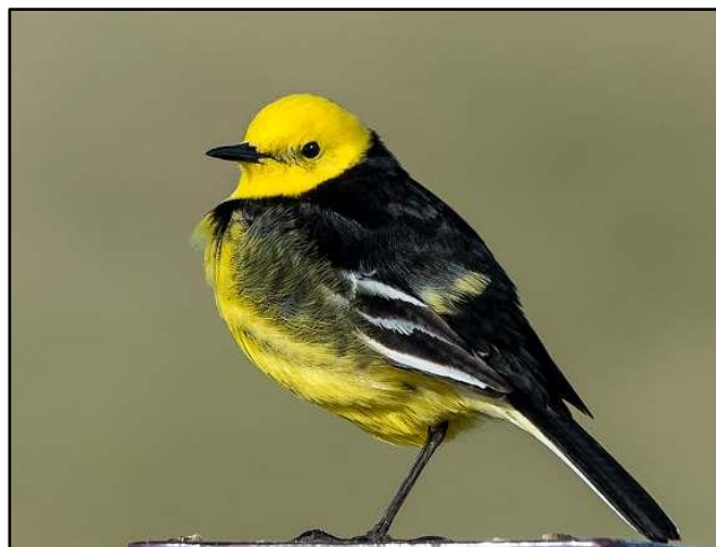
The exquisite, black-backed race of Citrine Wagtail may be split in future as “Tibetan Wagtail”. Taken at Flower Lake by Dennis Braddy