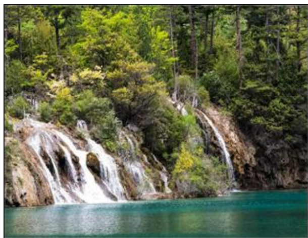
Breath-taking scenery at Jiuzhai Valley National Park