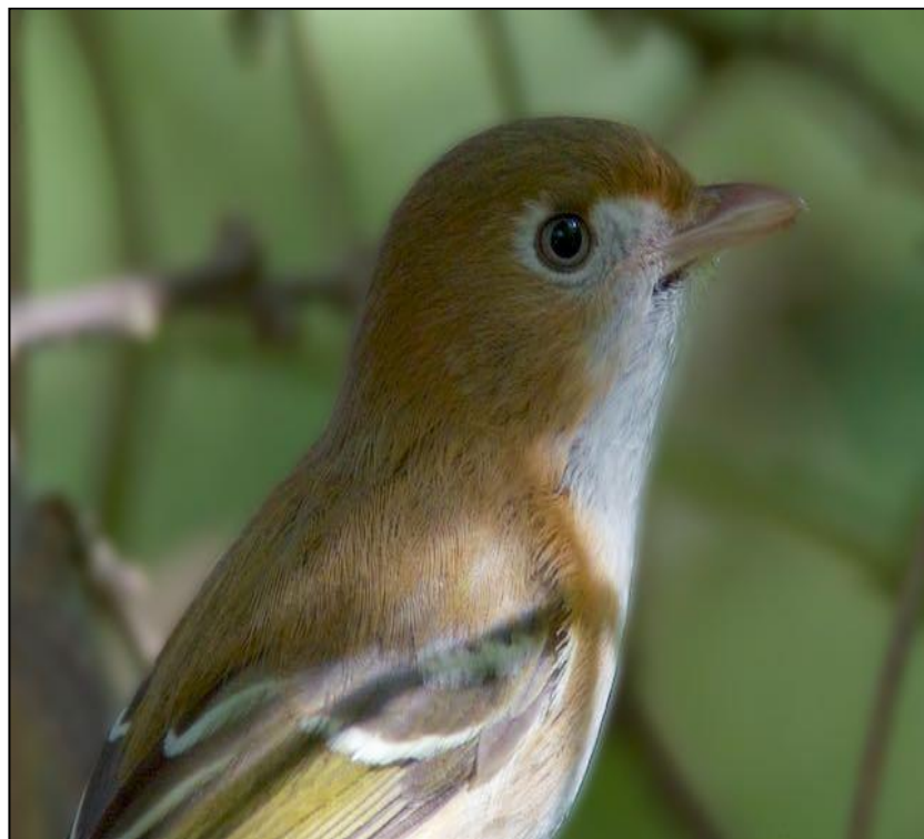
Cozumel Vireo by Clayton Burne

cowled Oriole, but could only manage to hear Yellow-tailed Oriole. All too soon, it was time to wrap up the morning, take breakfast and head north-east to Playa del Carmen. A short pit stop gave