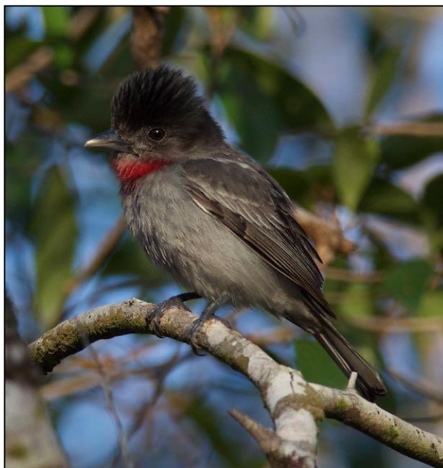
Rose-throated Becard by Clayton Burne

Back in the van, we headed towards the park entrance to walk one last trail. En route we were rudely interrupted by yet another Ocellated Turkey, preening in the middle of the road. We carefully exited the vehicle and took way too many photos before realising that the turkey had no intention of getting off the road. I gradually moved closer and closer, motioning for the turkey to move off. I was able to approach to within 5 feet without the turkey even looking at me, so we all got a little closer and took frame-filling photos of its beak before moving on, the turkey running after the vehicle for a short while. Having finally reached the trail, we rather wished we had stayed with the turkey. Birding activity was thoroughly dead, only a small flock of Red-throated Ant Tanager to show for our efforts. With the afternoon shadows getting longer, we left the park behind and went back to our Ecolodge for the night.