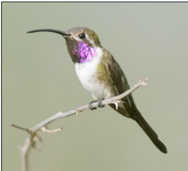
Mexican Sheartail by Rich Lindie

We took lunch at a beach restaurant, white sea sand beneath our feet; more Black Skimmer, an American Herring Gull and a solitary Willet making their way onto the list. A very enjoyable seafood lunch over, we departed for Uxmal some 2 hours away. A short rest was followed by some late afternoon birding, though several large rain clouds bought a temporary halt to proceedings before we had really started. After the rain had disappeared, we found a wet and rather unhappy looking Bat Falcon perched half way up a telephone mast. A pile of frugivores were feeding on a Gumbo Limbo tree; Blue-diademed Motmot, Velasquez's Woodpecker, Rufous-browed Peppershrike and some noisy White-fronted Amazons. Ferruginous Pygmy Owl called distantly, but eventually came in for a short look. Rose-breasted Becard caused a momentary flutter of excitement before the rain came down again. The on-off nature of the rain meant we spent as much time birding as we did with our umbrellas. Spot-breasted Wren vocalised nearby, the pair showing very well. The day ended with one wet and drab Orange Oriole, which was swiftly replaced by a gleaming bespoke version. Night birding turned up very little as we returned to our Hacienda for dinner and a rest.