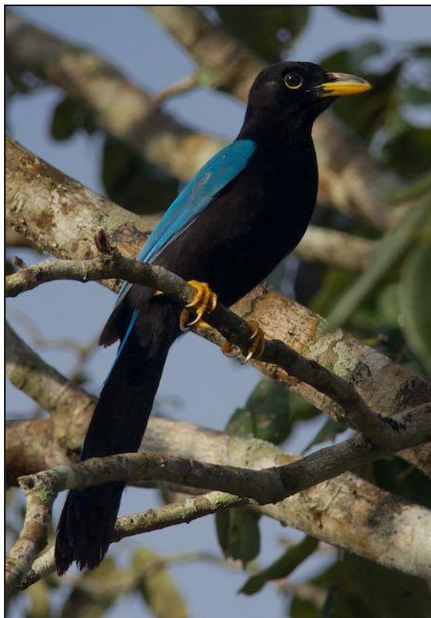
Yucatan Jay by Clayton Burne

behaved well before we found a host of new and colourful species including Lesser Goldfinch, Yellow-throated Euphonia, and Rose-breasted and Blue Grosbeaks. The rather aggressive Green-breasted Mango chased another hummingbird into view, which turned out to be Cinnamon Hummingbird. As the day drew to a close, a flock of the large and raucous Brown Jays was found, and a male Hooded Warbler snuck onto the list just before darkness set in.