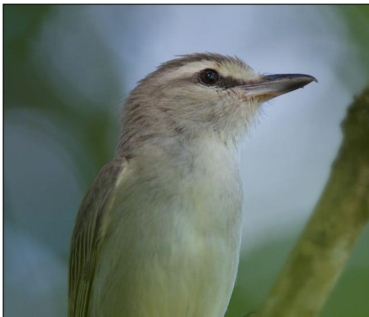
Yucatan Vireo by Clayton Burne

Our last morning was spent a little south of our hotel walking an open road through thick forest. Activity was pretty good, with additional good views of Yucatan and Cozumel Vireos, a host of wood warblers and small flocks of Black Catbird! Despite hearing numerous Caribbean Doves, not a single bird budged nor walked across the road. The endemic sub-species of House Wren was equally secretive, calling on a few occasions but refusing to come into view. We did find the local subspecies of Blue-grey Gnatcatcher though before it was time to head back to our hotel for breakfast and departures. A comfortable ferry ride and an hour-long drive to Cancun International Airport bought the tour to a conclusion.