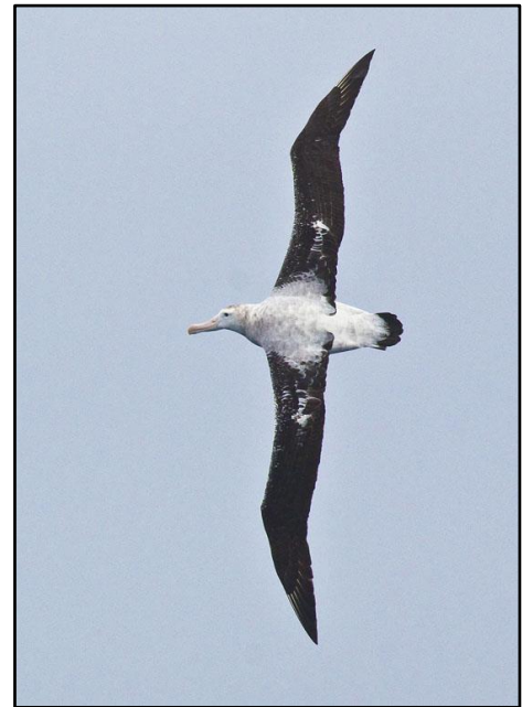
Wandering Albatross by Dušan Brinkhuizen

As we were approaching colder waters, the beautiful Black-bellied Storm Petrels were being seen more frequently. Memorable was the sighting of our first Wandering Albatross, a spectacular juvenile, following the ship at close range for a few minutes. A few more Wanderers were seen but also plenty of Southern Royal and Grey-headed Albatrosses. The real jackpot was a White-headed Petrel that followed the ship for a few minutes on our first day at sea. Luckily, many people were able to connect with this rare and distinct petrel! Kerguelen Petrel was also seen on a number of occasions but, unfortunately, always very briefly. Closer to South Georgia, we also started to see the Light-mantled Albatross, a handsome and truly elegant species of albatross! Antarctic Fur Seals were also becoming more frequent closer to South Georgia. A few Humpback Whales were seen on the way as well. At Shag Rocks, we watched our first flock of South Georgia Shags; while some people spotted the very first King Penguin. Very unusual was the fact that we had not seen a single Soft-plumaged Petrel during the two days of navigation.