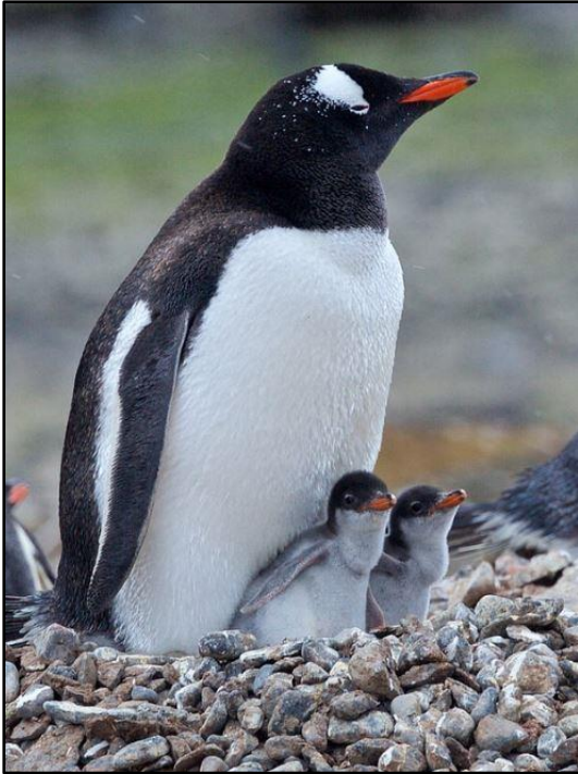
Gentoo Penguin with chicks

main attraction here and we really enjoyed watching them at close range. It was funny to watch the individuals with small stones in their beaks build their nest. Another highlight was the colony of Antarctic Shags located on the nearby slope. What a handsome shag that is! Plenty of Snowy Sheathbills were scavenging around the colony and Brown Skua was present in small numbers as well. Our landing at