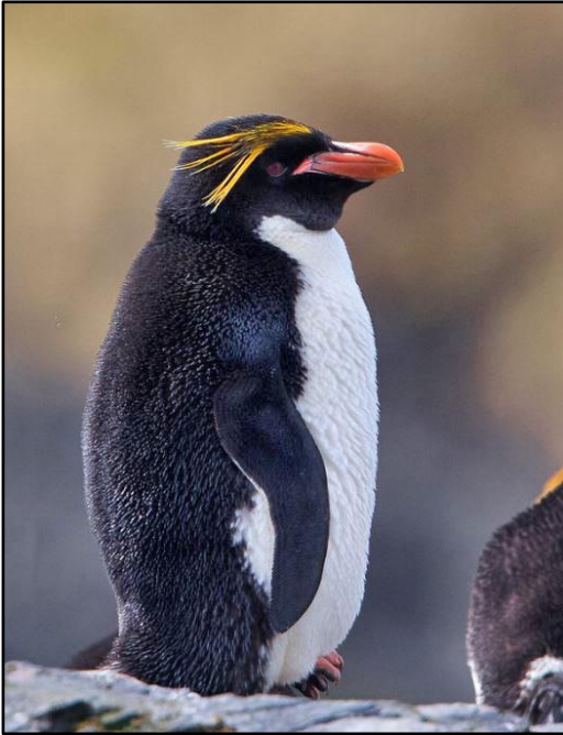
Macaroni Penguin

at all. A recently fledged chick of Antarctic Tern being fed by its parent was surely a superb photo opportunity for the photographers amongst us. The lovely South Georgia Museum was another highlight for the day.