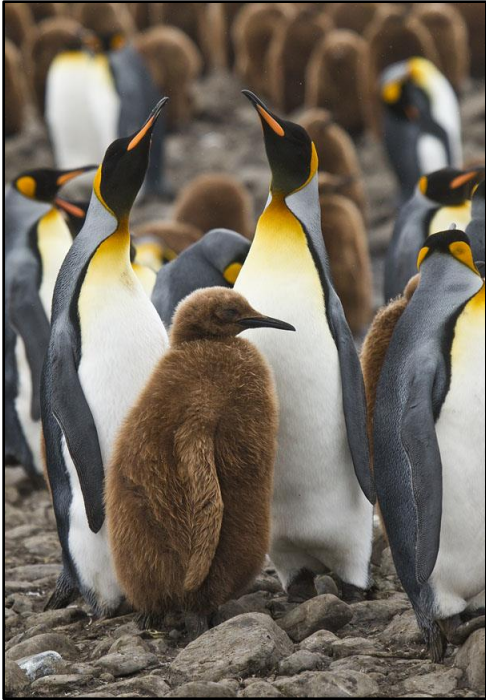
King Penguin

Day 7, 26 Nov: South Georgia; Salisbury Plain and Fortuna Bay. Our first landing in South Georgia was at Salisbury Plain. This site is well-known for its spectacular King Penguin rookery, one of the largest in the world! Landing seemed a little difficult because of all the untamed wildlife occupying the beach, but we did manage to find a spot in between the hundreds of penguins and seals. We were carefully