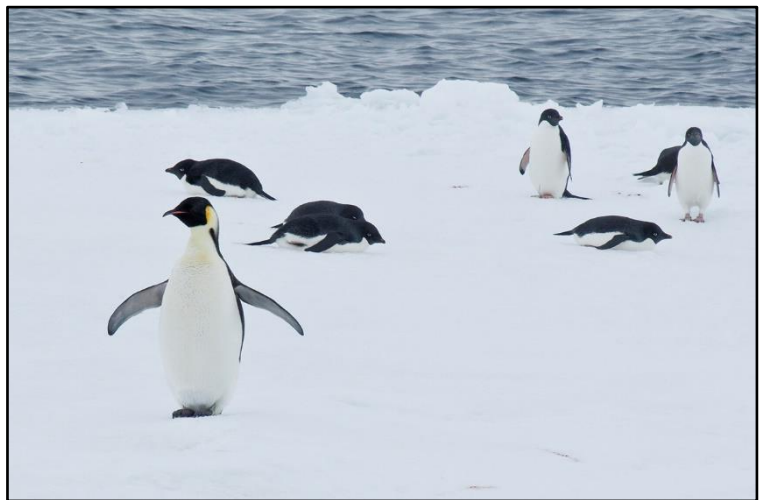
Emperor Penguin with Adelie Penguin by Dušan Brinkhuizen

We were now in the Antarctic Sound, surrounded by spectacular icebergs of different sizes and formations. Adelie Penguins were all over the place but, of course, no more emperors that day. Our first landing was on Paulet Island. The massive colony of Adelie Penguins was the