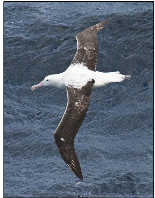
Southern Royal Albatross by Dušan Brinkhuizen

Day 2, 21 Nov: At sea south-west of Falkland Islands (South Atlantic Ocean). Our first day at sea was exciting. The ocean was choppy and the weather wasn't really nice either, but there were many seabirds out there! Large numbers of Black-browed Albatrosses, White-chinned Petrels and Sooty Shearwaters kept us busy continuously. Out of the crowds, we regularly picked out a "big boy", the spectacular Southern Royal Albatross, of which we saw at least twenty. Slender-billed Prions started to appear in small numbers during the course of the day, and we also got our first Cape Petrels and Great Shearwaters. Our first Northern Giant Petrel was a moulting individual. A superb Snowy Sheathbill that landed on deck was quite a surprise to us, and a typical sighting that would repeat itself during our voyage. Really exceptional was a single flyby Least Seedsnipe that got photographed, a vagrant to the Falkland Islands. Our first Fin and Sei Whales were other highlights for the day.