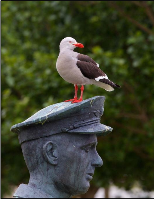
Dolphin Gull

Rockjumper's Classic Antarctica I adventure started in the scenic harbour of Ushuaia, the southernmost town of Argentina. In the afternoon, we boarded the impressive Akademik Ioffe, a Russian research vessel that became our home for the next 19 days. The lifelong dream to visit the continent of Antarctica, the world's largest unspoilt wilderness area, was soon to become reality!