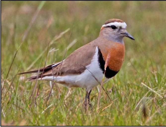
Rufous-chested Dotterel

Thrush and the beautiful Long-tailed Meadowlark. On our way back to Stanley, all the birders got off the bus north of town. Our major target bird in the fields here was the Rufous-chested Dotterel. Within a few minutes, we located a couple of these stunners, a real feast! Other birds that we saw here included