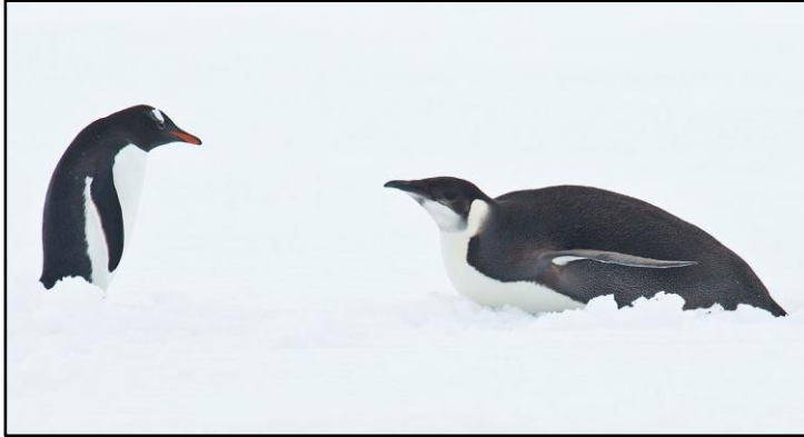
Emperor and Gentoo Penguin by Dušan Brinkhuizen

frequently yawned, showing its sharp teeth. Several Crabeater Seals were seen at close range too. We continued back towards the ship where we ran into a spectacular flock of Antarctic Cormorants in the water. At some point, we got out of the zodiacs to dance on the pack ice. It was great fun, but the dancing quickly stopped as we got a report of a possible Emperor Penguin nearby! Within minutes, we were at the site; a lone Emperor Penguin was standing on the pack ice less than hundred feet away from us! This time it was a second-year juvenile bird, lacking the yellow in the neck. A Gentoo Penguin jumped out of