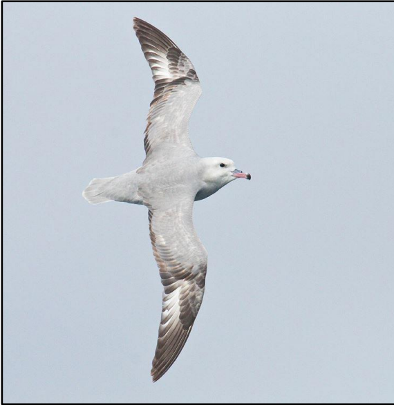
Southern Fulmar by Dušan Brinkhuizen

dozens of diving petrels passing by, with many individuals showing characteristics strongly pointing towards South Georgia Diving Petrel.