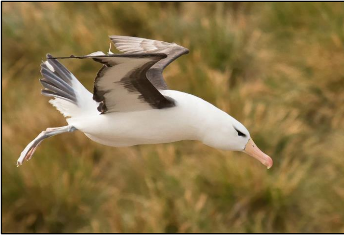
Black-browed Albatross

Day 3, 22 Nov: Falkland Islands; West Point and Carcass Island. In the early morning, we woke up in the Falklands! Common Diving Petrels, Black-browed Albatrosses and Great Shearwaters, among others, were watched from the deck before breakfast. Our first landing was at the scenic West Point Island. Blackish Cinclodes were waiting for us at the dock, as well as a nesting pair of Blackish Oystercatcher and a pair of Falkland Steamer Ducks. Austral Thrush, Dark-faced Ground Tyrant, Black-chinned Siskin and Long-tailed Meadowlark were watched in the nearby bushes. Flocks of geese were carefully scanned and soon we located a pair of Kelp Goose and a family group of the rare Ruddy-headed Goose. A few confiding Striated Caracaras were seen during a beautiful hike to the Black-browed Albatross breeding site, which was our main objective for the morning. Once we got to the colony, we had over two hours to soak up the beauty of all the spectacular wildlife on site. Thousands of Black-browed Albatrosses nesting on a magnificent cliff, pairs in display, a continuous flow of individuals landing and taking off, all at touching distance – a truly incredible sight!