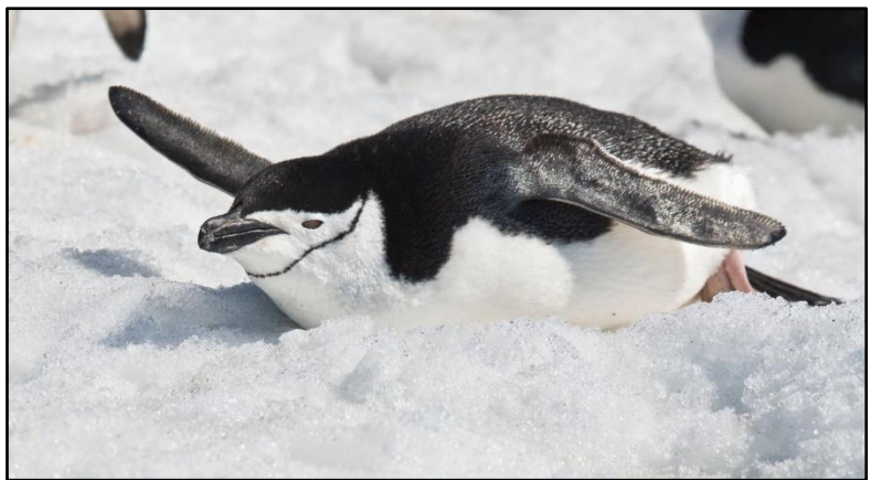
Chinstrap Penguin by Dušan Brinkhuizen

Day 15, 4 Dec: Antarctic Peninsula; Wilhelmina Bay and Port Lockroy. In the morning, we had a zodiac cruise at Wilhelmina Bay. First, we approached a couple of foraging Humpback Whales and we watched them at a reasonably close distance. Later on, a suspicious seal resting on an ice floe was spotted in the distance and as we got closer, we could indeed confirm it was a huge Leopard Seal! We watched this impressive animal at a close distance for quite some time. It