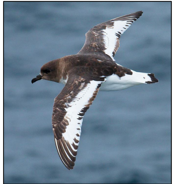
Antarctic Petrel by Dušan Brinkhuizen