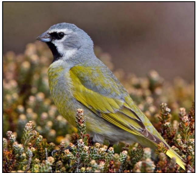
White-bridled Finch by Lee Hunter

Day 4, 23 Nov: Falkland Islands; Gypsy Cove and Stanley. After breakfast, we landed at Stanley and took a bus ride to Gypsy Cove. A scheduled stop at a shipwreck along the way produced excellent scope views of the handsome Two-banded Plover. Here we also got our only White-rumped Sandpipers for the trip. At Gypsy Cove itself, we very much enjoyed watching Rock Shags nesting on the rocky cliffs, together with a few pairs of Black-crowned Night-heron. Brown-hooded Gulls were an addition to the list and some got to see Commerson's Dolphins swimming by. Passerines that we picked up along the trail included Grass Wren, Correndera Pipit, Austral