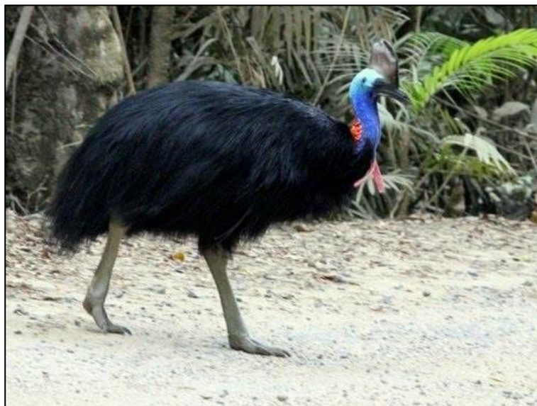
Southern Cassowary

Our final morning in Perth was spent at Herdsman Lake, where we had an excellent time finding Blue-billed, strange Pink-eared and a rare Freckled Duck, Yellow-billed Spoonbill and Swamp Harrier. We then headed to the airport and caught our flight to Cairns, arriving late and heading straight to our hotel.