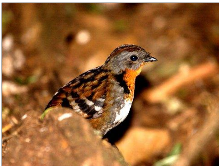
Australian Logrunner by Jonathan Rossouw

Peterson Creek was our first stop the next day where we embarked on a search for the unique Duck-billed Platypus. With persistence, we eventually located two pairs on a quiet backwater channel, allowing us extended views of this shy aquatic species as they quietly fed along the surface of the water, showing off their duck-like bill, sleek waterproof fur, and padded flattened tail. A fantastic experience and certainly a highlight for most! Later, we had lunch at Nevada Tea Plantation, where we again found three Lumholtz's Tree Kangaroos.