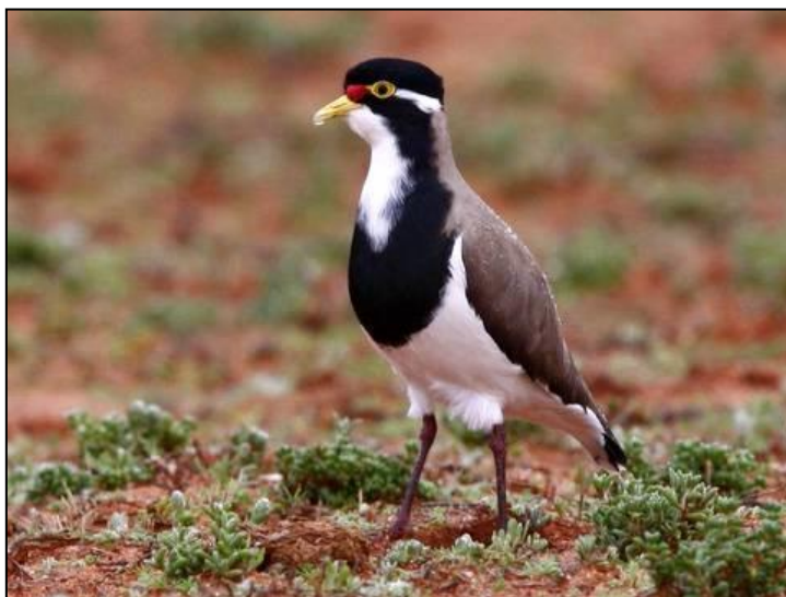
Banded Lapwing

An incredible sighting of seventeen Satin Bowerbirds gleaning insects off the surface of the pool greeted us the following morning! Later, we visited Lithgow Sewage Ponds, where we found Hoary-headed Grebes and a female Blue-billed Duck. At Lake Wallace we watched the bizarre Musk Duck, and a shy pair of Blue-billed Duck; while Australian Reed Warblers and Little Grassbird played hide-and-seek in the reedbeds. We continued our drive to Temora, first stopping for a flock of Cockatiels alongside the road. Lunch at the Japanese Gardens in Cowra allowed us great looks at a pair of confiding Superb Parrots. Speckled Warbler, a lone Little Eagle as well as Crested Shrike-Tit were found in the late afternoon at Bumbaldry State Forest.