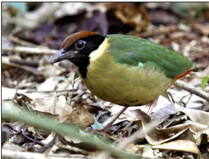
Noisy Pitta