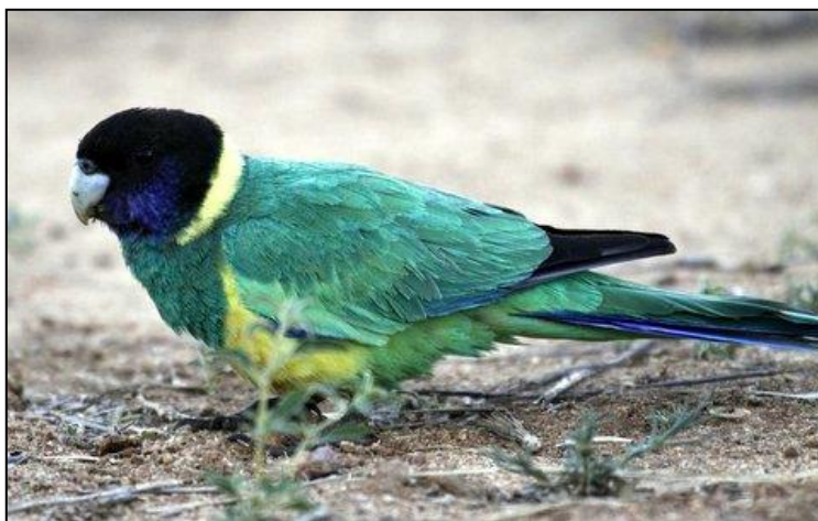
Australian Ringneck

A late afternoon walk in woodland at Dwellingup produced a smart flock of Varied Sitellas, the striking Western Thornbill, Western Whistler, White-browed Babbler and great looks at a pair of Red-eared Firetail building a nest.