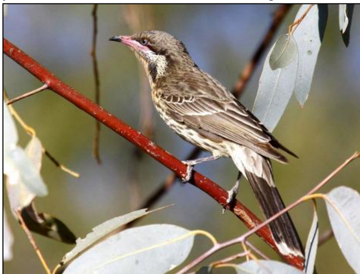
Spiny-cheeked Honeyeater