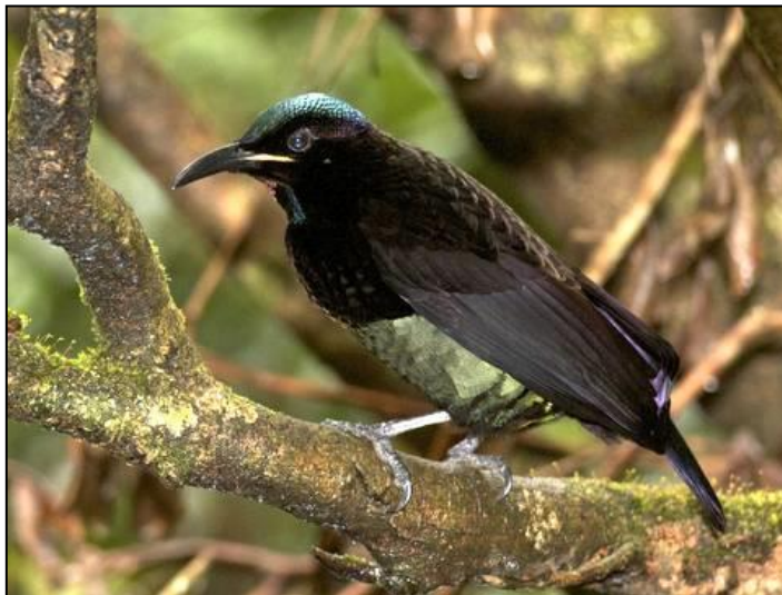
Victoria's Riflebird

In the late afternoon, we birded along the Cairns' esplanade, where the incoming tide allowed us to scan the mudflats, which produced a host of eastern migrant waders, including Black-tailed Godwit, Great Knot, Grey-tailed Tattler, Red-necked Stint, Terek and Sharp-tailed Sandpipers, Whimbrel, Greater and Lesser Sand Plovers and Far Eastern Curlew.