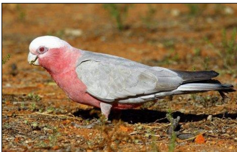
Galah by Jonathan Rossouw

From here, we continued on our drive to Dryandra State Forest, where a flock of Carnaby's Black Cockatoos alongside the road offered good close looks. Shortly after arriving at Dryandra State Forest, a looming cold front caught up with us