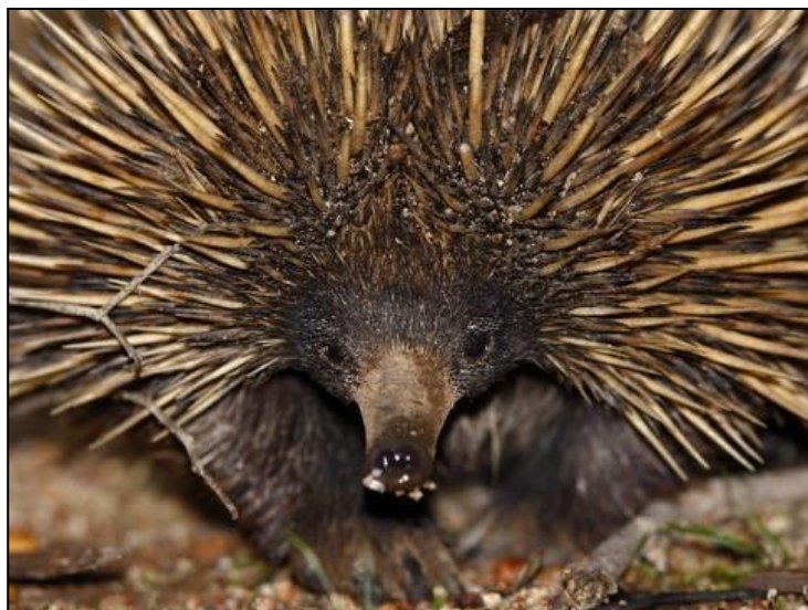
Short-beaked Echidna

Our main reason for travelling to this remote region, however, was a chance to venture out at night in search of the little-known Plains-wanderer, belonging to a monotypic family of unknown affinities and thought by ornithologists to be most closely related to the seedsnipes of South America.