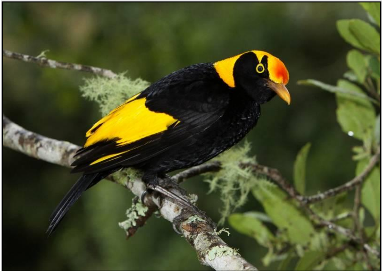
Regent Bowerbird