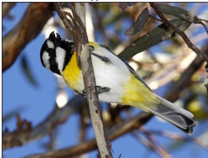
Crested (Western) Shriketit by Jonathan Rossouw

The following morning, we birded around our hotel at Narrogin, finding Australian Ringneck parrots, many New Holland Honeyeaters and more Red Wattlebirds. From there, we continued to the Stirling Range, noting a few new species en route, including Wedge-tailed Eagle, more beautiful pink Galahs, White-faced Heron, and fabulous close looks at Regent Parrots perching above us.