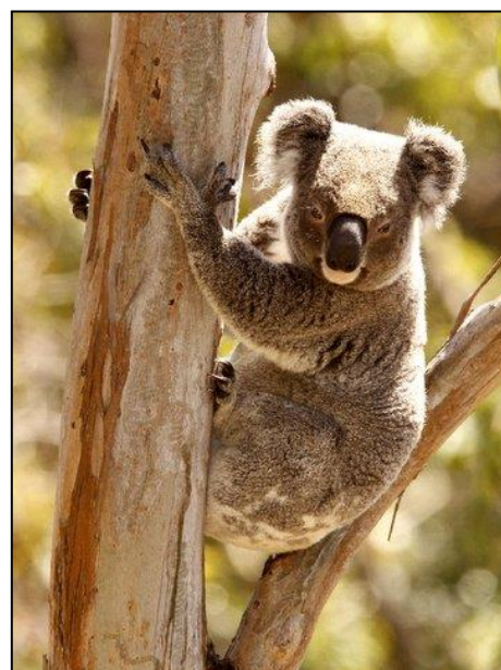
Koala by Jonathan Rossouw

At the small country town of Beckam the following morning we embarked on a fair search before Lawrence spotted the highly desirable Major Mitchell's Cockatoo, much to everyone's delight. We eventually saw four birds in this area. In the late afternoon, we arrived at the town of Hay and after a short break, we headed off to Deniliquin to meet our guide, Phil Maher, for the evening's tour. After passing endless farmlands and increasingly arid landscape where several Emu were seen, we met up with our guide and proceeded to the birding areas. En route we had great looks at White-winged Fairywren, Brown Songlark and Horsfield's Bush Lark. Best of all was a lone Black Falcon seen sitting on a fence pole.