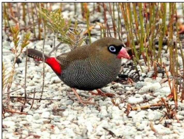
Beautiful Firetail