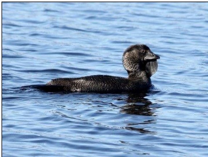
Musk Duck

returned to our cabins to collect our gear but within a minute, we were informed that a lyrebird had been found and a few minutes later, everybody was watching a male foraging near a trail in the forest. Wow! After this success, we birded further through the forest, finding Noisy Pitta and Superb Fairywrens.