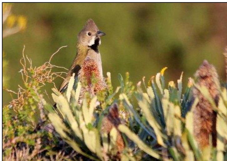
Western Whipbird by Andrew Sutherland

Later in the afternoon, we arrived at our destination, Cheyne Beach, Albany. A stop at a salt lake produced close looks at a flock of the nomadic Banded Stilts and distant scope looks at endangered Hooded Plovers. In the late afternoon we arrived at Cheyne Beach, where on our first attempt, we saw one of our main target birds, the Noisy Scrubbird, zooming across an open clearing. A good start.