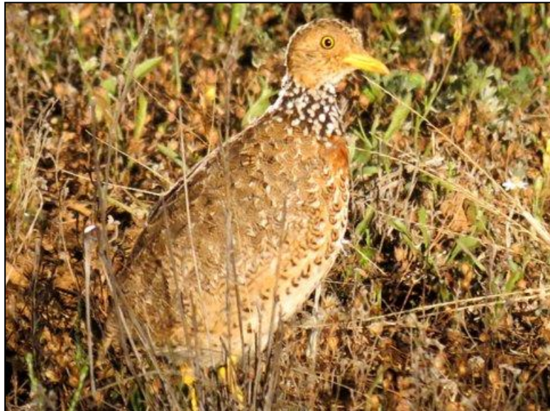
Plains-wanderer by Erik Forsyth

the whole group to see, a rare and endangered species. We were so lucky!