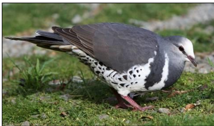
Wonga Pigeon by Jonathan Rossouw

Early the following morning, we travelled to the Cattana Wetlands, stopping briefly for several stunning Crimson Finches and Chestnut-breasted Mannikins. The wetlands proffered smart Comb-crested Jacanas, Green Pygmy Geese and a hide and seek White-browed Crake. After this, we drove to the Atherton Tablelands, a farming area with scattered forest patches, which held a number of localised endemics. Our drive into the tablelands yielded a large mixed flock of stately Brolga and Sarus Cranes,