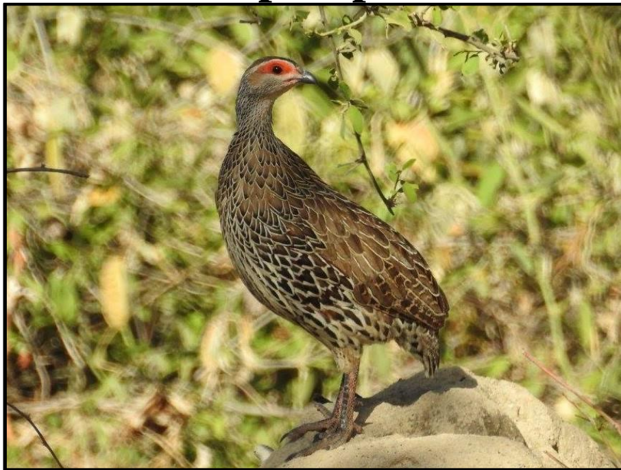
Clapperton's Francolin