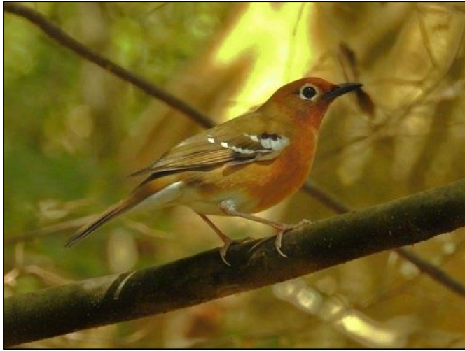
Abyssinian Ground Thrush by Jason Grubba

headed Batis, Brown-throated Wattle-eye, White-winged Black Tit, Buff-bellied Warbler, Rufous Chatterer, Lesser Whitethroat and Wattled and Violet-backed Starlings. Pink-backed Pelican, Senegal Thick-knee, Striped Kingfisher, Red-billed Oxpecker, Northern Carmine Bee-eater and African Goshawk were seen closer to the lake. And later, venturing into the forest itself, we found Crested Francolin, a somewhat out-of-place Woolly-necked Stork, marvellous Little Sparrowhawk, 10 Lemon Doves, Tambourine Dove, 15 beautiful White-cheeked Turacos, Bare-faced Go-away-