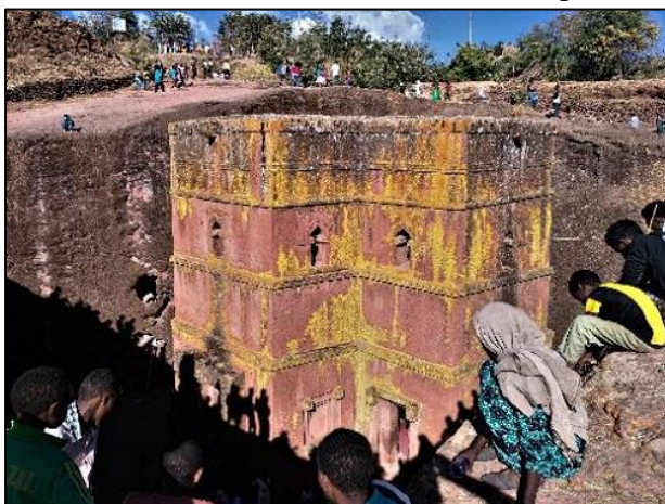
Biet Giyorgis

The following day, we ventured up to Asheton Maryam, on top of a 3,000m high mountain bordering the town. Each church, no matter how small, has a priest in attendance. This one showed us some centuries-old vellum manuscripts and paintings. It was incredible to see how vibrant the colours were after so long without any atmospheric protection. The birding below the mountain cliff wasn't bad either, with Abyssinian Catbird, Cinnamon Bracken Warbler, Singing Cisticola, Peregrine Falcon, Erckel's Francolin, Rüppell's Black Chat, Moorland Chat, White-winged Cliff Chat, Ethiopian Siskin and Rüppell's Robin-Chat. We lunched at Ben Abeba restaurant, an alien-like structure perched on a hillside overlooking a valley. It's the perfect spot for raptors to catch thermals, and we enjoyed multiple looks at Bearded Vulture and Steppe Eagle effortlessly cruising past. In the afternoon, we visited the Southern Cluster and then went to