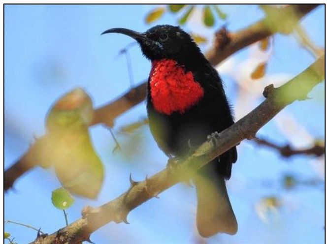
Hunter's Sunbird

That night we learned that there was a tribal disruption along our route, so the next morning we woke very early to take a detour to Yabello. It ended up being a very long drive, with the road deteriorating substantially in the last third of our trek. However, it wasn't all bad – we passed through cooler highlands and thinly populated low-lying woodland areas. A little stop alongside a small reed-covered wetland yielded Blue-headed Coucal, Little Rush Warbler, Common Waxbill and Bronze and Black-and-white Mannikins. We'd seen the latter very poorly in Hareenna Forest so it was nice to improve on our views. Other birds along the way included White-headed Vulture, Brown Snake Eagle, Long-crested and Wahlberg's Eagles, Shikra, Emerald-spotted Wood Dove, Pearl-spotted Owlet, Purple and Lilac-breasted Rollers, Wire-tailed Swallow,