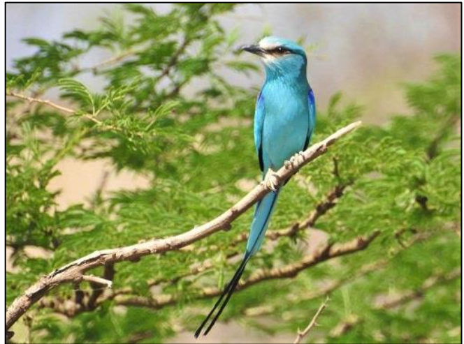
Abyssinian Roller

Our first birding stop the following day was at a large lava field crater just south of Metehara. Within seconds of pulling over, we'd found the highly range-restricted Sombre Rock Chat. The bird was on the hillside above us so we could easily see its barred vent – about the only feature of note on this appropriately named bird! Also in the area was Blackstart, Blue-breasted Bee-eater, Bristle-crowned Starling, Long-billed Pipit and the sooty-coloured Ethiopian subspecies of Rock Hyrax. At another spot, we had the eye-poppingly gorgeous Abyssinian Roller, African Grey Hornbill, comical Yellow-breasted Barbets, Nile Valley Sunbird, Yellow-spotted Petronia and Green-winged Pytilia.