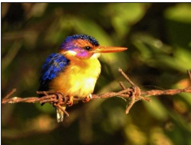
African Pygmy Kingfisher

Next up was Lake Ziway. The marshy lakeshore here held Glossy Ibis, Common Moorhen, Pied Avocet, Common Ringed, Little Ringed and Kittlitz's Plovers, African Jacana, Temminck's and Little Stints, Collared Pratincole, Black-headed Gull, the dazzling Woodland and Malachite Kingfishers, Black-billed Barbet, Northern Puffback, Masked Shrike, Rüppell's Starling, African Thrush, and Western Yellow Wagtail. We watched a Black Heron employing its famed umbrella-hunting method and got up close and personal with Great White Pelicans and Marabou Storks that were waiting for scraps from local fishermen. By the time we turned off onto the dry, dusty road