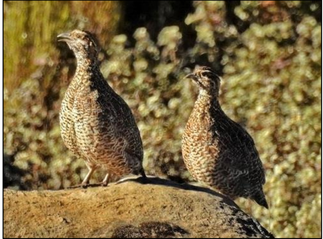
Moorland Francolins by Jason Grubba

Catbird. Just below the edge of the plateau, and after much searching, we located 10 elusive Moorland Francolins in addition to the much more common Chestnut-naped Francolin. Rouget's Rails were everywhere, and a sharp-eyed guest spotted a Cape Eagle Owl sitting entirely in the open, affording us even better views than we'd had the day before. Upon the 4,000m+ plateau, the vegetation changed to low, dense Afro-alpine heath and sculptural Giant Lobelias. Occasional ponds held Ruddy Shelduck, Blue-winged Goose, Yellow-billed Duck, African Snipe and Green Sandpiper. Steppe Eagles were relatively common, and we saw both pale and dark morphs of Augur Buzzard, Lanner Falcon, Moorland Chat, Thekla Lark and Ethiopian Siskin. Blick's Grass Rats and Gray-tailed Narrow-headed Rats emitted high-pitched squeaks and darted back into their holes as soon as we looked at them. We saw one apiece of two of Sanetti's most famous residents – the Ethiopian Wolf and its main prey item, the Giant Mole Rat. The former's population has been hit hard in the last year by canine distemper, hence our single sighting. Not a great situation for an animal already considered the rarest canid in the world!