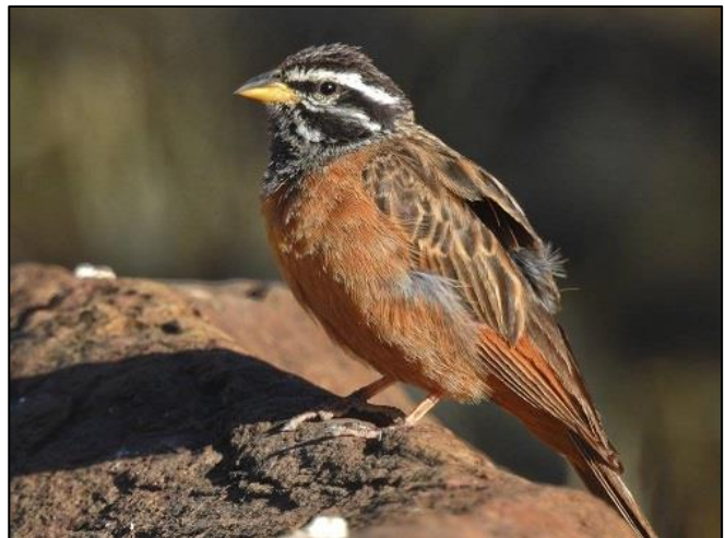
Cinnamon-breasted Bunting

with an irrigation point was a cool, shady oasis for a number of seed-eating species, including African Citril, Yellow-rumped Seedeater and Yellow-fronted Canary. Once we'd gained great looks at the latter, we turned around and headed back to Addis. Ethiopia threw up one last surprise just as we were out of the valley – a troop of over 50 Geladas along the edge of some huge cliffs. They were evidently a little wary of people, so we couldn't approach too closely, but we still had reasonable views. Thrilled, we returned to the capital where we tucked into a delicious buffet, watched limbo-loosening dancing and celebrated a tiring but rewarding tour.