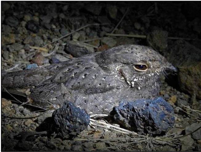
Star-spotted Nightjar by Jason Grubba

woodland and riparian zone. These excursions yielded sightings of Common Quail, a stunning Secretarybird, Pallid and Montagu's Harriers, Striated Heron, Common Buttonquail, Senegal Thick-knee, Crowned Lapwing, Eastern Plantain-eater, African Palm Swift, Blue-naped Mousebird, Abyssinian Ground Hornbill, Eastern Yellow-billed Hornbill, Black-billed Barbet, Pygmy Falcon,