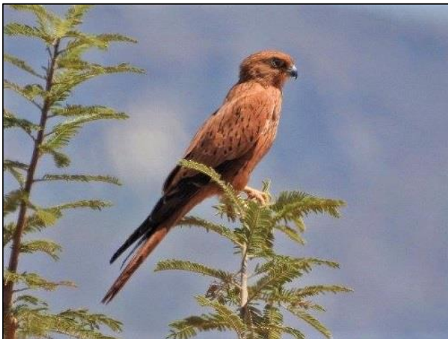
Fox Kestrel

The next day, we endured our final early morning, setting out in the dark to ensure we were in position at Jemma Valley around sunrise – when the area's two special gamebirds are at their most vocal and conspicuous. We located Erckel's Francolin first and later, with the help of local spotters, we saw the smaller and shyer Harwood's Francolin. With these two under our collective belt, we could pay more attention to the other species surrounding us: Eurasian Crag and Rock Martins, Singing Cisticola, the near-endemic White-billed Starling, White-winged Cliff Chat, Familiar Chat, Red-collared Widowbird, Ortolan and Cinnamon-breasted Buntings, Common Rock Thrush and