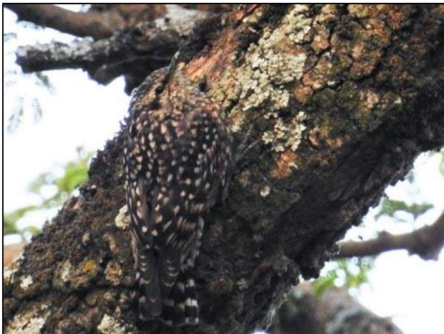
African Spotted Creeper by Jason Grubba

made opportunistic birding stops en route, and only added Grey-headed Kingfisher and European Bee-eater.