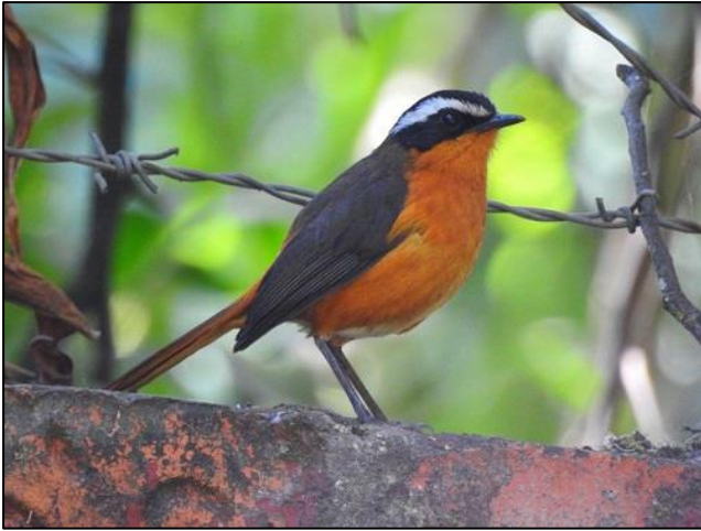
Rüppell's Robin-Chat

The Horn of Africa is one of the prime birding destinations on the continent. Ethiopia is the most accessible country in the region, with a large number of endemics and near-endemics birds, and a few endemic mammals. On this tour, we explored the country from the depths of the Rift Valley to the highs of the Sanetti Plateau, finding over 500 bird species and 38 mammals.