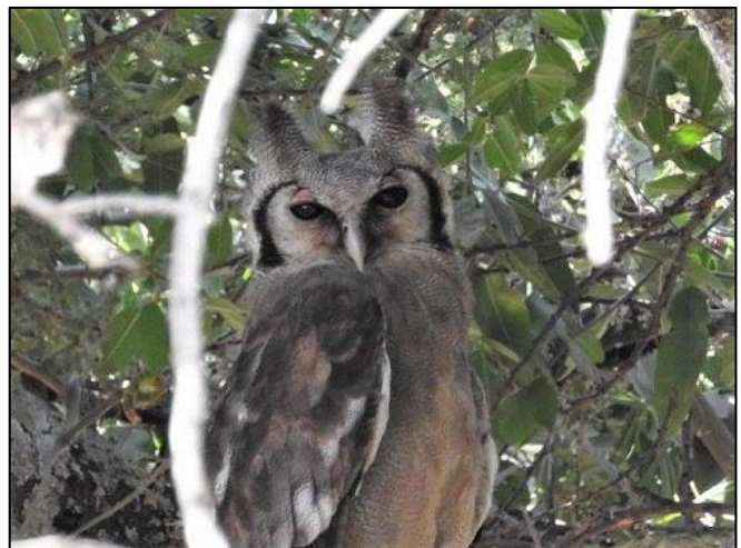
Verreaux's Eagle-Owl

We spent the night alongside Lake Ziway, which we birded the following morning. We found a similar suite of birds to our previous time here, including Fulvous and White-faced Whistling Ducks, Hottentot Teal, Knob-billed Duck, African Spoonbill, Black Heron, Pink-backed Pelican, Western Marsh Harrier, African Fish Eagle, Black Crake, Little Ringed Plover, Common Snipe, African Jacana, White-winged Tern, around 1,000 Collared Pratincoles, Ethiopian Cisticola, Northern Red Bishop and a Pied Wheatear of the uncommon vittata race. At Lake Koka, we saw four pairs of Black Crowned Cranes and many Goliath Herons dotted about the water hyacinth. We tucked into a large traditional meal in Mojo, then continued to Nazret/Adama, where we had a restful afternoon after a number of early mornings and long drives. The festival of