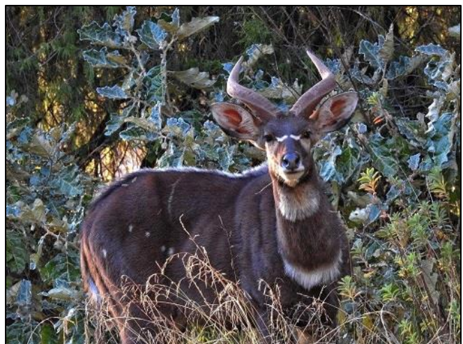
Mountain Nyala by Jason Grubba

Anticipation filled the cold air the following morning as we bundled onto the bus to drive up to the Sanetti Plateau. Halfway up, a patch of Juniper forest gave us another sensational Abyssinian Ground Thrush and more frustratingly concealed looks at Abyssinian