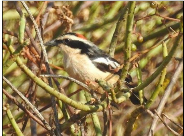
Red-naped Bushshrike

The following morning, we headed south out of Yabello, eager to find the two very special species confined entirely to this area. After a few kilometres, we pulled over to have a look at a Lanner Falcon. While watching the raptor, four Black-faced Sandgrouse flew over and landed on a bare scrape of ground only metres from us! We lapped up these sensational views, then noticed Blue-naped Mousebird, Chestnut Sparrow and White-bellied Canary, plus Stresemann's Bushcrow and exquisite White-tailed Swallow – the two sought-after endemics. Not far down the road, we found D'Arnaud's Barbet, Bearded and Cardinal Woodpeckers, Red-bellied Parrot, Foxy Lark, Northern Red-billed and Von der Decken's Hornbills, Tiny Cisticola, Scaly Chatterer, Pale Flycatcher, Black-capped and Grey-capped Social Weavers, Red-cheeked Cordon-bleu, Northern Grosbeak-Canary, Pygmy Batis, Rosy-patched Bushshrike, Pringle's Puffback, Slate-coloured Boubou, Red-naped Bushshrike and Brubru. This was shaping up to be a wonderful day of birding!