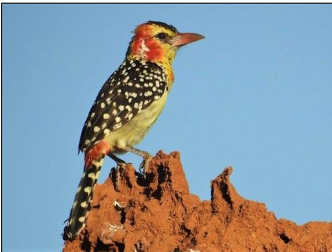
Red-and-yellow Barbet

After 35km, we dropped down into Hareenna Forest, where we spent the night at a luxurious lodge. Species here included Mountain Buzzard, African Emerald Cuckoo, a sharp-looking male Abyssinian Woodpecker, Dark-capped Bulbul, Eurasian Blackcap, Tree Pipit, Singing Cisticola, Scaly Francolin, Black Sparrowhawk, Cinnamon Bracken Warbler, Slender-billed Starling and Yellow-fronted Tinkerbird. Once out of Hareenna Forest, the vegetation immediately became drier and dominated by acacia woodland, which brought with it a host of new birds that included Red-and-yellow Barbet, Bateleur and Eastern Chanting Goshawk. Our field lunch stop at a seemingly insignificant roadside spot yielded White-bellied Go-away-bird, Little Bee-eater, Abyssinian Scimitarbill, Northern Red-billed and Von der Decken's Hornbill, Cardinal Woodpecker, Grey-headed Batis, White-crested Helmetshrike, Grey-headed and Orange-breasted Bushshrikes, Slate-coloured Boubou, Brubru, Northern White-crowned Shrike, Acacia Tit, Northern Brownbul, Northern Crombec, Yellow-breasted Apalis, Grey Wren-Warbler, Shelley's and four exquisite