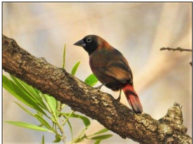
Black-faced Firefinch by Jason Grubba

Another day in Ethiopia, another early start! We made the hour-long commute to Ghibe Gorge before dawn, but were rewarded with some top-quality birding for the rest of the morning. Highlights included Yellow-billed and Abdim's Storks, Ayres's Hawk-Eagle, Shikra, African Wattled Lapwing, Vinaceous and Blue-spotted Wood Doves, Blue-headed Coucal, Common and Little Swifts, Grey-headed, Striped, Giant and Pied Kingfishers, a female Four-banded Sandgrouse, Black Scimitarbill, Grey-backed Camaroptera, Cardinal Woodpecker, Western Black-headed Batis, Grey-headed Bushshrike, Grey-backed Fiscal, Grey-rumped, Wire-tailed and Lesser Striped Swallows, Moustached Grass Warbler, Foxy Cisticola, Abyssinian White-eye, the uncommon Lesser Blue-eared Starling, Violet-backed Starling, Northern Black Flycatcher, two uncooperative Snowy-crowned Robin-Chats, Little Rock Thrush, Mocking Cliff Chat, Village Weaver, Bush Petronia, a dozen of the normally scarce Black-faced Firefinch and Yellow-rumped and Yellow-fronted Seedeaters. A little diversion along the river to look at a flock of 60+ Abyssinian Waxbills