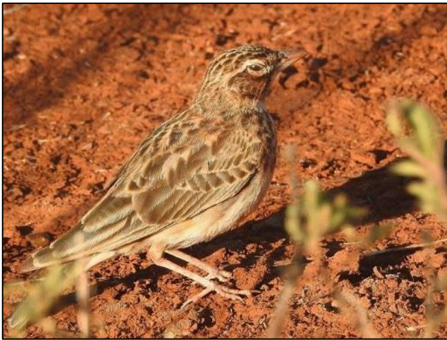
Somali Short-toed Lark

Despite being close to town, we set out for Liben Plains early the next day due to the condition of the roads. We arrived just after sunrise and immediately spread out to walk the plains in search of the critically endangered Archer's Lark. This endemic lark's already tiny patch of habitat has been hugely diminished in just two years and is under even more grazing pressure than ever before. Sadly, the future does not look hopeful for this species. We managed to find one bird, of which we