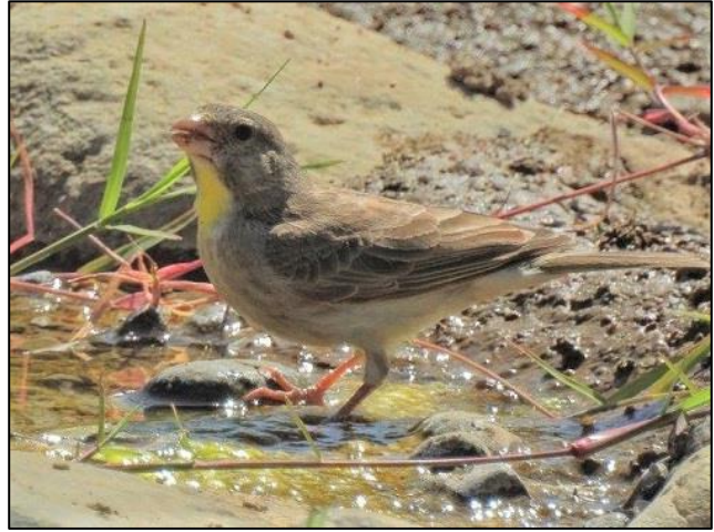
Yellow-throated Seedeater by Jason Grubba

On the penultimate day of the main tour, we visited the epic escarpment at Gemasa Geden. Disappointingly, we saw not a single Gelada here. But our spirits were lifted ( and this guide was relieved! ) when we finally found the area's most famous little resident – well, famous in birding circles. We enjoyed saturation views of Ankober Serin feeding alongside the road, with other treats including Yellow Bishop, Blue Rock Thrush, Bearded Vulture, Groundscraper Thrush, Zitting Cisticola and Common Duiker,