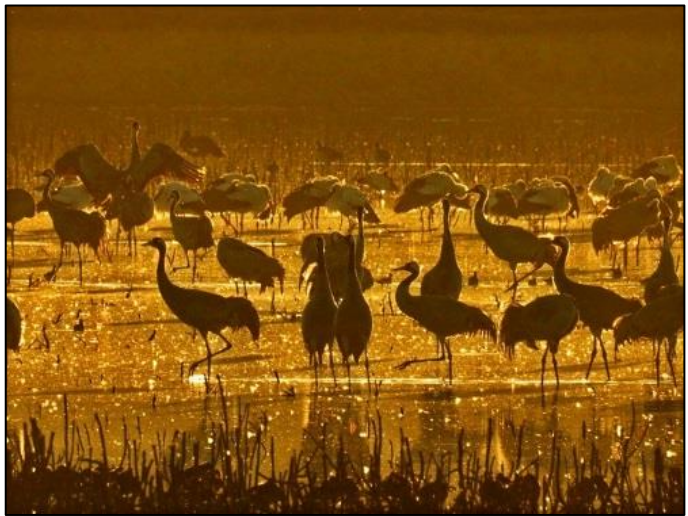
Common Cranes by Jason Grubba

The following morning, we slurped down some coffee before setting out pre-dawn for our traverse down the Rift Valley. Our first stop was the shallow Lake Chelekcheka. It was even shallower this year, reduced to a tiny portion of its full spread due to irrigation activities. Despite this, the birdlife was still varied and abundant. The reason for our early arrival was to witness the spectacle of hundreds of Common Cranes leaving the wetland to forage in the surrounding croplands. We were awed as cacophonous groups of these huge birds filtered off in different directions throughout the morning. On and around the lake, waterbirds were plentiful: White-faced Whistling Duck, Spur-winged Goose, Northern Shoveler, Red-billed Teal, Northern Pintail, Garganey, Hottentot Teal, Southern Pochard, 8 Lesser Flamingos that flew in, African Spoonbill, Red-knobbed Coot, Gull-billed Tern, Spur-winged Lapwing, Kentish Plover, Black-tailed Godwit, Marsh Sandpiper, Common Greenshank and Ruff. On the far side,