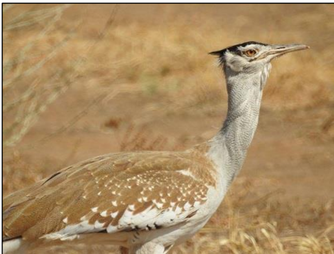
Arabian Bustard by Jason Grubba

At the ever-growing Lake Beseka, we took the old road, which just barely rises above the water level so we could search for Saddle-billed Stork, Western Reef Heron, African Darter, Egyptian Vulture, Gull-billed Tern and our first Nile Crocodiles. We were delayed somewhat at our lunch stop, where Kismet celebrations were still continuing, but we eventually made it to Bilen Hot Springs mid-afternoon. Here we found Purple Heron, both a dark and a pale morph Booted Eagle, Dark Chanting Goshawk, European Turtle Dove, Grey-headed Batis, Red-tailed, Woodchat and Steppe Grey Shrikes, Somali Bulbul, Red-fronted Warbler, Red-billed Oxpecker, Black and Rufous-tailed Scrub Robins, Chestnut-headed Sparrow-Lark, African Silverbill and Tawny Pipit. The trees around the reedbed were alive with Red-billed Queleas – we guessed 100,000 or so! It was incredible watching and hearing waves of them take flight, fly past, bank and twirl as if one huge organism. Just before sunset, we watched Northern Carmine Bee-eaters coming in to roost and, shortly after dusk, Lichtenstein's Sandgrouse landed on the water's edge to drink. On our way back to the lodge, we spotted a Black-backed Jackal alongside the road.