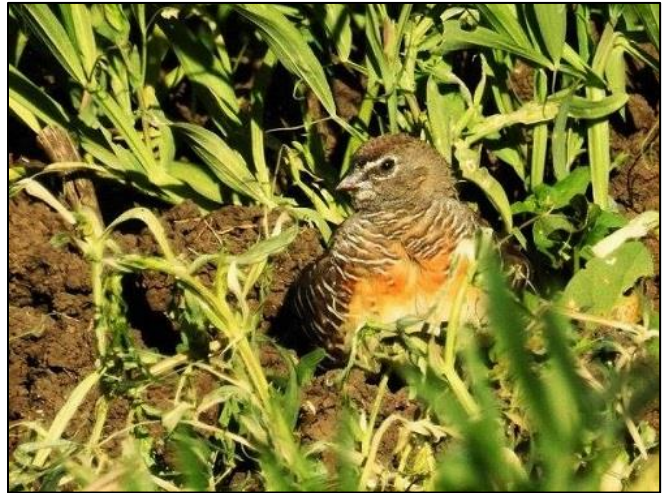
Quailfinch

We could have spent the whole morning at Chelekcheka but we had to move on. At a tasty breakfast overlooking the deep Lake Bishoftu, we added Maccoa Duck, Little Grebe, Western Marsh Harrier, Banded Barbet, Black-crowned Tchagra, Little Rock Thrush, Mocking Cliff Chat and Scarlet-chested Sunbird. Moving further down the Rift Valley, we found a gathering of Tawny Eagles and Rüppell's, White-backed, Hooded and Lappet-faced Vultures, and Long-crested Eagle, African Fish Eagle and Hamerkop near Lake Koka.