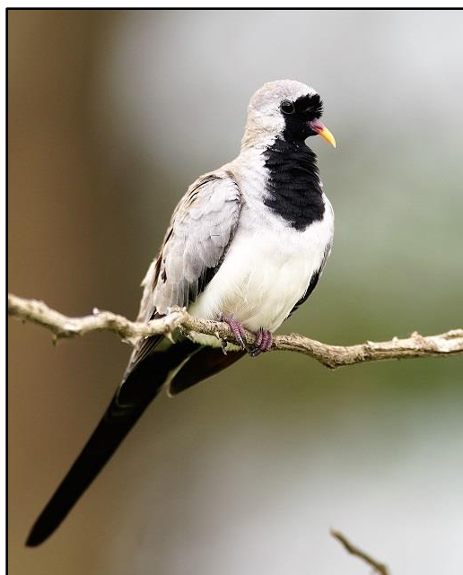
Namaqua Dove by David Cook

Crombec and plenty of European Rollers. We then took the main tarred road (H7) which led to Satara Rest Camp, and en route we saw Lilac-breasted and Purple Rollers, Senegal Lapwings, African Hoopoe, Swainson's Spurfowl, Flappet and Monotonous Larks, an out of range Grey-backed Sparrowlark, three Southern Ground Hornbills, a pair of Kori Bustards and two female Common Ostriches. On the mammal