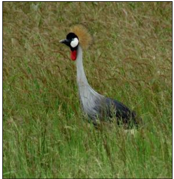
Grey-crowned Crane

After Breakfast, we drove to Cape Vidal. The weather conditions had improved considerably and we took a few loops and visited a lookout where we saw Yellow-throated Longclaw, Common Buzzard, Brown Snake-Eagle, a few Cape Buffalo, White and Black Rhinoceros, Plains Zebra and a few Chacma Baboons. We finally arrived at the Cape Vidal Camp and here we had lunch. Some of the guests walked along to the beach and saw Cape Gannet, Sooty Shearwater and Sanderlings. We also had a great look at a Kurrichane Thrush, which we still needed to find. We drove back slowly and saw a pair of Southern Reedbuck, European Rollers and Blue-cheeked Bee-eaters. Once we exited the park, we drove around the town once more and managed to get a great look at Little Swifts and Brown-throated Weavers before heading back to our lovely