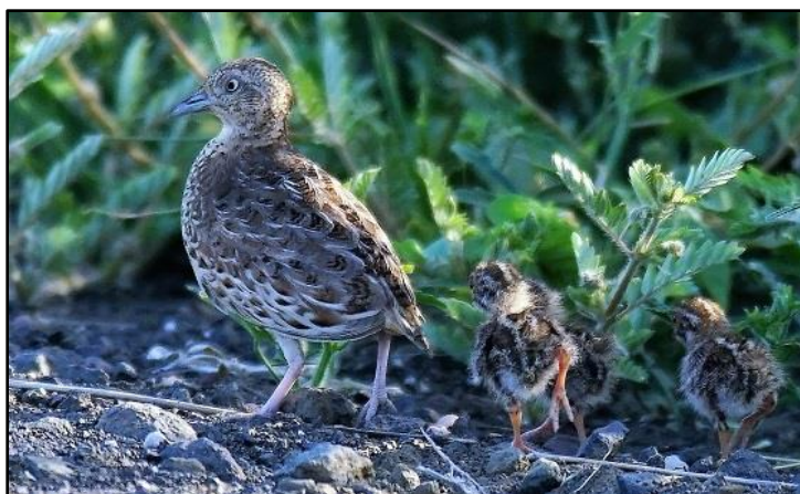
Kurrichane Buttonquail with chicks

At 3pm, we headed back out for an afternoon drive. The temperature was still very high but we continued and managed to get a great view of a Brown-headed Parrot on the way out of the camp. As we drove through some open savanna, we started to see large