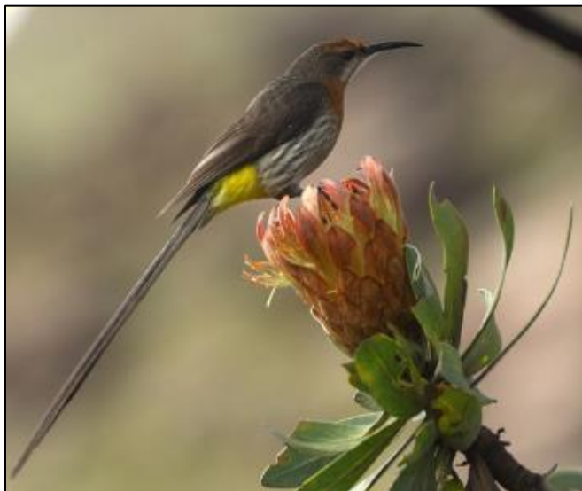
Gurney's Sugarbird

We left St Lucia before sunrise and made our way to Hilton. Along the way, we made a few stops at some strategic birding spots, and the first place we stopped was at the town of Mtunzini. The reason we stopped here was to look for the resident Palm-nut Vultures which roost in the Raphia Palms bordering the town. On our first few attempts we had no luck, so we returned to where we first had a look, and this time we saw three vultures: consisting of two Adults and one brown juvenile bird. By this time the rain had caught up with us and we continued to make our way up to Eshowe, regardless of the bad weather. When we arrived at Eshowe, we headed to the Dlinza Aerial Board Walk and here we set out to look for as many