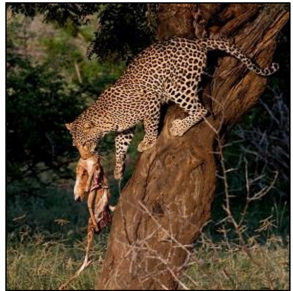
Leopard with Steenbok

Today we left Satara Rest Camp and made our way South in the direction of Skukuza Rest Camp. We travelled mainly on the tarred H1-3, getting sightings of Jacobin and Levillant's Cuckoos, Crested Francolin and beautiful views of a pair of Bennet's Woodpeckers. Another fantastic sighting we had was of a female Leopard with a Steenbok kill in a small tree right next to the road. We were able to watch her for several minutes before she jumped down into the tall grass with her food and disappeared. We then came across a troop of Chacma Baboons near the Giant Baobab and we were entertained by these primates as they were playing and feeding on the ripe Marula fruit. We passed a few dams that were filled up by the last good rains and we managed to see Black-winged Stilts, Hadada Ibises, African Spoonbill, Reed Cormorant, Pied Kingfisher, Lesser Masked Weavers, Grey Herons and an African Fish Eagle. We stopped for coffee and a leg stretch at Tshokwane Picnic Site and after a short stroll around the site, we managed to pick up views of Violet-backed and Greater Blue-eared Starlings, Common Scimitarbill, Klaas's and Black Cuckoo, and we also had a few African Green Pigeons fly right past us. On the other side of the picnic site, we saw Bushbuck, Golden-tailed Woodpecker, Black Crake and had an excellent view of a stunning