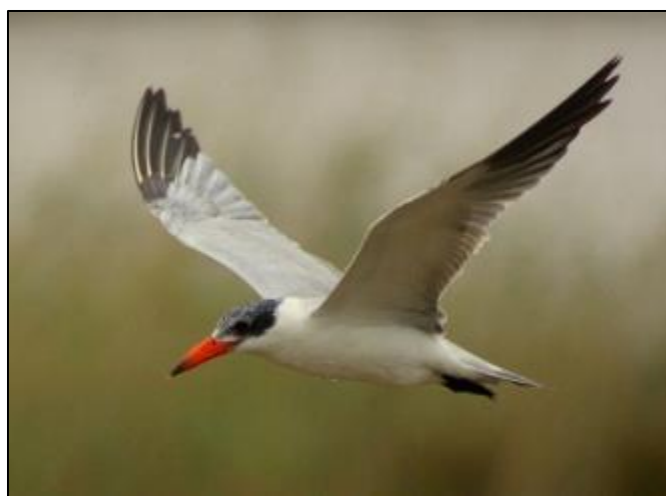
Caspian Tern

We then said goodbye to Hluhluwe and drove to Lake St Lucia. After lunch, we first visited the area alongside the Crocodile Centre, managing to get brief views of Trumpeter Hornbill and Livingstone's Turaco. We then checked into our Guest House and after a short rest, we drove down to the estuary where we saw a handsome pair of Saddle-billed Storks, as well as Little, Greater Crested and Common Terns, Common Greenshank, Whimbrel, White-faced Whistling Ducks and Yellow-billed Storks. We then walked the Igwalagwala Trail (meaning Purple-crested Turaco). We saw Fork-tailed and Square-tailed