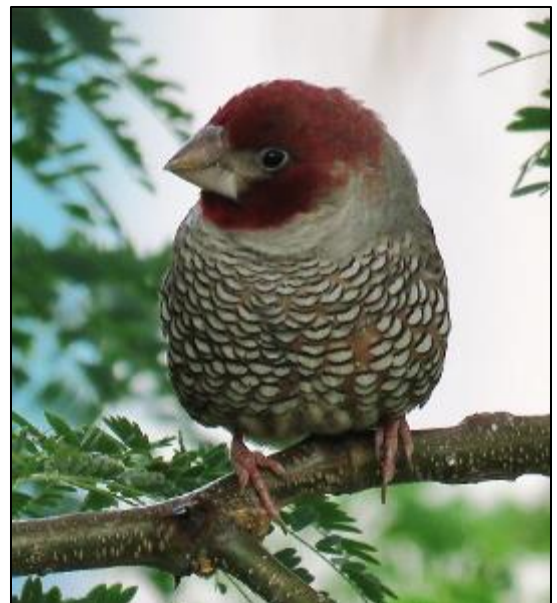
Red-headed Finch by Gareth Robbins

We left our guest house in Kempton Park after breakfast and headed in the direction of Kruger National Park. As we drove through the Highveld, we saw a few birds along the N4 Freeway, such as Black-winged Kite, Whiskered Terns, Amur Falcons, and the impressive Long-tailed Widowbirds hovering over the fields. We descended into the Lowveld and stopped in Nelspruit to get supplies for the next couple of days in Kruger National Park. We then continued along the R44 and just before we arrived, we saw a Black-chested Snake Eagle, White-backed and Hooded Vultures and an African Harrier-Hawk. We finally entered through the Orpen Gate and along the way to the check-in point, we saw Common Warthog, Plain Zebra, Common Wildebeest, Southern Carmine and European Bee-eaters, Long-billed