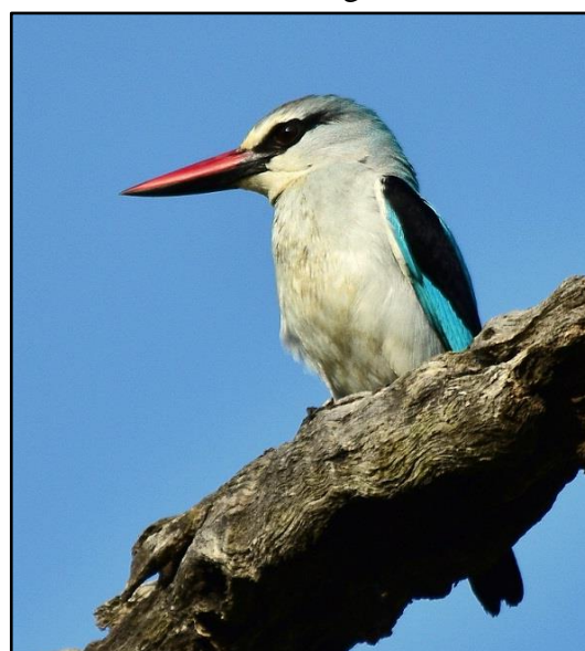
Woodland Kingfisher

We left Skukuza Rest Camp at Sunrise and re-visited the low-level bridge, where we saw one Black Stork and a large group of Marabou Storks. Our first stop was at a large group of granite outcrops, and this is where we managed to see a few African Green Pigeons and a Pair of Mocking Cliff Chats. We then made our way in the direction of Pretoriuskop Rest Camp and stopped on the Mathekenyane lookout. From here we could see the start of the next storm and had some long distance views of a Pearl-spotted Owlet being mobbed by Southern Black Tits and Chinspot Batises. We also saw Common and Blue Waxbills and had good looks at Brubru. Our next stop was at transport Dam and here we saw a few White-faced Whistling Ducks, African Fish Eagle and Common House Martins flying over the water. We continued in the direction of Pretoriuskop and managed to see one African Hawk Eagle before making a brief stop at Shitlave Dam, and we also saw a Yellow-throated Longclaw nearby. We finally arrived at Pretoriuskop Rest Camp and headed straight to the restaurant for a well-deserved breakfast. After breakfast, we took a short walk around the