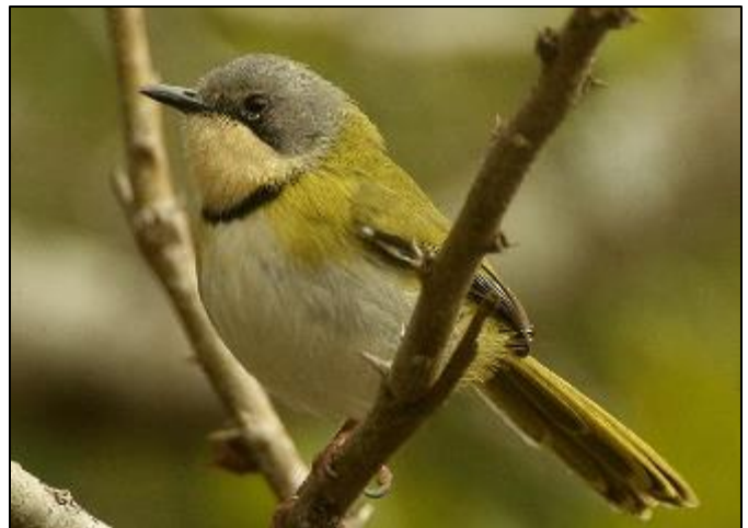
Rudd's Apalis by Gareth Robbins

After breakfast, we headed East on the plains where the Mpumalanga and KwaZulu-Natal provinces meet. We were very fortunate to see Mountain Wheatear, Buff-streaked Chat, Eastern Clapper Lark, Sentinel Rock Thrush, Red-capped and Eastern Long-billed Lark and the beautiful Yellow-breasted Pipit. Our next challenge took us in the direction of Daggakraal, but first we stopped at Fickland pan, managing to see Spike-heeled Larks on the way. At the Fickland pan, we saw Maccoa Ducks, Great Crested Grebes, Red-billed Teals, Greater Flamingos and Cape Shovelers. We then went in search of the Rudd's Lark, where after some searching, we managed to see two birds in flight and a Montague's Harrier. After our success, we