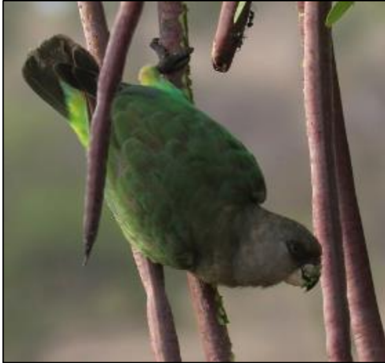
Brown-headed Parrot by Gareth Robbins

numbers of Plains Zebra and Common Wildebeest and one large Elephant Bull, as well as Common Ostriches and White Rhinoceros. A couple of female Red-headed Weaver were seen at their nest site before we drove along a dirt track and stopped at the Timbavati Picnic Site, where we came across a large bird party consisting of Black-Black-backed Puffbacks, Rattling Cisticola, Yellow-breasted Apalis, Cinnamon-breasted Bunting, Dark-capped Bulbuls, a female Green-winged Pytilia, an immature Purple