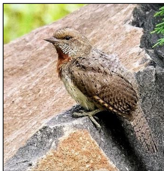
Red-throated Wryneck

After expecting terrible weather overnight, we woke to a cool and cloudy morning. We met Lucky, Wakkerstroom's expert guide, and we drove in the direction of Dirkiesdorp. We immediately changed our route and ended up on a dirt road where we stopped at a few Leucosidea Trees, here we saw Drakensberg Prinia, African Olive Pigeon, Cape Batis and the sought after Bush Blackcap. A sudden stop for some Cape Crows also yielded a quick view of three very shy Denham's Bustards, which immediately took off and disappeared out of view once we had stopped. We then continued along the dirt road and managed to pick up good views of Wailing Cisticola, Bokmakierie, Long-billed Pipit, Dark-capped Yellow-Warbler, Cape Bunting, Cape Grassbird and a very co-operative Barratt's Warbler. We