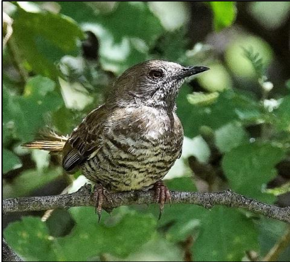
Barred Wren-Warbler by David Cook

Woodpecker, Green-winged Pytilia, Red-collared Widowbird and Yellow-crowned Bishops. We also had fantastic looks at a male Violet-eared Waxbill which was one of the top birds for the morning! A few more birds of prey were seen, such as Black-chested Snake-Eagle, Common Buzzards, Black-winged Kites, and a couple of Tawny Eagles.