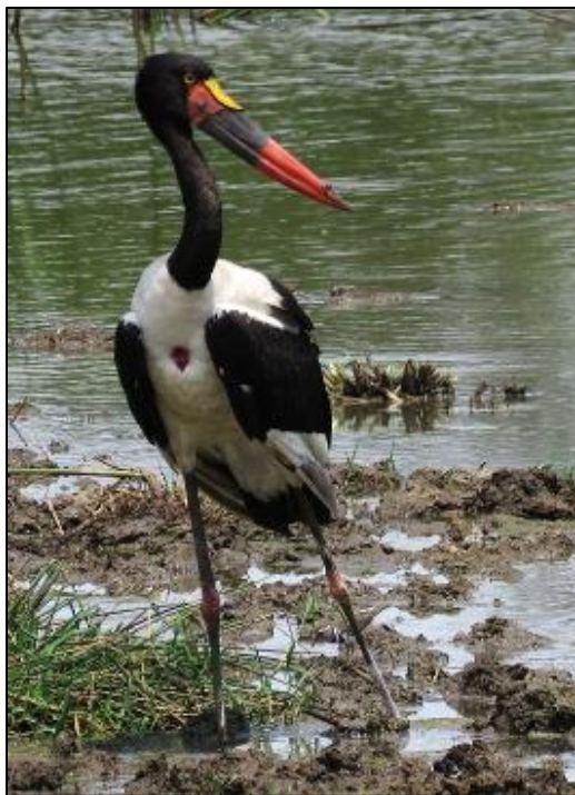
Female Saddle-billed Stork by Gareth Robbins

Sandpiper. We continued to the iNsumo Pan, where we were very fortunate to see African Openbill, Goliath Heron, Yellow-billed Stork and Pink-backed Pelicans. We then visited the KuMahala Bird hide, but it was totally covered in tall, thick vegetation. We did, however, see a Red-fronted Tinkerbird on the