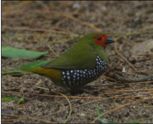
Male Green Twinspot

Drongos, White-eared Barbets, Red-capped Robin-Chat and an Olive Sunbird before walking back to the lodge to get ready for dinner. After a delicious seafood dinner, we took a short night drive around the town and successfully managed to see a Hippopotamus feeding in a park behind the restaurants, and had one great look at an African Wood Owl.