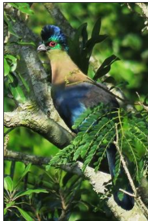
Purple-crested Turaco by Gareth Robbins

At the KuMasinga hide, it did not take us long to locate another male Pink-throated Twinspot. We sat in the KuMasinga hide for a few minutes and saw Three-banded Plovers and Wood