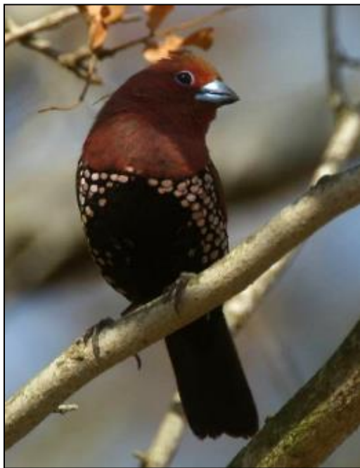
Pink-throated Twinspot

our luxurious guest house, where we had a delicious, hot breakfast. After breakfast, we made our way to Hluhluwe, where we were to stay for the next two nights. We drove through the town of Piet Retief and not long after, we managed to see a beautiful pair of Secretarybirds on the side of the road. We continued along the N2 and after a heavy downpour, we finally arrived at Hluhluwe.