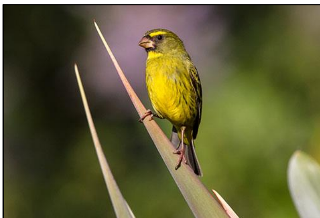
Forest Canary

We woke to another wet morning in the Natal Midlands but this did not deter us, as we had confirmation that the dirt roads that we would be travelling on were passable. We stopped in Howick and visited the Howick Falls and picked up sightings of a Forest Canary and a Thick-billed Weaver. We then continued into the Karkloof and in some of the farmlands, we saw very wet Hadada Ibises, White Storks, Red-collared Widowbirds, Grey-crowned Cranes and an African Dusky Flycatcher. We finally arrived at Benvie Gardens and thankfully the rain had calmed to a slight drizzle. We parked the tour van and walked around the gardens, picking up sightings of Village Weavers, African Olive Pigeon, Southern Double-collared Sunbird, Knysna Turaco, Chorister Robin-Chat, Olive Thrush, Southern Boubou and an immature Orange Ground Thrush. We arrived at the bottom section of the gardens, where we saw a pair of Bar-throated Apalises and a pair of Mountain