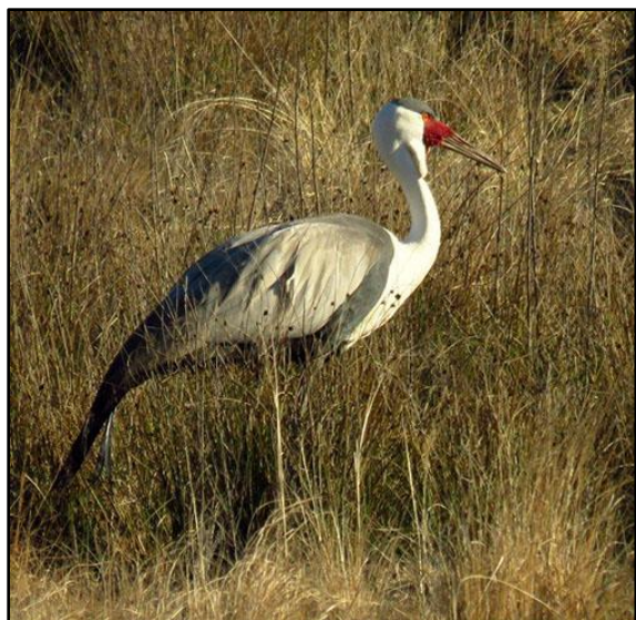
Wattled Crane by Gareth Robbins

Wagtails. We then left Benvie Gardens and visited the nearby forest patch and here we were very fortunate to see a Yellow-throated Woodland Warbler and Grey Cuckooshrike.