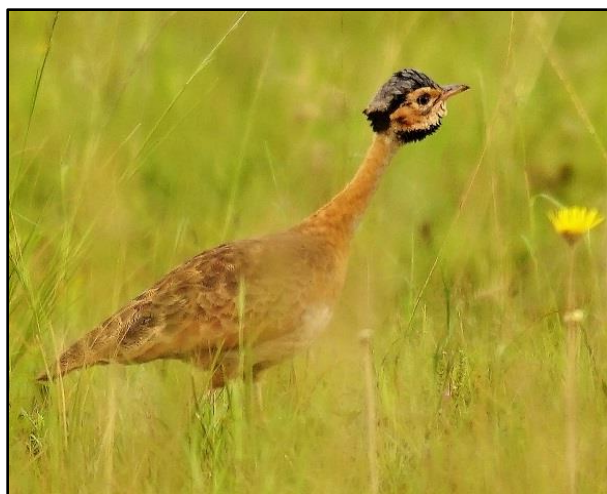
White-bellied Bustard by David Cook

campsite, managing to find Crested and Black-collared Barbets, Yellow-fronted Tinkerbird, Violet-backed Starlings, Black-headed Oriole, Green-backed Camaroptera, Southern Black Flycatcher, Yellow-fronted Canary, and an adult Grey-headed Bushshrike with its hungry fledgeling. We entered the swimming pool area and found Marico Sunbirds, Southern Black Tit, Green Woodhoopoes, Common and Blue Waxbills and a Cardinal Woodpecker. We left Skukuza Rest Camp and exited Kruger National Park, managing to get great looks at Yellow-throated Petronias, Scarlet-chested Sunbird and a male Black Cuckooshrike.