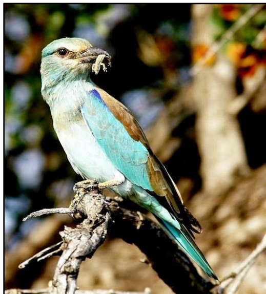
European Roller with Gecko

Orange-breasted Bushshrike in a tall tree on the river bank. We then continued to Skukuza Rest Camp, where we saw two Lionesses sleeping in the tall grass, as well as African Cuckoo, White-crested Helmetshrikes, Hooded Vultures, Tawny and Lesser-spotted Eagles, Marabou Storks and good numbers of Elephants before stopping at Skukuza for lunch.