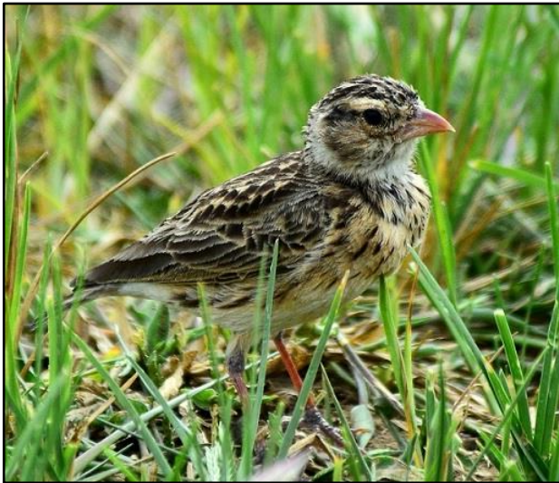
Botha's Lark by Gareth Robbins

continued to the small town of Dirkiesdorp, spotting Cape Canaries, African Quailfinches and a Red-throated Wryneck before starting our search for the White-bellied Bustard. It did not take us long to locate two very co-operative males next to the side of the dirt road. We then drove back to Wakkerstroom for breakfast, where we saw a Jackal Buzzard, Hamerkop and a Black Sparrowhawk along the way. Whilst we had breakfast at our guest house, we were able to view a few birds, such as Village and Southern Masked Weavers, Helmeted Guineafowl, Malachite Sunbird, Black-collared Barbet and a Speckled Mousebird at the feeding station.