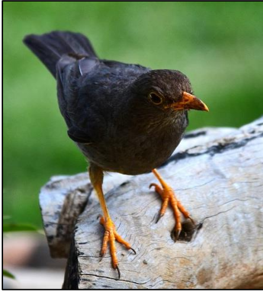
Karoo Thrush by Gareth Robbins

Today was our arrival day and some of us just spent a leisurely time birding in the garden at our guest house in Kempton Park, Johannesburg. There were a few bird feeders placed in the garden, which attracted good numbers of Red-headed Finches, Cape and House Sparrows and Laughing Doves. Karoo Thrush and Grey Go-Away-Birds were also seen in the garden and Western Cattle Egrets were seen flying overhead. In the evening, we all met at dinner and discussed the program for the first full day of the tour.