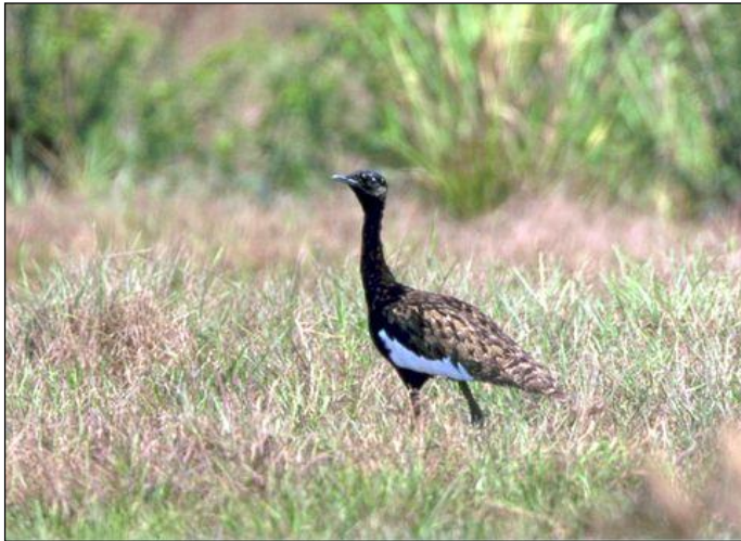
Bengal Florican by Allan Michaud

The next day was a long, full day as we struck out early for the nearby "Florican Grasslands"