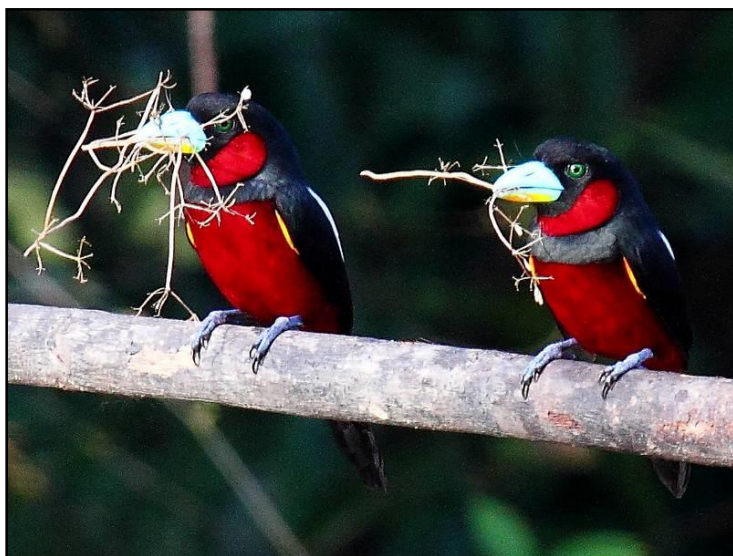
Black-and-red Broadbills by Glen Valentine

Our three full days in Cat Tien gave us some of our best birds and birding of the trip and, although the birding was slow-going and rather challenging at times, we also had many magical moments and immensely productive and bird-filled sessions, which led to us seeing most of the reserves specialties. Forest trails yielded secretive species including the superb Bar-bellied Pitta, immaculate Siberian Blue Robin, Yellow-bellied Warbler, Pale-footed Bush Warbler, Green-legged Partridge, Pale Blue, Tickell's Blue and Blue-and-white Flycatchers, Scaly-