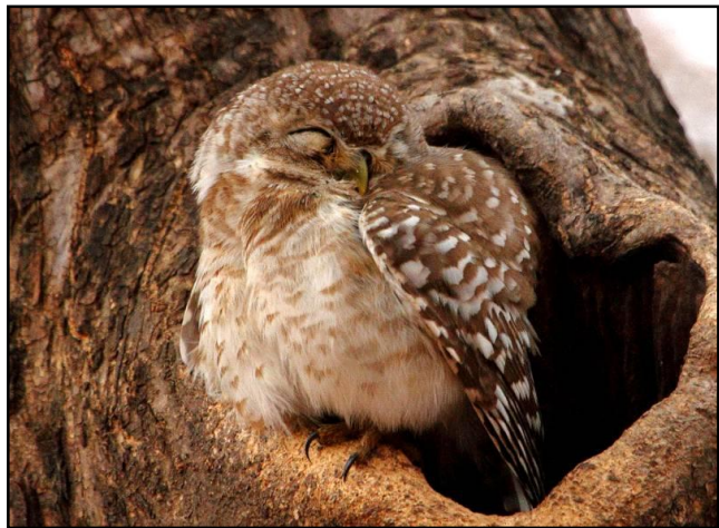
Spotted Owlet by Glen Valentine

Arriving at our basic accommodation in the mid-afternoon, we settled into our rooms and had a short break during the afternoon heat before embarking on a walk that took us into the early evening. The dry, broad-leaved, dipterocarp woodlands around Tmatboey were alive with birds and our short stroll through this beautiful habitat yielded many fabulous species: Oriental Pied Hornbill, our first of many Rufous-winged Buzzards, the tiny Grey-capped Pygmy Woodpecker, Common Woodshrike, Common Iora, Large and Indochinese