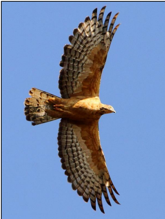
Crested Honey Buzzard by Glen Valentine

The next morning on the pass was much more pleasant and we were treated to a clear and bird-filled morning. Species came thick and fast from the first rays of light and highlights were numerous. These included Blue Whistling Thrush, Yellow-billed Nuthatch, Indochinese Green Magpie, spectacular Red-headed Trogon, Maroon Oriole, ultra-showy and vociferous Red-billed Scimitar Babbler, White-cheeked and incredibly secretive Black-hooded Laughingthrushes, White-bellied Erpornis, Dark-sided, Mugimaki and Verditer Flycatchers, Rufous-capped Babbler, Black-headed Parrotbill and White-throated Rock Thrush amongst many others.