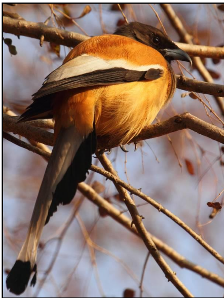
Rufous Treepie by Glen Valentine

Cuckooshrikes, splendid Small Minivet, Burmese Shrike, Black-naped Oriole, White-browed Fantail, shy but mightily impressive Red-billed Blue Magpie, Rufous Treepie, Sooty-headed and Streak-eared Bulbuls, Grey-breasted, Plain and scarce Brown Prinias, localized Burmese Nuthatch and Black-collared Starling. We arrived at our White-shouldered Ibis site just before dusk and positioned ourselves for the quarry. Our timing was perfect and within a few minutes of arriving, a pair of these rare and range-restricted ibis came flying in to roost in a bare tree on the opposite side of the clearing in which we were positioned. Fantastic! With one of the area's biggest targets in the bag we joyfully made our way back to the road and our awaiting 4x4 vehicles. On the walk back we found a Brown Hawk-Owl perched up in a bare tree and took some time to admire it before returning to our camp.