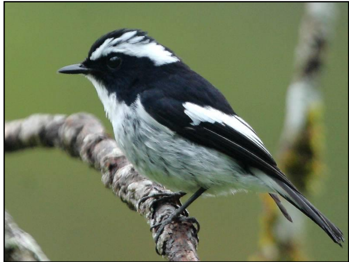
Little Pied Flycatcher by Glen Valentine

During our explorations of the beautiful pine and broad-leaved forests that surround Ho Tuyen Lam Dam we were rewarded with such noteworthy species as the endemic Vietnamese Greenfinch, Hill Prinia, Wedge-tailed Green Pigeon, Slender-billed Oriole, Green-backed Tit, the unique Red Crossbill, Chestnut-vented Nuthatch, Long-tailed Minivet, Grey-faced Buzzard, Crested Honey Buzzard, Eurasian Jay, Black-collared Starling, Eyebrowed and Japanese Thrushes, Grey Bush Chat, Collared Owllet, Large Niltava, secretive and exquisite White-tailed Robin, Black-throated Bushtit, Blue-winged Minla, Kloss's and Eastern Crowned Warblers, incredible Long-tailed Broadbill and striking White-browed Scimitar Babbler.