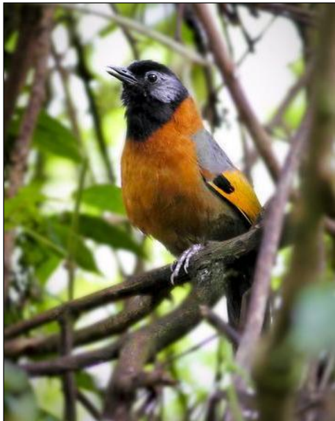
Collared Laughingthrush

The last new site that we visited in the Da Lat area was Mt. Lang Biang; home to most of the area's famed endemics and the only site for a number of species occurring in the Da Lat area.