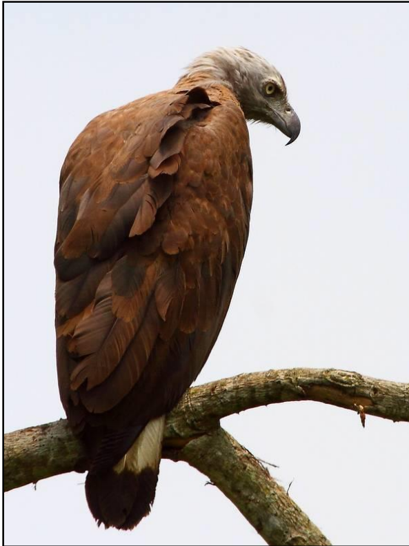
Grey-headed Fish Eagle by Glen Valentine

to the road and alighted in a nearby tree for us to admire and photograph at length. Absolutely awesome! We couldn't have hoped for better views of this extremely sought-after species and with spirits at an all-time high, we could relax and enjoy the rest of the morning's birding, which produced sightings of a noisy family group of spectacular Black-headed Woodpeckers, several large flocks of beautiful Blossom-headed and Red-breasted Parakeets, Crested Serpent Eagle, Changeable Hawk-Eagle, Crested Treeswift, Indian Roller, Common Flameback, Eurasian Hoopoe, sensational Scarlet Minivet, Black-hooded Oriole, localized Indochinese Bushlark and Chestnut-tailed Starling.