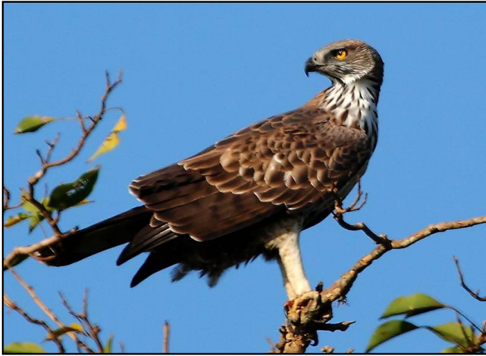
Changeable Hawk-Eagle by Glen Valentine

excellent species, namely White-bellied Woodpecker, Greater Flameback, Olive-backed Pipit and Banded Bay Cuckoo. What a fabulous lunch stop!