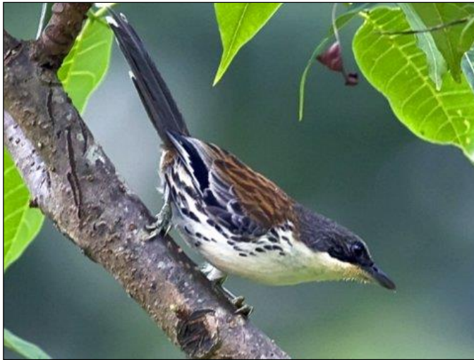
Grey-crowned Crocias

The south-east Asian countries of Cambodia and Vietnam harbour some of Asia's most