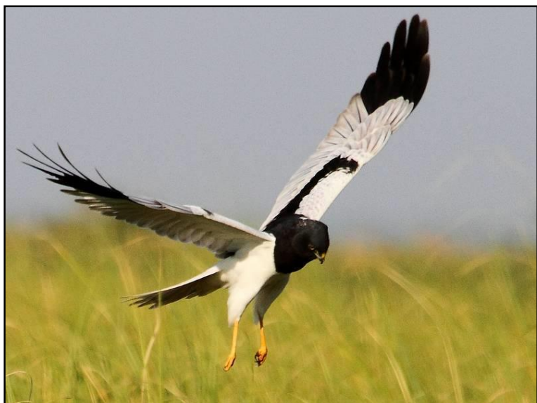
Pied Harrier by Glen Valentine

On the way to the tiny village of Tmatboey we made a stop at the edge of a patch of broad-leaved woodland, which yielded the target species, a handsome male White-rumped Falcon. Our lunch stop was at a small roadside restaurant that was situated in wonderful broad-leaved woodland and a post-lunch foray here turned up some