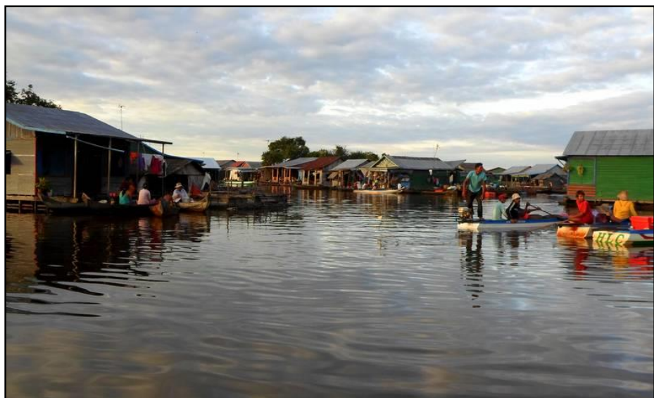
Prek Toal village on Tonle Sap

corner of the lake protects important populations of breeding and migratory waterbirds and was our focal point for a full day. Tonle Sap did not disappoint and teemed with all sorts of water-associated bird species. Highlights included Greater and Lesser Adjutants, Spot-billed Pelican,