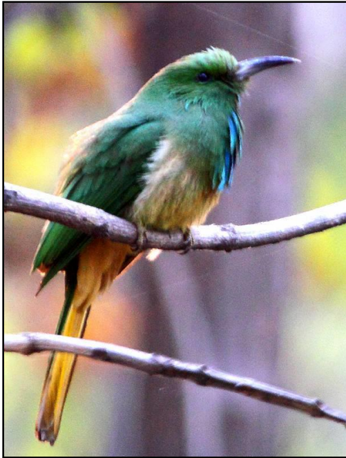
Blue-bearded Bee-eater by Glen

eared Barbets, Oriental Dollarbird, Laced and the rare and seldom-seen Pale-headed Woodpeckers, Vernal Hanging Parrot, superb Black-and-red and Banded Broadbills, Bar-winged Flycatcher-Shrike, Large Woodshrike, Great Iora, Ashy and Scarlet Minivets, Ashy, Bronzed, Hair-crested and Greater Racket-tailed Drongos, Stripe-throated, Ochraceous and Grey-eyed Bulbuls, Racket-tailed Treepie, Rufescent Prinia, Dark-necked Tailorbird, Velvet-fronted Nuthatch, Plain Flowerpecker, Ruby-cheeked and Olive-backed Sunbirds, Little Spiderhunter, Forest Wagtail and the Indochinese endemic Grey-faced Tit-Babbler.