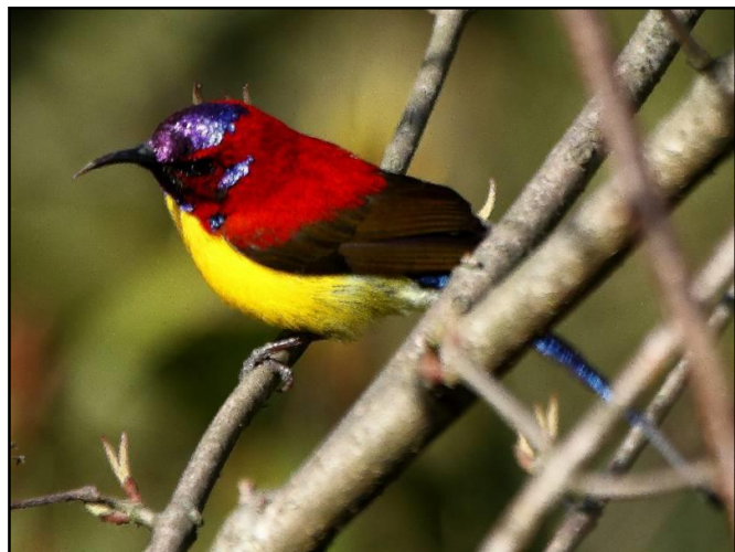
Mrs. Gould's Sunbird

From Cat Tien we made our way into the Vietnamese highlands and spent the night at Di Linh. This served as an excellent base to explore the nearby Deo Sui Lanh Pass and its luscious, verdant