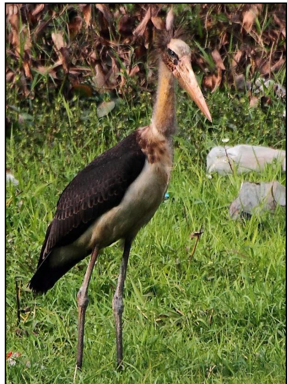
Lesser Adjutant

During our afternoon and morning at Veal Krous we were entertained by many of the species