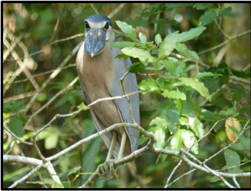
Boat-billed Heron by Chris Sharpe

Refuge, seeing a selection of widespread waterbirds along the way. Our boat trip into the mangroves produced a host of species including a dozen Boat-billed Herons, White-necked Puffbird, Black-crowned Antshrike and a Sungrebe, with a couple of showy Collared Plovers displaying at the beach. Mantled Howler Monkey and White-throated Capuchin were also seen well.