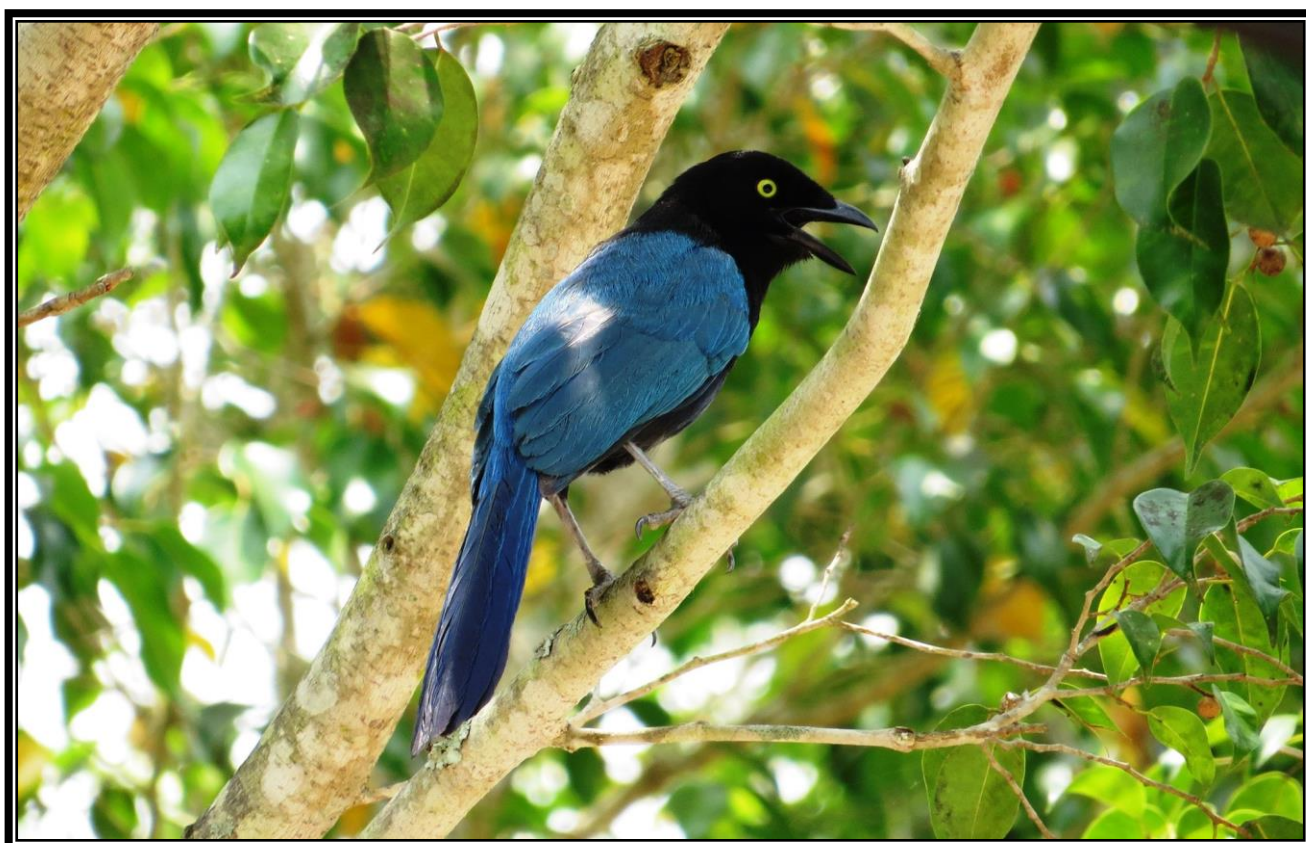
Bushy-crested Jay