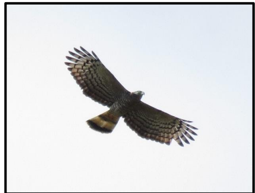
Hook-billed Kite by Mike West

Sunday 13 December. The following morning was entirely taken up with the hour drive to Pico Bonito Lodge, the Sunday lack of traffic allowing us to complete the journey in under 7 hours. New birds greeted us on an afternoon bird walk, with the Violet Sabrewing and Violet-crowned Woodnymph being perhaps the favourites. A Geoffroy's Spider Monkey feeding noisily may have chased the cotingas from their wild avocado tree.