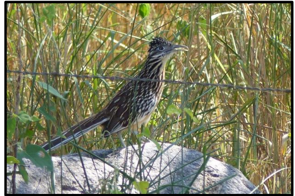
Lesser Roadrunner by Chris Sharpe

Wednesday 16 December. An early, pre-breakfast start for our day trip to the Aguán Valley, a dry pocket home to Honduras's only endemic species, the eponymous Emerald. After wonderfully close views of a soaring male Hook-billed Kite during some roadside birding, we headed into the Honduran Emerald reserve, a place of thorn-bushes, cacti, and ocotillos and temperatures to match. It only took us a short while, hurrying from one patch of shade to then next to chalk up half a dozen Honduran Emeralds and about the same number of Salvin's – nice to know that this endangered, restricted-range species is, at least, abundant here. A Zone-tailed Hawk added to the desert atmosphere. Lunch, cooked in a clay oven, was served in the dining room of a charming local house. On our way out we picked up a Lesser Roadrunner sheltering from the sun. Our final new bird of the day was Black-and-White Owl – three adults roosting in a park in La Ceiba, thanks to Elmer.