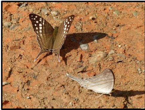
Dappled Daggerwing