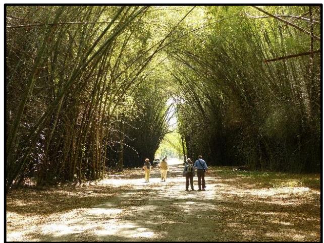
Lancetilla Botanical Gardens