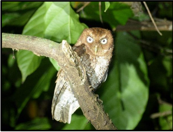
Middle American Screech Owl

Blue-winged and Chestnut-sided and a nice Northern Parula. We had to fight for looks at White-collared Manakins and Yellow-bellied Tyrannulet. The sun created thermals for soaring raptors, and we had half a dozen species including both black hawks and a Black Hawk-Eagle. Lunch was a change of scene: a typical seafood restaurant at Tela serving the best food of the tour. A stroll along the beach afterwards was rewarded with several seabirds, the last of which was a probable Parasitic Jaeger, although our views were not quite good enough to clinch its identity.