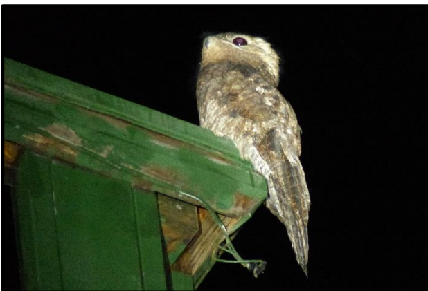
Great Potoo

Thursday 17 December. Our morning was spent at the Río Santiago private reserve. The forest trail was not in great shape, but provided us with views three species of woodcreeper as well as Keel-billed and Tody Motmots – two of the most difficult motmots to see and target birds for this excursion. However, the forest was eclipsed by the multitude of hummingbird feeders, which gave us looks at 11 species, including the uncommon Band-tailed Barbthroat. After dinner, we spent a couple of hours