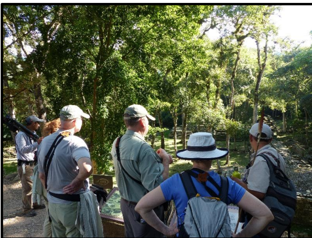
Birding Copán