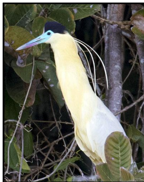
Capped Heron by Paul Fox

9 July: The tour started with a short flight from Cuiaba to Alta Floresta. The first bird of the trip was a Toco Toucan that was seen from inside the aeroplane by Mike - a promising start! Along the drive to the Teles Pires River, we picked up several species of interest, including a flock of Muscovy Ducks at a small pond. A dusty road stop at a Mauritia palm grove was productive as we got Point-tailed Palmcreeper and Sulphury Flycatcher, both specialists to this habitat. A low overhead flyover of two Blue-and-yellow Macaws was a spectacular introduction to Amazonia! Our local guide - Micah - was waiting for us at the river. The canoe ride to the Cristalino lodge produced a few good raptor sightings, including a pair of noisy Red-throated Caracaras, a Great Black Hawk and a splendid Black-collared Hawk. Our first Paradise Jacamar for the trip got us quite excited as did a beautiful Capped Heron. At dinner, Micah surprised us with a Linné's Two-toed Sloth, a rare sighting at Cristalino!