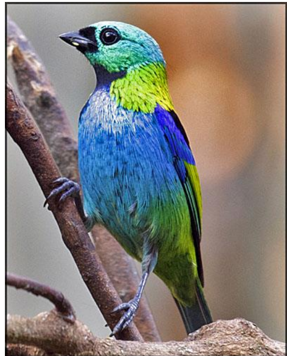
Green-headed Tanager

26 July: Today we visited the Urugua-i reserve which is located 30km south-east of Puerto Iguazu. It is one of the best places for the rare and Endangered Black-fronted Piping Guan - a species endemic to the Atlantic forest. We knew our chances of seeing this bird were best at the river but we also knew that it was easy to miss. When we got down to the river it was Michael