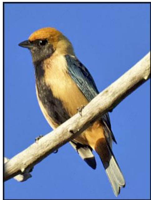
Burnished-buff Tanager