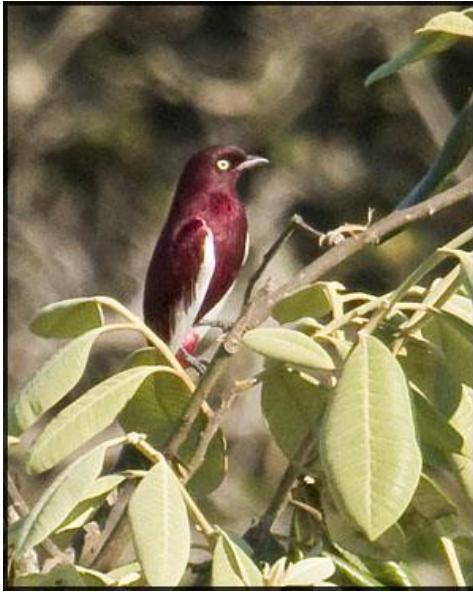
Pompadour Cotinga by Dušan Brinkhuizen

11 July: The early morning was spent in Tower 2. The views of the continuous Amazon jungle were impressive and so were the canopy birds. The diversity of species that we saw from the tower was just incredible. A pair of Brown-banded Puffbirds were perched in the nearby trees. Toucans were well represented with great views of Red-necked Aracari, Curl-crested Aracari, Channel-billed and White-throated Toucan. Amazing parrots that we saw included four species of macaw (Blue-and-yellow, Red-and-green, Scarlet and Chestnut-fronted), Red-fanned and a small flock of perched White-bellied Parrots. The scarce White-browed Hawk was scoped but also nicely seen in flight. A stunning Red-necked Woodpecker showed itself well. We also got our first King Vulture for the trip. A tanager flock produced several species, including the stunning Paradise, Turquoise, Yellow-backed and Red-billed Pied Tanagers. A very