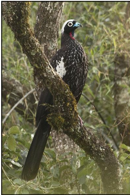
Black-fronted Piping Guan by Dušan Brinkhuizen

Azara's Agouti and Black-horned Capuchin were all habituated in the tourist area so we got close-up views of these mammals. It was quite a long walk but the scenery and the waterfalls that we got to see today were just mind-blowing.