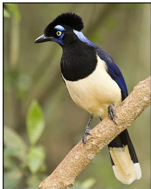
Plush-crested Jay

Further along the trail, we were lucky to run into some big, fancy birds. First, we got a splendid pair of Blond-crested Woodpeckers shortly followed by the large and spectacular Robust Woodpecker. A male and female Surucua Trogon of the red-bellied form showed themselves nicely in the sub-canopy. This Southern subspecies is sometimes regarded as a separate species from the Northern yellow-bellied race. Smaller birds that we got in the forest included Ochre-collared Piculet, Ochre-breasted Foliage-gleaner, Lesser Woodcreeper and the scarce Creamy-bellied Gnatcatcher. The rare Bay-ringed Tyrannulet was calling from the canopy but we could not get it in view. The rest of the day was spent at the amazing Iguazu Falls. The trail system went through nice habitat but the birding was quite slow. We did see Chestnut-eared Aracari and Toco Toucan. There were many other tourists walking the trails so it was quite a busy experience as well. South American Coati,