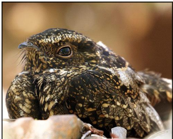
Blackish Nightjar

In the late afternoon, we placed ourselves behind a blind in the forest. A man-made drinking station was set up to attract difficult forest-interior birds. It was, truly, an amazing experience to watch several species coming in for water: White-crowned, Fiery-capped and Snow-capped Manakins, Ochre-bellied Flycatcher, Spot-winged Antshrike, White-flanked Antwren, Xingu Scale-backed and Bare-eyed Antbird, all seen at close range and for prolonged moments! Bonus birds that we saw included Rufous-tailed Flatbill, White-chinned Woodcreeper and Long-tailed Woodcreeper but these scarce species did not come down to the water.