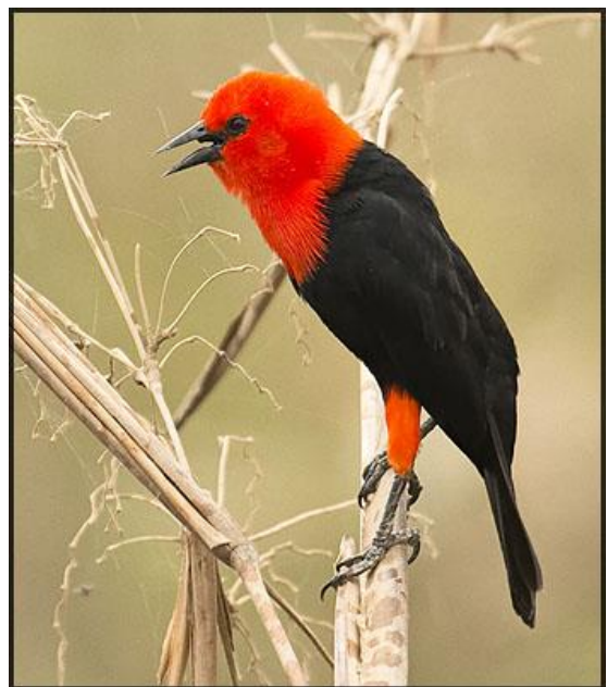
Scarlet-headed Blackbird

16 July: In the early morning, we birded again around Curicaca lodge in the hope to find some new species. A cooperative White-eyed Attila was a great start. We also got some nice views of a Band-tailed Antbird at the lagoon. Again, there was no sign of the Great Rufous Woodcreeper so