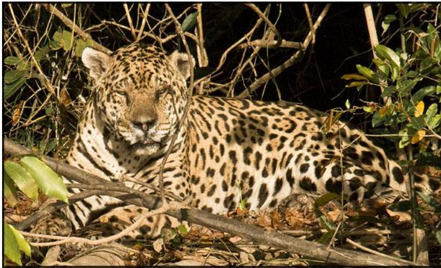
Jaguar by Dušan Brinkhuizen

localised Fawn-breasted Wren. Back at the lodge grounds, we saw an adult Black Hawk-eagle soaring over. Hyacinth Macaws and a Toco Toucan in the garden were great fun to watch and photograph.