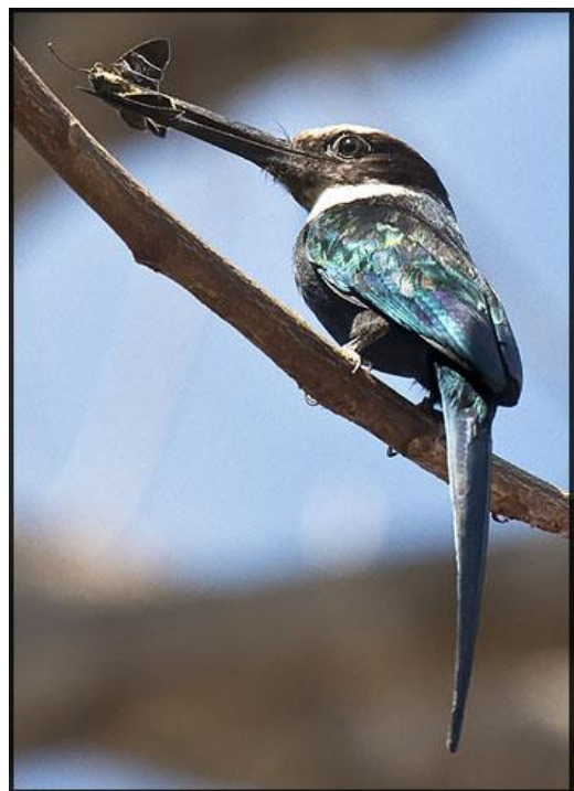
Paradise Jacamar