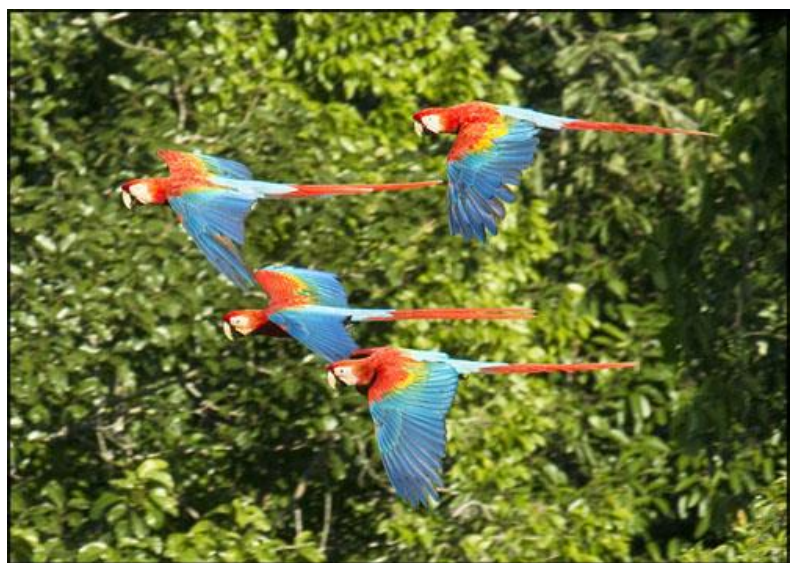
Scarlet Macaws by Dušan Brinkhuizen

Once we were on the entry road to Curicaca, we did some spotlighting from the bus. "Wow, stop, a Giant Anteater just crossed the track, people get out of the bus!" Not everybody realised that we had to get out quickly before the beast would disappear in the dense vegetation. For those who got out in time, the views of this spectacular animal were just amazing. As if this day wasn't already overwhelming, a