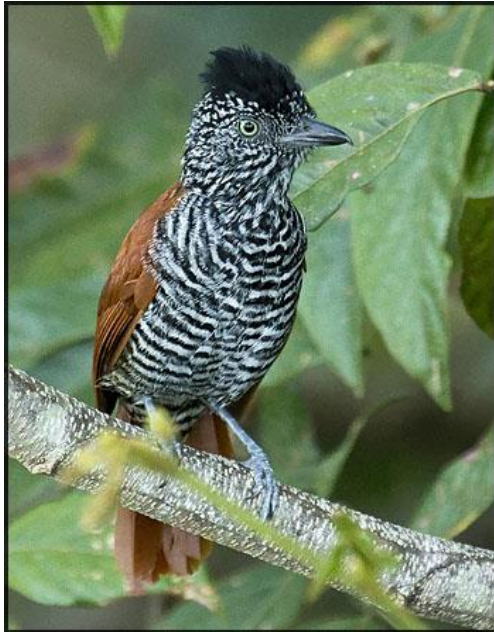
Chestnut-backed Antshrike

would be almost the same thing as seeing a live Dodo, so the plan for the afternoon was voted for unanimously - we absolutely had to give it a try.