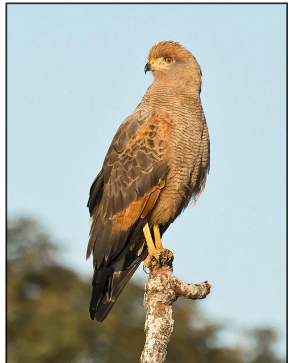
Savannah Hawk

19 July: The amazing Red-legged Seriema was the first bird we stopped for. A short bout of playback got a pair to run straight towards us. They started to sing loudly, moving their heads up and down - a truly spectacular sight. From the same spot, we heard a familiar call that we had been trawling with during the tour - a Great Rufous Woodcreeper! Soon this giant woodcreeper flew towards our tape and showed itself well. Another species that we played in was a pair of Suiriri Flycatcher. A very successful early morning! At another site, we got our first Green-barred Woodpecker which showed nicely on an exposed trunk. A Savannah Hawk posed for the photo. We tried for White-fronted Woodpecker but the pair had seemingly left the territory a year ago. Here we did get a Crimson-crested Woodpecker and the attractive Grey-crested Cacholote.