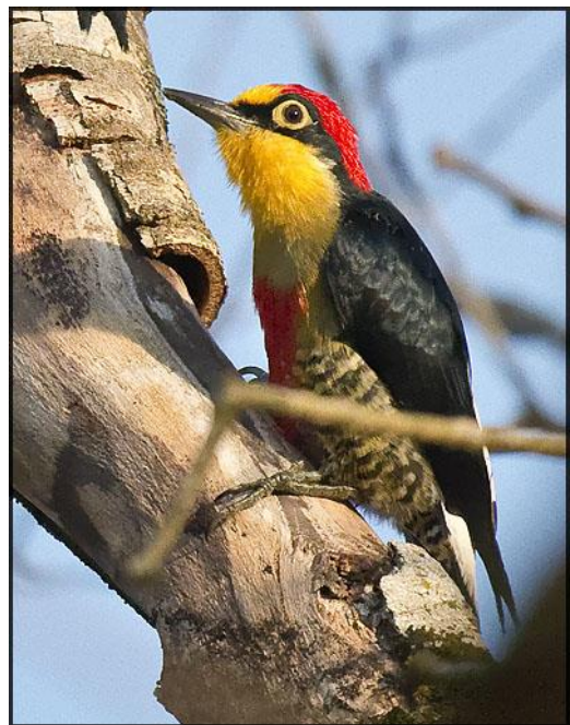
Yellow-fronted Woodpecker by Dušan Brinkhuizen

23 July: In the early morning, we did a couple of hours birding at Pousada do Parque before we left for Cuiaba. First, we targeted a pair of Ash-throated Crakes. The birds responded vocally to our tape but they never came out of the dense vegetation. A Planalto Tyrannulet was a catch-up for some while a nicely showing Sooty-fronted Spinetail was new for all of us. Other birds around were Yellow-bellied Elaenia, Creamy-bellied Thrush, Blue-black Grassquit and a nice Grassland Sparrow. An immature male Blue-tufted Starthroat was a good find. The hummingbird was coming back to the same