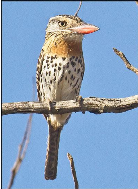
Caatinga Puffbird by Dušan Brinkhuizen

green Macaws to fly but only got them perched. There was some movement of small tanager flocks and we got great looks at both Swallow and Burnished-buff Tanagers.