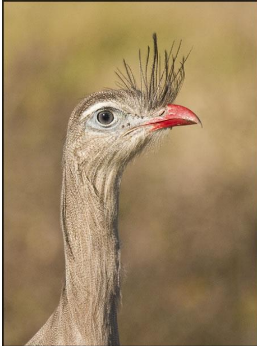
Red-legged Seriema by Dušan Brinkhuizen

flying birds were picked up in the distance, and yes, they were Yellow-faced Parrots! The birds landed in a tree far away but we all got brief looks through Jim's super-scope. When we got closer to the tree the birds had already left. We did hear a nice Red-winged Tinamou at dusk. Back at the lodge we enjoyed a nice dinner but the action wasn't over yet: a Maned Wolf walked by and spotlight views of this rare mammal were just great. What a day!