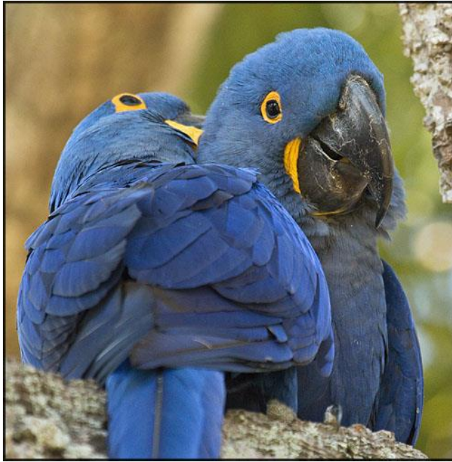
Hyacinth Macaw