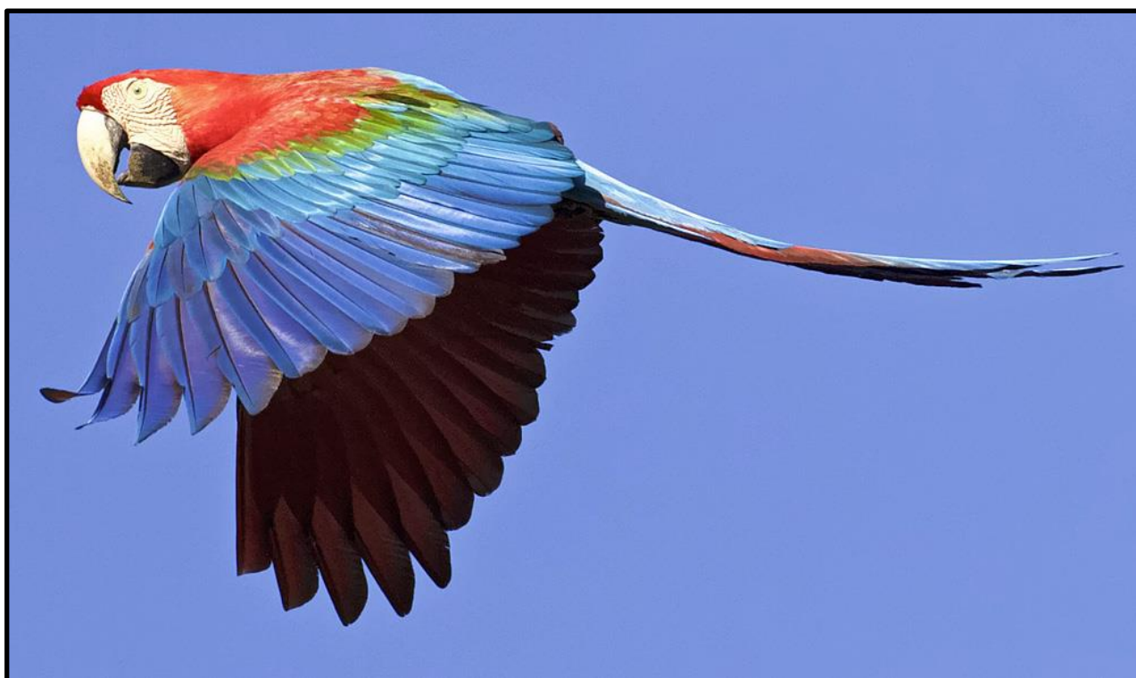
Red-and-green Macaw