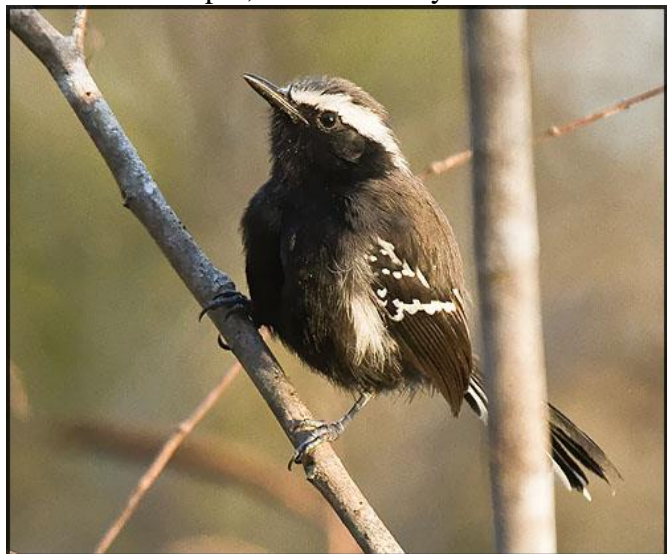
Black-bellied Antwren by Dušan Brinkhuizen

20 July: In the morning, we successfully targeted Black-bellied Antwren. A nice male popped out in the open and we even get some photos of the skulker. Other species that we saw nicely include Saffron-billed Sparrow, Straight-billed Woodcreeper, Planalto Slaty Antshrike and a male Red Pileated Finch. Another search for White-fronted Woodpecker produced a Pale-crested Woodpecker and a splendid pair of Hyacinth Macaws. Trawling at the edge of a large lagoon resulted in a close range view of Grey-breasted Crake, unfortunately only glimpsed by very few people. It was calling frequently and we saw the movement in the vegetation but the bird stayed well hidden. After lunch, it was time to say farewell to the Pantanal as we started our travel to the famous Chapada dos Guimarães. Our afternoon stop at the scenic Cachoeira Véu de Noiva waterfall was great. We waited for the Red-and-