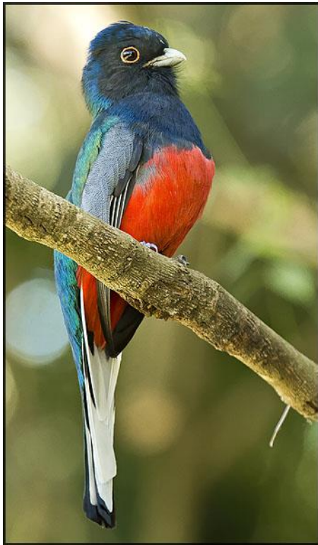
Surucua Trogon by Dušan Brinkhuizen

perch over and over as we studied its interesting plumage for a while. At the forest edge, we ran into a Pale-bellied Tyrant-Manakin.