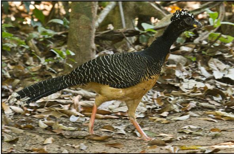
Bare-faced Curassow

10 July: The early morning started great with a beautiful fly-by from an Amazonian Umbrellabird that was shortly followed by close-up views of three Razor-billed Curassows on the river bank! We also got our first Red-throated Piping Guans along the Cristalino River. The rest of the morning was spent at riparian habitat and the river islands of the Teles Pires River. Here we did well in terms of target species that we wouldn't get anywhere else on the trip. Fairly soon, we got our