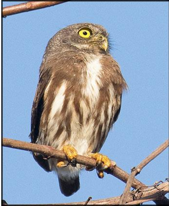
Amazonian Pygmy Owl

White-lored Euphonia, Epaulet Oriole, Purple and Green Honeycreeper were all well seen - too many colours and movements to handle at once! Hummingbirds that we saw here were Long-billed Starthroat, White-necked Jacobin, Black-throated Mango, Versicolored Emerald, Fork-tailed Woodnymph and the scarce Rufous-throated Sapphire.