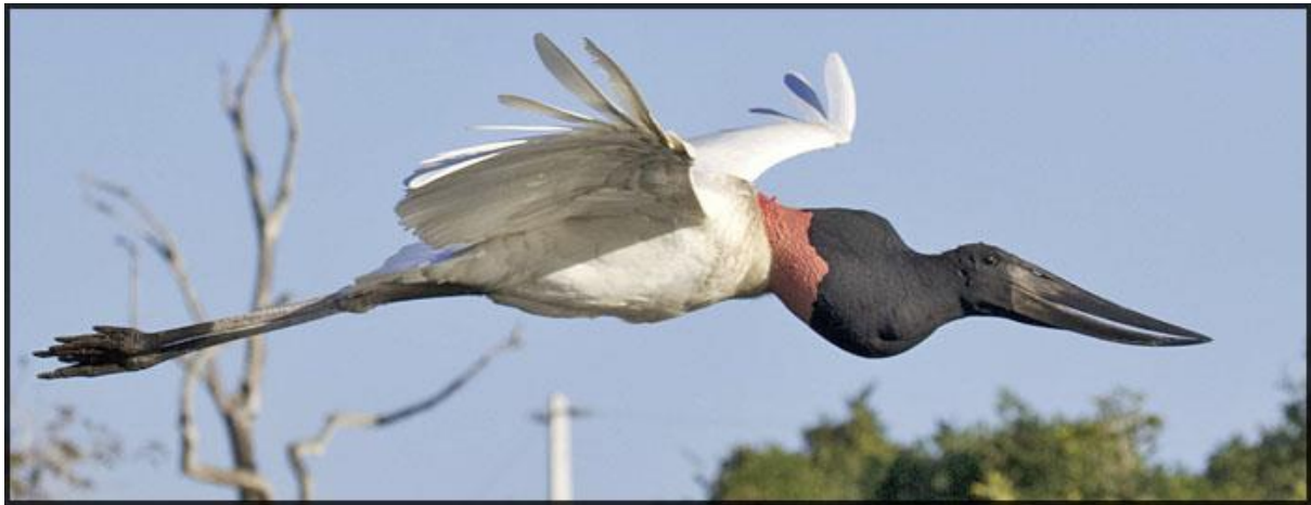
Jabiru by Paul Fox

Lowland Tapir crossed the track in front of us. Views were very brief but a Tapir is a Tapir!