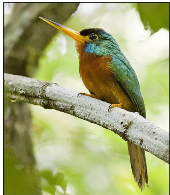
Blue-necked Jacamar

12 July: In the morning, we birded the ecologically distinct Serra trail. The lower stretch of the trail goes through the dense humid forest; whereas the higher part of it ends up in the open deciduous forest with granite outcrops. Our first stop at a dense bamboo patch produced a stunning male Rose-breasted Chat and a Large-headed Flatbill. At a small clearing, we watched a White-necked Puffbird perch on an exposed branch. An Amazonian Pygmy Owl was calling from the forest edge once we got into the dry deciduous habitat. The bird was fairly responsive to our tape and soon flew in closer to us. It was a true spectacle when the bird perched right in front of us: not only had we enjoyed superb views of the owl itself but it was being mobbed tanagers, euphonias and hummingbirds that we got to see fantastically as well! Turquoise and Blue-necked Tanager, Thick-billed, Rufous-bellied and