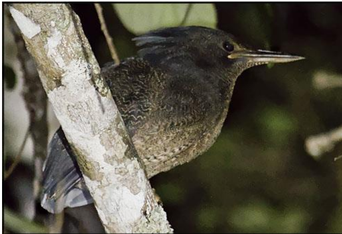
Zigzag Heron

we had to get this target somewhere else. In the more open habitat, we added Creamy-bellied Thrush, Unicolored Blackbird and a neat Great Antshrike to the list.