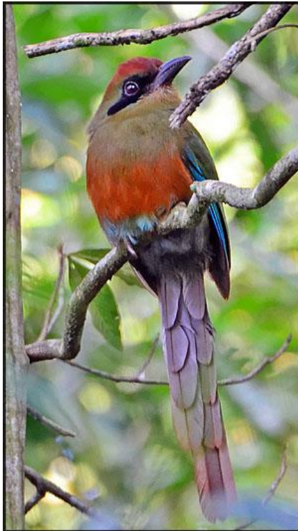
Rufous-capped Motmot by Michael Sabyan

who almost instantly spotted a single adult Black-fronted Piping Guan perched in a tree next to the bridge!