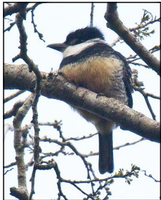
Buff-bellied Puffbird