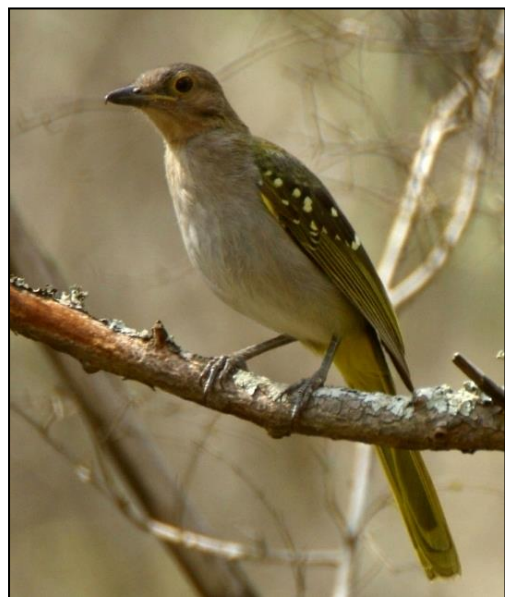
Eastern Nicator by Gareth Robbins

With a hot day expected we aimed to leave very early in the morning as we had quite a bit of a drive to get to Mkhuze. Before we left the lodge, we had great views of an Eastern Nicator sitting and calling from a tree above my room. Further along we had some great sightings of Crested Guineafowl, Grey Waxbill, Bronze and Red-backed Manikins. Once we arrived, we had seen the full effects of the drought as there was no ground cover at all. We headed straight for Kumasinga Hide where we had some great viewing of White Rhinos wallowing in the mud, covered in Red-billed Oxpeckers. There was also one Warthog that was completely covered in Red-billed Oxpeckers too. One of the main reasons to visit this hide was to look for the Pink-throated Twinspot. After several failed attempts we decided to have some breakfast. Just before we sat down for breakfast a Golden-tailed Woodpecker called and after a bit of searching everyone managed to enjoy a good sighting of the bird and, at the same time, we