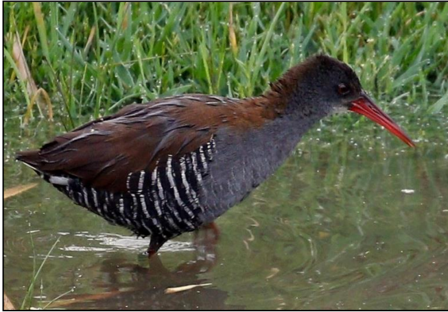
African Rail