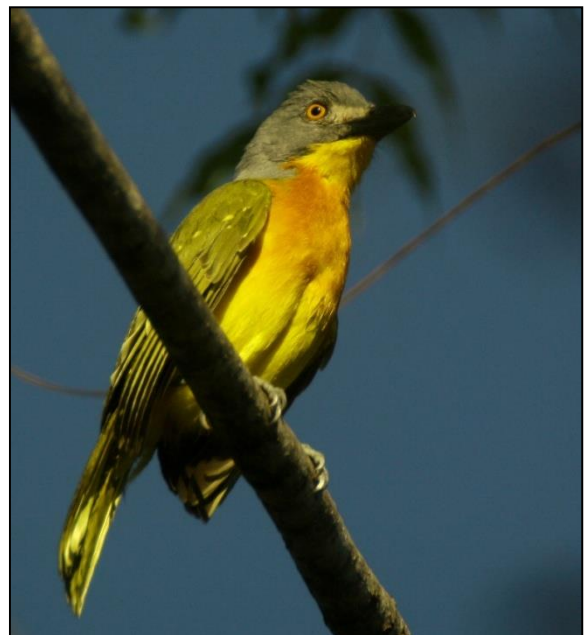
Grey-headed Bushshrike by Gareth Robbins

Today we left Satara Rest Camp fairly early and made our way in the direction of Skukuza Rest Camp. On our way we saw Red-crested Korhaan, Knob-billed Ducks, Red-necked Spurfowl, Crested