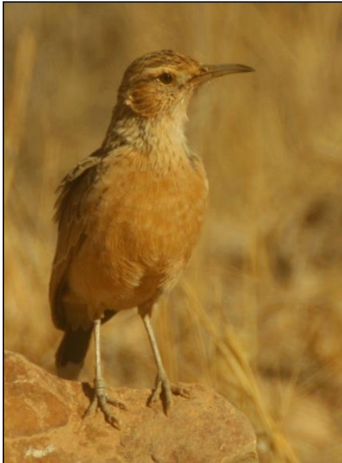
Spike-heeled Lark by Gareth Robbins

Common Greenshank, Wood Sandpiper, Common Sandpiper, Little Stints and a Levallant's Cisticola which also grabbed our attention as it called and landed near the group. We then continued our drive to the delightful little town of Wakkerstroom.