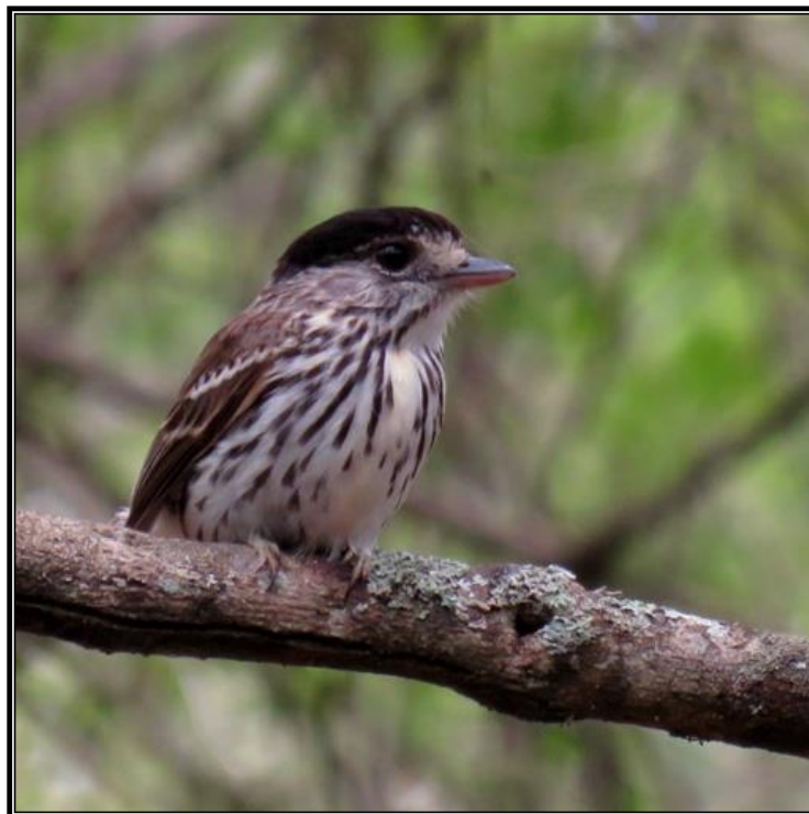
African Broadbill