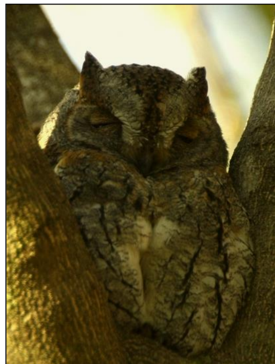
African Scops Owl by Gareth Robbins

Our first morning was an early morning as high temperatures were expected. We left Satara Rest Camp at precisely 4:30am. Our main target focus was looking for nocturnal animals and some of the more shy animals. One of our first sightings and probably one of the most memorable ones was of a male white rhino trying to mate with a female white rhino. She also had a calf present which can be very dangerous for the calf. The next moment the male rhino charged and pushed the female with his horn and then proceeded to charge towards the young rhino calf. For a large animal they make very strange noises which sounds like a pig squealing.