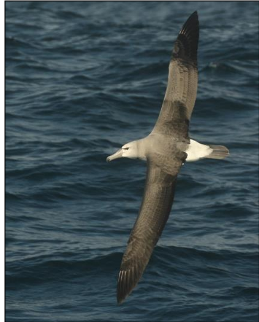
Shy Albatross by Gareth Robbins

The following day was the day for the pelagic and we were expecting some rough seas on the trip. While we were waiting for the boat to arrive we had a lovely look at a Crowned Cormorant. Our guide for the pelagic, Alvin, gave us the safety briefing and warned us that it was going to be a very bumpy ride. As we left Simon's Town everybody had high hopes as we saw a couple of Bank Cormorants, Kelp Gulls and Greater Crested Terns. We then passed the area known as the washing machine and we really experienced how rough the ocean can be. We slowly started to see a few different birds such as Sooty Shearwaters, Arctic Terns, Cory's Shearwaters, White-chinned Petrels and eventually we saw our first Shy Albatross. We never managed to find a trawler but we did manage to find a long-liner which attracted a few birds such as Long-tailed Jaeger, Wilson's and European Storm Petrels, Northern and Southern Giant Petrels, Brown Skua, Black-browed and Atlantic Yellow-nosed Albatrosses, Great-winged Petrel and a Great Shearwater. After a successful day we headed back to Simon's Town and we walked around Boulders Beach where we managed to enjoy some lovely views of African Penguins.