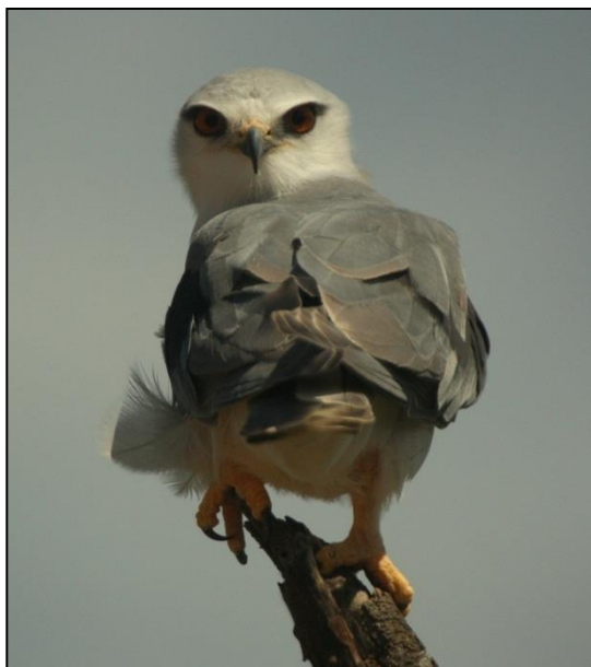
Black-winged Kite by Gareth Robbins

After surviving the pelagic we were up and ready for big day ahead. Our first target bird was the Cape Rockjumper which was about a ninety minute drive from Simon's Town so we took a drive around False Bay to Rooi Els where we were going to look for the Rockjumper. Once we arrived we were greeted by Cape Siskins, Orange-breasted Sunbird, Cape Bulbul, Yellow Bishop, Cape Grassbird,