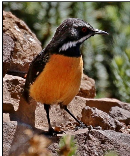
Drakensberg Rockjumper by Sami Zeitouni

We met our guides, Stuart and Aldo at our accommodation and we left in two 4x4 vehicle which are a necessity in ascending Sani Pass. We stopped at a small wetland where we had some good looks at African Yellow Warbler and African Reed Warbler. We then visited a large dam where we saw White-backed Ducks and a Baillon's Crake which was a real highlight for most of us. We then continued along the road where we saw a female Cape Rock Thrush and a Brown-backed Honeyguide. We then enjoyed some breakfast and had some views of Gurney's Sugarbird, Malachite Sunbird