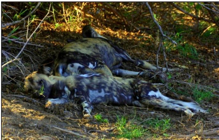
African Wild Dogs by Gareth Robbins

After three nights and two full days in lovely Kruger National Park, we still had one very important area to cover and that was to do some birding around the Skukuza Camp's grounds. We met at 5am and walked around the camp in a clockwise direction. This walk proved to be very productive having seen Purple-crested Turaco, White-browed Robin-Chat, Bearded Scrub-Robin, African Green Pigeons, Green-backed Camaroptera, Red-chested Cuckoo, Orange-breasted Bushshrike, Cape Robin-Chat, Scarlet-chested Sunbird. We then said good bye to Skukuza and headed towards Malelane Gate. On our way out we had a long distance view of few lions resting in the shade, under a large tree. Once we had exited the magical Kruger National Park, we were in for quite a surprise. As we crossed the bridge just outside the park, we stopped to get out and have a look at some Nile Crocodiles feeding on a dead Hippopotamus in the large river below. In all my time viewing crocodiles I had never seen them as active as this. At the same time we had some good looks at Little Egret, Goliath Heron and a Giant Kingfisher. We then made our way back towards Nelspruit and, as we reached the town, it was 43 degrees centigrade. We left the Lowveld