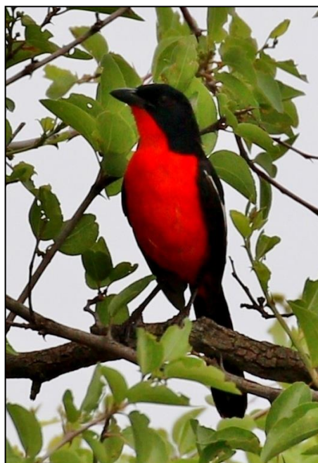
Crimson-breasted Shrike by Sami

Saturday was the official start of the tour and everybody was very excited to head out for the first day's birding. Before light we were already on our way and, just after Pretoria, we stopped at a fuel station for those needing their caffeine fix for the morning. Fortunately there was a small dam at the fuel station where we managed to see Palm Swifts, Southern Masked Weavers, House Sparrows and Southern Red Bishops. We then continued towards Zaagkuilsdrift Road. Once arriving at the start of the road we were immediately welcomed by many birds in the fields such as White Storks, Common Buzzards, Amur Falcons, Lesser Kestrels, Abdim's Stork and a Rock Kestrel. We then continued further down the road where we managed to find the Northern Black Korhaan as well as Black-chested Prinias and Desert Cisticola. We deviated a little bit further down the road where we found our first bird party of the tour where we managed to see Diederik Cuckoo, African