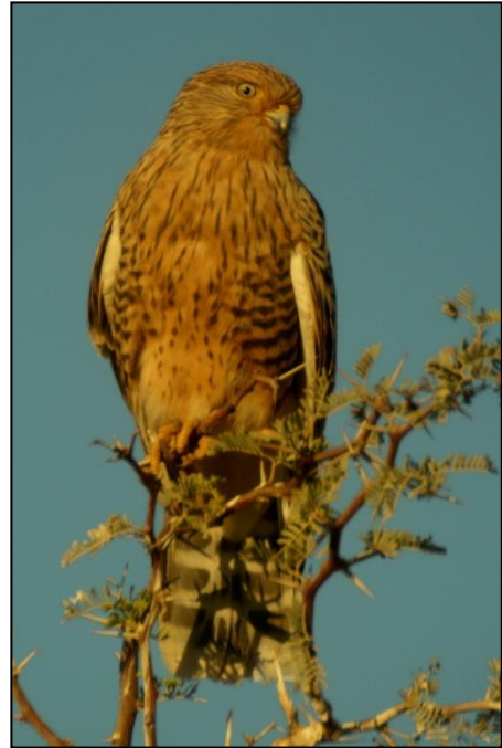
Greater Kestrel

managed to get a few good looks at a few Lesser Flamingos. We took a bit of a drive and we managed to have a decent look at a female Dusky Sunbird which completed the list of Sunbirds to see on the tour. We then left Veldrif and headed to Ceres.