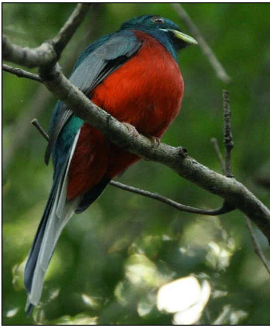
Narina Trogon by Gareth Robbins

trail meaning “Purple Crested Turaco” and once again noticed the impact of the drought with the majority of the trees being wilted with very limited birdlife. We eventually found a Fig Tree which was supporting a good diversity of bird life such as Black-bellied Starlings, White-eared Barbets, Yellow-rumped Tinkerbirds and Yellow-bellied Greenbuls. We could also hear Livingstone’s Turacos calling around the forest but we needed to continue walking to get closer to them. We eventually managed to have a good view of one at a small campsite and, at the same time, we managed to see a Brown-scrub Robin and a Red-capped Robin-Chat. After a well-deserved day of excellent birding we had a wonderful dinner at one of the local seafood restaurants. After dinner we took a drive around the town, successfully managing to locate two Thick-tailed Greater Galagos, a few hippos and a beautiful African Wood Owl.