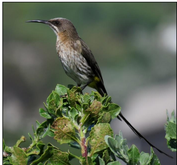
Cape Sugarbird by Gareth Robbins

and a Long-billed Pipit. We drove on up to the South African Border Post where we saw Ground Woodpecker, African Firefinch, Fan-tailed Grassbird and Cape Grassbird on the way. At the border post we had one good look at a Greater Double-collared Sunbird sitting high up in a tree. We then started to make our way up the pass where we enjoyed some excellent views of Drakensberg Rockjumper, Karoo Prinias Barrat's Warbler and Drakensberg Siskins. Once we entered the Lesotho we were on the search for a few different birds and managed to see Sickle-winged Chat, Fairy Flycatcher, Yellow Canary and the Mountain Pipit. As we made our way to