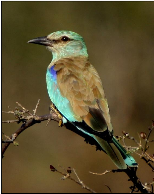
European Roller by Gareth Robbins

drive back along the Zaagkuilsdrift Road and we also managed to see Red-billed Firefinches, Green-winged Pytilias and a Pearl-spotted Owlet. We managed to see well over 100 species of birds which was a great start to the tour. Thankfully the weather was on our side and it was much cooler than usual which helped with some very good birding throughout the day.