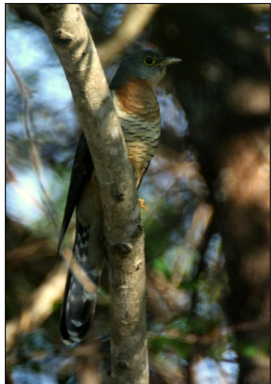
Red-chested Cuckoo by Gareth Robbins