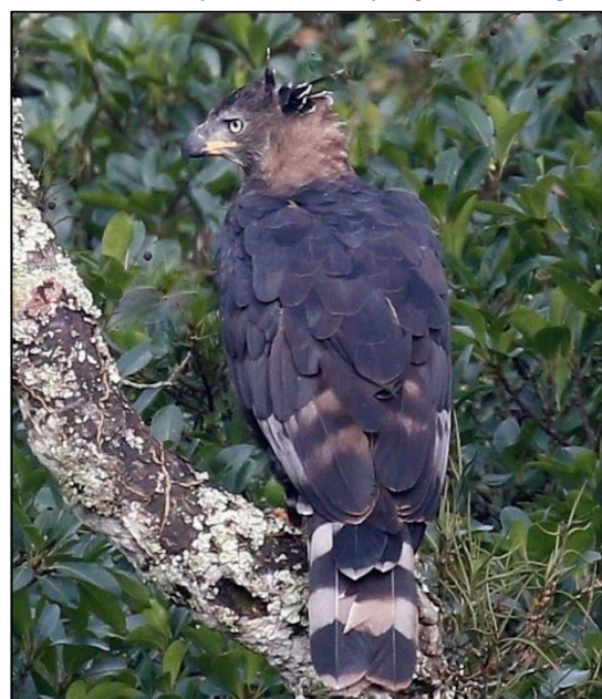
Crowned Eagle

With a very busy schedule awaiting us for the day we left St Lucia before sunrise. Our first main target was the Palm-nut Vulture in Mtunzini. When we arrived we immediately saw one flying to our right