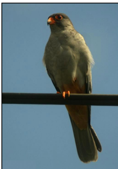
Amur Falcon by Gareth Robbins

Further down the road offered us some different birding where the vegetation had turned into a dry acacia woodland habitat where we had some great views of the