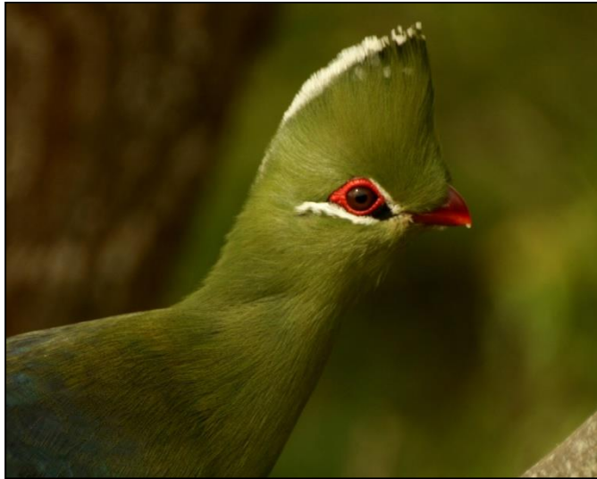
Knysna Turaco by Gareth Robbins

around 3000m we stopped to look for some Bearded Vultures. We managed a view of two Bearded Vultures as they flew over us and disappeared behind the mountain. We then stopped for lunch where we saw a couple of Cape Vultures and a Grey Tit. On our way back we managed to view an African Rock Pipit and at the same time we had a look two Bearded Vultures perched along the rocky edge of a mountain. Our successful day was celebrated at the world's highest pub. On our way down we also had a good look at some African Firefinches.