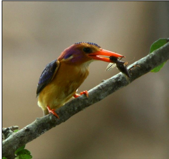
African Pygmy Kingfisher by Gareth Robbins

managed to get some good looks at a Yellow-throated Petronia. After breakfast we continued our search for the Twinspots and luckily enough they were making their way towards us. We watched the birds for a while until they moved off into an area we could not access. After all the excitement we took a drive down to Nsumo Pan. Here, we could also see the extent of the drought as we watched a large Elephant Bull make its way along a very long muddy dam until it finally reached some drinkable water. There were also a few Buffalo and Wildebeest carcasses present and apart from the White-backed Vultures we managed to get a great look at a Lappet-faced Vulture through the spotting scope. Other birds in the area included African Openbill, Pied Avocet, Pink-backed and Great White Pelicans, Spur-winged Goose, Little Stint and Curlew Sandpipers. Our next stop was the Kumahlahla Hide, where we had some fantastic views of an African Pygmy Kingfisher which posed beautifully for us all. We also had one brief sightings of a Lesser Masked Weaver. We then had some lunch at the Mantuma Rest Camp and had some lovely sightings of Trumpeter Hornbills and two Broad-billed Rollers. After a successful day we drove back to our lodge and after a short break we went out birding again and whilst enjoying birds that we had already seen before.