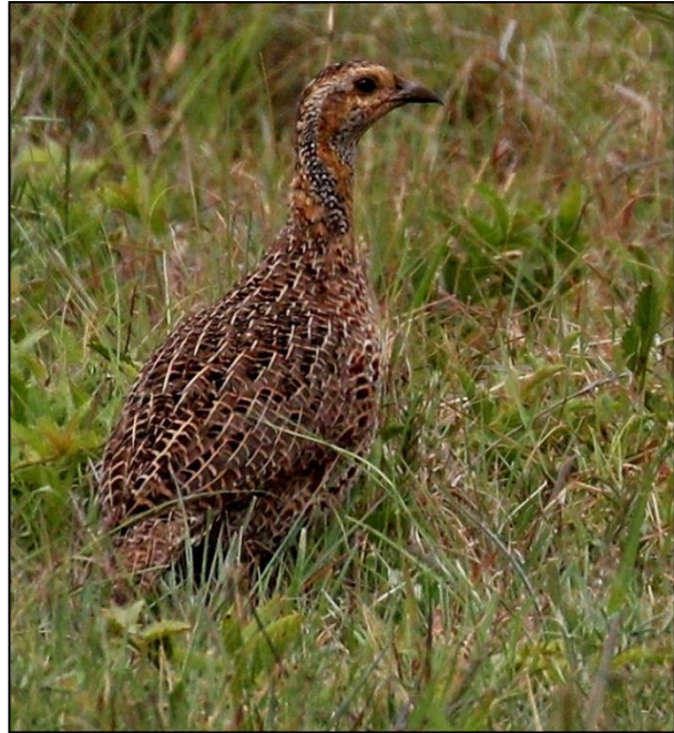
Grey-winged Francolin

Francolin, Water Thick-knee, Marabou and Saddle-billed Storks, Jacobin Cuckoo, Red-billed Buffalo Weavers, African Pied Wagtails, Golden-breasted Bunting and Yellow-fronted Canary. Once we arrived at Skukuza Rest Camp we went for a delicious buffet breakfast, and directly after breakfast we were greeted by a lovely close view of a Purple-crested Turaco. We then made our way to the nursery where we saw Collared Sunbirds, a beautiful pair of Broadbill Rollers and a Black Crake. We then headed towards Paul Kruger Gate where we managed to get a long distance view of Leopard in a tree. We then made our way back to Skukuza camp to check in. In the late afternoon we went out for a drive and one of the main highlights was spotting a small pack of Wild Dogs very close to the road.