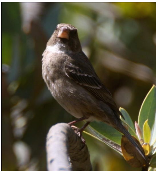
Protea Canary by Gareth Robbins

We stopped to enjoy the breath-taking views that our guesthouse had on offer and had a lovely cooked breakfast before we departed for Ceres. We took a scenic drive past Cape Town and stopped in Table View for some panoramic photos to be taken of Table Mountain and Table Bay. We then pushed onto West Coast National Park seeing many Black-winged Kites, Common Buzzards and Yellow-billed Kites along the way. After entering the park we managed to see White-backed Mousebirds, Karoo Scrub Robins and a Bokmakieirie fly past the tour vehicle but disappeared in the scrub. We then drove to the Geelbek Restaurant where we walked around and then visited the Geelbek hide and saw numerous waders, but unfortunately no new ones. We did manage to see a Pearl-breasted Swallow once, leaving the hide. From here we took a drive up to Seeberg where we were fortunate enough to have a good look at a male Southern Black Korhaan. We decided that Lesser Flamingos would be great to see so we left the West Coast National Park and headed for Veldrif which was another half an hour drive along the R27. Once we arrived we were greeted by large numbers of Flamingos and after a bit of searching we