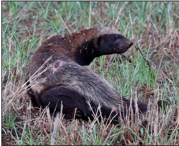
Honey Badger by Sami Zeitouni

We also had some lovely views of Honey Badger too. On the bird side we enjoyed regular views of Lesser Grey-backed and Red-backed Shrike as well as Purple Roller, Burchell's Coucal, White-backed Vultures, Common Ostrich, Lappet-faced Vulture, and Brown Snake Eagle, Lilac-breasted, Purple and European Rollers, Southern Black Tit, Chestnut-backed Sparrowlarks and a Diederik Cuckoo. As we neared Olifants, we stopped on the bridge crossing the Olifants River where we were able to get out and stretch our legs. From the bridge we saw Striated Heron, Woolly-necked Stork, Yellow-billed Kite, Yellow-billed Stork, Wood Sandpiper,