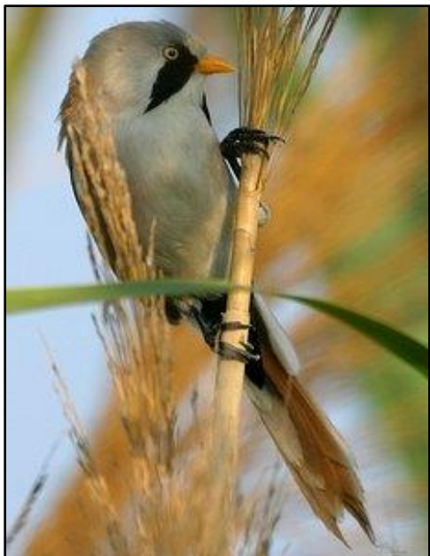
Bearded Reedling by Niels Poul

Day 1: Arrival in Minsk. Upon arriving in the city of Minsk, you will be met and transferred to a comfortable hotel in the city. We will meet up for a welcome dinner, with time to talk through some of the exciting adventures to come over the next week and a half.