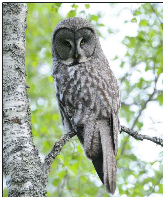
Great Grey Owl by Adam Kovacs

Day 6: Pripyat National Park to Belowezhskaya Pushcha National Park. We have some more time this morning to bird around Pripyat River for any species we may be missing - or desire better views of - before heading to Belowezhskaya Pushcha National Park this afternoon. En route, we may visit Telehany Forest where we hope to find Great Grey Owl on a