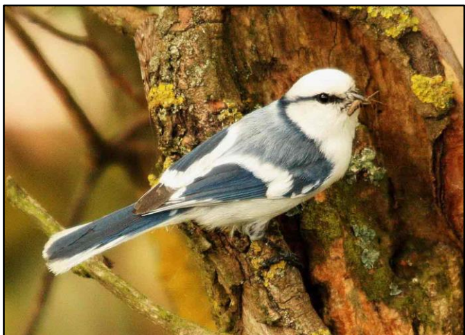
Azure Tit

Belowezhskaya Pushcha National Park. We will walk amidst ancient trees and forests, focusing primarily on woodland species. The fairytale woods here hold Hazel Grouse and both Great Grey and Eurasian Pygmy Owls - and although we need a little luck to see all of them, previous tours have proven to be very successful. Both Eurasian and Short-toed Treecreepers occur here, giving us a chance to study the minor physical differences between them. We may chance across the gorgeous Brambling, with males sporting their jet black caps, while Common Redstart, European Serin, and Hawfinch will compete for our attention. We also have improved chances for many of the numerous woodpeckers should we be missing any, as these forests hold every species of known European woodpecker! We have further chances for Red-breasted and Collared Flycatchers, European Crested Tit, Icterine Warbler and Red Crossbill as they will all be breeding here, while Spotted Nutcracker would be an excellent bonus.