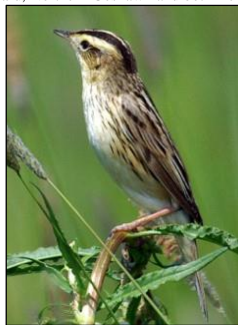
Aquatic Warbler by Gabor Kovacs

We have an entire day to explore the famous