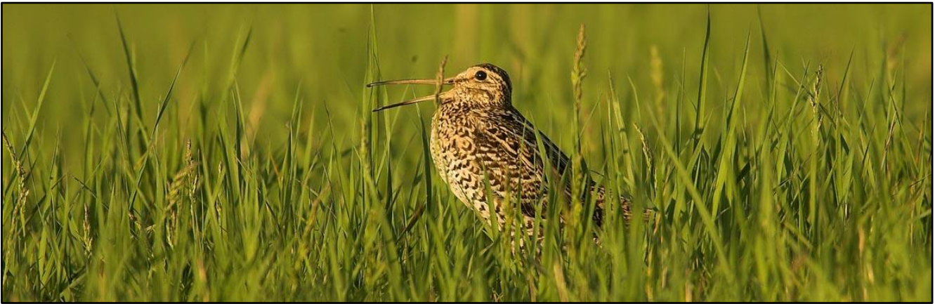
Great Snipe by Peter Csonka

glorious Bluethroat and possibly views of the ever vocal Corn Crake. However, top of our list of desirable species is Europe's rarest songbird - the Aquatic Warbler. It will be late in the afternoon when we can expect to admire their characteristic song flight while admiring the numerous Whinchats and Common Reed Buntings that perch conspicuously on the dead Phragmites reeds. If that were not all, our day's birding here will no doubt turn up a host of other wetland denizens, including Black, Whiskered and White-winged Terns, Great Grey Shrike, Hen and Montagu's Harriers, Eurasian Penduline Tit, Common Rosefinch and Eurasian Golden Oriole. Eurasian Beavers make dams on the surrounding rivers and Eurasian Elk inhabit the woodlands - though we will consider ourselves very lucky to get sightings of these large but shy bovids .