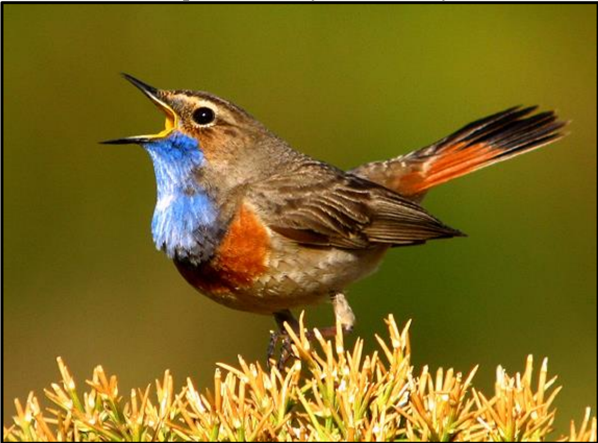
Bluethroat by Ignacio Yufera

Belarus has become one of the prime birding destinations in all of Europe. Bordered by a number of modern European countries, Belarus has remained hidden from popular view. The variety of birds, that include several highlight species very rarely seen in other parts of Europe, is only one facet of this incredible destination. Small roads allow us access to ancient forests, hundreds of meandering rivers and the biggest