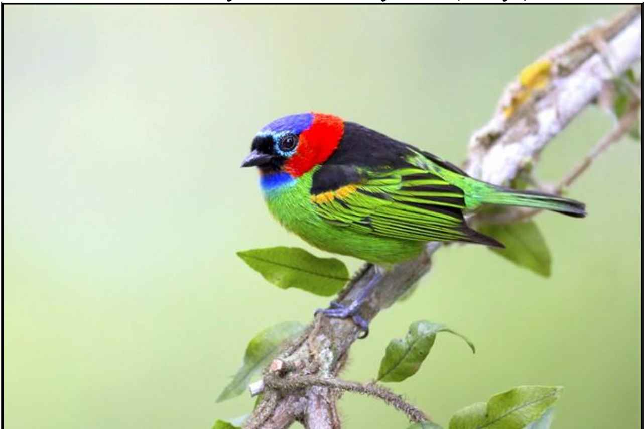
Red-necked Tanager by Dubi Shapiro

14 th January to 21 st January 2024 (8 days)