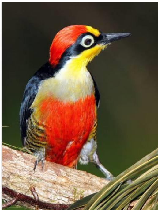
Yellow-fronted Woodpecker by Adam Riley

Day 6: Cedae & Theodoro Trail. This morning we drive for just over half an hour to reach the start of the Cedae Trail. We will spend much of the morning birding this great trail with an immense number of new species possible, including Plain Parakeet, Saw-billed Hermit, Black-throated Trogon,