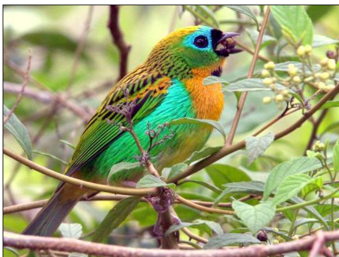
Brassy-breasted Tanager by Adam Riley

Day 3: Lodge grounds + Blue Circular & Orchid Garden Trail. Today we will spend a full day in the Lodge grounds walking the Blue Circular Trail and the Orchid Garden Trail. These two trails offer fantastic birding through primary and secondary forest as well as native bamboo, giving us the