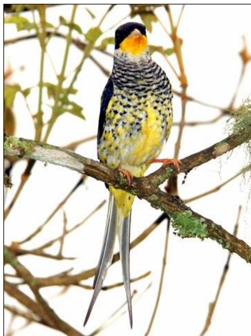
Swallow-tailed Cotinga by Adam Riley

afield, taking a packed lunch along with you. After a short drive to access the higher elevations you will be walking a trail at an altitude of approximately 1 600 metres. As we gain altitude we will see a change in habitat, small stunted trees surrounded by bamboo and other low vegetation provide the first areas in which we hope to see Bay-chested Warbling Finch, Diademed Tanager, Blue-billed Black Tyrant and Rufous-tailed Antbird. Flowering plants could reveal the recently split Green-crowned Plovercrest, while other sought-after specialities are the appropriately named Giant Antshrike, Serra do Mar Tyrant-Manakin and the outrageously patterned Swallow-tailed Cotinga, to name but a few. Tanagers are also well represented here and include the eye-searing Brazilian, Azure-shouldered, Fawn-breasted and vibrant Chestnut-headed Tanager.