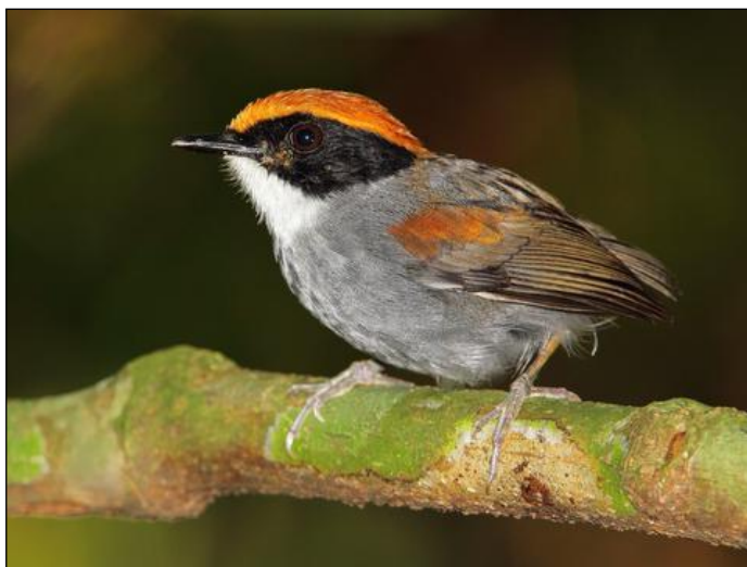
Black-cheeked Gnateater by Adam Riley

Brazil, the endemic Three-toed Jacamar. Birding along the way you pass through a variety of habitats that can produce up to a 100 species for the day! Raptors are often abundant in the more open habitats and might include Plumbeous Kite, Bat and Laughing Falcons and Yellow-headed Caracara, plus the low flying Lesser Yellow-headed Vulture. If very lucky, a Red-legged Seriema may be seen sauntering across the grass. Blue-winged Macaw and White-eyed Parakeet can be observed perched on the treetops, while Striped Cuckoo are often heard before they are seen. The open grasslands and wetland edges can produce Long-tailed and Streamer-tailed Tyrants, Black-capped Donacobius, White-rumped and Tawny-headed Swallows, Wattled Jacana and Blackish Rail.