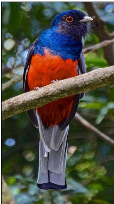
Surucua Trogon by Clayton Burne

Day 4: Wetlands excursion & lowland forest. Today you will visit a local wetland reserve called Reserva Ecologica de Guapi Acu. Established in 2002, this wetland restoration project has been successful in attracting an abundance of overwintering and breeding species. Some of these that should be seen here include Brazilian Teal, the furtive Masked Duck, Pied-billed Grebe, Whistling and Capped Herons, Grey-headed Kite, the stately Savanna Hawk, and the monotypic Limpkin. Amazon and Ringed Kingfishers are often quite conspicuous, while a little searching often yields a resident Green Kingfisher as well. Scanning through the reedbeds allows us the chance to find Yellow-chinned Spinetail, White-headed Marsh Tyrant and Chestnut-capped Blackbird.