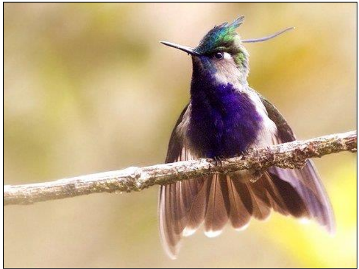
Green-crowned Plovercrest by Dubi Shapiro

Day 1: Rio de Janeiro to our accommodation. After arriving in Rio de Janeiro you will be met by your local leader and transferred to your accommodation for a 7-night stay. Passing the coastline, you might see your first Neotropic Cormorant, Brown Booby, Magnificent Frigatebird or Kelp Gull. The lodge is located in the 57 000 hectare Tres Picos State Park and the gardens are filled with birds attracted to the variety of flowers and numerous feeders.