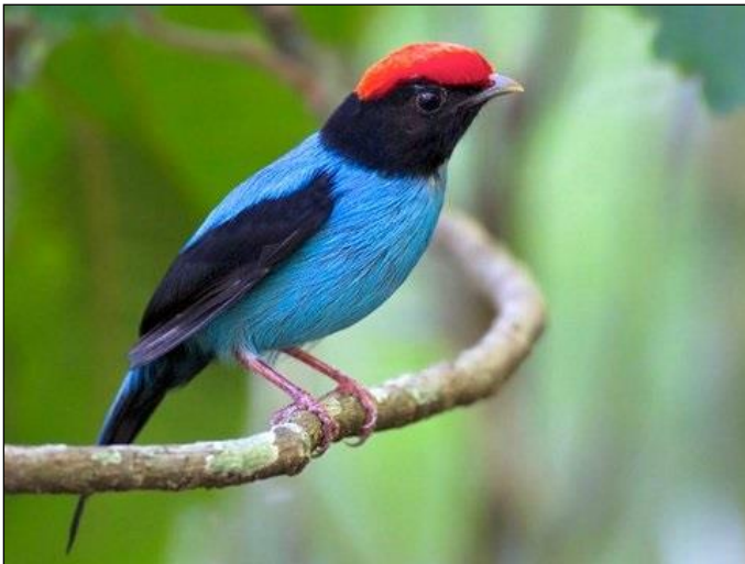
Blue Manakin

The hummingbird feeders are always buzzing with activity and include gems such as Black Jacobin, White-throated Hummingbird and Violet-capped Woodnymph. Maroon-bellied Parakeets and Scaly-headed Parrots might give themselves away with a raucous call flying overhead, Brazilian Antthrush, Ochre-rumped and Bertoni's Antbirds may be seen skulking in the undergrowth, and Spot-billed Toucanets could be observed from the trees around the lodge, whilst during the breeding season Bare-throated Bellbirds can be heard and seen clanging away throughout the day!