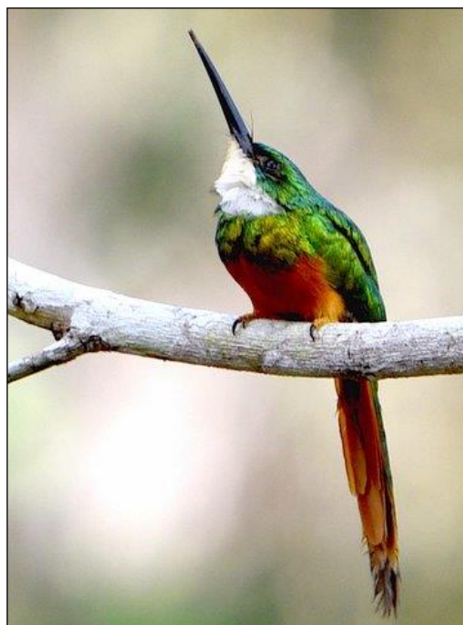
Rufous-tailed Jacamar by Dennis Braddy

Within the lodge grounds, we are fortunate enough to have Long-trained Nightjars, Pauraque, Short-tailed Nighthawk, Tropical Screech Owl, Rusty-barred Owl, Striped Owl and various other night birds yet to be discovered! During the course of the week, we will go out searching for various species on 2 or 3 nights.