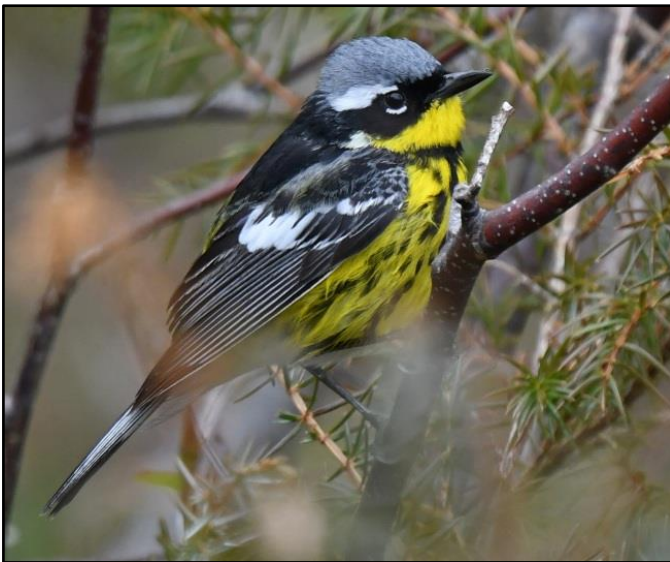
Magnolia Warbler

In the evening we will cruise some roads and visit wetlands in search of crepuscular birds such as Yellow Rail (can be common!), Sora, American Bittern, Nelson's and LeConte's Sparrows, and at dusk for owls