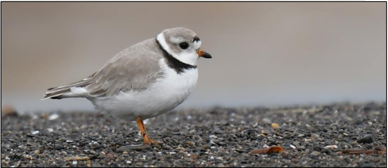
Piping Plover by Lev Frid

activity is lower, we will search for a myriad shorebirds and waterbirds that use Cold Lake as a migratory stopover. These may include Stilt and White-rumped Sandpipers, Long-billed Dowitcher, American Avocet, Hudsonian Godwit and others. Piping Plover breeds nearby and we should get great views of this imperiled shorebird. Colonial waterbirds are abundant around Cold Lake and we should see impressive numbers of Franklin's Gull, American White Pelican and Western Grebe.