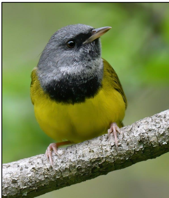
Mourning Warbler

Day 1 - Arrival in Edmonton. After arriving in Edmonton, we will meet up this evening for a welcome dinner and talk over our plans for the forthcoming tour of this hidden birding gem.