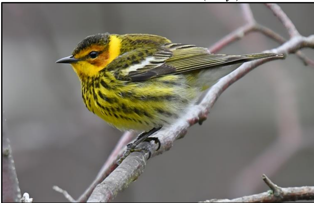
Cape May Warbler by Lev Frid

Tucked away in northeast Alberta is a hidden gem known as Cold Lake. Here, the woods host 23 breeding warbler species, including such stunners as Connecticut, Blackburnian, Cape May, Magnolia, Chestnut-sided, Bay-breasted and Canada. No "luck of the draw" birding here - almost all of these species are breeding residents that can be found every single day. Sharing the woodlands and marshes with the warblers are such mouth-watering northern specialties as Yellow Rail, Nelson's and LeConte's Sparrows, Spruce Grouse, Boreal Chickadee, and Canada Jay. Here is your chance to observe the breeding behaviours of your favourite migrant species - watch Bonaparte's Gulls nesting in trees and hear Common Loons give their haunting calls.