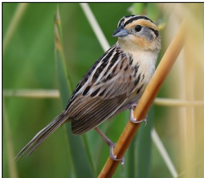
LeConte's Sparrow

Besides the warblers, a variety of vireos, thrushes and others add their songs to the chorus. Anywhere in the Cold Lake area can be good for any number of species, and there are several places to check. Boreal specialties such as Spruce Grouse, Boreal Chickadee, Canada Jay, and Black-backed and American Three-toed Woodpecker are all on our target list as well. In the afternoon, when songbird