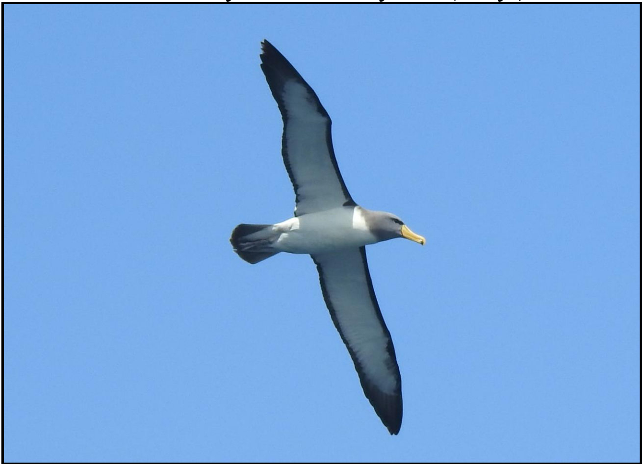
Chatham Albatross by Erik Forsyth

25 th January to 28 th January 2023 (4 days)