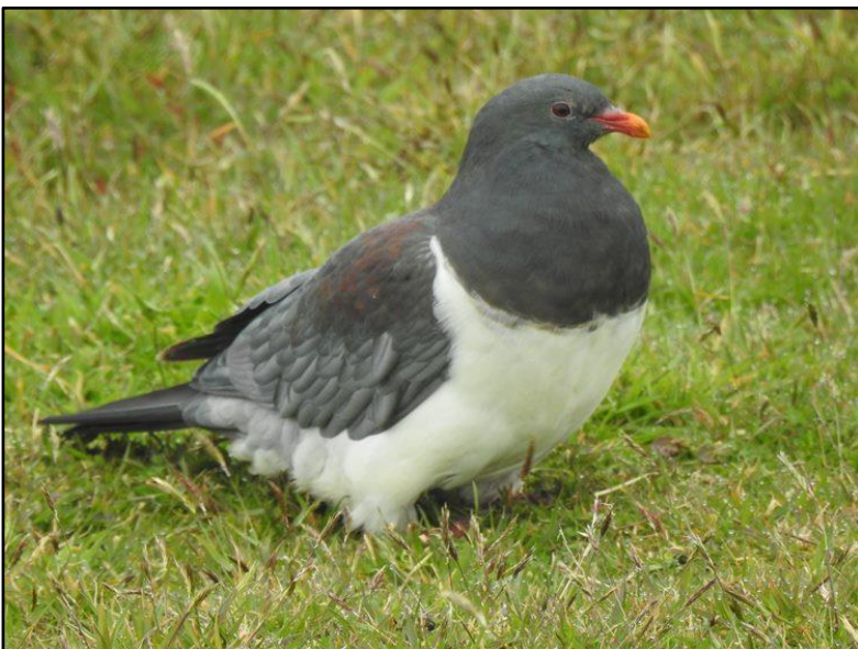
Chatham Pigeon by Erik Forsyth

Day 4: Chatham Island to Christchurch. This morning we transfer to the airport and catch our flight to Christchurch, where the tour will end.