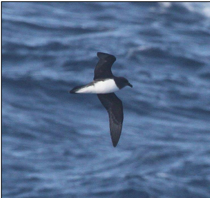
Magenta Petrel

for the highly endangered Shore (Plover) Dotterel, with an estimated world population of around 250 birds! While here we will also be on the lookout for the scarce Chatham (Island) Parakeet and Tomtit. Heading out towards Pyramid Island we should see our first of many albatross species, including Northern Royal and Southern (Royal), Salvin's, Buller's, Black-browed, Campbell and Shy (White-capped), Northern Giant Petrels, Cape Petrels, Broad-billed and Fairy Prions, Sooty Shearwater, Brown Skua, White-faced and Grey-backed Storm Petrels and Little Blue Penguin.