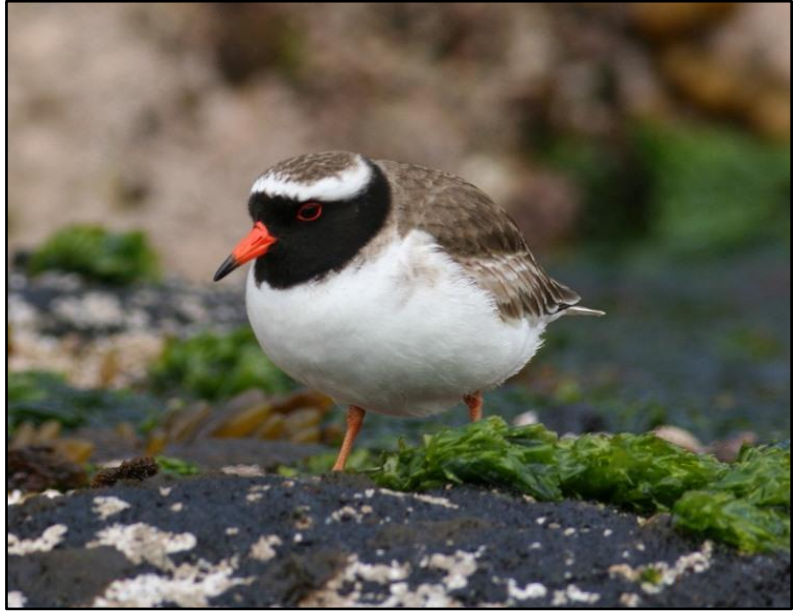
Shore Dotterel by John Ryan

birds. With a huge slice of luck, we may find the highly endangered Chatham Petrel (+/- 1000 birds) or the critically endangered Magenta Petrel, or Taiko as it is known locally, with an estimated population of just +/- 150 birds, making it one of the rarest seabirds in the world. Both the latter species mentioned breed in forested valleys on the mainland, where they are protected and monitored. These small populations are slowly increasing due to intense predator control.