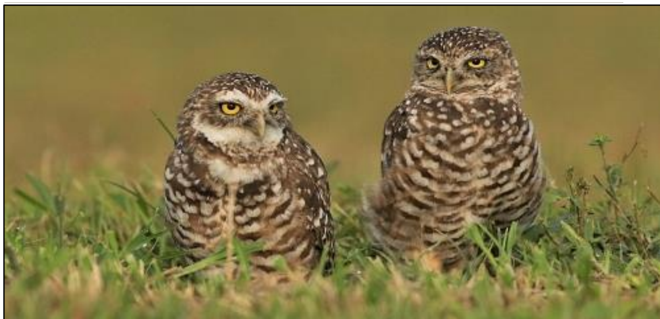
Burrowing Owls by Carlos Sanchez

also search for other regional specialties such as Brown-headed Nuthatch, Northern Bobwhite, and Pine Warbler. Afterwards, depending on the tides, we visit sites along the coast to watch shorebirds – birds such as Reddish Egret, Marbled Godwit, Red Knot, Black Skimmer, and more.