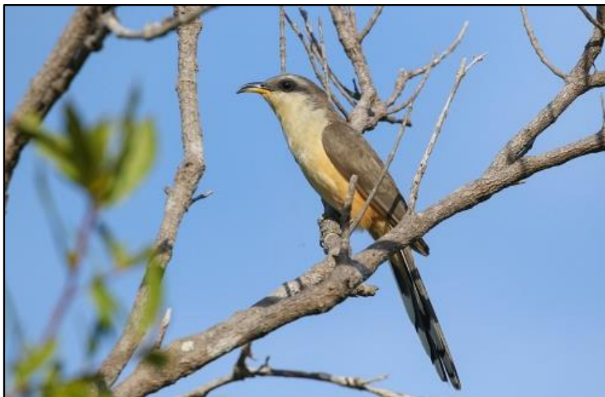
Mangrove Cuckoo by Carlos Sanchez

Day 3: Everglade’s National Park. Published in 1947, Marjory Stoneman Douglas’s The Everglades: River of Grass highlighted the uniqueness of the Everglades. Lying at the southern tip of the state, the Everglades is a vast subtropical sawgrass prairie broken only by cypress domes, tropical hardwood hammocks, pinelands and mangrove swamps. There is nowhere else in the United States with such a decidedly tropical suite of habitats. We work along the length of the main park road that terminates in Flamingo, exploring and learning about these various habitats. American Crocodile and West Indian Manatee are possible at the marina in Flamingo.