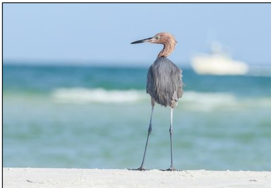
Reddish Egret

Day 6: Babcock Webb WMA. We spend time exploring the pineland savanna at Babcock-Webb WMA in the early morning for pineland specialties, particularly Red-cockaded Woodpecker. We