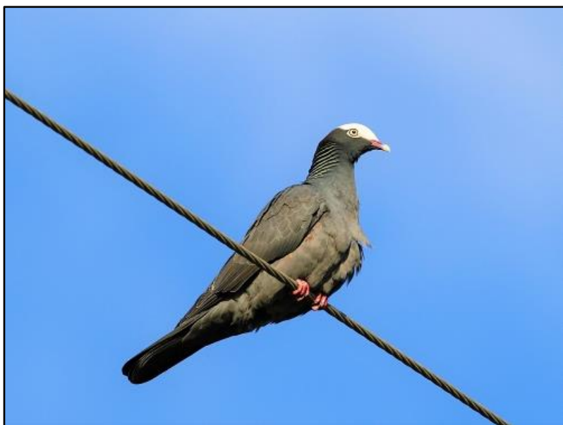
White-crowned Pigeon by Carlos Sanchez

weedy fields in the agricultural outskirts of Miami for a totally different assortment of species, many of which are not usually associated with South Florida, such as White-tailed Kite, Brown-crested Flycatcher, and an eclectic mix of sparrows (Swamp, Grasshopper, Savannah, Clay-colored, and Lincoln's). The diminutive Common Ground Dove can often be seen foraging on the trails, while Indigo and Painted Bunting are often numerous in areas of richer growth.