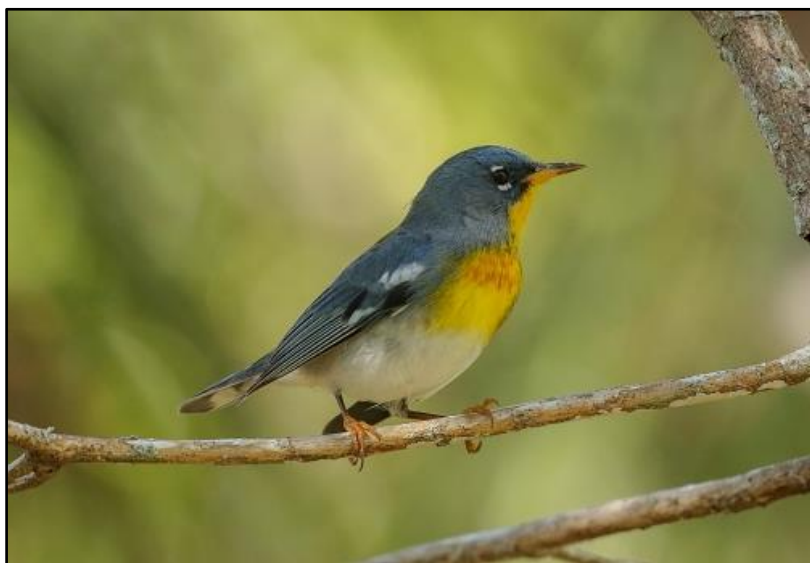
Tropical Parula by Carlos Sanchez

Day 1: Arrive in Miami. After arriving at Miami International Airport, you will transfer you to our nearby hotel for the night.