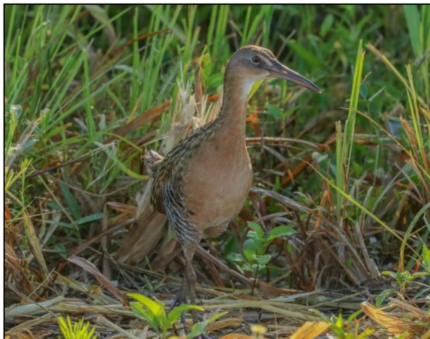
King Rail

Day 7: Fort Myers Beach to Miami. It will be an early start – an early morning walk along San Carlos Point and Fort Myers Beach for an assortment of waders, gulls, terns, and seaducks. We make a special effort to see American Oystercatcher and Snowy Plover this morning, the latter a rare and declining breeding resident that we will not encounter elsewhere.