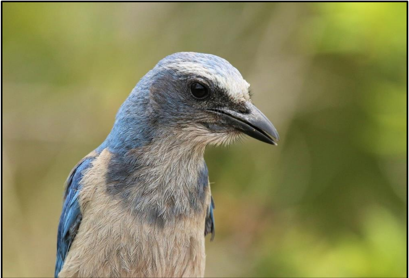
Florida Scrub Jay

10 th December to 17 th December 2023 (8 days)