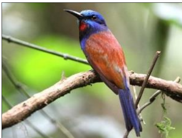
Blue-moustached Bee-eater

The birding is extremely productive here and we have our final opportunity of seeing some of the rarer forest species as well as giving us additional chances of locating more of the Upper Guinea specials.