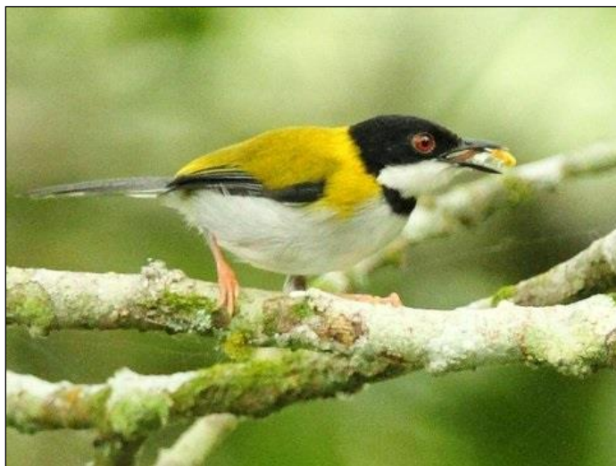
Black-capped Apalis

Hornbills, Grey-headed and Red-tailed Bristlebill's, Rufous-sided Broadbill, Fire-bellied Woodpecker, Yellow-throated and Thick-billed Cuckoos, Forest Wood Hoopoe and perhaps Sharpe's Apalis, whilst Western Wattled Cuckooshrike would be a mega find. Indeed, if our luck is in, we could even bump into Long-tailed or Tree Pangolin. We'll enjoy lunch here, before setting off for Bobiri Butterfly Reserve