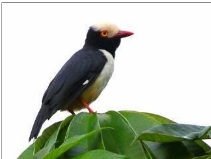
Red-billed Helmetshrike by Adam Riley

providing a unique opportunity for spotting passing birds. Raptor watching is particularly productive and previous trips have produced unbeatable views of the rarely seen Congo Serpent Eagle, Cassin's Hawk-Eagle, Red-thighed Sparrowhawk, Red-necked Buzzard, Palm-nut Vulture, African Harrier-Hawk, African Cuckoo-Hawk and African Hobby. Other birds that we might see include Piping, Black Casqued Wattled, Yellow-casqued Wattled and Brown-cheeked Hornbills, Grey and Red-fronted Parrots, Rosy Bee-eater and mixed flocks of swifts that often include Cassin's and Sabine's Spinetails and, if we are lucky, Black Spinetail. Velvet-mantled Drongo is in constant attendance, as are a wide variety of sunbirds including Fraser's, Little Green, Collared, Olive, the stunning Buff-throated, Olive-bellied, Superb and sought-after Johanna's.