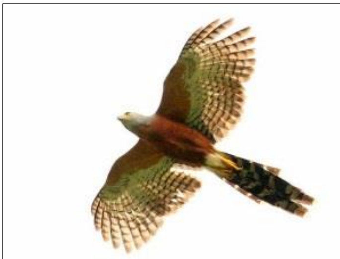
Long-tailed Hawk by David Hoddinott

and is well off the beaten track. Rare species that have been recorded here in the past include the very rare Rufous Fishing Owl, Spot-breasted Ibis and White-crested Tiger Heron. Nsuta Forest will provide further opportunities to see many species that also occur in Kakum National Park in addition to being a good site for various others. These include Congo Serpent Eagle, Red-thighed Sparrowhawk, Bat Hawk, Long-tailed Hawk, scarce Black-collared Lovebird, Yellow-throated and Black Cuckoos, Bristle-nosed Barbet, Black Spinetail, Black Dwarf and Piping Hornbills, Western Nicator, Ussher's Flycatcher and Square-tailed Saw-wing. We will enjoy two days