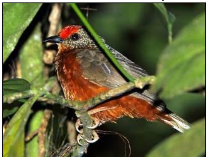
Red-fronted Antpecker

Day 5: Kakum to Sekondi (Shama). Today we leave early for the drive to Shama. On arrival, we will have the opportunity to check-in to our guest house and then venture out to bird in another patch of lowland rainforest at Nsuta Forest. This site is seldom visited as it has only been recently discovered by birders