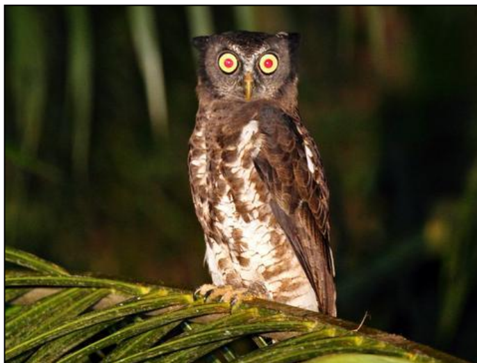
Akum Eagle-Owl

Amongst the many species we hope to see from the walkway are some of West Africa's most sought-after forest jewels. Species that regularly attend the multi-species canopy bird waves include the cotinga-like Blue Cuckooshrike, Violet-backed Hyliota, Sharpe's Apalis (an upper Guinea endemic), Rufous-crowned Eremomela, African Shrike-flycatcher, Lemon-bellied Crombec, Green Hylia, Yellow-mantled and the beautiful Preuss's Weavers, Cassin's Honeybird, Willcocks's and the extremely rare Yellow-footed Honeyguides, White-headed and Forest Wood Hoopoes, Tit-Hylia, Grey Longbill, Red-headed and