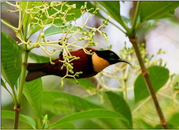
Buff-throated Sunbird by Keith Valentine

Please note that today is a long and fairly tiring day as we will be on our legs for a long time. We will begin early in the morning, taking a packed lunch with us. The total distance up and down is around 12 kilometres while we also do around 3 kilometres on top of the Atewa Range making for around 15 kilometres in total for the day. We will initially pass through the secondary farm bush habitat and then begin the gradual ascent up the mountain. On our way up we will keep an eye open for Western Bronze-naped Pigeon, Little Green Woodpecker, Square-tailed Saw-wing, Black-capped Apalis, Red-cheeked Wattle-eye, Brown and Puvell's Illadopsises,