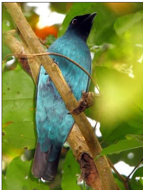
Blue Cuckooshrike by Adam Riley

Day 1: Arrival in Accra. On arrival at Katoka International Airport in Accra, you will be met and transferred through to a comfortable hotel in the city.