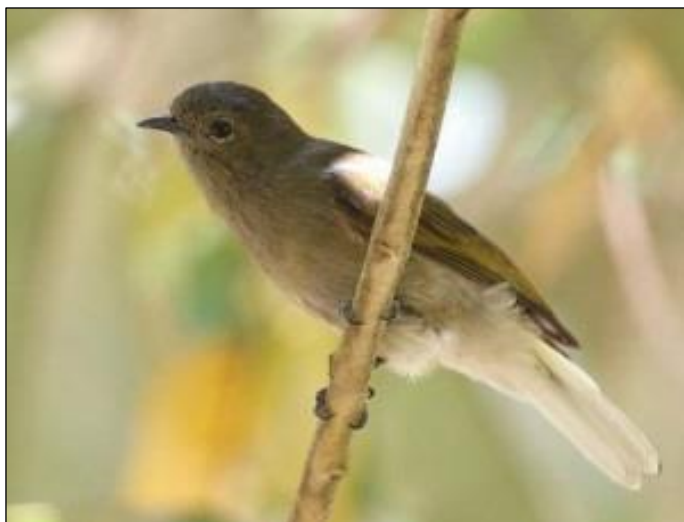
Cassin's Honeybird

Day 9: Ankasa to Kakum. Today we make the return journey to Kakum National Park after some final morning birding at Ankasa. Along the way, we will stop off at a coastal