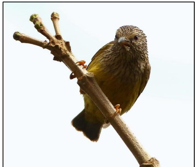
Tit-Hylia by Markus Lilje

Day 14: Atewa to Accra and depart. This morning we should have time to bird the Farm Bush at Atewa. This uniquely West and Central African secondary habitat is usually extremely productive for forest-edge birds and we may be entertained by a number of exciting species such as Black-and-white Shrike-flycatcher, Dusky-blue Flycatcher, Cassin's Honeybird, Black-bellied Seedcracker, Western Bluebill, Marsh Tchagra, Compact Weaver, Black-winged Red Bishop, Orange-cheeked Waxbill, nomadic Magpie and Black-and-white Mannikins, African Hobby and White-spotted Flufftail. In the late morning, we will return to our hotel to freshen up before we depart back to Accra to connect with our international flights home.