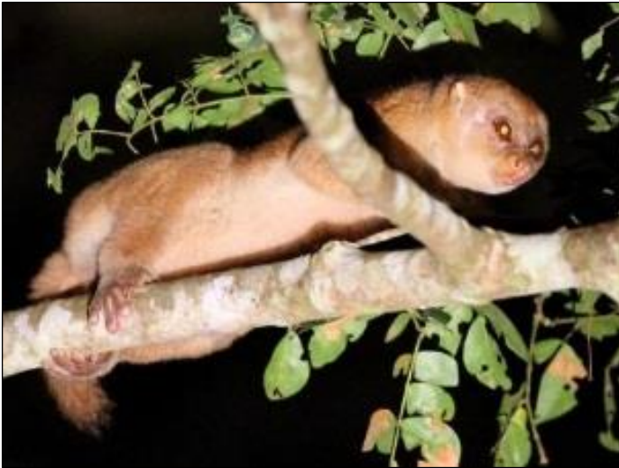
Potto by David Hoddinott

Cameropteras, Green Crombec, Dusky-blue Flycatcher, Black-and-white Shrike-flycatcher, Black-winged Oriole, Splendid, Copper-tailed and Chestnut-winged Starlings and Blue-billed Malimbe