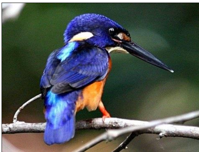
Shining-blue Kingfisher

area of savannah grassland scrub. Species we hope to see here include Pruess's Swallow, Marsh Tchagra, Piping Hornbill, Shining-blue Kingfisher, Wilson's Indigobird, Great-spotted Cuckoo, Yellow-crowned Gonolek, Singing Cisticola, Guinea Turaco, Oriole Warbler, Compact Weaver and, if we are very fortunate, Yellow-winged Pytilia. If unsuccessful earlier, we have a further opportunity to search for Mangrove Sunbird before checking into our hotel.