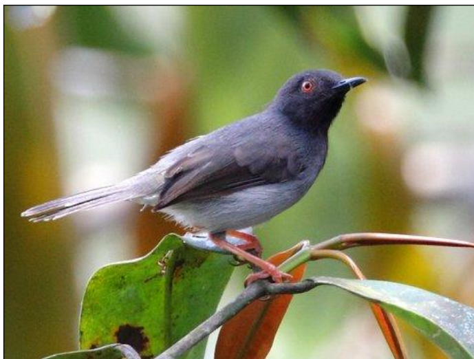
Sharpe's Apalis

birding at this exciting new site and since so few birders have visited this area, there is good potential to find something unusual or rare!