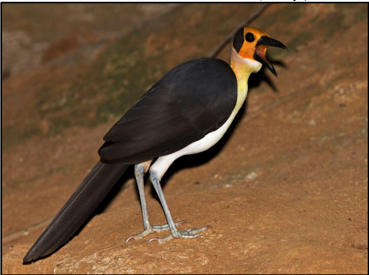
White-necked Rockfowl

24 th October to 6 th November 2022 (14 days)