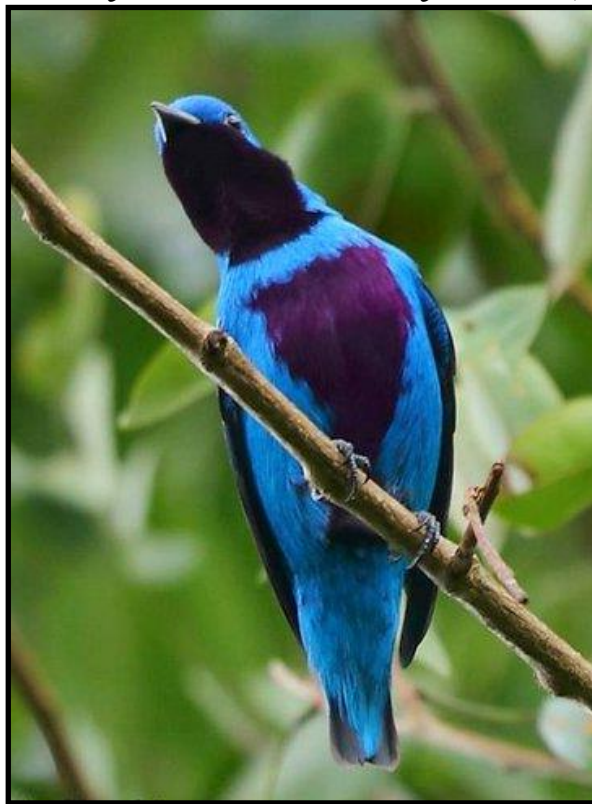
Lovely Cotinga

10 th January to 16 th January 2024 (6 days)