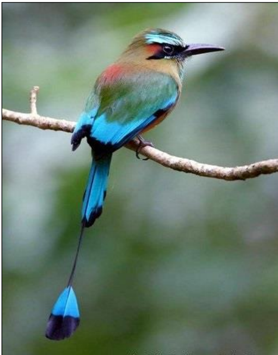
Turquoise-browed Motmot