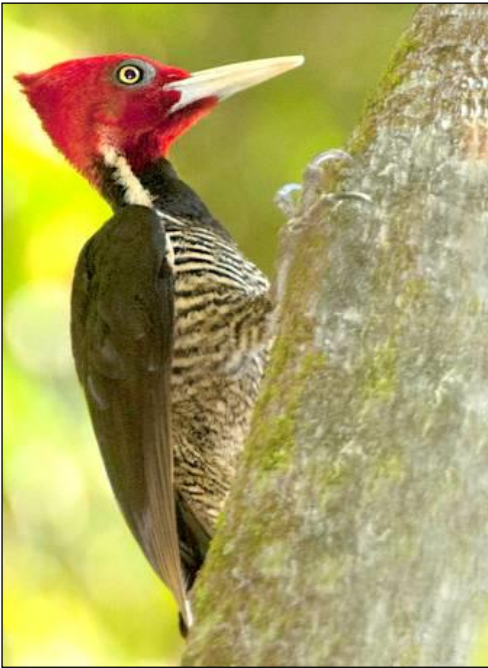
Pale-billed Woodpecker

Breaking for lunch, we will then head off to tackle a few trails leading through primary rainforest in the upper reaches of the reserve. High on our priority list are two difficult species of Motmot, namely Keel-billed and Tody, though we may have secured good looks of the former by this stage. Other interesting species we hope to find include the reticent Tawny-faced Quail, Great and Slaty-breasted Tinamous, Slaty-tailed Trogon and, if we are very fortunate, Grey-headed Piprites. We should also add to our growing mammal list, with noisy troops of Central American Spider Monkeys, in particular, occurring here in good numbers.