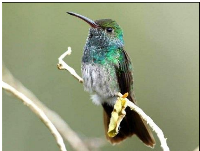
Honduran Emerald by Adam Riley

Day 5: Day trip to Lancetilla Botanical Gardens. Today we will depart early and drive to the lovely Lancetilla Botanic Gardens near the coastal town of Tela. Initially created as an agricultural research centre and experimental station by the United Fruit Company, the property rapidly expanded in size and importance and is now the world's second-largest tropical botanical garden, boasting an exceptional collection of tropical plants from Central America and elsewhere. This includes a substantial selection of orchids and ornamental plants and even a protected area of tropical broad-leaved rainforest. Of course, with all the