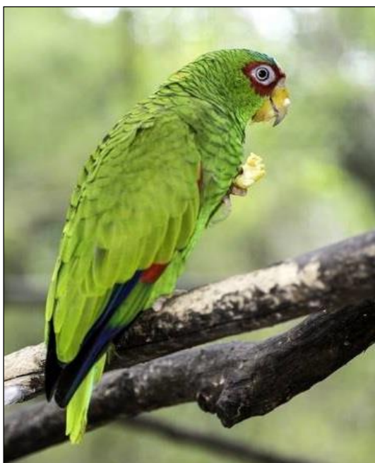
White-fronted Amazon by Owen Deutsch

incredible plants and diversity of ecosystems to be found here, the gardens are a magnet for both resident and migratory birds, and a walk around the manicured grounds here will certainly keep us very busy.