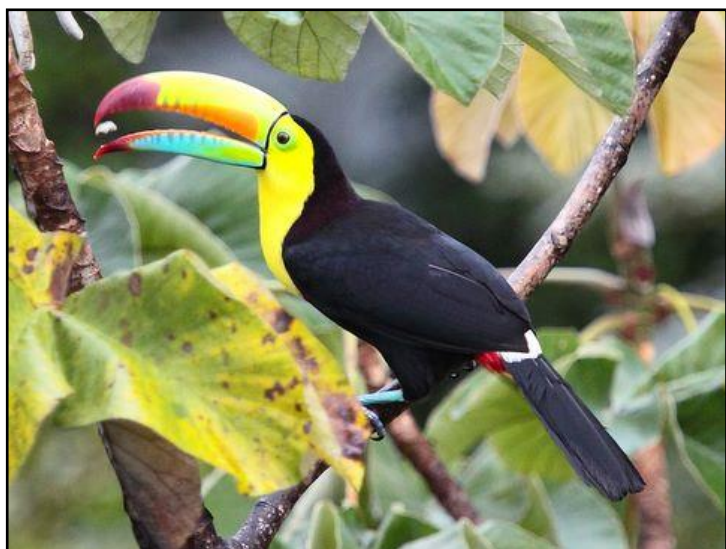
Keel-billed Toucan by Adam Riley

Other species likely in the more open habit of the lower property and also in the lush forested areas include Lesson's and Turquoise-browed Motmots, Pale-billed and Black-cheeked Woodpeckers, Wedge-billed and Cocoa Woodcreepers, Black-headed, Slaty-tailed, Gartered and Collared Trogons, Violet-headed Hummingbird, Purple-crowned Fairy, Mistletoe Tyrannulet, White-breasted Wood Wren, White-throated Thrush, Giant Cowbird, Red-throated Ant Tanager, Olive-backed, Scrub, White-vented and Yellow-throated Euphonias, Variable and Morelet's Seedeaters and an array of overwintering North American migrants including various vireos, warblers, buntings and orioles.