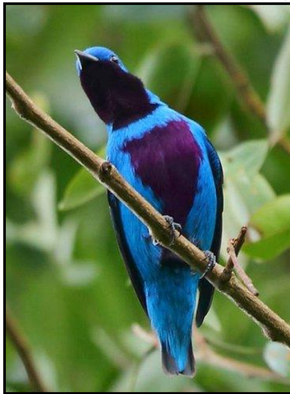
Lovely Cotinga

1 st December to 6 th December 2022 (6 days)