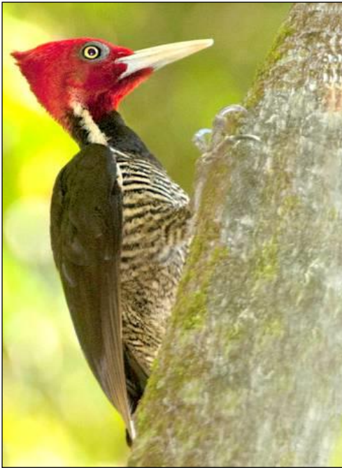
Pale-billed Woodpecker

Breaking for lunch, we will then head off to tackle a few trails leading through primary rainforest in the upper reaches of the reserve. High on our priority list are two difficult species of Motmot, namely Keel-billed and Tody, though we may have secured good looks of the former by this stage. Other interesting species we hope to find include the reticent Tawny-faced Quail, Great and Slaty-breasted Tinamous, Slaty-tailed Trogon and, if we are very fortunate, Grey-headed Piprites. We should also add to our growing mammal list, with noisy troops of Central American Spider Monkeys, in particular, occurring here in good numbers.