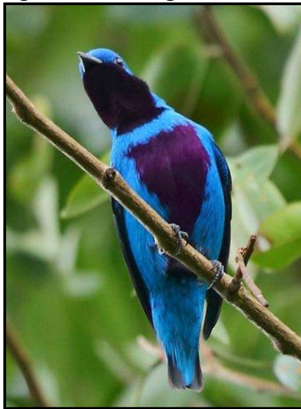
Lovely Cotinga

5 th August to 10 th August 2024 (6 days)