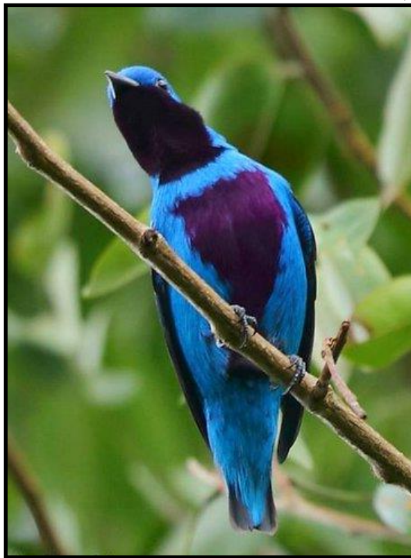
Lovely Cotinga

1 st December to 6 th December 2023 (6 days)