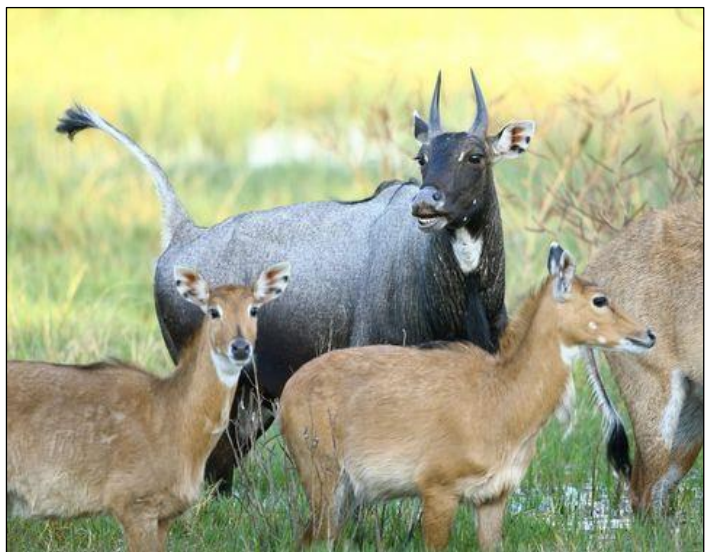
A family of water-loving Nilgai by Adam Riley

Here we will explore the reserve on foot, following the network of raised dykes that criss-cross the labyrinth of ponds. Scanning through the waterbirds is usually our first priority and we will likely be overwhelmed by the staggering numbers of species. Possibilities include the beautiful Bar-headed Goose, whose migration sees them travelling from Northern China over the high Himalayan mountain ranges to winter here on the plains. Other species may include Garganey, Northern Pintail, Lesser Whistling, Indian Spot-billed and Ferruginous Ducks, Common and Pied Kingfishers, Little and Indian Cormorants, Oriental Darter, Grey and Purple Herons,