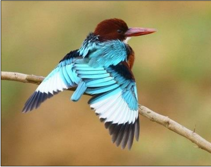
White-throated Kingfisher by Adam Riley

Day 1: Arrival in New Delhi. On arrival in India's bustling capital city of New Delhi, we will transfer to our accommodations within the city limits. With remaining daylight, we should encounter our first Black Kites, flocks of screaming Rose-ringed Parakeets, Spotted and Eurasian Collared Doves, Pied, Bank and Common Mynas, Eastern Jungle and House Crows, Red-vented Bulbuls and Eurasian Tree Sparrows. These ubiquitous Indian "urban" birds will become familiar figures in our travels through the country. Time permitting, we may visit a nearby set of sports fields in the late afternoon where Grey Francolin, Red-wattled Lapwing, White-throated Kingfisher, Black Drongo,