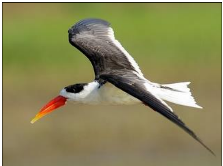
Indian Skimmer by Rich Lindie

Day 8: Bharatpur to Chambal River via Fatehpur Sikri. This morning, we depart early on the journey to Chambal Safari Lodge via Agra. Our first stop of the day will be at the ancient city of Fatehpur Sikri. This amazingly well preserved historical - city was constructed by Mughal emperor Akbar in 1570 and served as the empire's capital from 1571 until 1585. Though it took 15 years to build, it was abandoned after only 14 years because the water supply was unable to sustain the growing