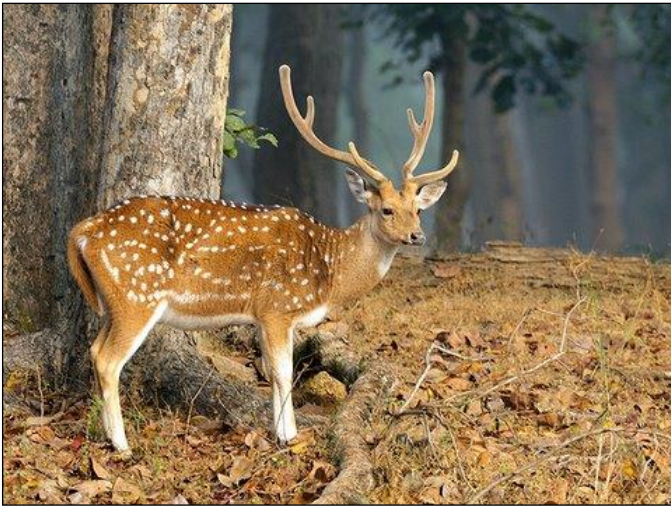
Spotted Deer (Chital)

Quails, the uncommon White-naped Woodpecker, Indian Scops Owl, Yellow-footed Green Pigeon, Alexandrine and Plum-headed Parakeets, Stork-billed Kingfisher, Sirkeer Malkoha, Common Iora, White-bellied Drongo, Tickell's Blue Flycatcher (which can often be located by its sweet song given from dense bamboo patches), the active White-browed Fantail, Grey-breasted and Rufous-fronted Prinias and Yellow-throated Sparrow. While in the area, we will also keep our eyes peeled for Indian Vulture, Pallid Harrier, Shikra, Bonelli's Eagle and Crested Serpent Eagle. If time permits, on one of the days we may visit Soorwal Lake to look for a host of water associated birds that may include Dalmatian and Great White Pelicans, Spotted Redshank, Temminck's Stint, Common Ringed Plover, Indian Courser, Indian Stone-curlew, Blue-tailed and Green Bee-eaters, Ashy-crowned Sparrow-Lark, Indian Bush Lark, Moustached Warbler, Ashy and Yellow-bellied Prinias, Rosy Starling and the ever-popular Greater Painted-snipe.