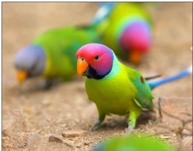
Plum-headed Parakeets by Adam Riley

We will use open-top jeeps and canter vans to explore the park in search of tigers, watching for telltale signs such as pugmarks or scat in the road and listening for the alarm calls of Sambar, Spotted Deer, Southern Plains Grey Langur and Indian Peafowl. With luck, these will lead us to a tiger padding along a dusty track or sprawled out in the