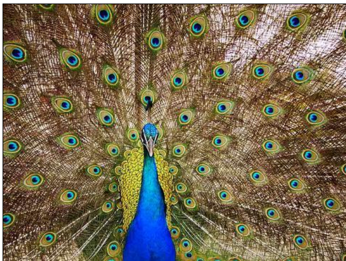
Displaying Indian Peafowl

during the birth of their 14 th child. This is without a doubt one of India's most iconic and impressive sites and should not be missed!