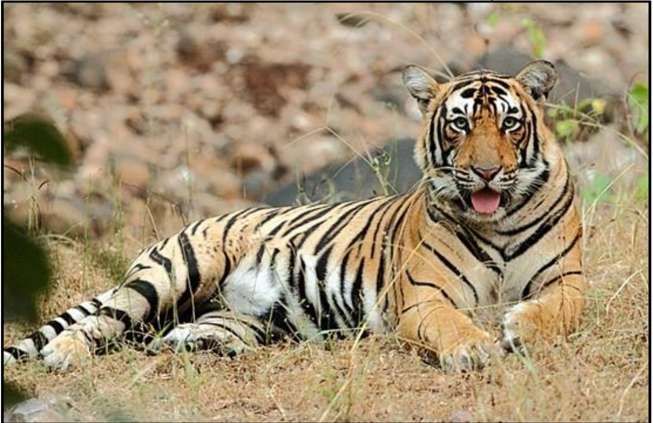
Tiger