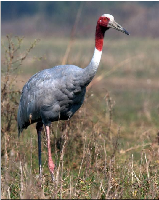
Sarus Crane by Rich Lindie

Great, Yellow-billed and Little Egrets, Black-crowned Night Heron, Painted, Woolly-necked and Black-necked Storks, Asian Openbill, Black-headed Ibis, Eurasian Spoonbill, Pheasant-tailed and Bronze-winged Jacanas, White-breasted Waterhen, Purple Swampphen and Black-winged Stilt. Regal and elegant Sarus Cranes are often heard calling before they are seen striding over the flooded grasslands.