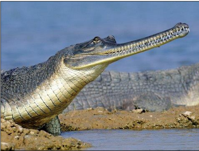
Gharial by Rich Lindie

endangered Indian Skimmer, one of our main reasons for visiting this reliable site, can often be found on islands in the river together with Black-bellied and River Terns. During our boat trip, we will do a lot of scanning and this could turn up other exciting species in the form of Black Stork, Red-naped Ibis, Small Pratincole, Long-legged Buzzard, Short-toed Snake Eagle, Bonelli's Eagle, River Lapwing, Great Stone-curlew, Sand Lark, Desert Wheatear, and possibly even Indian Eagle-Owl roosting on the small cliff faces. We will also be keeping a sharp eye out for one of the rarer inhabitants of this river, the unique Ganges River Dolphin that is confined largely to the Ganges and Brahmaputra Rivers and their tributaries. Another rare species we should encounter is the bizarre, long-snouted Gharial – one of the most localised and critically endangered crocodylians on the planet, together with Mugger Crocodile and Flap-shelled Turtle.