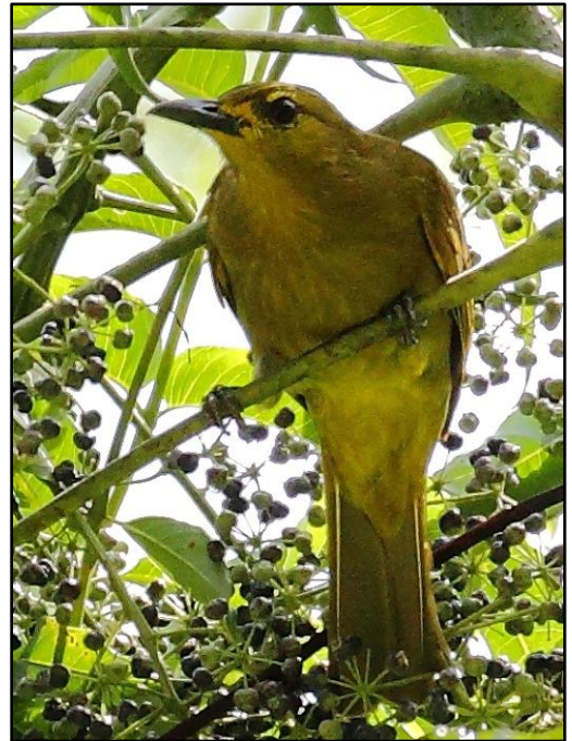
Buru Golden Bulbul by Glen Valentine

Buru is also known for its rarities that include the almost unknown Blue-fronted Lorikeet (seen for the first time in many years in 2014) and the mythical Black-lored Parrot (only recently observed in the wild for the first time, it is thought to be largely nocturnal). We will also make a big effort to find the Madanga – initially thought to be a white-eye of sorts but now included with the pipits