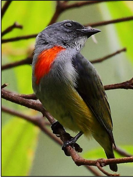
Flame-breasted (Buru) Flowerpecker by Glen Valentine

Day 1: Ambon and flight to Buru. This afternoon we will all meet up for our flight to the seldom-birded island of Buru. After arriving in Namlea, the capital of this little-known island, we shall immediately embark on the two-hour westerly drive along Buru's northern coastline to our extremely comfortable accommodation (especially in the context of the Moluccas) situated at Waspait on the island's north-western coastline. For the next few nights this will be our base for forays southwards into the forested highlands and the remaining patches of lowland forest near Bara. Naturally we will focus our attention on the Buru endemics; species that occur here and nowhere else on our planet. We have the next four nights and three and a half full days to search for the remarkable collection of Buru's rare and endemic species, many of which have been seen by very few birders!