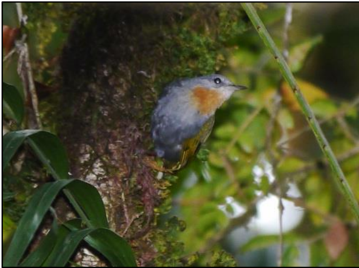
Madanga

Pygmy Parrot, Red Lory, Eclectus, Red-cheeked and Great-billed Parrots, Moluccan King Parrot, Collared Kingfisher, Torresian Crow and Moluccan Starling.