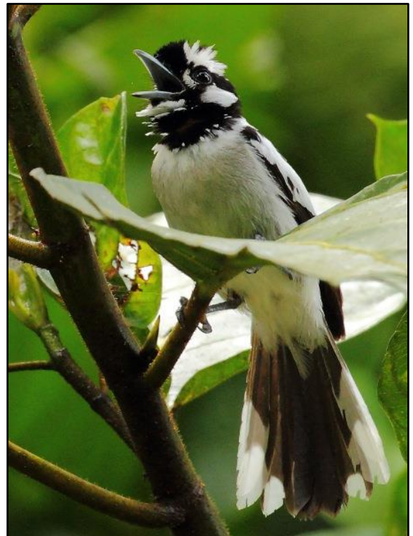
White-naped Monarch by Glen Valentine

More widespread species that we may encounter include Pacific Baza, Black Eagle, Variable Goshawk, Metallic (White-throated) Pigeon, Great Cuckoo-Dove, Common Emerald Dove, Superb, White-bibbed (Moluccan/Small Island) and Claret-breasted Fruit Doves, Little Bronze Cuckoo, the Austral-migrant Channel-billed Cuckoo, Oriental Dollarbird, Common Paradise Kingfisher, Spotted Kestrel, Red-breasted