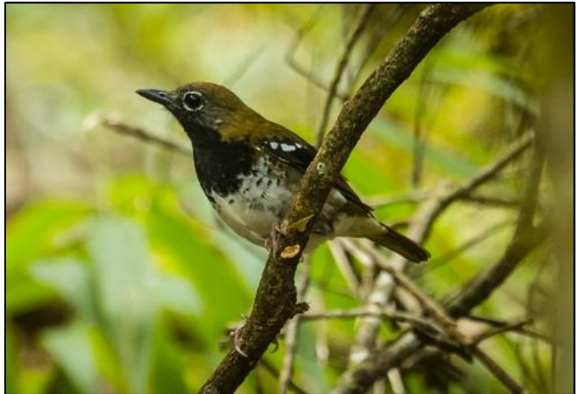
Buru Thrush by K. David Bishop

In the lowlands near the town of Bara, we will visit a remnant area of lowland forest where we will target such gems as the pretty Black-tipped Monarch, Buru Golden Bulbul, (Buru if split) Spangled Drongo, Black-faced Friarbird, Black-eared Oriole, South Moluccan Pitta, the scarce and shy Buru Dwarf Kingfisher (recently split from the once widespread Variable Dwarf Kingfisher) and Flame-breasted Flowerpecker. This is also one of the only known accessible areas on