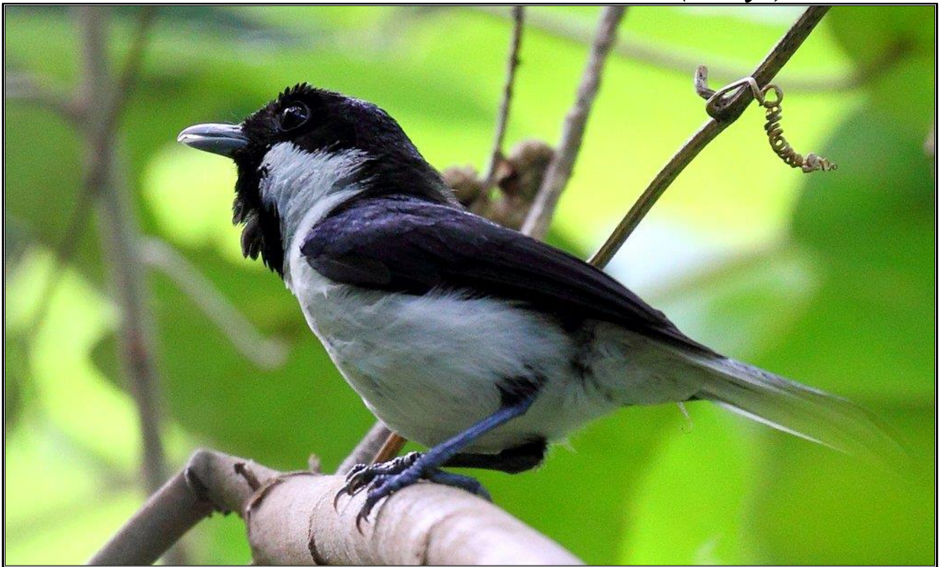
Black-tipped (Buru) Monarch by Glen Valentine

23 rd November to 28 th November 2023 (6 days)