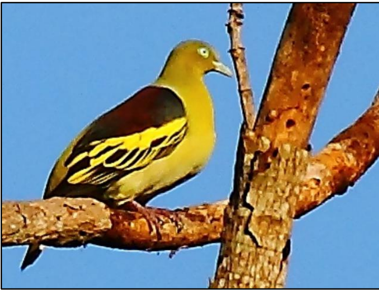
Buru Green Pigeon

the island for the rare Buru Green Pigeon, which usually requires much patience, careful scanning and a fair dose of luck to find.