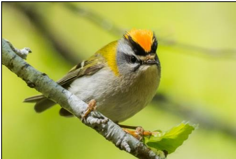
Firecrest by Yeray Seminario

Some special raptors for the area are Western Osprey and the lovely Red Kite, as well as the possibility for Spanish Imperial Eagle that nests inside the national park. However, the most remarkable sight of the day will probably be a large breeding colony of Gull-billed Tern and the impressive numbers of Slender-billed Gull, Greater Flamingo and Eurasian Spoonbill that gather on occasions in the salt pans. There is also a chance for Caspian Tern, Purple Heron, Black Stork, Great Egret and Little Bittern. After a fantastic birding session, we will spend the latter part of the afternoon wine tasting in Trebujena.