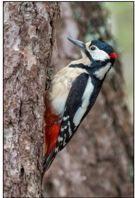
Great Spotted Woodpecker

Day 8: Drive to Andujar and afternoon visit to Sierra de Andújar. The morning will be dedicated to travelling as we depart the coast of Spain and head inland to Andújar and in particular; Sierra de Andújar, home to the Iberian Lynx, a species considered to be the most endangered feline in the world, with 70% of the population found in this stronghold. We will spend the afternoon searching for