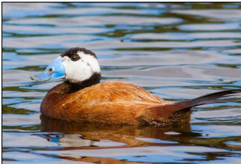
White-headed Duck by Yeray Seminario

The following morning, we depart for Jerez stopping to visit Brazo del Este. This area represents the remnants of the eastern branch of the Guadalquivir River floodplain which has been dramatically affected by commercial activities upstream. Despite this, the river still passes through the region, with much of the associated natural vegetation intact, flanked by rice fields and various other agricultural crops, which supports a host of species including Booted Eagle, Squacco Heron, Black Stork, Glossy Ibis, Marbled Duck, Western Swamphen, Eurasian Penduline Tit and Bluethroat.