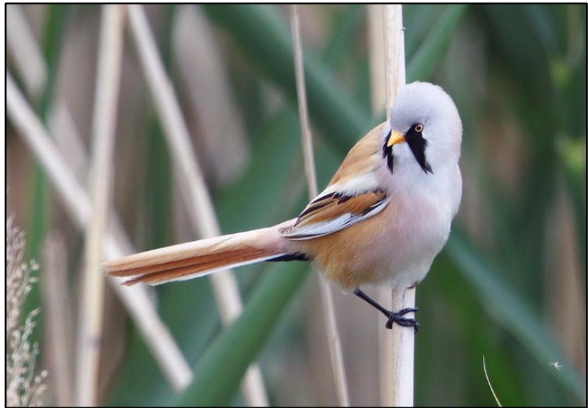
Bearded Reedling by Adam Riley

Day 9 & 10: Sierra de Andújar and surrounds. The majestic Oak trees which blanket the valleys of Sierra Morena range in Sierra de Andújar will be our base for the next two days. The park represents Andalucía's best preserved and protected natural tracts of Mediterranean forest and scrubland. It is in this park that we will search for the Iberian Lynx while also allowing us the chance to locate other