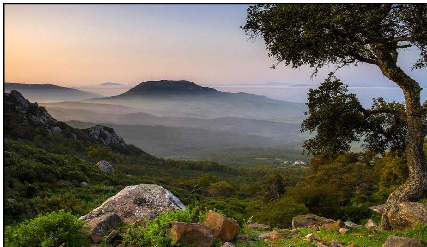
Southern Spain scenery and Africa on the other side of the Strait by Yeray Seminario

Day 5: Full day in Doñana National Park. Positioned on a major migratory route between Europe and Africa; Doñana National Park represents an important site for more than half-a-million wintering waterfowl and waders attracted to the region by its abundant food supply and mild climate. Dominating the right bank of the Guadalquivir River at the estuary which feeds into the Gulf of Cádiz the reserve is a kaleidoscope of marshland, lagoons, sand dunes, scrubland and maquis shrubland which provides