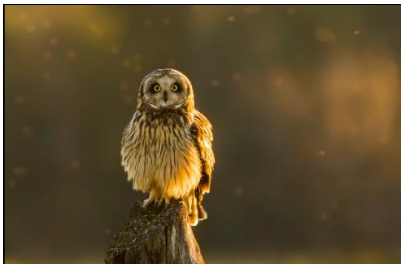
Short-eared Owl by Yeray Seminario

Southern Spain is well known for producing one of the most famous wines in the world – Sherry, and on arrival in Jerez we will make our way to one of the areas fine local wineries. Essentially Sherry can only be made in one place and that is within the province of Cádiz. The area is often referred to as the Sherry