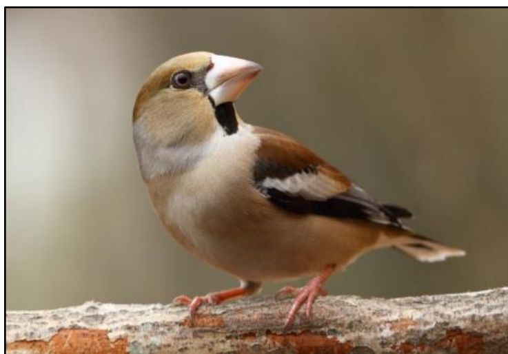
Hawfinch by Adam Riley

Day 2: Oropesa to Monfrague National Park. This morning we head out to the scenic Monfrague National Park in the Extremadura region. En route to Monfrague NP there will be plenty of time for some great initial birding, allowing us to acquaint ourselves with many of the region's more common species, such as Spotless Starling, Eurasian Jay and European Serin, as well as specialties that may include Iberian Magpie and possibly Spanish Imperial Eagle, as we explore the park through the day. The Monfrague National Park, covering 18,000 hectares, was protected as a Natural Park from 1979 but only recently declared a National Park in 2007. There is an additional 11,700-hectare buffer zone, culminating in a vast area that is rich in wildlife. This fabulous region of mountains, gorges, forest and woodland holds Spain's major breeding sites for the rare Spanish Imperial Eagle and during our stay here, we will hope for daily sightings of this impressive species. The area is also home to the world's largest breeding colony of Cinereous Vulture. These huge birds are often visible throughout the region and can often be seen attending to goat or sheep carcasses, along with the more numerous Griffon Vulture.