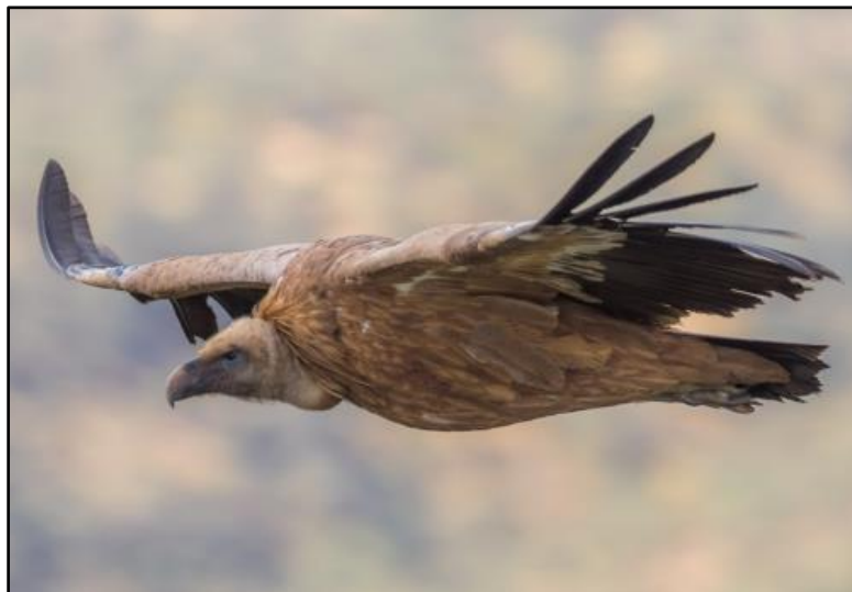
Griffon Vulture

a Special Protection Area for Birds in 1998, meander down gentle slopes to expansive plains, dehesa pastureland, plentiful wetlands and the occasional Cork Oak thicket of the Magasca which in turn attract an array of species including Crested Lark, Corn Bunting, Spanish Sparrow, Calandra Lark, Azure Magpie, Red Kite, Red-legged Partridge, Black-bellied Sandgrouse, Golden Eagle, Short-toed Eagle and Little and Great Bustards before heading on to Trujillo for lunch. Thereafter we will have time to visit a local wine cellar in the ancient, historic, fortified town. We will then settle into our accommodations in Trujillo, the perfect base for our exploration of the area, while the option for an after dark excursion will allow us to venture out to look for Western Barn Owl around the village.