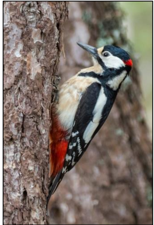
Great Spotted Woodpecker by Yeray Seminario

Some special raptors for the area are Western Osprey and the lovely Red Kite, as well as the possibility for Spanish Imperial Eagle that nests inside the national park. However, the most remarkable sight of the day will probably be a large breeding colony of Gull-billed Tern and the impressive numbers of Slender-billed Gull, Greater Flamingo and Eurasian Spoonbill that gather on occasions in the salt pans. There is also a chance for Caspian Tern, Purple Heron, Black Stork, Great Egret and Little Bittern. After a fantastic birding session, we will spend the latter part of the afternoon wine tasting in Trebujena.