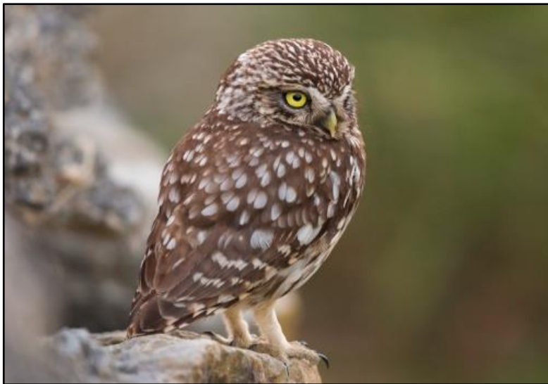
Little Owl

Day 11: Andujar to Alcazar de San Juan with wine tasting in Valdepeñas. We will spend the morning in Andújar as we attempt to connect with any species we may have missed while also attempting one last sighting of the Iberian Lynx. We will then depart Andújar to Valdepeñas for a wine tasting at a local cellar. We expect to arrive at our accommodations in Alcazar de San Juan in the late afternoon.