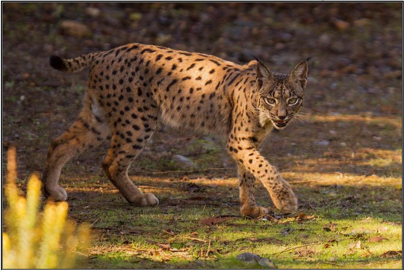
Iberian Lynx

1 st December to 12 th December 2024 (12 days)