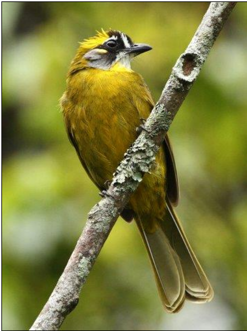
Yellow-eared Bulbul

Day 4: Nuwara Eliya and Horton Plains. The surrounding highlands of Nuwara Eliya are home to an exciting variety of species and this morning we will be up bright and early in order to make the most of our time in the area. Our port of call for today is the stunning Horton Plains National Park, where we will be in search of one of Sri Lanka's most endangered and secretive endemics, the Sri Lanka Whistling Thrush. This highly prized endemic, which inhabits the fringes of high altitude forested pools, is tricky to pin down and we will be happy with any sighting of this enigmatic species. Other exciting specialities of this stunted and twisted forest include Sri Lanka Wood Pigeon, Crimson-backed Flameback, Indian Blackbird, the reclusive Sri Lanka Bush Warbler, the stunning and localised Kashmir Flycatcher, here at its winter quarters and often associating with mixed flocks, the endemic Dull-blue Flycatcher, Sri Lanka White-eye, the flashy Indian Blue Robin, Sri Lanka Scimitar Babbler, the stunning Yellow-eared Bulbul and possibly Legge's (Mountain) Hawk-Eagle.