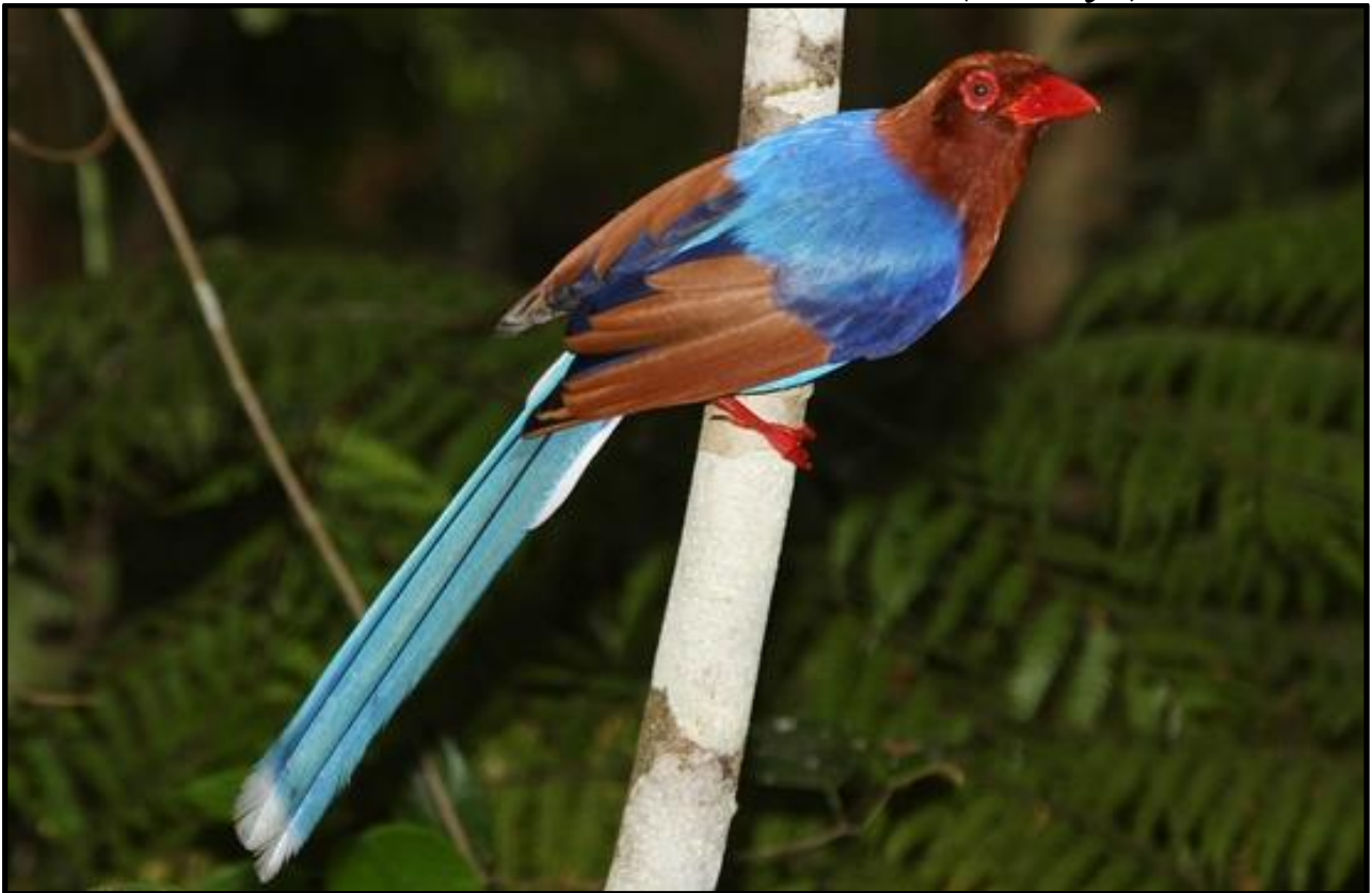
Sri Lanka Blue Magpie by Markus Lilje

30 th October to 9 th November 2022 (11 days)