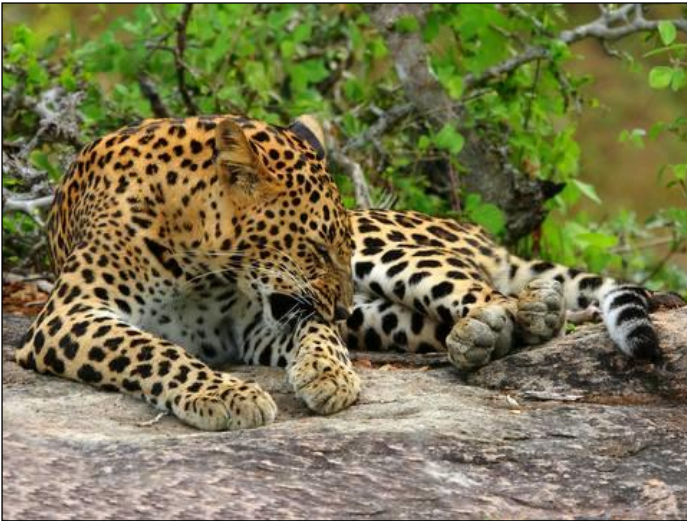
Leopard

Grey-bellied and Jacobin Cuckoos, skulky Sirkeer Malkoha, Yellow-crowned Woodpecker, Jerdon's Bush Lark, White-browed Bulbul and flocks of migratory Rosy Starling. Indian Peafowl are common in the park and we may be fortunate enough to see the males in full display, one of nature's greatest and most spectacular events!