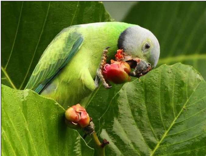
Layard's Parakeet