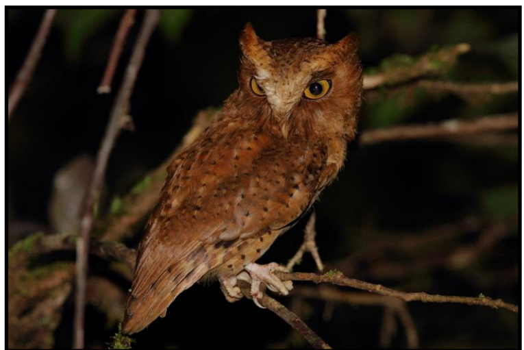
Serendib Scops Owl

A night walk in the area may yield a sighting of Sri Lanka Frogmouth, a truly outrageous bird, and we will again make a concerted effort to find the inexplicably localised Serendib Scops Owl. This area is also home to a colourful variety of butterflies as well as a fine selection of vividly patterned frogs, lizards and snakes – we may even be lucky enough to encounter Hump-nosed Pit Viper or Indian Rock Python!