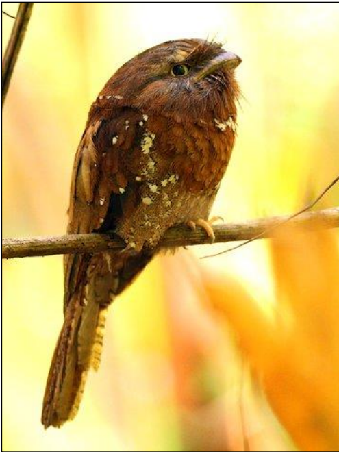
Sri Lanka Frogmouth

afternoon enjoying the splendours of this reserve we will settle into our accommodation near Embilipitiya.