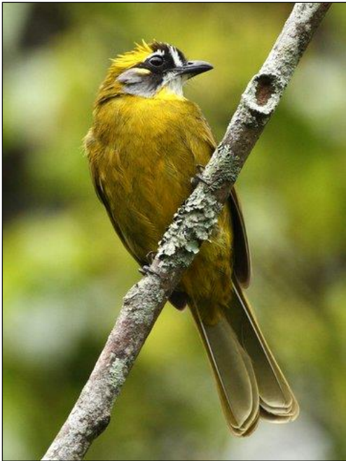
Yellow-eared Bulbul

Day 4: Nuwara Eliya and Horton Plains. The surrounding highlands of Nuwara Eliya are home to an exciting variety of species and this morning we will be up bright and early in order to make the most of our time in the area. Our port of call for today is the stunning Horton Plains National Park, where we will be in search of one of Sri Lanka's most endangered and secretive endemics, the Sri Lanka Whistling Thrush. This highly prized endemic, which inhabits the fringes of high altitude forested pools, is tricky to pin down and we will be happy with any sighting of this enigmatic species. Other exciting specialities of this stunted and twisted forest include Sri Lanka Wood Pigeon, Crimson-backed Flameback, Indian Blackbird, the reclusive Sri Lanka Bush Warbler, the stunning and localised Kashmir Flycatcher, here at its winter quarters and often associating with mixed flocks, the endemic Dull-blue Flycatcher, Sri Lanka White-eye, the flashy Indian Blue Robin, Sri Lanka Scimitar Babbler, the stunning Yellow-eared Bulbul and possibly Legge's (Mountain) Hawk-Eagle.