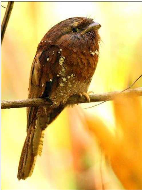
Sri Lanka Frogmouth

afternoon enjoying the splendours of this reserve we will settle into our accommodation near Embilipitiya.