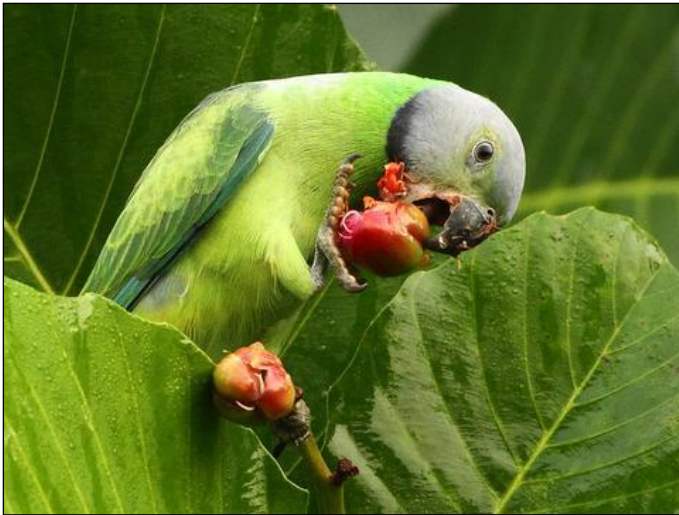
Layard's Parakeet