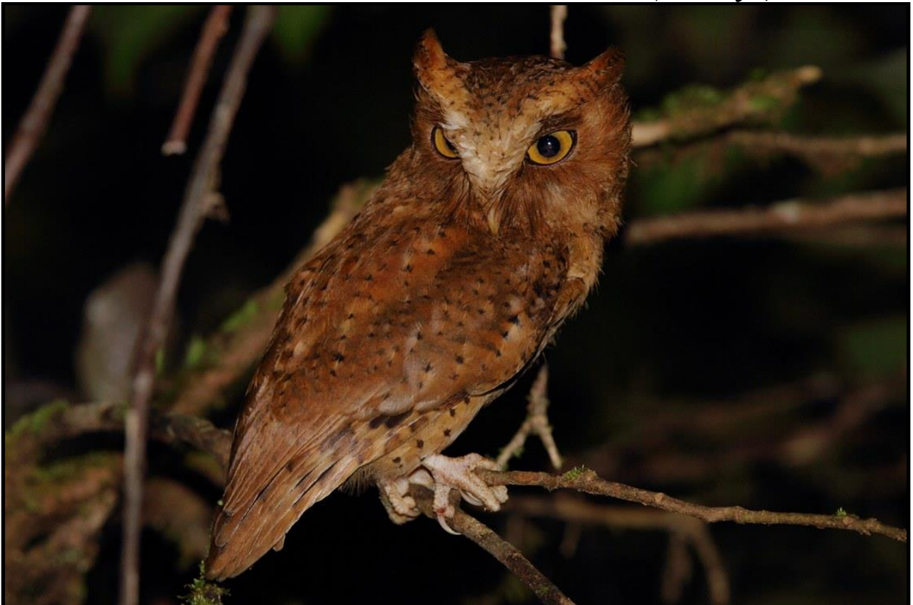
Serendib Scops Owl

23 rd November to 3 rd December 2022 (11 days)