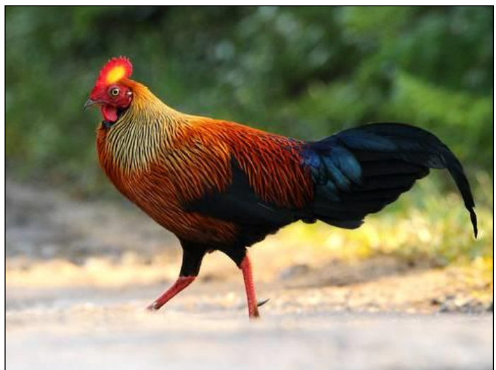
Sri Lanka Junglefowl by Markus Lilje

Day 3: Kitulgala to Nuwara Eliya. Today we will journey southwards, ascending into the cooler highlands of central Sri Lanka. If time permits, we will visit the beautiful Hakgala Botanical Gardens where a selection of localised endemics, restricted to these higher elevations, can be found. We will then continue on to our accommodation in the Nuwara Eliya.