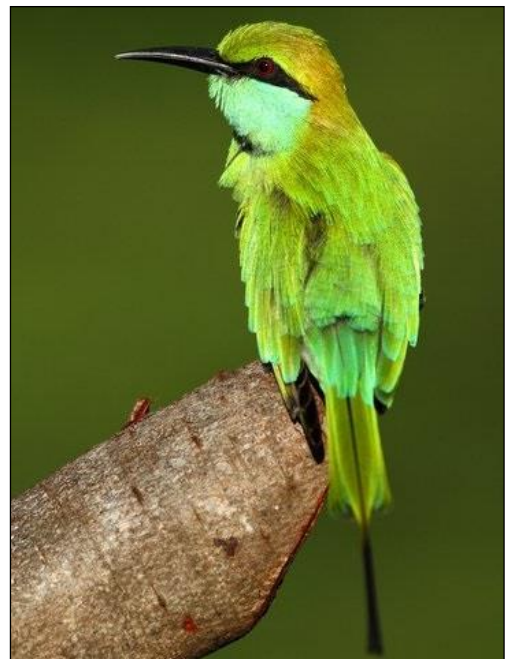
Green Bee-eater by Markus Lilje

Birding the woodlands of Yala should prove rewarding and we will search for the rare White-naped Woodpecker, flocks of noisy Yellow-billed Babbler, Sri Lanka Junglefowl, Orange-breasted Green Pigeon, Chestnut-headed and Green Bee-eaters,