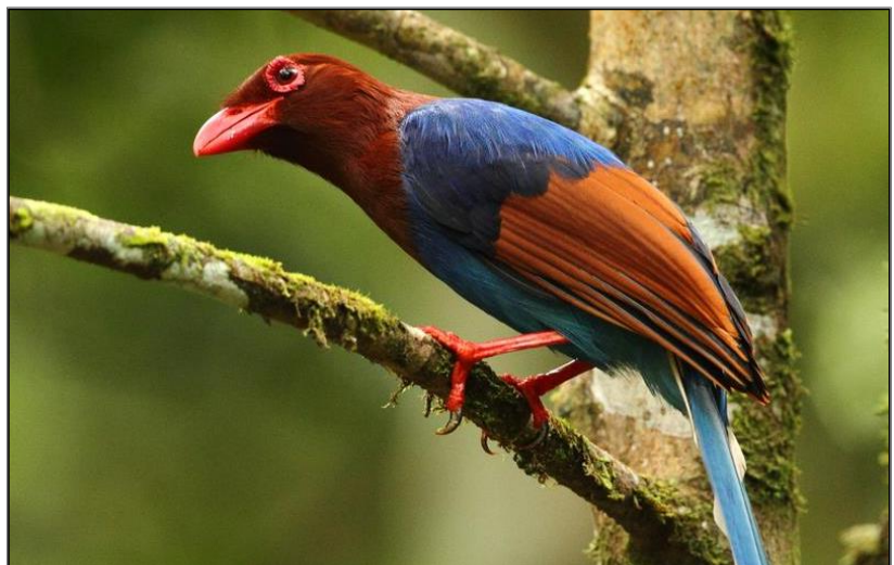
Sri Lanka Blue Magpie

A night walk in the area may yield a sighting of Sri Lanka Frogmouth, a truly outrageous bird, and we will again make a concerted effort to find the inexplicably localised Serendib Scops Owl. This area is also home to a colourful variety of butterflies as well as a fine selection of vividly patterned frogs, lizards and snakes – we may even be lucky enough to encounter Hump-nosed Pit Viper or Indian Rock Python!