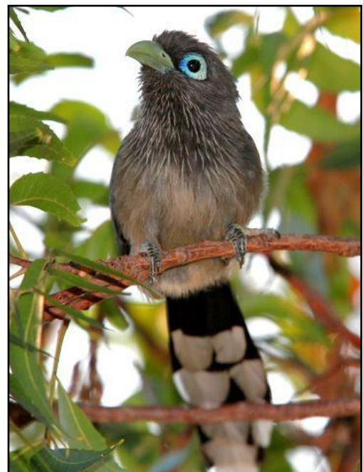
Blue-faced Malkoha by Adam Riley

The afternoon will be spent visiting the reservoirs and salt pans of Tissamaharama, home to an amazing variety of water-associated birds. Scanning through the swathes of waterfowl we may find the localised Spot-billed Pelican, Little and Indian Cormorants, Greater Flamingo, the secretive Black Bittern, Oriental Darter - often seen sunning itself on dead snags, numerous Painted Stork, Asian Openbill, Black-headed Ibis, Yellow Bittern in the thick reeds, Lesser Whistling Duck, the spectacular Pheasant-tailed Jacana in open areas of lily-covered wetland, and, if we are fortunate, Saunders' Tern and the endangered Lesser Adjutant. In the late afternoon, we will settle into our lovely accommodations bordering Yala NP.