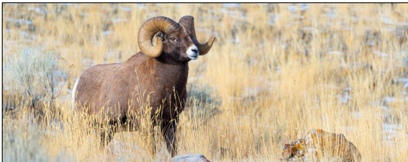
Bighorn Sheep by Kate Ochsman

Day 4 - Lamar Valley. Today will be spent entirely in the famed Lamar Valley of Yellowstone, in search of some of the more special birds of Winter including Boreal and Northern Pygmy Owls. We will work the road system in search of Yellowstone's most iconic species, the Gray Wolf. Some 35 years after their re-introduction into the ecosystem, wolves are frequently encountered in the Winter as they hunt for Elk and young Bison. The Gray Wolf numbers 94 individuals, as of now, plus several litters of pups will be grown members of their respective packs by Winter. Hopefully not only will we encounter the wolves, but will likely enjoy some fascinating behaviour. Other wildlife we will try to see today include River Otter, Pine Marten, Red Fox, Coyote, and more! Overnight Gardiner.