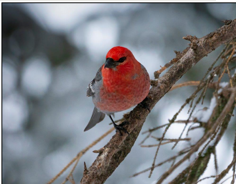
Pine Grosbeak by Kate Ochsman

Today we will venture into the heart of Yellowstone National Park via Snowcoach! This is the most amazing way to see the park in Winter, including enjoying Old Faithful and Steamboat Spring geysers erupting cold, crystalline, and beautiful in the freezing temperatures. It is also our opportunity to take in some of the most iconic images of Yellowstone - snow-covered, thick-furred, Bison emerging from the steamy valleys. Other wildlife we are likely to encounter today include Elk, Pronghorn, and Bighorn Sheep. Though today is mostly devoted to non-avian wonders of the world's first national park, we will likely run into some of the commoner Winter species like Townsend's Solitaire, Steller's Jay, and Bohemian Waxwing. We will do our best to track down individuals of the few resident Great Grey Owls, though we cannot trek for them and will leave it to serendipity to find one from the road. Overnight Gardiner.