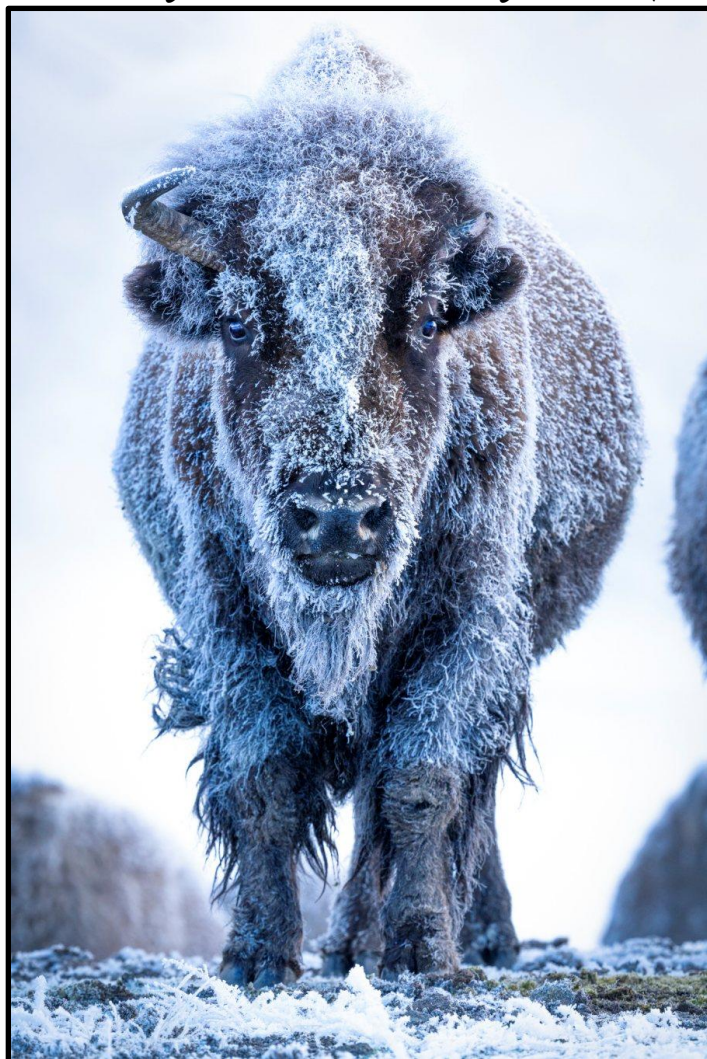
American Bison