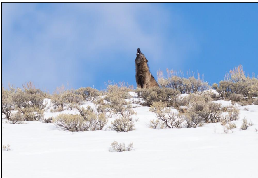
Howling Gray Wolf by Kate Ochsman

Day 1 - Arrival into Bozeman. A quick visit to local feeders in the Bozeman area to see Grey-crowned and Black Rosy Finches, Common Redpoll, Evening Grosbeak, and more! We will also have a short walk through the local Bozeman Cemetery, which is packed with conifers of all sorts. The Cemetery often hosts Red and White-winged Crossbills, both! For a few years, a Great Grey Owl delighted visitors to the adjacent Public Library lawn! Overnight in Livingston.