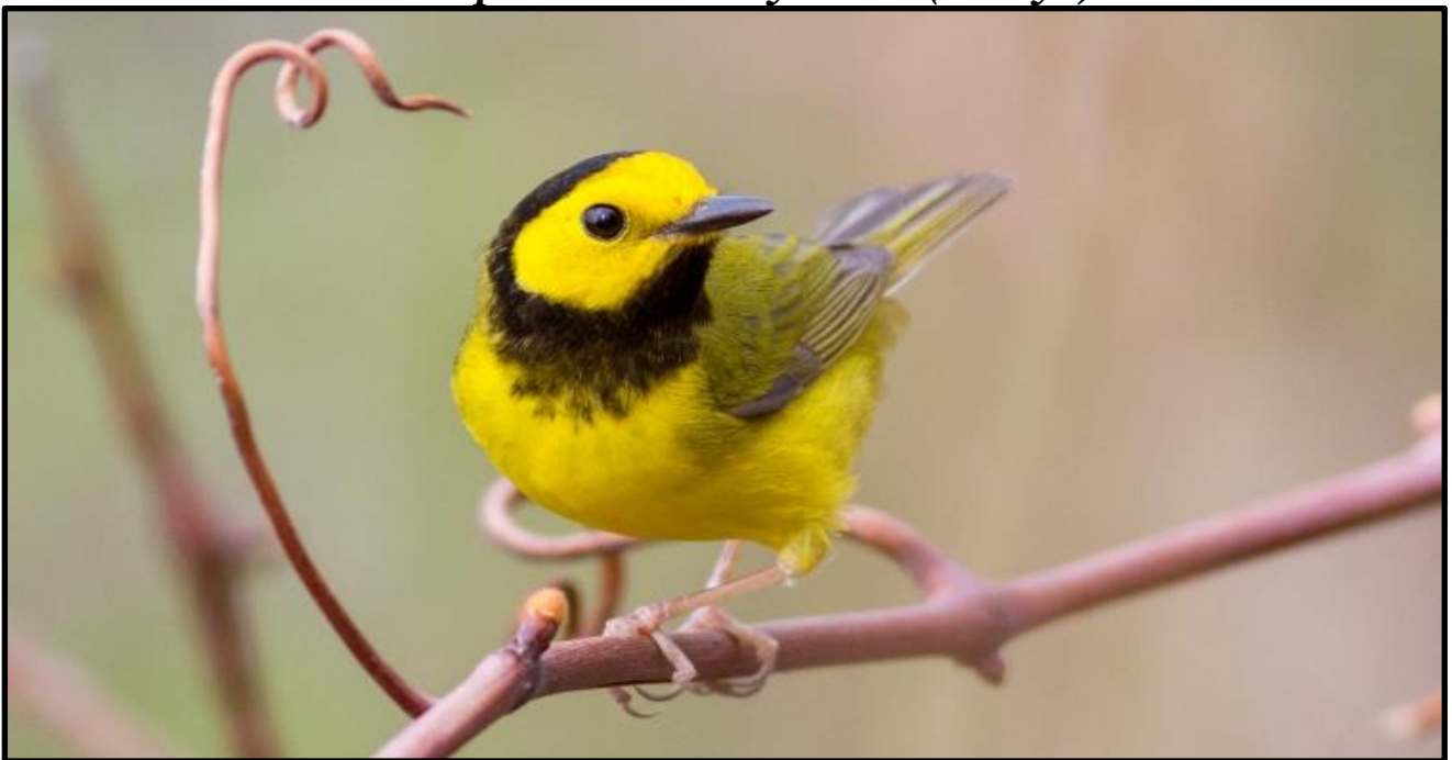
Hooded Warbler by George L. Armistead

The North Carolina Mountains are home to around 25 species of breeding wood warblers and several more that migrate through. Early to mid-May is the best time to view peak diversity of warblers in the habitat rich region of Western North Carolina. Please join us as we celebrate this wonderful family of birds with our Warbler Weekend.