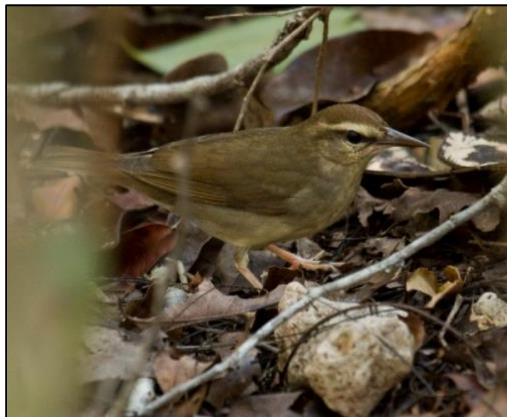
Swainson's Warbler by Dušan Brinkhuizen

Our second day will be all about the higher elevations of the Blue Ridge. We will start out early in the Black Balsam area searching for Canada, Chestnut-sided and Black-throated Blue Warblers. This is also a great area for Least and Alder Flycatchers. We will next head north to look for Golden-winged and Cerulean Warblers. This will be a day of great views, cool temperatures, and great birds. We will end up back in Asheville for the night.