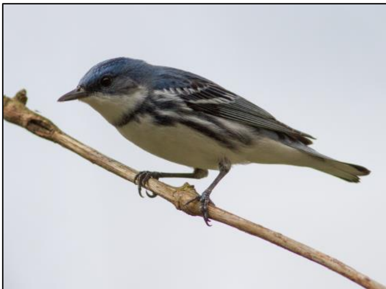
Cerulean Warbler by George L. Armistead

head back up the mountain to Hooper Lane. This is a large Sod operation in Mills River that has been great for migrating shorebirds and open land species. We will be looking for Greater and Lesser Yellowlegs, Grey Plover, Least Sandpiper and more. Time and pandemic allowing, we will head to a local brewery for dinner and beer.