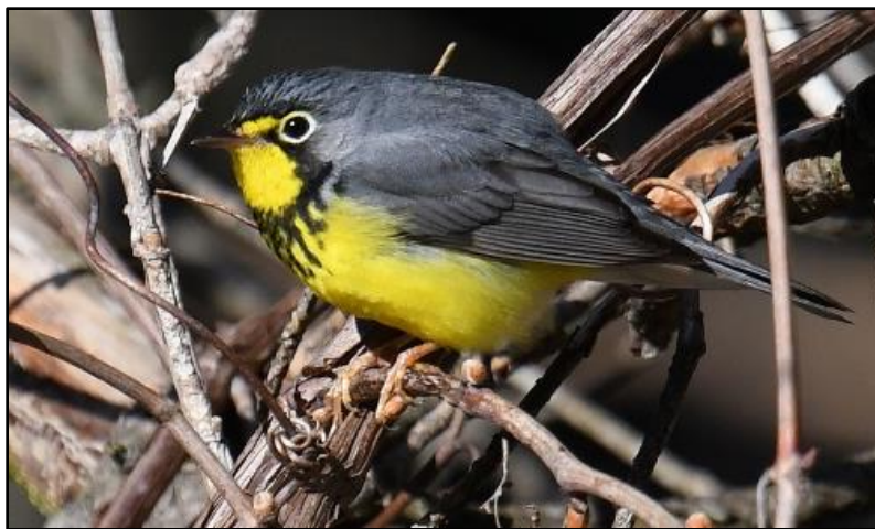
Canada Warbler by Lev Frid