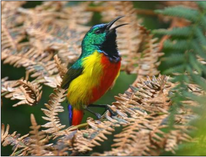
Regal Sunbird

this skulker – one of the Albertine Rift endemics. Other understory birds we hope to see include displaying African Broadbill, Black-faced Prinia and the handsome but shy Black-faced Rufous Warbler. The mid-storey and canopy support Elliot's and Tullberg's Woodpeckers, Cabanis's, Kakamega and Anson's Greenbuls, the enigmatic Chapin's Flycatcher and White-browed Crombec. The rare Jameson's Antpecker may also be seen probing under moss on dead branches or gleaning warbler-like in the canopy, though finding this localised species requires immense luck, while Scarce Swifts forage over the forest. Birding at Buhoma is a truly magical experience!