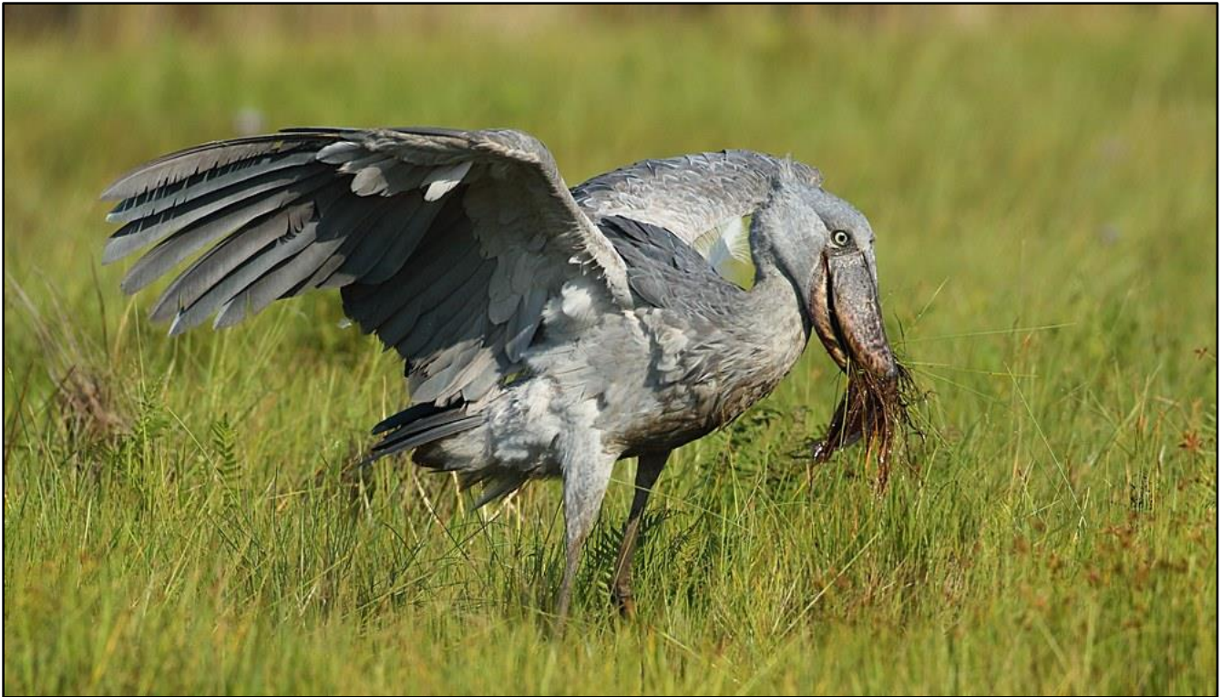
Shoebill by Markus Lilje

Day 1: Arrive in Entebbe. Today is set aside as an arrival day in order for us to make an early start the following morning. Upon arrival at Entebbe International Airport, you will be met and transferred to our accommodations for the night. Time permitting, we may visit the Entebbe Botanical Gardens, situated just a short distance away from our hotel. Our primary target here is the gorgeous Orange Weaver – small, loose breeding colonies are usually present in the trees at the very edge of Lake Victoria. Other conspicuous species in the botanical gardens include both Ross’s and Great Blue Turacos, the scarce Orange-tufted Sunbird, Grey Parrot, Eastern Plaintain-eater, Black-and-white Casqued Hornbill, and the Woodland Kingfisher. Overhead we will watch for Hooded Vulture, Yellow-billed Kites, and Pied Crows and we’ll certainly find the grotesque-looking Marabou Stork. In a small remnant patch of forest, we may also find Guereza – an incredibly striking black-and-white primate with a long bushy tail. Thereafter, we return to the hotel for the evening, and a scrumptious welcoming dinner.