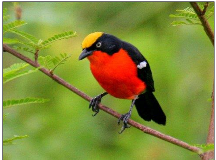
Papyrus Gonolek by Adam Riley

Day 1: Arrive in Entebbe. Today is set aside as an arrival day in order for us to make an early start the following morning. Upon arrival at Entebbe International Airport, you will be met and transferred to our accommodations for the night. Time permitting, we may visit the Entebbe Botanical Gardens, situated just a short distance away from our hotel. Our primary target here is the gorgeous Orange Weaver – small, loose breeding colonies are usually present in the trees at the very edge of Lake Victoria. Other conspicuous species in the botanical gardens include both Ross’s and Great Blue Turacos, the scarce Orange-tufted Sunbird, Grey Parrot, Eastern Plaintain-eater, Black-and-white Casqued Hornbill, and the Woodland Kingfisher. Overhead we will watch for Hooded Vulture, Yellow-billed Kites, and Pied Crows and we’ll certainly find the grotesque-looking Marabou Stork. In a small remnant patch of forest, we may also find Guereza – an incredibly striking black-and-white primate with a long bushy tail. Thereafter, we return to the hotel for the evening, and a scrumptious welcoming dinner.