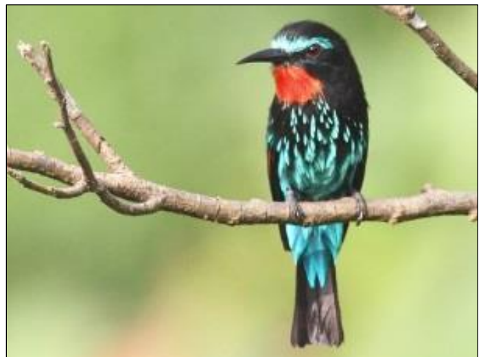
Black Bee-eater

We will spend the balance of our time here birding the trails leading out from the camp. Species we will search for include Olive Long-tailed Cuckoo, Bar-tailed Trogon, Dusky Tit, Abyssinian (Kivu) Ground Thrush, White-bellied Robin-Chat, Equatorial Akalat, rare Grey-chested Babbler, Red-throated Alethe, White-bellied Crested Flycatcher, White-eyed Slaty Flycatcher, Northern Double-collared Sunbird, Willcocks's Honeyguide, newly described Willard's Sooty Boubou, Black-billed Weaver and Magpie Mannikin. High exposed perches in the open forest are favoured by African Goshawk, the dazzling Black Bee-eater, Sooty Flycatcher and forest starlings including Waller's, Stuhlmann's and Narrow-tailed. One of Bwindi's star avian attractions is the diminutive, pitta-like Neumann's Warbler, a vocal yet very secretive bird! We will require luck and patience to see