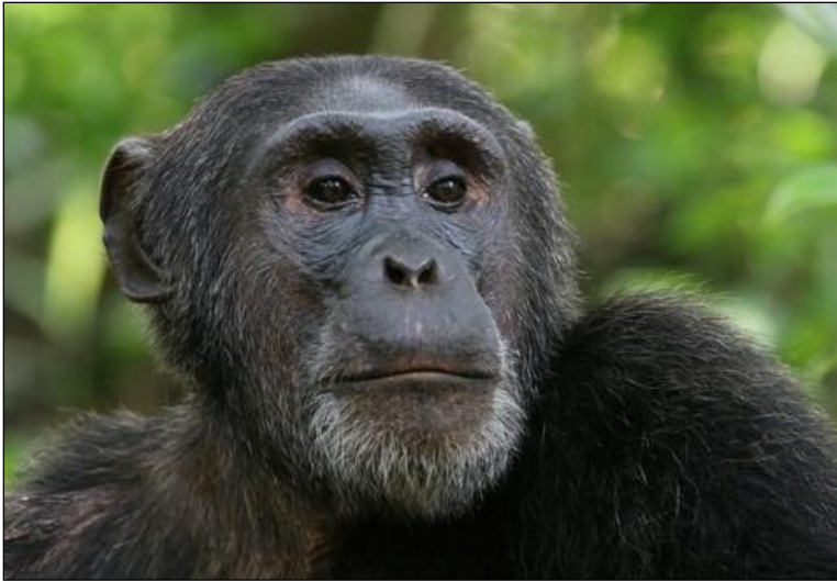
Chimpanzee

villages and homesteads to Mabamba, which is a large wetland connected to Lake Victoria. This extensive papyrus swamp is home to several pairs of Shoebill, Uganda's most famous avian resident and the prime attraction to the nation for most birders. This charismatic species, the only representative of its family, is certainly amongst the most highly prized birds in the world! We will commission a boat from the nearby fishing village and search the maze of channels in an attempt to find this special species. Other water birds abound and we should find several species of herons, egrets and waterfowl, the ever-present African Fish Eagle, Blue-breasted Bee-eater, African Marsh Harrier, Purple Swamphen, Long-toed Lapwing, African and the tricky Lesser Jacanas, Malachite Kingfisher, and African Pygmy Goose. The papyrus holds the endearing Swamp Flycatcher, Blue-headed Coucal, Greater and White-winged Swamp Warblers, Grey-capped Warbler, the indescribable Papyrus Gonolek, and the nomadic and unpredictable Weyn's Weaver. If we are exceptionally fortunate, we may also see the rare Sitatunga, a shy swamp-dwelling antelope with splayed hooves.