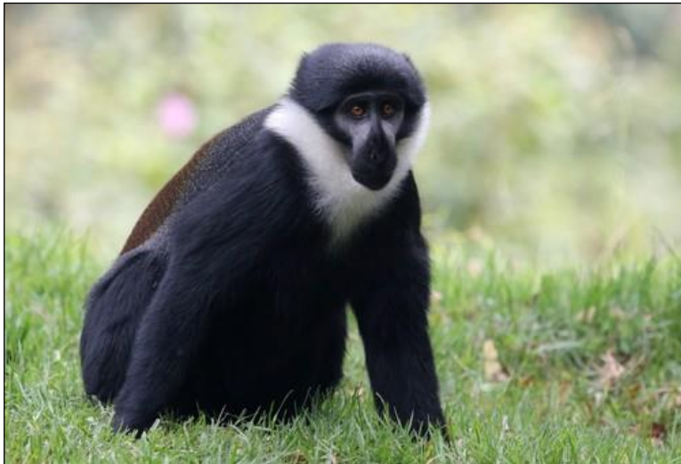
L'Hoest's Monkey

inhabitant! At night we may encounter Demidoff's and Thomas's Galagos (more commonly known as bushbabies) and African Wood Owl; all of which are usually resident around our accommodations in the forest.