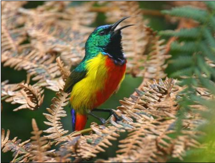
Regal Sunbird

this skulker – one of the Albertine Rift endemics. Other understory birds we hope to see include displaying African Broadbill, Black-faced Prinia and the handsome but shy Black-faced Rufous Warbler. The mid-storey and canopy support Elliot's and Tullberg's Woodpeckers, Cabanis's, Kakamega and Anson's Greenbuls, the enigmatic Chapin's Flycatcher and White-browed Crombec. The rare Jameson's Antpecker may also be seen probing under moss on dead branches or gleaning warbler-like in the canopy, though finding this localised species requires immense luck, while Scarce Swifts forage over the forest. Birding at Buhoma is a truly magical experience!