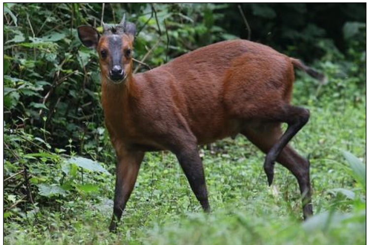
Black-fronted Duiker

We will also search for Crested and Coqui Francolins, Emerald-spotted Wood Dove, Red-chested, Jacobin, Levillant's, and African Cuckoos, Blue-naped Mousebird, Lilac-breasted Roller, Striped Kingfisher, Green Wood Hoopoe, Common Scimitarbill, Spot-flanked Barbet, Bearded and the uncommon Golden-tailed Woodpeckers,