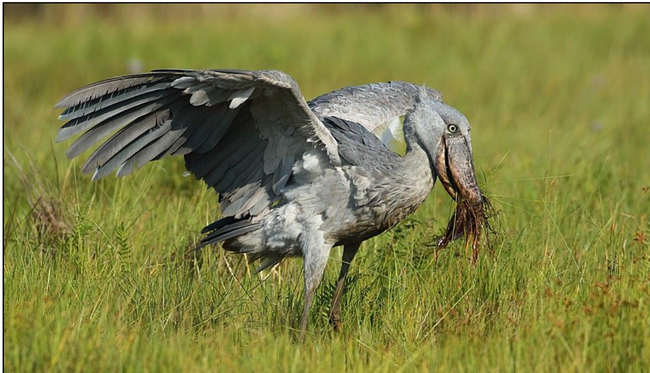
Shoebill by Markus Lilje

Day 1: Arrive in Entebbe. Today is set aside as an arrival day in order for us to make an early start the following morning. Upon arrival at Entebbe International Airport, you will be met and transferred to our accommodations for the night. Time permitting, we may visit the Entebbe Botanical Gardens, situated just a short distance away from our hotel. Our primary target here is the gorgeous Orange Weaver – small, loose breeding colonies are usually present in the trees at the very edge of Lake Victoria. Other conspicuous species in the botanical gardens include both Ross's and Great Blue Turacos, the scarce Orange-tufted Sunbird, Grey Parrot, Eastern Plaintain-eater, Black-and-white Casqued Hornbill, and the Woodland Kingfisher. Overhead we will watch for Hooded Vulture, Yellow-billed Kites, and Pied Crows and we'll certainly find the grotesque-looking Marabou Stork. In a small remnant patch of forest, we may also find Guereza – an incredibly striking black-and-white primate with a long bushy tail. Thereafter, we return to the hotel for the evening, and a scrumptious welcoming dinner.