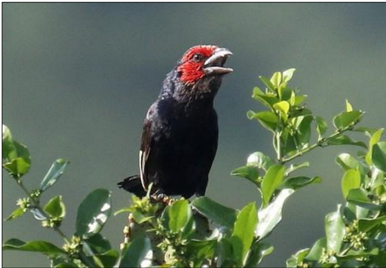
Red-faced Barbet by Daniel Danckwerts

several swallows including Lesser Striped, Red-breasted, Mosque, Red-rumped and White-headed Saw-wing, Black Cuckooshrike, White-browed Scrub Robin, Trilling Cisticola, the meadowlark-like Yellow-throated Longclaw, Chinspot Batis, Yellow-billed Oxpecker, Grey Penduline Tit, Arrow-marked Babbler, Brubru, Wattled Starling, Greater Blue-eared Starling, Marico Sunbird and Red-headed Weaver. Papyrus swamps and other overhanging vegetation along the edge of Lake Mburo may yield sightings of Black-crowned and the shy White-backed Night Heron, confiding African Fish Eagle, African Finfoot and Greater Swamp Warbler.