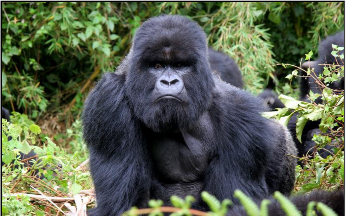
Mountain Gorillas by Adam Riley

From the source of the White Nile on Lake Victoria to the snow-capped Ruwenzori Range and the montane splendours of Bwindi Impenetrable Forest, harbouring some of the last remaining Mountain Gorillas, Uganda is an equatorial country of astonishing contrasts. No other area in Africa can match its amazing diversity of habitats (all in an area approximately the size of Great Britain!), and this richness is reflected in its incredible bird list of over 1,000 species, making it arguably the richest African birding destination. Amongst these are many highly sought-after species such as the unique Shoebill and the chance to track both Mountain Gorillas and Chimpanzees!