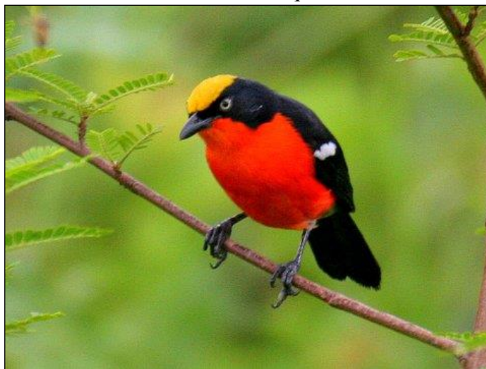
Papyrus Gonolek by Adam Riley

Day 1: Arrive in Entebbe. Today is set aside as an arrival day in order for us to make an early start the following morning. Upon arrival at Entebbe International Airport, you will be met and transferred to our accommodations for the night. Time permitting, we may visit the Entebbe Botanical Gardens, situated just a short distance away from our hotel. Our primary target here is the gorgeous Orange Weaver – small, loose breeding colonies are usually present in the trees at the very edge of Lake Victoria. Other conspicuous species in the botanical gardens include both Ross's and Great Blue Turacos, the scarce Orange-tufted Sunbird, Grey Parrot, Eastern Plaintain-eater, Black-and-white Casqued Hornbill, and the Woodland Kingfisher. Overhead we will watch for Hooded Vulture, Yellow-billed Kites, and Pied Crows and we'll certainly find the grotesque-looking Marabou Stork. In a small remnant patch of forest, we may also find Guereza – an incredibly striking black-and-white primate with a long bushy tail. Thereafter, we return to the hotel for the evening, and a scrumptious welcoming dinner.