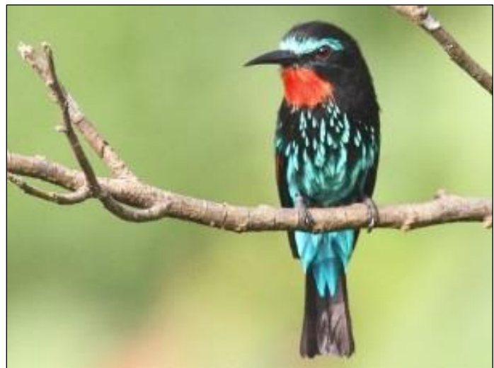
Black Bee-eater

We will spend the balance of our time here birding the trails leading out from the camp. Species we will search for include Olive Long-tailed Cuckoo, Bar-tailed Trogon, Dusky Tit, Abyssinian (Kivu) Ground Thrush, White-bellied Robin-Chat, Equatorial Akalat, rare Grey-chested Babbler, Red-throated Alethe, White-bellied Crested Flycatcher, White-eyed Slaty Flycatcher, Northern Double-collared Sunbird, Willcocks's Honeyguide, newly described Willard's Sooty Boubou, Black-billed Weaver and Magpie Mannikin. High exposed perches in the open forest are favoured by African Goshawk, the dazzling Black Bee-eater, Sooty Flycatcher and forest starlings including Waller's, Stuhlmann's and Narrow-tailed. One of Bwindi's star avian attractions is the diminutive, pitta-like Neumann's Warbler, a vocal yet very secretive bird! We will require luck and patience to see