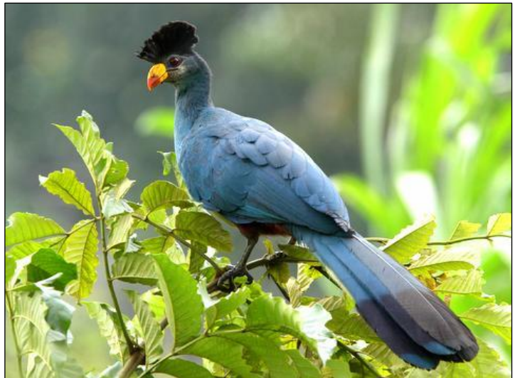
Great Blue Turaco by Jonathan Rossouw

Day 3: Kibale NP – Chimpanzee tracking & birding. The towering Kibale Forest has the highest primate concentration and species diversity of any reserve in East Africa. Primate highlights might include sightings of localised Central African Red Colobus, handsome L'Hoest's Monkey and the scruffy Ugandan Grey-cheeked Mangabey. We will also embark on a Chimpanzee trek and our chances of finding these, one of our closest living relatives, are excellent! The birds are typical of the medium-altitude forest, with excellent mixed species flocks and specials such as Afep and the rare and globally threatened White-naped Pigeon, Red-chested Owlet, Blue-throated Roller, Narina Trogon, African Shrike-flycatcher, Scaly-breasted and Brown Illadopsis, Superb and Green-headed Sunbirds, Black-billed Turaco, Plain Greenbul, Chestnut Wattle-eye and Black-and-white Mannikin. The stunning Green-breasted Pitta also occurs in this forest, however, a pre-dawn start and a good deal of luck and perseverance will be needed to locate this mythical low-density understory