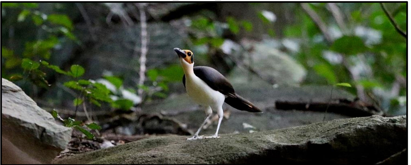
White-necked Rockfowl