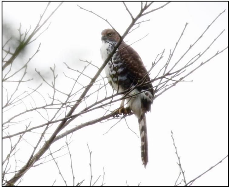
Long-tailed Hawk by Leslie Clapp

We made our way back south again, visiting Bobiri Forest Sanctuary en route to Atewa. Bobiri produced new birds such as African Piculet, Grey Parrot, Preuss's Weaver, White-headed Wood Hoopoe, Copper-tailed Starling and the impressive Red-billed Helmetshrike. We then hiked up the Atewa Range and had great looks at our target, Blue-moustached Bee-eater! Other fantastic sightings here were Little Green Woodpecker, Kemp's Longbill, African Hobby and even a male Yellow-throated Cuckoo! A perfect send-off back to Accra where we said our good-byes until we meet again with fond memories of a great tour!