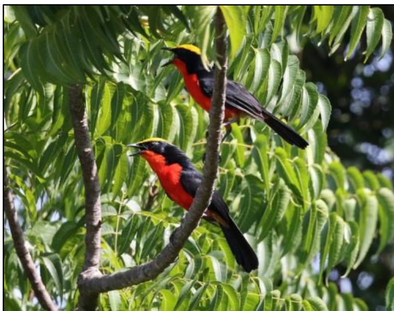
Yellow-crowned Gonolek by Leslie Clapp

Our next stop was Nsuta forest and the area proved to be fruitful in providing Olive Long-tailed Cuckoo, Black Dwarf Hornbill, Chocolate-backed Kingfisher and the spectacular Long-tailed Hawk. We then headed to our next forest destination, Ankasa!