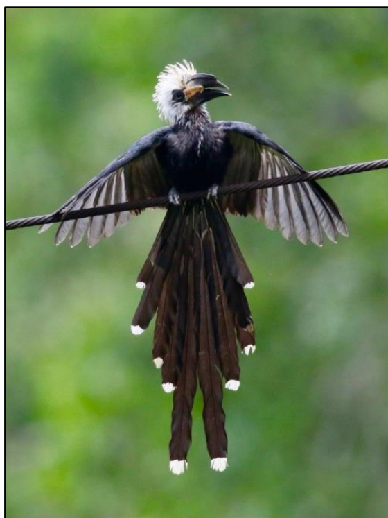
White-crested Hornbill

The time had finally come! We acclimatized ourselves in the busy city of Accra before starting our adventure of this beautiful country. We met one another and made our way north-east to the Volta Dam and Kalakpa Forest Reserve. We had some great sightings here, most memorable being the expedition into the finding of the mythical Nkulengu Rail. We listened out for their earie call and some skillful tracking saw us finding 3 birds roosting near a swamp in the middle of the forest! Other great birds here were Red-cheeked Wattle-eye, Narina Trogon, Cassin's Hawk-Eagle, White-crested Helmetshrike and a stunning Long-tailed Nightjar!