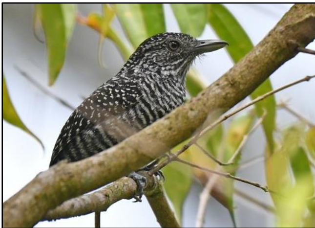
Bar-crested Antshrike

Next morning everyone was up and ready early to start our Colombian birding experience. Heading off early towards Pedro Palo meant that we could traverse the sleeping Bogota, practically without traffic. Patchy forest near the lake itself is a very birdy environment with several target birds. Immediately when we got out of the bus birds were active. Black-capped, Scrub and Blue-necked Tanagers indicated that the flock for Turquoise Dacnis was around. A flock of several White-throated Toucanets had one Crimson-rumped Toucanet lingering around. The big