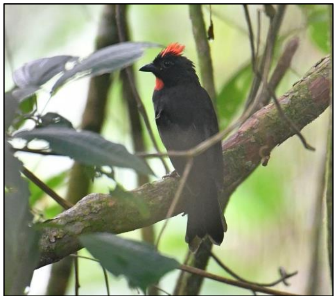
Sooty Ant Tanager

We also saw Bar-crested Antshrike, Buff-breasted Wren, Sooty-headed Tyrannulets, Ochre-bellied Flycatcher Plain-colored Tanagers and beautiful Yellow-tufted Dacnises amongst others. With full bellies we continued towards Rio Claro and the lowlands of Magdalena Valley – where we might have time to bird the last light of the day with a new set of birds waiting for us. We arrived just before the sun dropped below the horizon. We walked along the river that had carved its way through the steep limestone hills. This fabulous walk offered us wonderful views of endemic Magdalena Antbird, yelping Yellow-throated Toucans, Rufous-breasted Hermit, ethereal song