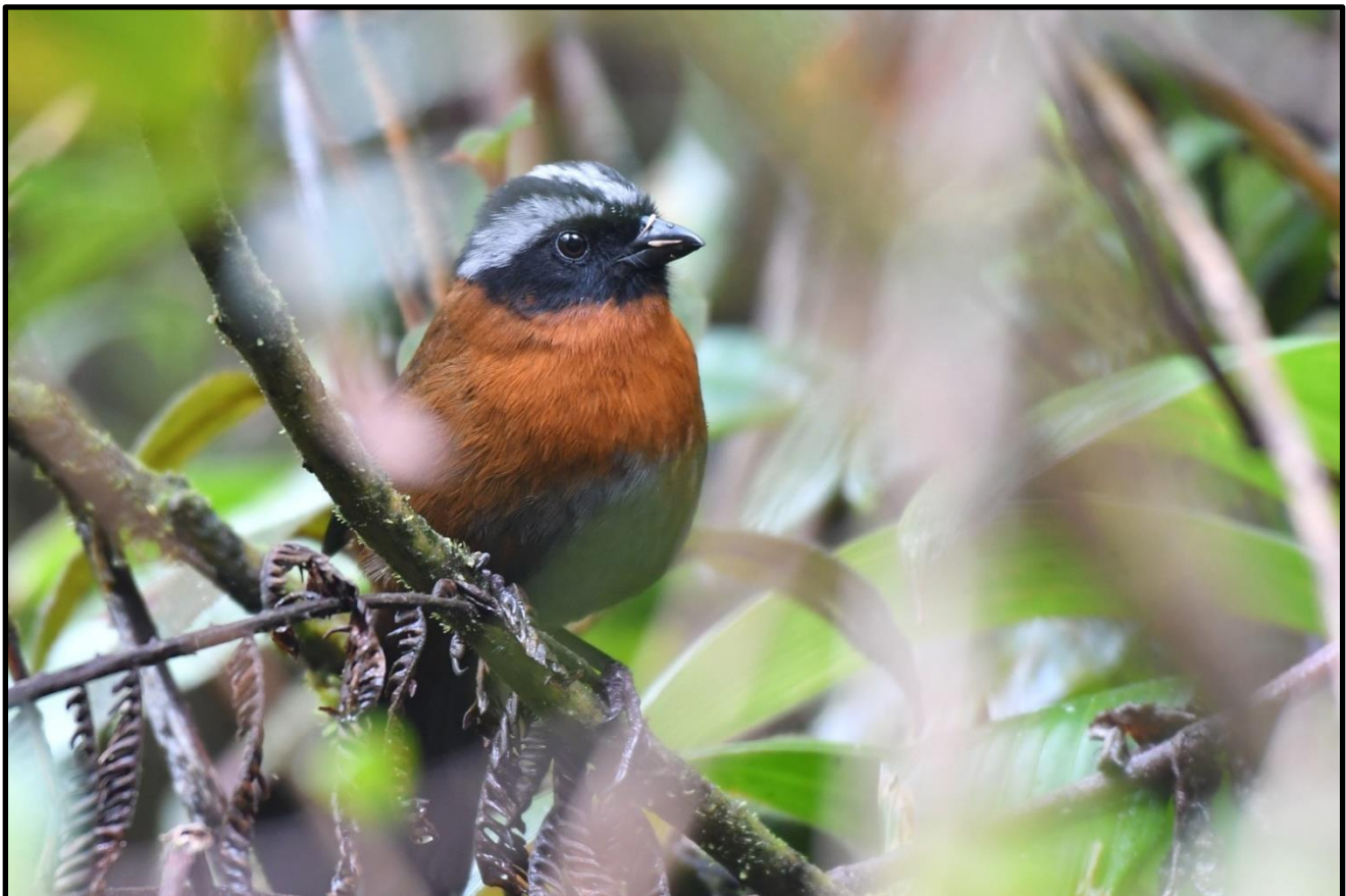
Tanager Finch