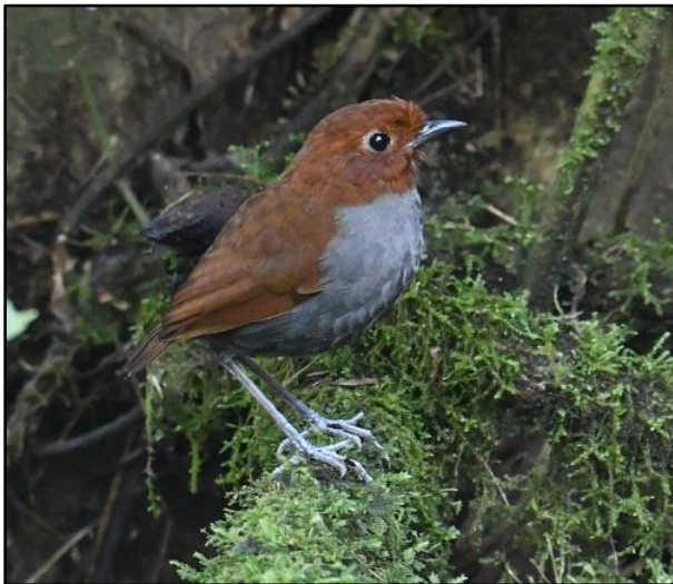
Bicolored Antpitta

With no time to waste we drove directly to Observatorio and had lunch there. It is very pleasant to eat lunch watching Blue-throated Starfrontlets, amazing Great Sapphirewings, Green-tailed and Black-tailed Trainbearers, Glowing Pufflegs and unbelievable Sword-billed Hummingbird. Rewarding birding day ended with not so rewarding and long travel by air and bus to Manizales. 70 species.