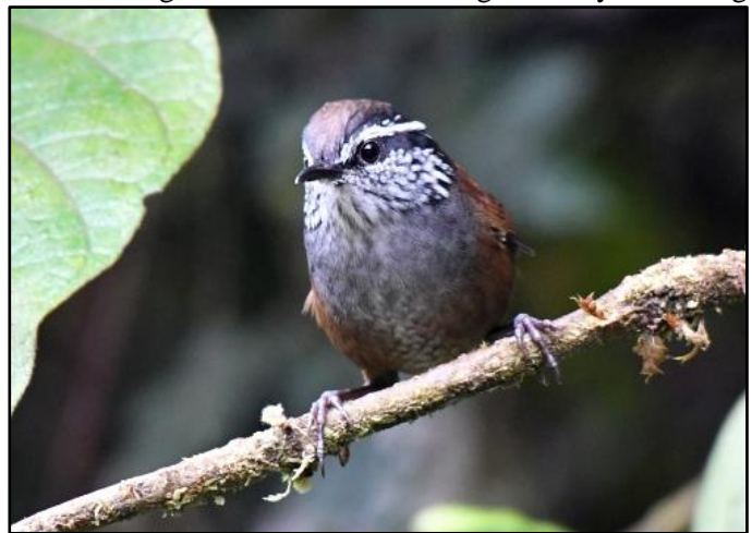
Munchique Wood Wren