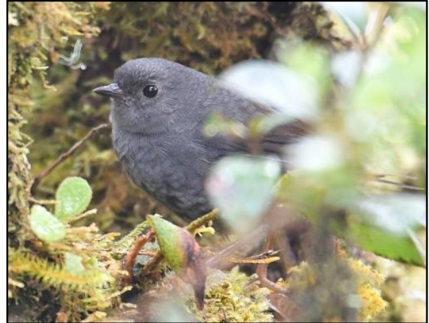
Pale-bellied Tapaculo by Tuomas Seimola

Visit to Rio Blanco reserve is always full of surprises, antpittas, a wide variety of Andean montane forest birds and sometimes visitors are rewarded with some real rare gems. We had the full day from dawn to nightfall at the reserve. Time was well spent and we enjoyed several vibrant mixed species flocks moving along the roadside vegetation including several species of tanagers, Capped Conebills, Grey-hooded Bush Tanagers, Black-eared and Black-capped Hemispinguses, Montane Woodcreepers, Streaked Tuftedcheeks, Streak-headed Antbirds and as one of the day's stars, an amazing close view of a Plushcap. Several tyrant flycatchers were also nicely seen, Pale-edged and