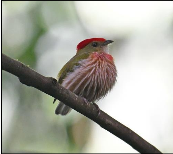
Striolated Manakin