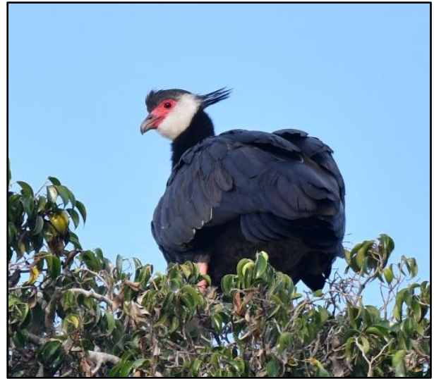
Northern Screamer

We kicked off the tour, as usual, with an introductory dinner in Bogota. It was evident that there was a lot of birds on the wish lists of everyone.