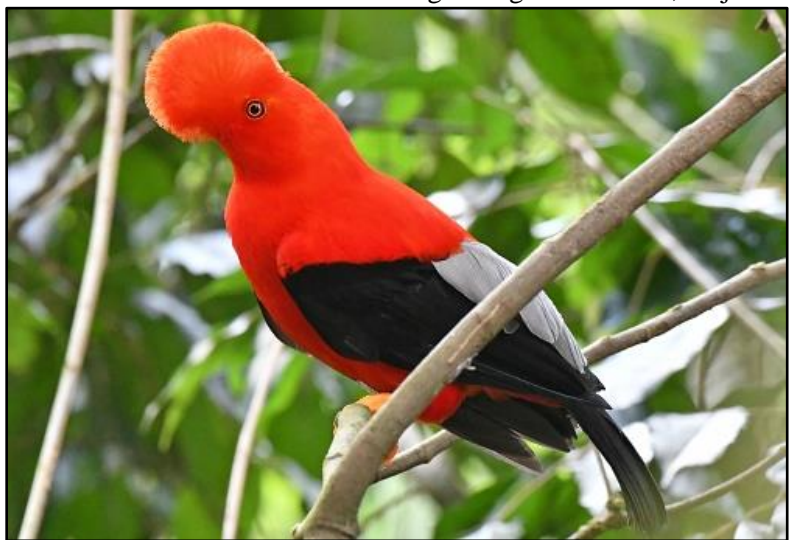
Andean Cock-of-the-rock by Tuomas Seimola

We still had big plans for our last morning of the tour to clean up the species at Rio Claro. Mother nature had unfortunately different ideas and we were completely washed out! Torrential rain during the night was so hard that several cabins were flooding, and we could only bird in our hotel garden for half an hour. We still managed to get few new species