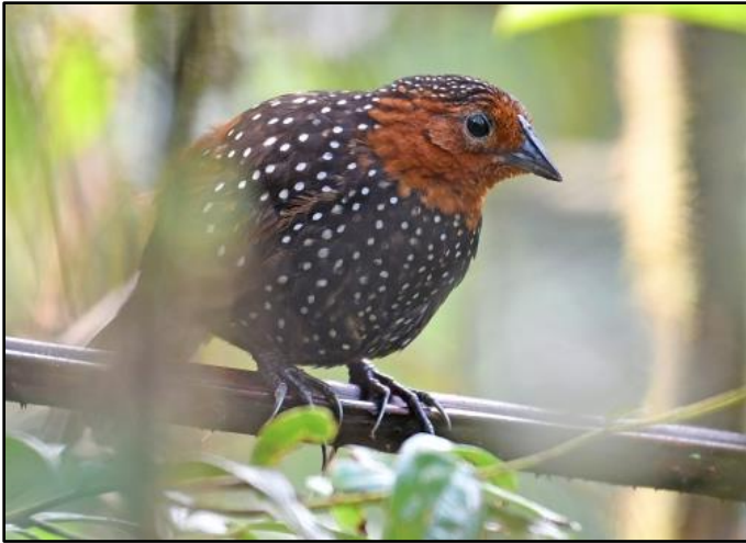
Ocellated Tapaculo by Tuomas Seimola