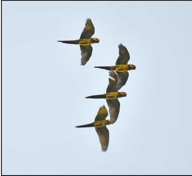
Yellow-eared Parrots