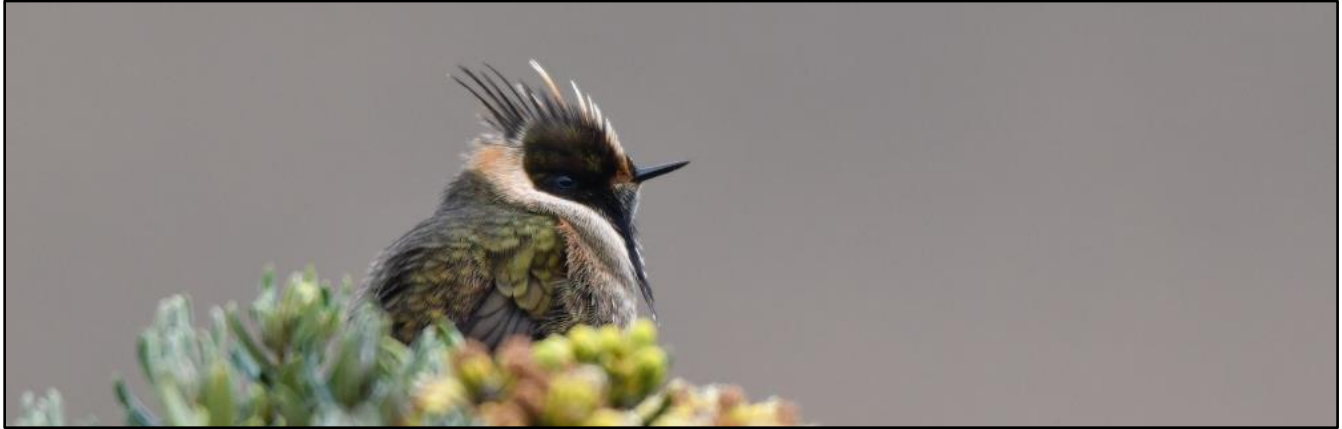
Buffy Helmetcrest by Tuomas Seimola

Rufous-breasted Flycatchers, Rufous-crowned Tody Flycatchers and Slaty-backed Chat-Tyrant all showed well. Famous antpittas were co-operative and we saw Chestnut-crowned, Bicolored, Slate-crowned and the endemic Brown-banded Antpitta. Lunch was enjoyed with the fabulous hummingbirds in the lodge. Bronzy Incas, Tourmaline Sunangels and others buzzed around us and Slaty Brushfinches enjoyed the rain. We were extremely lucky to witness a flock of twenty Rusty-faced Parrots feeding in a nearby tree - this is rarely seen species. Other stars of the day were flashy and noisy White-capped Tanagers and modest Dusky Piha. When the sun started setting, we headed a little higher to find owls and nightjars. Our effort was rewarded with calling Rufous-bellied Nighthawk and Band-tailed Nightjar. White-throated Screech Owl sang, but we were never able to locate it for views. Full day in Rio Blanco produced more than 90 species with some unforgettable moments.