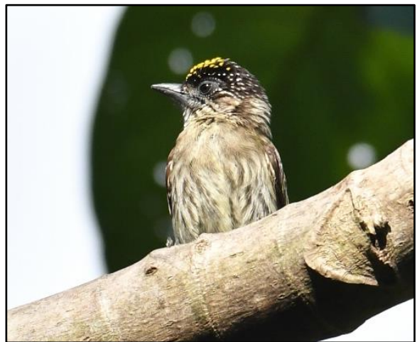
Greyish Piculet

Our day started well before sunrise with a longish drive up to the reserve which gave us some more time to continue sleeping