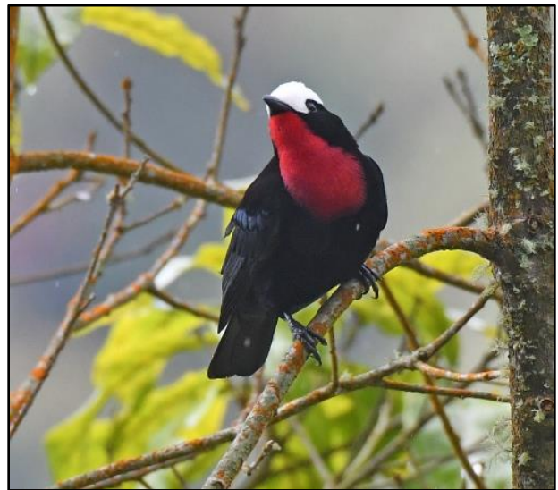
White-capped Tanager by Tuomas Seimola

Yellow-eared Parrot is one of the most iconic Colombian birds. It used to be found in Ecuador, but nowadays it is a