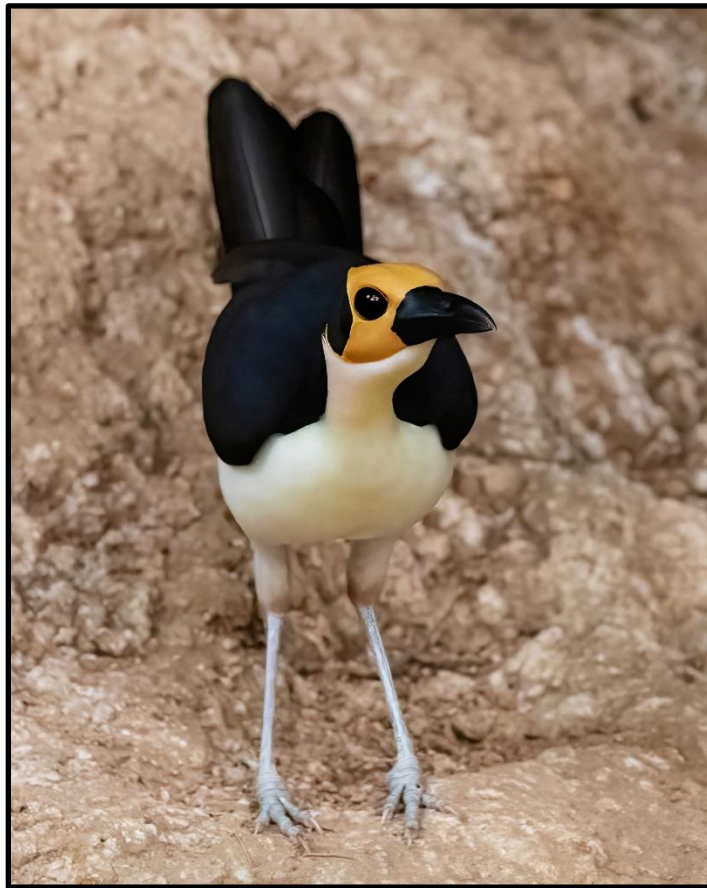
White-necked Rockfowl