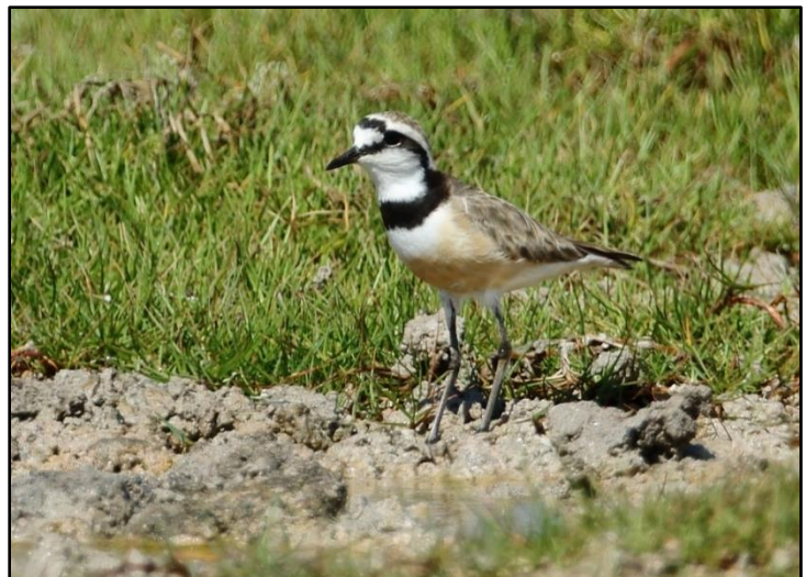
Madagascar Plover

Early the next morning, we drove a short distance into the forest and met up with our local guides before venturing into this wonderful area. Walking along the sandy tracks we located a splendid pair of Madagascar Sparrowhawk – actually much rarer than field guides suggest, Subdesert Mesite seen nesting, a stunning Running Coua, Madagascar Nightjar at a day roost, magnificent Long-tailed Ground Roller, Lafresnaye's and bizarre Sickle-billed Vanga, Archbold's Newtonia and Thamnornis. After a wonderful early morning birding as well as opportunities to photograph the Baobabs, Didiera and other quaint plants, we visited the local salt pans.