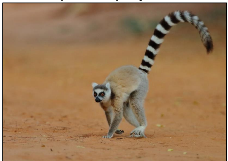
Ring-tailed Lemur

Our full day at Berenty was superb as we found the Madagascan Sandgrouse which had eluded us earlier, a superb Madagascan Cuckoo, Giant Coua, France's Sparrowhawk, day roosts of both owls and of course the lemurs. We had cracking views of "Dancing Sifaka", the Verreaux's Sifaka as they cross open areas. Ring-tailed Lemurs and Red-fronted Brown Lemurs also showed