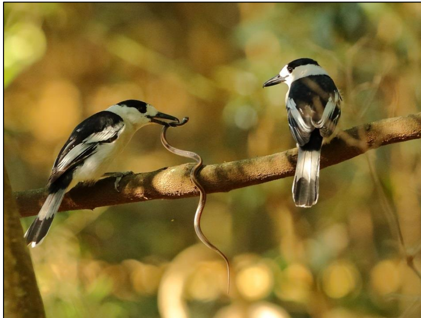
Hook-billed Vanga with prey