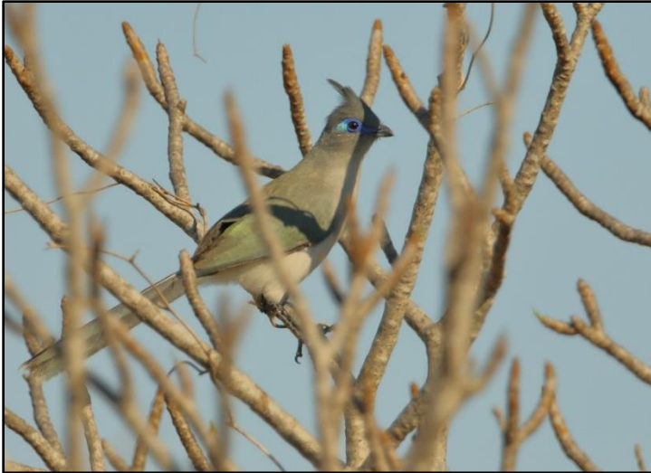
Verreaux's Coua

Returning to Tulear, we were able to rest a little in the early afternoon. Once it cooled down, we