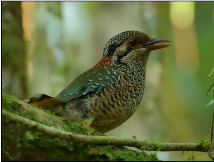
Scaly Ground Roller

We started off our adventure at Lac Alarobia in the capital, Antananarivo. Here, we found huge numbers of waterfowl including several of the sought-after endemic, Meller's Duck, plus Knob-billed Duck, hundreds of Red-billed Teal and White-faced Whistling Duck. We also observed several breeding plumaged Malagasy Pond Heron, confiding White-throated Rail, Malagasy Coucal and Malagasy Kingfisher. Over a delicious dinner, we discussed the plans for the days ahead, before getting a good night's sleep.