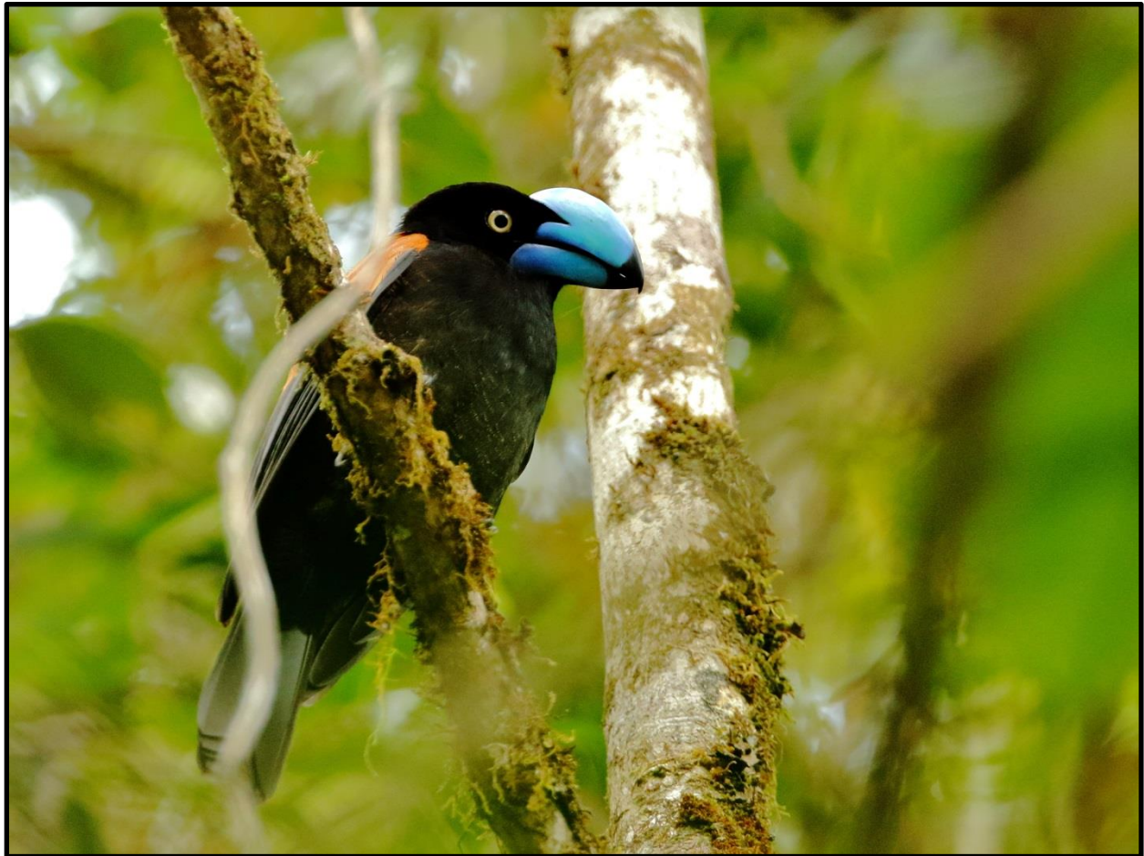
Helmet Vanga