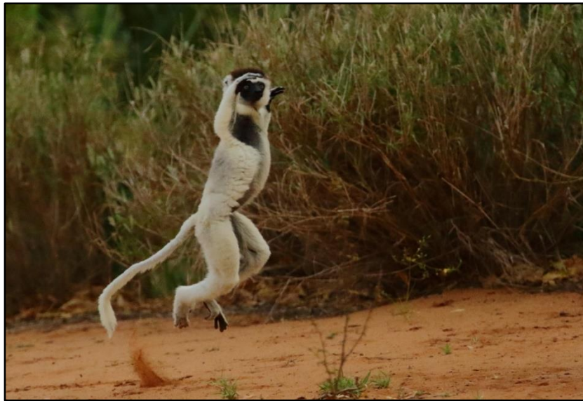
Verreaux's Sifaka

And so ended this fabulous adventure! We travelled to Tana airport in order to catch our international flights home. Thanks must go to our wonderful, enthusiastic and fun guests, great site guides, as well as a superb ground operations team. We hope to see you on another fabulous adventure soon!