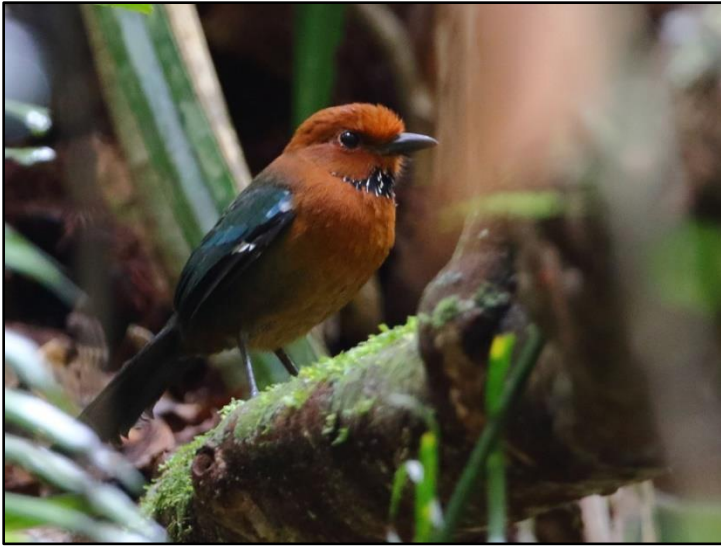
Rufous-headed Ground Roller

views and then a Pitta-like Ground Roller called nearby. As we sought out the Pitta-like, I caught movement in the undergrowth and to my surprise spotted a Scaly Ground Roller which after some effort showed well for all. After a little coaxing the Pitta-like obliged and came closer and suddenly there was a flurry of movement and there was not one or two Pitta-like but four. What a treat! All three ground rollers found in just twenty minutes; a tour leader's dream come true. I couldn't have scripted it