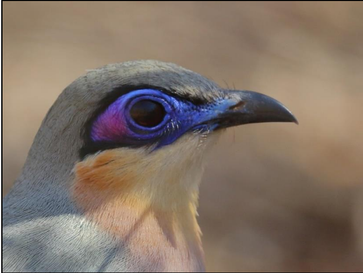
Running Coua

On our final morning in the rainforest, we returned to Mantadia, where we enjoyed great views of the low-density Henst's Goshawk, a superb Hook-billed Vanga, Madagascar Grebe and a family of Black-and-white Ruffed Lemur. On the drive back to our lodge, we enjoyed further views of a family of Indri.