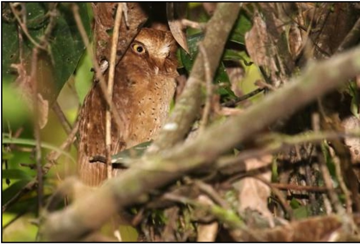
Serendib Scops Owl

We arrived at the roost site of the Serendib Scops Owl to find that the bird had moved a few feet but, after some careful positioning, we enjoyed delightful views of this recently discovered species. Next, we trekked to the Sri Lanka Bay Owl. Again, it took some careful positioning, but we eventually found the right angle and had terrific views of this mega bird; certainly, one of the hardest species on the island! As we made our way back for a late lunch, a Sri Lanka Junglefowl crossed our path and proved especially confiding allowing a close