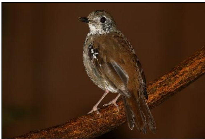
Spot-winged Thrush

Early the following morning, we embarked on a pre-breakfast birding excursion to the Miriswalathanna Road. Our efforts were centred around finding the endemic Chestnut-backed Owlet, though this species was left totally unrewarded for the time being. We did, however, enjoy sightings of several more Red-backed Flamebacks, Spot-winged Thrush, Orange-billed Babbler, Sri Lanka Hanging Parrot, Sri Lanka Swallow, and a brief Sri Lanka Junglefowl for all this time. Other interesting species included an all-too-quick Pale-billed Flowerpecker, Common Iora, and Green Warbler. Heading back in for breakfast, we were met with the excellent news that both Serendib Scops Owl and Sri Lanka Bay Owl had been found on day roosts; we were off like a flash! The long hike to the owls involved several small stream crossings, as well as a river crossing by means of a large pontoon. En route to the forest, we encountered our first Stork-billed Kingfisher and Black Eagle. The endemic Brown-capped Babbler also showed particularly well in a tea plantation. Once in the forest, we found our first Black-naped Monarch, Large-billed Leaf Warbler, and Indian Paradise Flycatcher.