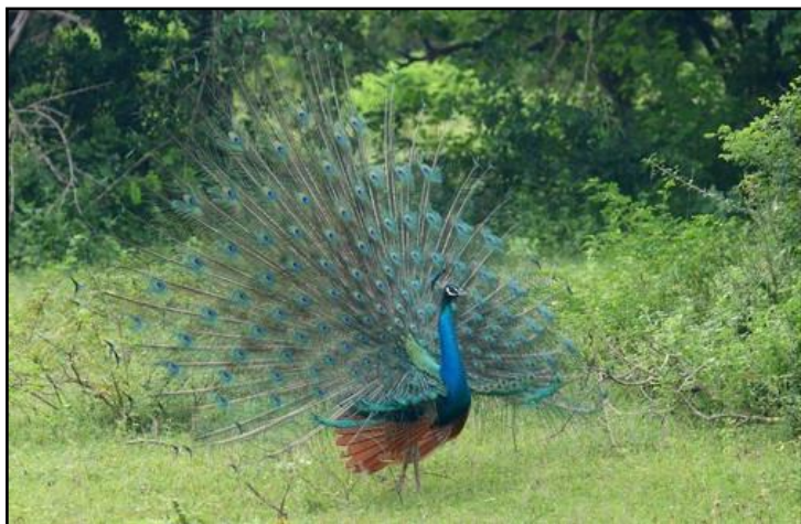
Indian Peafowl

As a final backup for the nightjars, we decided on an early morning excursion. This proved most successful and we were rewarded with sightings of both Jerdon's and Indian Nightjars, Indian Pitta,