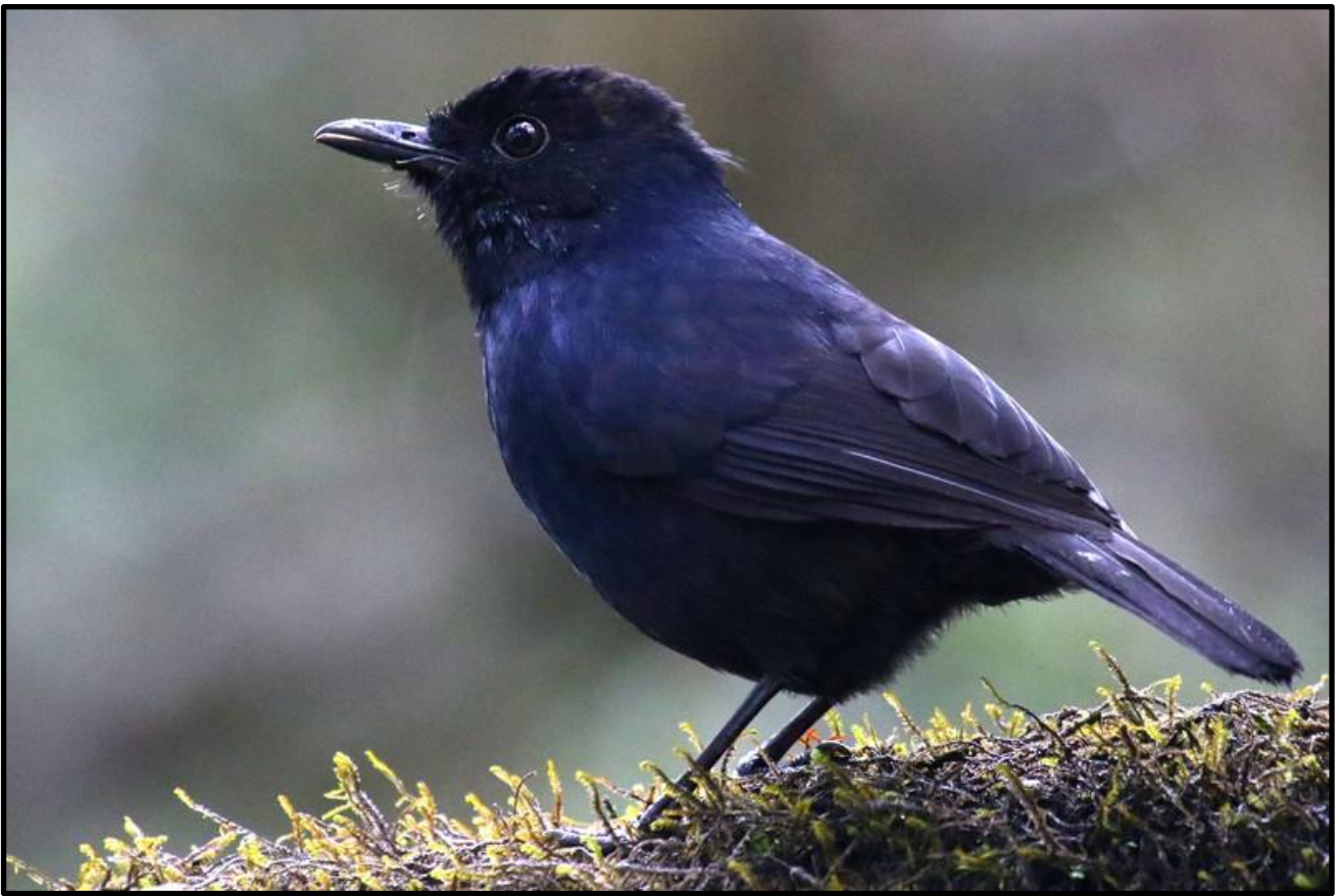
Sri Lanka Whistling Thrush