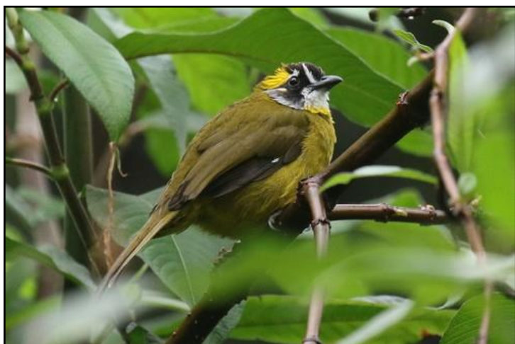
Yellow-eared Bulbul

calling endlessly but – try as we may – we simply couldn't see the bird. A pair of equally as scarce Black-throated Munias were seen in a nearby marsh, serving as a welcomed consolation prize. Further