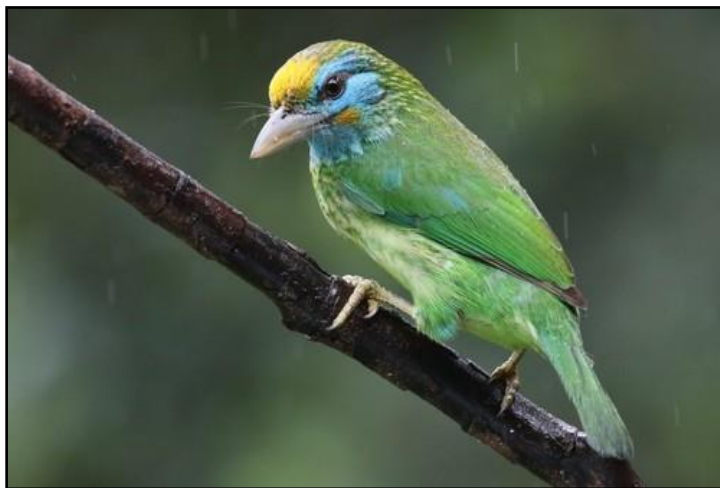
Yellow-fronted Barbet