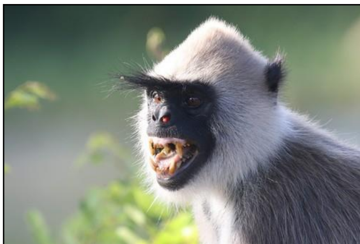
Tufted Grey Langur