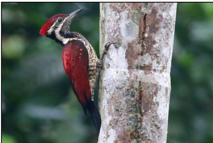
Red-backed Flameback

The tour started in the city of Colombo, Sri Lanka's bustling capital set in an incredibly beautiful tropical setting. Those that arrived early took the opportunity to walk through the gardens of our