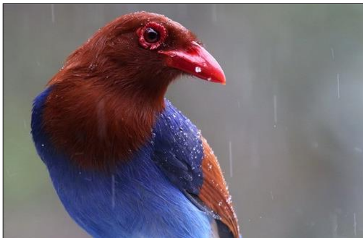
Sri Lanka Blue Magpie

Frogmouth on a day roost to just name a few. The tour culminated with a hike to see a roosting pair of Serendib Scops Owls and our efforts were met with an extreme close-up view of a pair of birds perched side by side. We were drenched in the process, but all agreed that this was a most fitting end to our final full day of birding on this phenomenal tour.