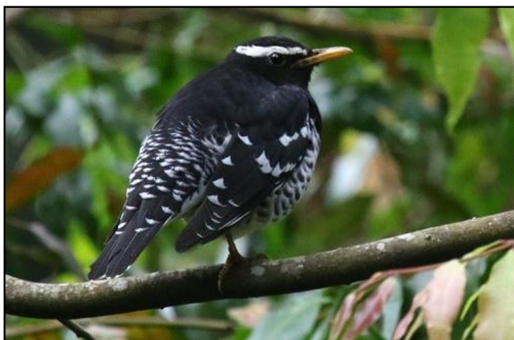
Pied Thrush

The next day, before it was light, we drove out to the nearby Yala National Park. This reserve is famous for supporting one of the highest densities of Leopard anywhere in the world and we were treated to fabulous views of this spectacular animal. Other notable finds for the day including Indian Hare, Sambar, Chital, Wild Boar, at least 5 Golden Jackals, Asian Elephant, Bengal Monitor, and Mugger Crocodile. Not forgetting the birds, we enjoyed nearly 100 species in total, but our best find of the day was Sri Lanka's third confirmed