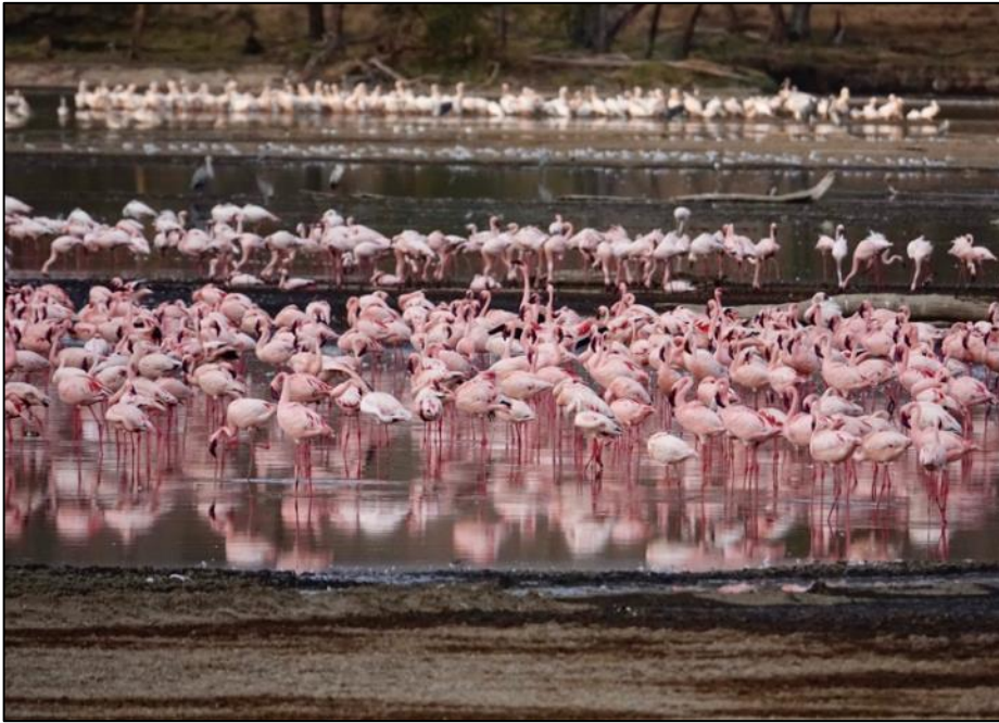
Lesser Flamingos at Lake Nakuru by Nigel Redman

Waxbill, African Silverbill, Cut-throat Finch, Parrot-billed Sparrow and Somali Bunting.