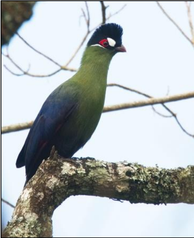
Hartlaub's Turaco by Forrest Rowland

Nairobi to Mount Kenya. Birding starts almost immediately, as we depart Nairobi en route to Mount Kenya, there is a distinct possibility of sighting Speckled Mousebird, Red-fronted Tinkerbird, Spot-flanked Barbet, Lesser Striped Swallow, Capped Wheatear, Abyssinian Thrush, Red-faced Crombec, White-eyed Slaty Flycatcher, African Paradise Flycatcher, Collared and Variable Sunbirds, Pale White-eye, White-browed Sparrow-Weaver, Spectacled Weaver, Red-cheeked Cordon-bleu, Streaky Seedeater and African Citril. We will also search for the endemic Hinde's Babbler on the lower slopes of Mount Kenya.