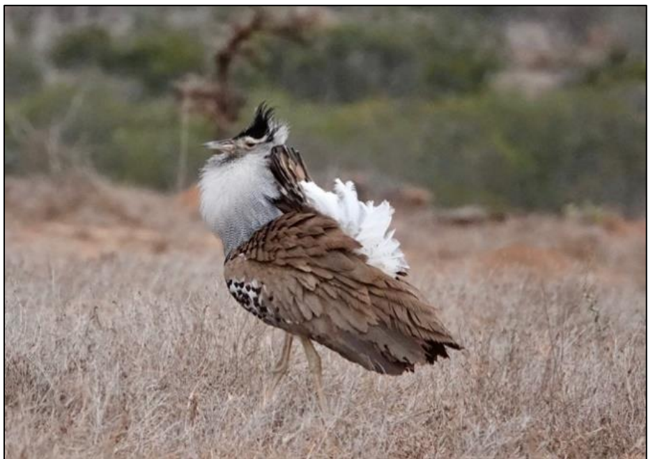
Kori Bustard displaying by Nigel Redman

Some of the special birds that we will search for in the desolate but beautiful semi-desert scrub and riverine vegetation during these two days include Somali Ostrich, the strange and colourful Vulturine Guinea fowl, Somali Courser, Lichtenstein's Sandgrouse, White-throated and Somali Bee-eaters, Grant's Wood Hoopoe, the localised White-headed Mousebird, Eastern Yellow-billed and Von der Decken's Hornbills, Greater Honeyguide, Black-throated Barbet, Fan-tailed Raven, Red-winged, Pink-breasted and Foxy Larks, Brown-tailed Rock Chat, Yellow-vented Eremomela, Grey Wren-Warbler, the strange scrub-dwelling Red-fronted Warbler, Rufous Chatterer, Pygmy Batis, Acacia Tit, Northern Puffback, Rosy-patched Bushshrike, the breathtaking Golden-breasted and quirky Bristle-crowned Starlings, Fischer's Starling, Golden Pipit, Black-bellied and Hunter's Sunbirds, Straw-tailed Whydah, Black-capped Social Weaver, White-headed Buffalo Weaver, Donaldson Smith's Sparrow-Weaver, Golden Palm Weaver, Chestnut Weaver, Crimson-rumped