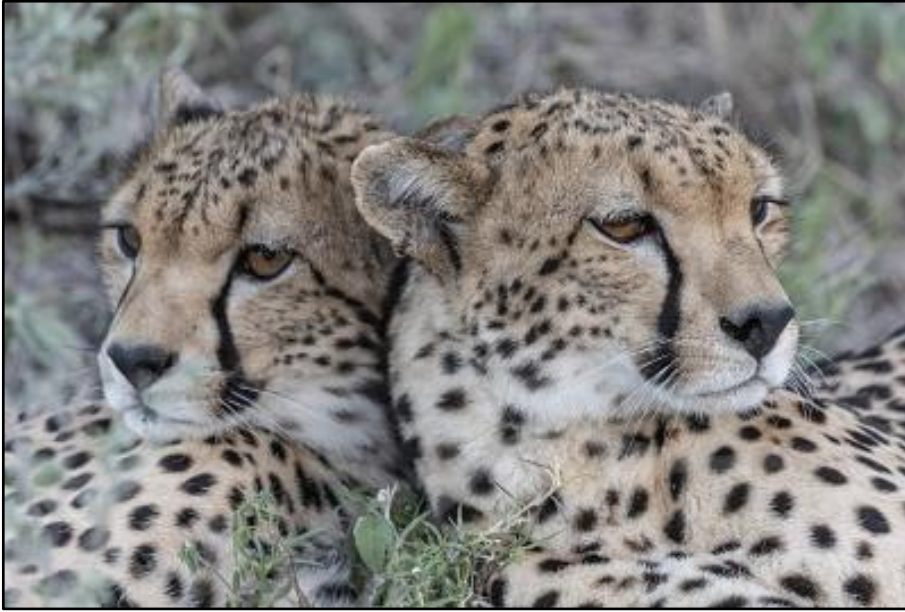
Cheetah

panoramas. As for the birding opportunities, the Mara is world-renowned, providing almost unparalleled opportunities to see Rufous-bellied Heron, Temminck's Courser, Red-necked Spurfowl, Black Coucal, Schalow's and Ross's Turacos, Bare-faced Go-away-bird, Southern Ground Hornbill, Usambiro Barbet, Green-backed and African Grey Woodpeckers, Flappet and Rufous-naped Larks, Rosy-throated Longclaw, Long-billed Pipit, Sooty Chat, Northern Black Flycatcher, Green-capped Eremomela, Yellow-bellied Hylia, Red-throated Tit, Hildebrandt's Starling, Swahili Sparrow and Yellow-mantled Widowbird. The Mara is also