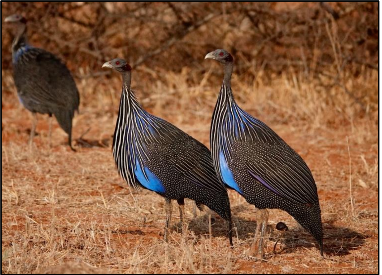
Vulturine Guineafowl by Nigel Redman

1 st February to 13 th February 2024 (13 days)