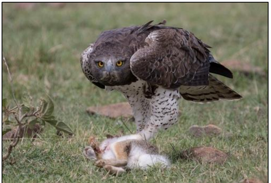
Martial Eagle

Samburu, Shaba & Buffalo Springs National Reserves. We have time to explore this trio of national reserves, Samburu, Buffalo Springs and Shaba. They boast a unique collection of game