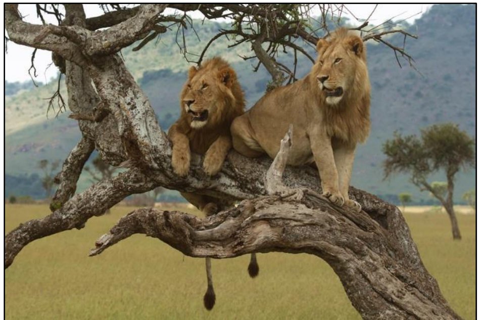
Mara Lions

As we head southwards, the countryside will become notably