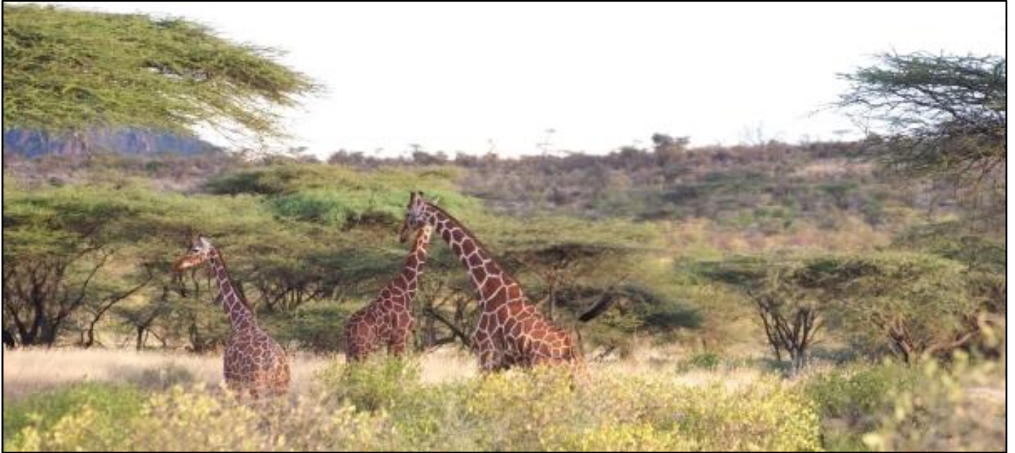
Reticulated Giraffe by Clayton Burne

only found in this region, including Reticulated Giraffe, the attractive Grevy's Zebra, Lesser Kudu, giraffe-necked Gerenuk and Beisa Oryx. These reserves consist of rugged mountains, acacia woodland and inhospitable lava plains dissected by strips of verdant riverine vegetation along the Ewaso Nyiro River, while isolated springs away from the river provide much needed water for the areas' faunal inhabitants.