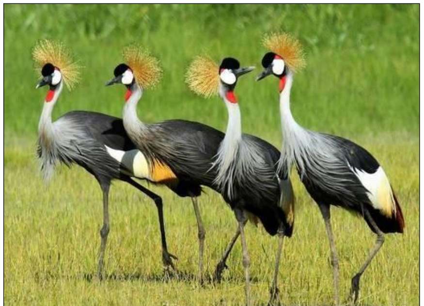
Grey Crowned Cranes

Not only is this a great place in which to find game, but the wide golden-green savannas, dotted with acacia trees, make it ideal for photography. The Mara is ravishingly beautiful and offers long, undisturbed views and utterly dramatic