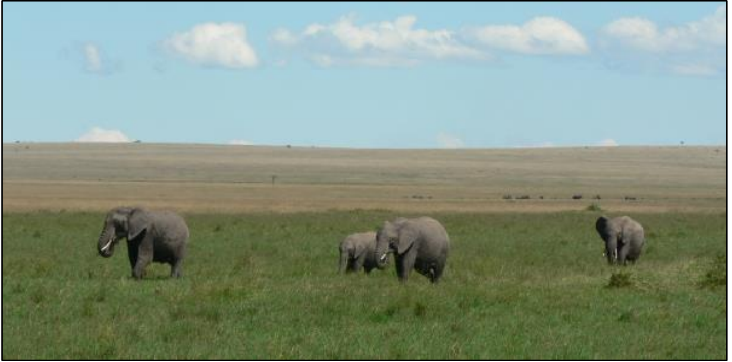
African Elephants on the Maasai Mara

drier and considerably less undulating. We should encounter our first tall and proud Maasai cattle-herders on the drive.