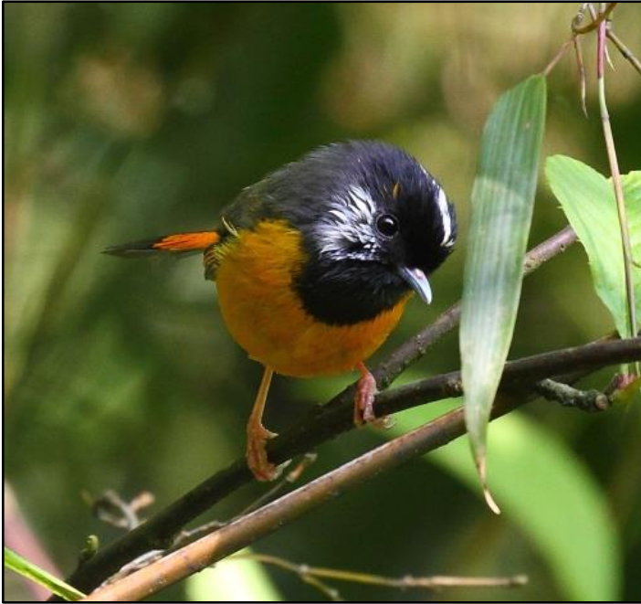
Golden-breasted Fulvetta by Glen Valentine

Nameri National Park. This wonderful reserve is contiguous with the Pakhui Wildlife Sanctuary in Arunachal Pradesh, together constituting an area of over 1 000km 2 (390 mi 2 ) of semi-evergreen forests, moist deciduous forest and narrow strips of grassland along the beautiful crystal-clear, boulder-strewn rivers.