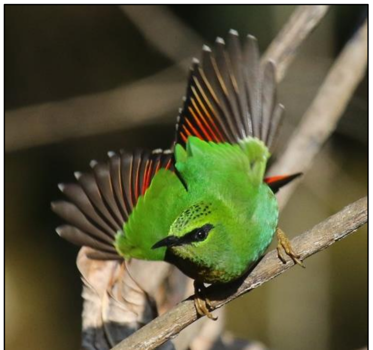
Fire-tailed Myzornis

Mandala Phudung. The higher elevations of Mandala Phudung hold several wonderful species and we will spend time scouring the area in search of