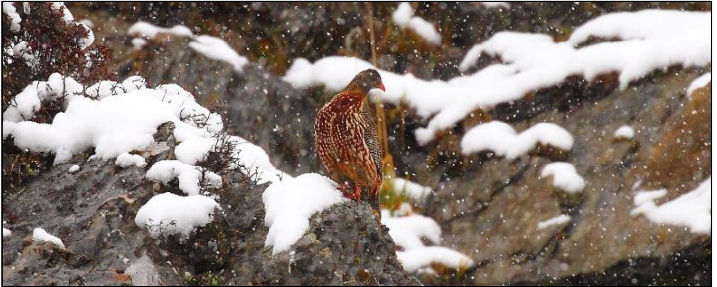
Snow Partridge

explore the splendours of Eaglenest, and we will visit a range of altitudes to enable us to find the host of excellent species that occur here.