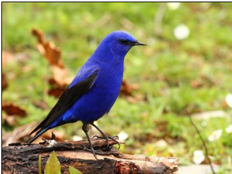
Grandala by Glen Valentine

Dirang to Eaglenest Wildlife Sanctuary. After departing Dirang, we'll make a few stops searching for very special and often elusive birds, including Black-tailed Crake, the rare Long-billed Plover and the shy and seldom-seen