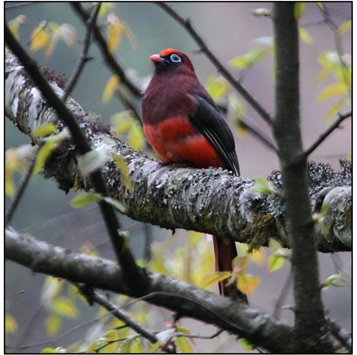
Ward's Trogon

Blyth's Kingfisher. We may also find Short-billed Minivet, Orange-bellied Leafbird, Black-chinned and Striated Yuhinas, Spot-winged Grosbeak, Rusty-fronted Barwing, difficult and shy Blue-winged and Scaly Laughingthrushes, immaculate Rufous-throated Wren-babbler, White-breasted Parrotbill and White-tailed Nuthatch.