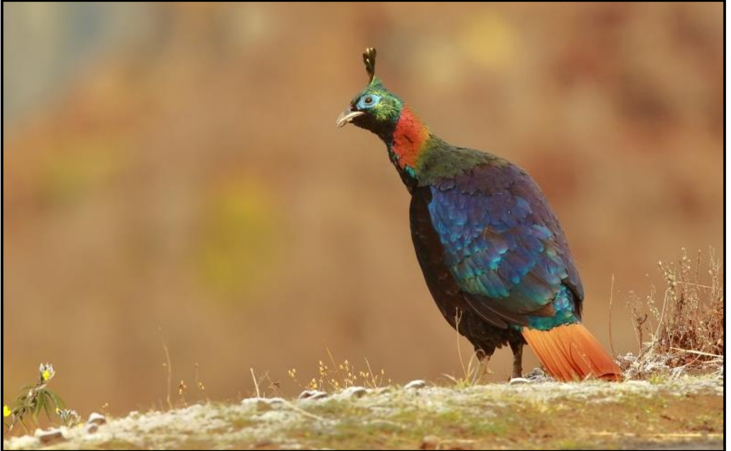
Himalayan Monal by David Hoddinott

1 st April to 14 th April 2024 (14 days)