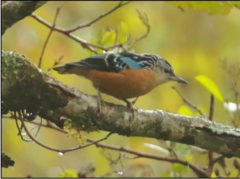
Beautiful Nuthatch

Sunbirds, Green Shrike-Babbler, Black-winged Cuckooshrike, Slaty-backed and Sapphire Flycatchers, and the scarce and attractive Fire-capped Tit. The forest undergrowth supports a range of specialities too and we will search hard for the secretive White-browed Shortwing, Pygmy, Scaly-breasted, Spotted and Rufous-throated Wren-Babblers, White-tailed Robin, minuscule Chestnut-headed, Grey-bellied and Slaty-bellied Tesias, as well as the rare and ultra-skulking Blue-fronted Robin.