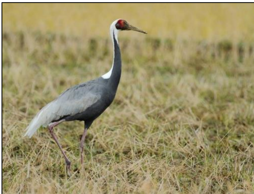
White-naped Crane

should be able to find them. Other mammals in the area include Corsac Fox, Daurian Pika, Mongolian Jird and the nocturnal Siberian Jerboa.