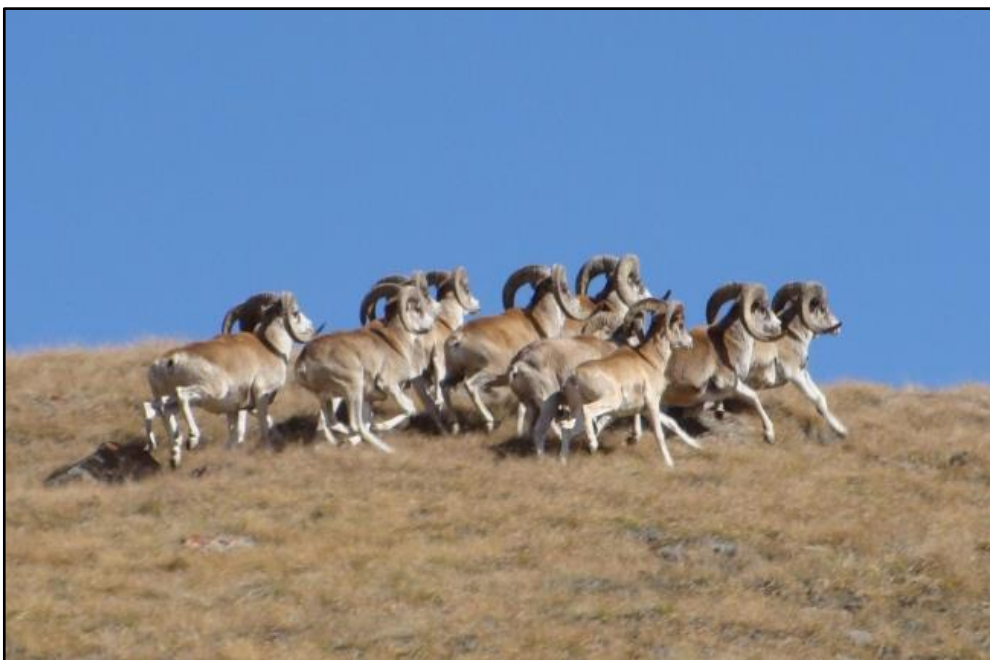
Argali by Askar Davletbakov

As one might expect, the birding in this area is also fabulous! This is a particularly good area for two special species, the localized Altai Snowcock and the wonderful Mongolian Ground Jay. Other highlights could include Chukar Partridge, Eurasian Eagle-Owl, Red-billed Cough, Black-throated and Red-throated Thrushes, Bluethroat, Red-flanked Bluetail, Guldenstadt's Redstart, Desert and Pied Wheatears, Isabelline Shrike, White-winged Snowfinch, Brown Accentor, Mongolian Finch and Pine Bunting. Overhead, we will keep a watchful eye for soaring Bearded Vulture, massive Cinereous Vultures, Steppe and Golden Eagles, Northern Goshawk and Saker Falcon.