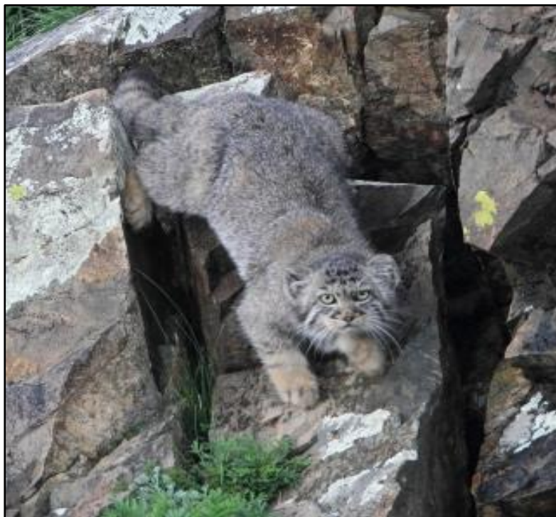
Pallas's Cat

Hustai National Park. The rolling hillsides here are most well-known for their population of Przewalski's Horse. The taxonomy of this species is still debated, but it is generally considered to be the last truly wild horse. Although it sadly went extinct in the wild, a captive breeding population was successful, and they have now been reintroduced into a handful of reserves within their historic range. Hustai is surely the best place to encounter them, and it will be one of the highlights of our visit here.