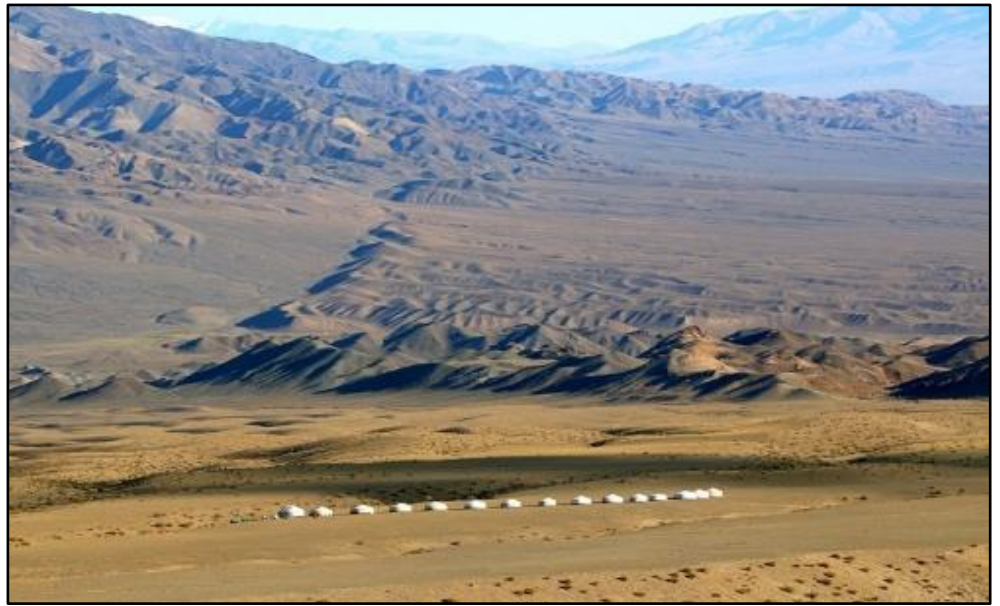
Altai ger camp

Altai Mountains. Our Ger camp is situated in the foothills of the Altai Mountains, it is as remote a wilderness as one can find. It is unlikely we will see any other people here apart from our own group.