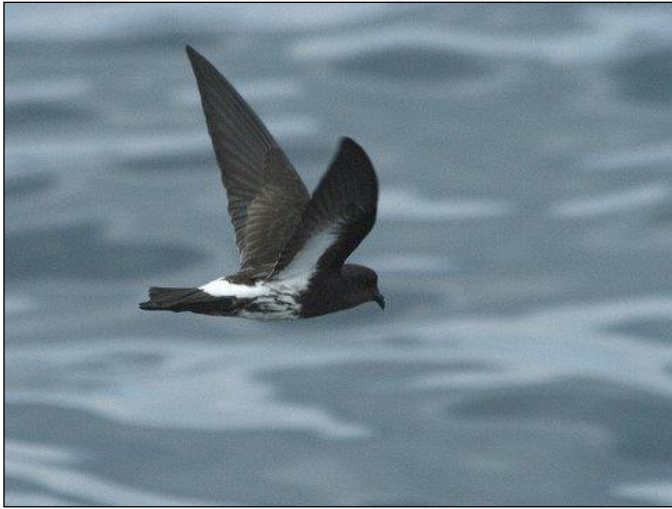
New Zealand Storm Petrel by Andrew Sutherland

Muriwai Beach. This site hosts a spectacular Australasian Gannet colony surrounded by craggy rocks and pounding surf. We'll marvel at this impressive natural display from a scenic viewpoint atop an overlooking cliff, where Silver Gulls and elegant White-fronted Terns attend their nests. Often present and feeding on the flowering Flax bushes are the outrageous Tui (an endemic honeyeater), New Zealand Fantail and gorgeous New Zealand Pigeon.