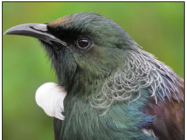
The impressive Tui

Tiritiri Matangi Island. We depart today by water taxi for the fabled Tiritiri Matangi Island. Several highly endangered endemic species can be seen here, including rare species sadly extirpated from the mainland. One of the Jewels of the Hauraki Gulf, Tiri is an amazing example of habitat restoration with over 200,000 native trees meticulously replanted. We will explore this predator-free haven for some of New Zealand's most endangered wildlife, including the outrageous North Island Saddleback, localised