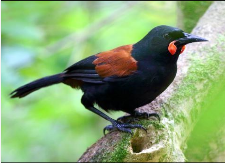
South Island Saddleback by Adam Riley

highest peak, the snow-covered Mount Cook at (3 724m). Other species possible in this area may include New Zealand Falcon, Swamp Harrier, Paradise Shelduck, New Zealand Scaup, Grey Teal, Eurasian Coot, Great Crested Grebe, Masked Lapwing, New Zealand (Australasian) Pipit, Australian Magpie and Common Redpoll.