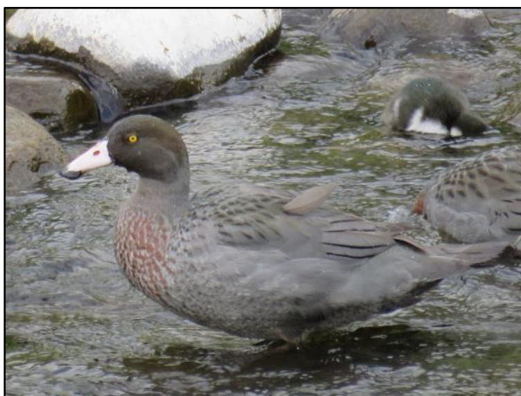
Blue Duck with chick

Miranda. The mud flats and shell banks near the Miranda Trust Wildlife Centre are a fantastic place to find large flocks of shorebirds, and here we will diligently scan while searching especially for Wrybill. This small, bizarre plover is confined to New Zealand