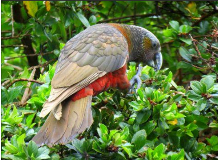
New Zealand Kaka

Rough-faced (or King) Shag, a localised species found only in the Marlborough Sounds. Along the way, there are opportunities to view marine mammals such as Dusky Dolphins and playful New Zealand Fur Seals.