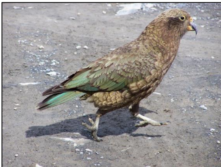
The entertaining Kea

Southern Giant Petrel, Brown Skua, Sooty Shearwater, Cape and Mottled Petrels, Common Diving Petrel as well as chances for Grey-backed Storm Petrel and three species of penguins – namely Yellow-eyed, Fiordland and Little (Blue). Antarctic Terns also have a small breeding colony south of here and we will be looking for sightings of this rare bird for New Zealand.