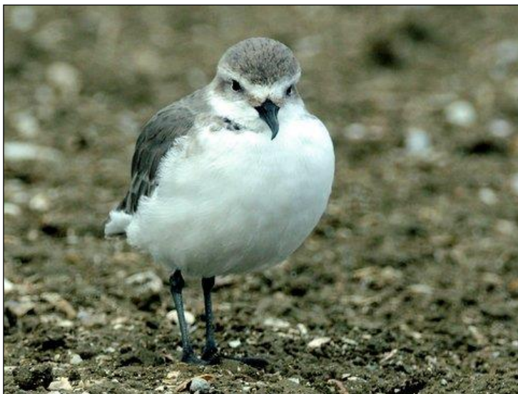
Wrybill by John Graham

and is the only bird species with a laterally asymmetrical bill uniquely curving to the right. Its total population has been estimated at a mere 5,000 individuals. It nests on stony riverbeds in South Island and winters in flocks on wetlands with marsh and expansive tidal flats, Miranda being its favoured area. Other potential species here include Variable and South Island Oystercatchers, Eastern Curlew, Bar-tailed Godwit, Red Knot, Pacific Golden Plover, Sharp-tailed and Curlew Sandpipers, Red-necked Stint, Whimbrel and Ruddy Turnstone.