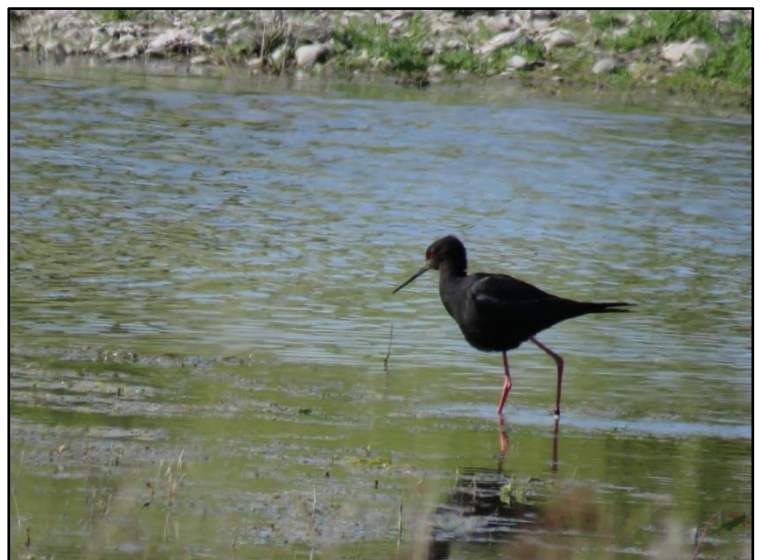
The critically endangered Black Stilt by Erik Forsyth

Omarama area. We will search the Omarama area in earnest for Black Stilt. This is one of New Zealand's most endangered species and thought to be the world's rarest wader at less than 250 individuals. We also have further chances for the beautiful endemic Double-banded Plover (Banded Dotterel) Black-fronted Tern and Wrybill, which nest on the braided riverbeds. The scenery is breath-taking, and we will see New Zealand's