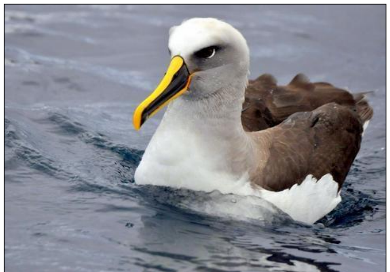
Buller's Albatross

We will encounter several new species of albatross, shearwaters and diving petrels today, with possibilities including Wandering, Northern Royal, Campbell's, Salvin's and Buller's Albatross,