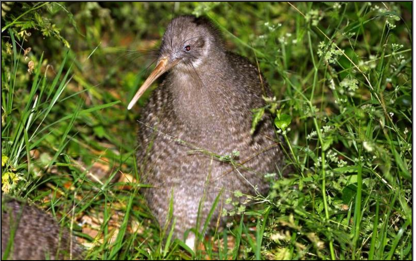
Little Spotted Kiwi

13 th November to 29 th November 2023 (17 days)