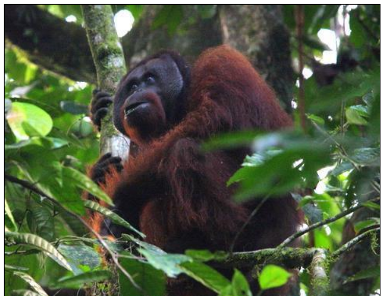
Orangutan by Colin Valentine

Sepilok. We will walk the trails in search of a number of lowland species such as Scarlet-rumped Trogon, Rufous-collared Kingfisher, Chestnut-rumped Babbler and Oriental Dwarf Kingfisher. We will also spend time in elevated bird hides/towers. Here, one is level with the canopy and offers a good vantage point to look for raptors such as Oriental Honey Buzzard, Crested Serpent Eagle, Wallace's Hawk-Eagle, Brahminy Kite and Crested Goshawk. Other possibilities may include Cinnamon-headed (Green), Pink-necked (Green) and Thick-billed (Green) Pigeons, Long-tailed Parakeet, Blue-crowned