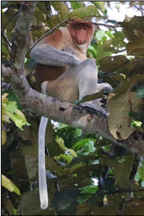
Proboscis Monkey by Nigel Redman

to endless tracts of commercial Oil Palm plantations with the result that nearly all the region's wildlife has been forced into a narrow strip of forest along the river. The concentration of wildlife here is, however, phenomenal and we will spend most of our time birding on productive boat trips on the main Kinabatangan River and its adjacent tributaries. These boat trips are simply amazing, allowing one to approach both birds and mammals at close range. Some of the wildlife we are likely to encounter on these trips include the rare Storm's Stork, Lesser Adjutant, Grey-headed and Lesser Fish Eagles, Oriental Darter, Blue-eared and Stork-billed Kingfishers, Blue-throated Bee-eater, Wrinkled, Black and Rhinoceros Hornbills, Silvered Langur, Long-tailed Macaque and the bizarre Proboscis Monkey. If we are fortunate, we may encounter some of the Kinabatangan's rarer inhabitants such as Helmeted and White-crested Hornbills, White-fronted Falconet, Wallace's Hawk-Eagle, Jerdon's Baza, Moustached Hawk-Cuckoo, Long-tailed Parakeet, the very rare and until recently mythical Bornean Ground Cuckoo, Orangutan, Maroon Langur (Red Leaf Monkey) and Pig-tailed Macaque.