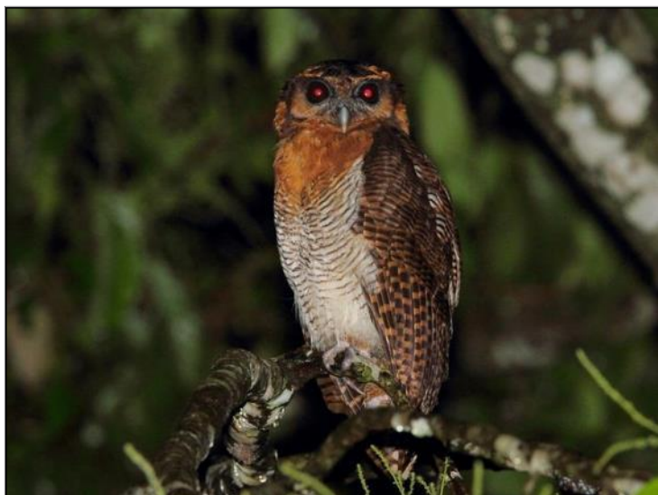
Brown Wood Owl

Scimitar Babbler. If we are very lucky, we may see two of the area's most secretive and elusive species: Malaysian Partridge and Rusty-naped Pitta. Other more widespread species that we also hope to encounter include the impressive Crested Serpent Eagle, dashing Long-tailed Broadbill, stunning Common Green Magpie, ground-dwelling Streaked Wren-Babbler, Long-tailed Sibia, Chestnut-capped Laughingthrush, Javan Cuckooshrike, gorgeous Silver-eared Mesia (Leiothrix), Blyth's Hawk-Eagle, Lesser Racket-tailed Drongo, Speckled Piculet, retiring Lesser Shortwing, Mountain and Dark-necked Tailorbirds, the vivid-blue Large Niltava, Green-billed Malkoha, sensational Black-eared and Blyth's Shrike-Babblers, secretive Pygmy Wren-Babbler, the brilliant White-tailed Robin, Slaty-backed Forktail and the hyperactive Fire-breasted Flowerpecker.