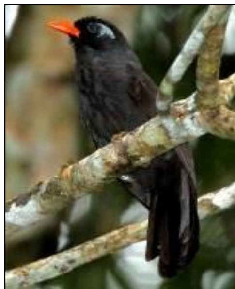
Black Laughingthrush by Adam Riley

During our time here, we'll also venture downhill on at least one occasion to an area called the "Gap", which is a zone of beautiful, mixed broad-leaved forest and bamboo at the base of Fraser's Hill and covers the altitudes from 700 to 1200 meters (2,300 to 4,000 feet). This is a superb birding area that supports numerous exciting forest birds and is often one of the highlights on a tour to Peninsular Malaysia. Some of the delectable birds we may see here include the regal Black Eagle, Rufous-bellied Hawk-Eagle, Orange-bellied and Blue-winged Leafbirds, Black-and-crimson Oriole, Grey-chinned Minivet, Velvet-fronted Nuthatch, White-bellied Erpornis, Orange-breasted and Red-headed Trogons, White-crowned and Great Hornbills, Chestnut-backed Scimitar Babbler, Hill Blue Flycatcher, Pin-striped Tit-Babbler, Black-and-yellow, Long-tailed, Silver-breasted and Dusky Broadbills, the near-endemic Black Laughingthrush, immaculate Sultan Tit, Red-billed Malkoha, the truly spectacular Red-bearded Bee-eater and three bamboo specialists: the vocal Yellow-bellied Warbler, unobtrusive Collared Babbler and the shy and enigmatic Bamboo Woodpecker, as well as the very rare and secretive Marbled Wren-Babbler or scarce, highly nomadic and little-known Yellow-vented Green Pigeon if we are very fortunate.