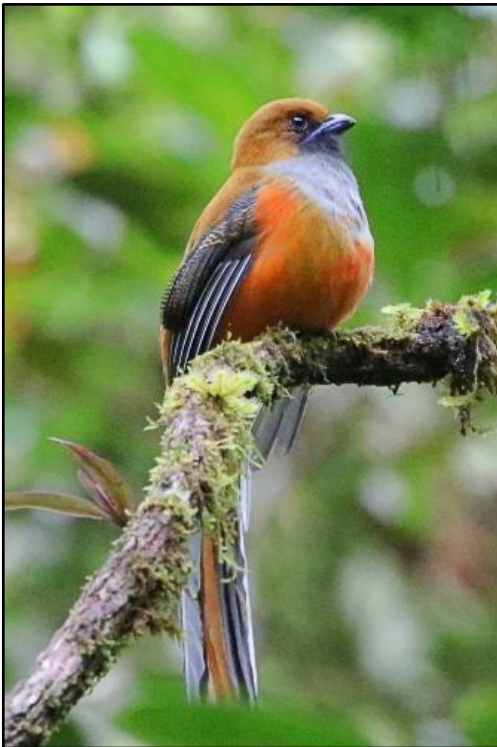
Whitehead's Trogon by Nigel Redman

Mount Kinabalu. The pristine, montane forest that cloaks the lower slopes of Moun Kinabalu - Borneo's highest mountain at 13,435 feet (4,095 m), is home to some of Borneo's most prized birds that includes a multitude of localised mountain endemics. Some of the many fine birds to be sought here include Sunda Cuckooshrike, Golden-naped Barbet, the sensational Bornean Green Magpie, noisy Bornean Treepie, resident Dark Hawk-Cuckoo and Sunda Cuckoo (a recent split from Oriental Cuckoo), Indigo Flycatcher, Chestnut-crested Yuhina, Bornean Whistler, Chestnut-hooded, Sunda and extremely scarce and shy Bare-headed Laughingthrushes, Bornean Whistling Thrush, the delightful Bornean Forktail (recently split from White-crowned), Black-sided (Bornean) Flowerpecker, Eyebrowed Jungle Flycatcher, Bornean Swiftlet, Temminck's Babbler, the miniscule Bornean Stubtail, Mountain Wren-Babbler, the exquisite Temminck's Sunbird and Black-capped White-eye, as well as some really star birds such as the rare Fruithunter, an endemic, canopy-dwelling thrush, Crimson-headed (now considered to be a kind of pheasant called a Bloodhead) and Red-breasted Partridges, the rare and near-endemic Sunda Owlet, the very rare and furtive Everett's Thrush, extremely rare and seldom-seen Mountain (Kinabalu) Serpent Eagle, nomadic and unpredictable Tawny-breasted Parrotfinch and the local, recently split Crocker Jungle