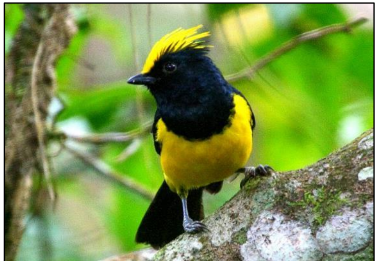
Sultan Tit by Keith Valentine

We'll bird the network of forested back roads and trails around the town, concentrating our efforts on finding the many special birds of the area, such as the outstanding Blue Nuthatch, Mountain Fulvetta, the rare, shy and endemic Malayan Whistling Thrush, attractive and localised Fire-tufted and Black-browed Barbets, exquisite Red-headed Trogon, Buff-breasted Babbler, delicate Rufous-browed Flycatcher, skulking Malayan Laughingthrush and the low-density and shy Large