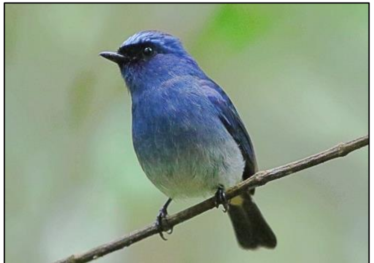
Indigo Flycatcher by Nigel Redman

Poring Hot Springs. The hot springs are surrounded by superb, mid-elevation forest that contain a range of different species more typically associated with lowland forest such as Black-and-yellow, Green and Banded Broadbills, Oriental Dwarf Kingfisher, the endemic White-crowned Shama, Golden-whiskered, Blue-eared, Red-throated and Brown (a recently recognised Bornean Endemic) Barbets, the brilliant Violet Cuckoo, Yellow-eared and Spectacled Spiderhunters, Dusky Munia, Scaly-breasted, Streaked and Spectacled Bulbuls, Orange-bellied Flowerpecker and the scarce and extremely local Grey-headed Babbler. If we are fortunate during our