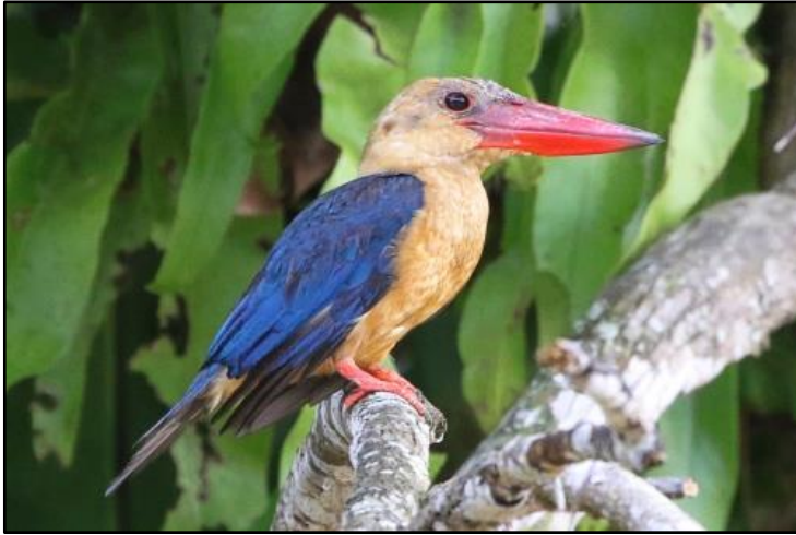
Stork-billed Kingfisher by Nigel Redman

bellied and Chestnut-breasted Malkohas, Blue-eared Barbet, superb Red-naped Trogon, Maroon-breasted Philentoma, Bar-winged and Black-winged Flycatcher-shrikes, gregarious Fiery Minivet, Green Iora, Dark-necked and Rufous-tailed Tailorbirds, Streaky-breasted and Little Spiderhunters, immaculate Ruby-cheeked Sunbird and a multitude of bulbul species, to name just a few!