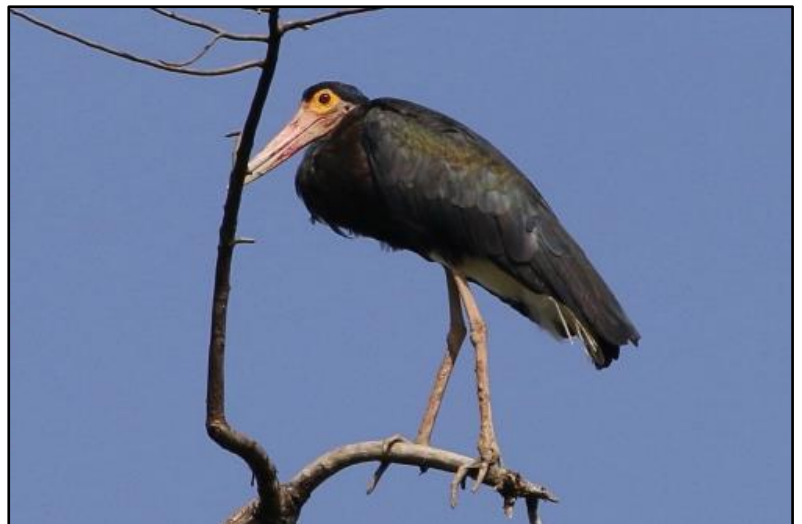
Storm's Stork by Nigel Redman

Some of the very special birds that we will be searching for during our time here include the near-mythical Blue-banded Pitta, exquisite Blue-headed, Bornean Banded and Black-crowned Pittas, the shy Black-throated Wren-Babbler, Rufous-tailed Shama and Chestnut-necklaced Partridge. Birding from the road edge is a pleasure with mixed species flocks being a near-constant feature. Working through these flocks we hope to encounter such avian gems as Rufous Piculet, Buff-rumped and Buff-necked Woodpeckers, Rufous-fronted and Ferruginous Babblers, Brown Fulvetta, White-bellied Erpornis, Yellow-breasted Flowerpecker, Black-