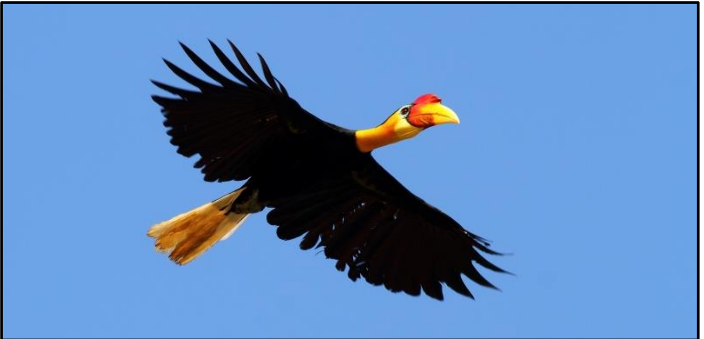
Wrinkled Hornbill by Glen Valentine

Borneo is the world's third largest island and typically conjures up images of a wild forest paradise where Orangutans, gibbons, broadbills and pittas roam the Bornean jungle! On this tour we will visit some of the island's most famous birding sites, namely the fabled Mt. Kinabalu, Tabin Wildlife Sanctuary, Sepilok and the Kinabatangan River. Habitats range from rich lowland and montane rainforest to coastal wetlands. A wide mix of highly sought-after, rare and endemic Southeast Asian birds can be expected on this fabulous adventure. As if this wasn't enough, Borneo is also one of the very best countries in Asia to enjoy rainforest mammals, and we can expect some incredible creatures such as Orangutan, Proboscis Monkey, Bornean Gibbon, mouse-deers, Leopard Cat and, if we are very lucky, Bornean Clouded Leopard! This budget tour has been designed to provide prime Bornean birding and wildlife viewing at a more economical price and for those with less time to spare in the field.