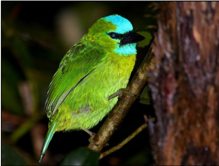
Golden-naped Barbet

Hanging Parrot, Silver-rumped Spinetail, Bushy-crested, Wreathed and Rhinoceros Hornbills, Great Slaty and several species other species of woodpeckers and barbets. If we are very lucky, we may find the rare Bornean Bristlehead which has been recorded here on a regular basis.