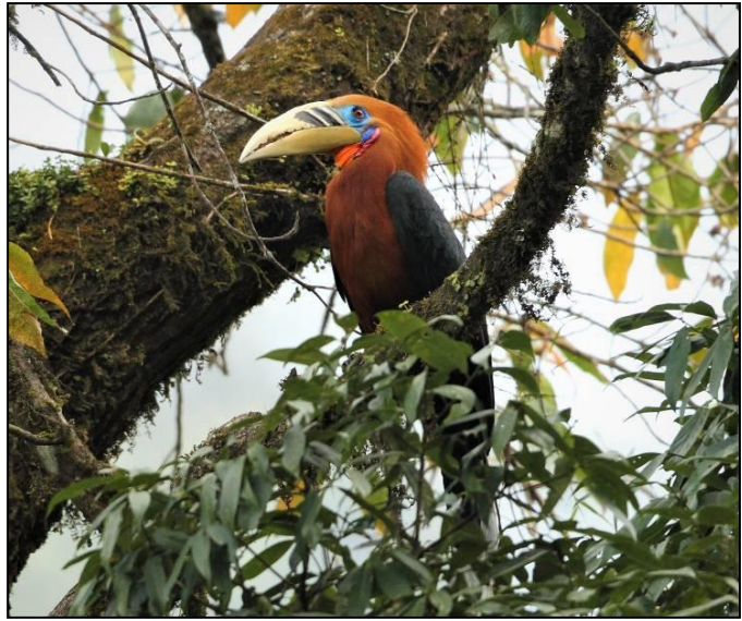
Rufous-necked Hornbill by Markus Lilje

Bay Woodpecker and were rewarded with great scope views of this bird before being distracted by the loud sound of wing beats. We followed up and found a pair of Rufous-necked Hornbills! We viewed this Bhutanese special right next to the road as the female proceeded to feed the male some berries, typical courtship behaviour of Hornbills . A short night drive after dinner didn't give us any birds, but we managed to find a special mammal: Hodgson's Giant Flying Squirrel!