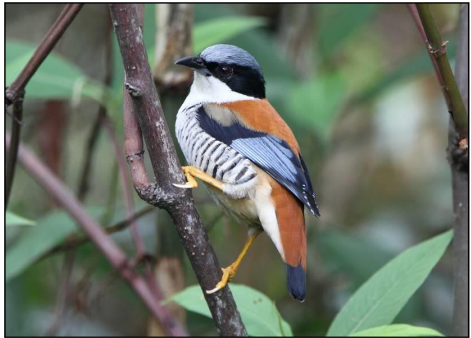
Himalayan Cutia by Paul Ellis

Wandering on, we stopped for some tea along the roadside but kept getting distracted by some awesome birding. Highlights included Russet Sparrow, Rufous-breasted Accentor, Bhutan Laughingthrush, Green-backed Tit, Black-throated Bushtit, and Whiskered Yuhina. We reached some pristine lowland subtropical forest soon after and went in search for more species. We managed to find a huge mixed flock of species and enjoyed views of the gorgeous Himalayan Cutia, Yellow-cheeked Tit, Black-faced, Blyth's and Lemon-rumped Warblers, White-tailed Nuthatch and Red-tailed Minla. We then reached an area with over-hanging bee-hives on the side of a cliff. Here we managed to find a hiding Yellow-rumped Honeyguide! In some heavy wind, we almost lost some hats but also managed to find some Rufous-vented Yuhinas. Soon after, we reached prime habitat for one of our main targets of the tour – Wallcreeper. Not long after, a Wallcreeper was spotted. We alighted from our luxurious and spacious bus to enjoy great views of this odd bird, clambering up the cliff-face. Pushing on, we spotted some Chestnut-bellied Rock Thrush, Yellow-billed Blue Magpie, as well as a big flock of mesmerising Scarlet Finches! We settled down at a beautiful lodge overlooking the Trashigang Valley below.