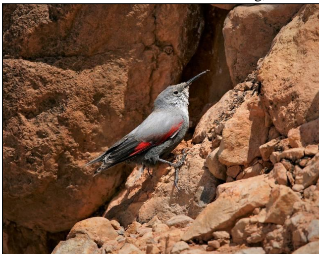
Wallcreeper

Today saw us juggling with the road works and blasting schedules that proved quite frustrating, to say the least. Nonetheless, we carried on and made the most of our 'stop and goes'. New birds included the handsome Crested Bunting, Eurasian Crag Martin, Nepal House Martin, Himalayan Bulbul, Hodgson's Redstart, Common Kestrel, Himalayan Buzzard and Long-tailed Minivet.