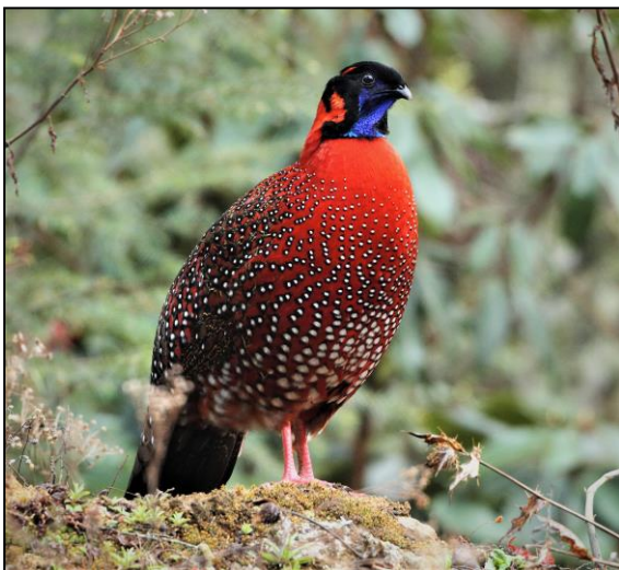
Satyr Tragopan by Markus Lilje

The next morning saw us heading to the Bumthang Valley. Once again, we headed for the Tromshingla Pass and managed to find Alpine Accentor and many more Blood Pheasants. We rounded the pass with its hoar-frost covered trees. Heading down, we found more Goldcrest, White-throated Redstart, Large-billed Crow, Hodgson's Treecreeper, White-collared Blackbird, White-winged Grosbeak, Spotted Nutcracker and a small group of Rufous-fronted Bush tits. Next up were a few raptors in flight and new was a Bearded Vulture and also a Long-legged Buzzard. As we reached Ura for a fantastic lunch, we spotted hundreds of Plain Mountain Finches about and a short stroll afterwards gave us some Himalayan Beautiful Rosefinches! We saw our first Yak soon after lunch and the next bit of excitement came when we spotted Himalayan Monal! A very shy bird, but