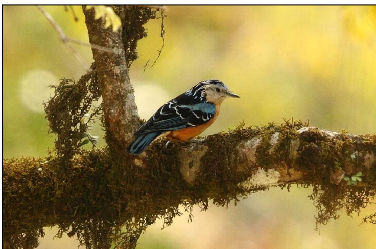
Beautiful Nuthatch by Markus Lilje

An early start saw us venturing further into the Phrumsengla National Park, and mixed flocks were the order of the day again. We quickly found a huge flock and managed to find Blyth's Shrike-babbler and Rusty-fronted Barwing. The next excitement came in the form of a huge target with only a limited range and its main stronghold being in Bhutan. Beautiful Nuthatch! We witnessed a pair of these magnificent birds feeding on a dead tree before moving off. The same mixed flock