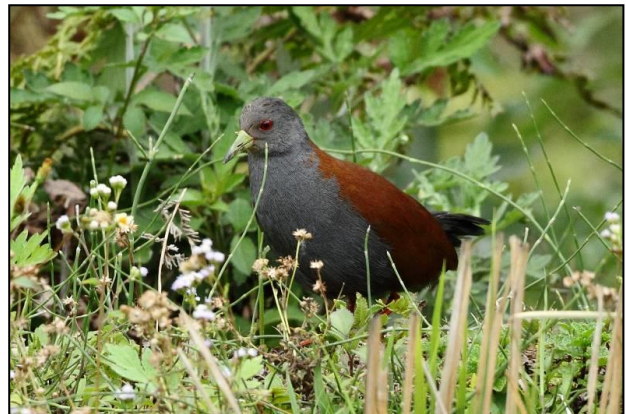
Black-tailed Crane by Markus Lilje

Other venues visited included an art school, paper factory, and textile museum, followed by a walk down the main market. As the light subsided, we had a great little birding spot in store for us – Papesa Wastewater Treatment Works. We had fantastic birds here, including