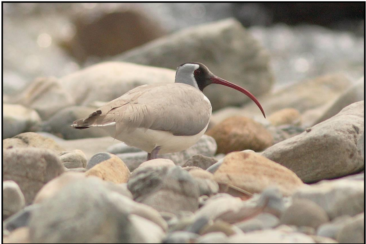
Ibisbill