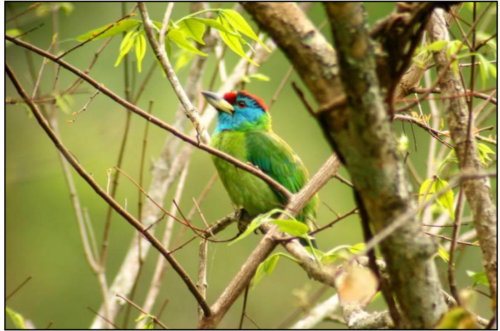
Blue-throated Barbet

Today we set out to explore the low-altitude areas of Bhutan and the direct vicinity of Samdrup Jongkhar and went as far as about 20 kilometres along the main East-West highway. Our first stop near some flowering Erythrina gave us a whole host of birds feeding. These included the loud Common Hill, Jungle, Common and Pied Mynas, as well as some Chestnut-tailed Starlings. A small group of Rufescent Prinias showed nearby, whilst a Little Pied Flycatcher watched from above. A huge flock of mixed species surrounded us and we managed to pick out Maroon Oriole, Common Iora, Chestnut-bellied Nuthatch, Orange-bellied and Gold-fronted Leafbirds, Asian Fairy-bluebird, Pin-striped Tit-Babbler, Scarlet Minivet Streaked Spiderhunter, Fire-breasted Flowerpecker, Greater Racket-tailed Drongo and a group of Himalayan Flamebacks.