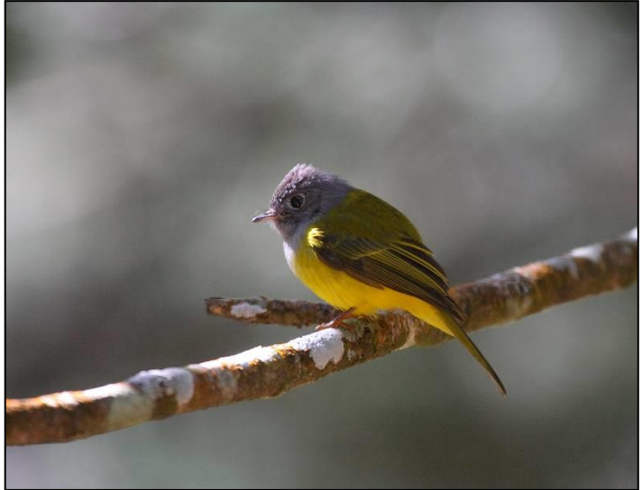
Grey-headed Canary-flycatcher

We all met this morning in the Indian city of New Delhi, where we were transferred to the airport for our domestic flight. Our two-hour flight to the largest city in the Assam Province of India, Guwahati, went by fairly quickly as we chatted away, learning about each other and talking about our excitement for the trip to follow. Upon arrival, we were greeted with the friendly smile of one of our local leaders. We were showed to our vehicles that were to transport us to the border town of Samdrup Jongkhar. This roughly two-and-a-half hour trip had us experiencing some organised Indian traffic procedures, as well as a few stops that produced some birds we would not find in Bhutan. These included White-throated Kingfisher, Black-necked Stork, Spotted Dove, Yellow-footed Green Pigeon, Asian Openbill and Lesser Adjutant. A quick stop at a marsh gave us Grey-headed and Red-wattled Lapwings, Indian Pond Heron, Black-headed Ibis and Little, Intermediate and Great Egrets. We also managed to spot a Little Cormorant over a large river and even spotted a perched Shikra. Black Kites and Eastern Cattle Egrets were abundant.