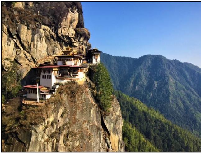
Tiger's Nest by Andre Bernon

world famous Tiger's Nest Temple outside of town. Nestled high up on a cliff-face, we had quite a hike to do, but it was well worth it. We entered the Temple and were fascinated by all the explanations and stories this great culture and religion had to show. We even saw some birds on this hiking day and these included Chestnut-crowned and White-throated Laughingthrushes and Rufous-fronted Bushitts.