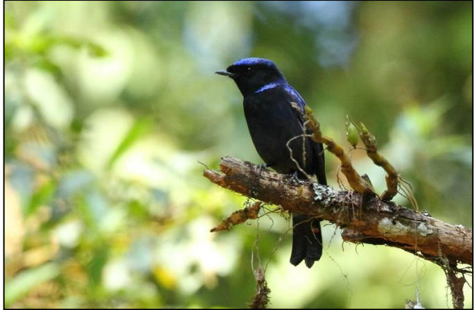
Large Niltava

We were warmed by a great lunch and continued to our next birding stop in the Yongkhola area. We stopped at a small marsh after ticking off our first Nepal Fulvetta and went in search for the localised Black-tailed Crake. We found a single bird as it appeared out of the moist vegetation and continued to feed out in the open for a few minutes! Nearing our lodge, we spotted a