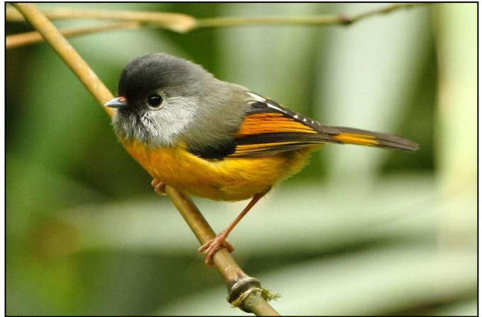
Golden-breasted Fulvetta

On our way down, yet again, we had a lot of activity near a large river course and found Rufous-vented, Coal and Grey-crested Tits, Goldcrest, Hodgson's Treecreeper, Rufous-breasted Bush Robin and White-throated Redstart. Further along, we got great views of the large Great Parrotbill, as well as Eurasian Wren, and Common and Himalayan White-browed Rosefinches. On our way back for lunch, we saw many Black-throated Thrushes in an open field and a single White-collared Blackbird. The afternoon's excursion saw us trying, yet again, for the male Satyr Tragopan, and boy, were we rewarded. We managed to have superb views of two males, one sitting on a bush right next to our bus and another carefully striding across the road in front of us! We also managed to see Chestnut-crowned and Black-faced Laughingthrushes, Speckled Wood Pigeon and a group of Alpine Thrushes.