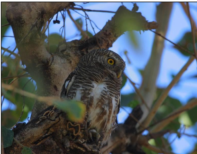
Asian Barred Owlet

Nearing the border with Bhutan, we had some time to walk around and found our first Oriental Magpie-Robin, Black-winged Cuckooshrike, Grey-headed Canary-Flycatcher, Blue-throated and Lineated Barbets and Common Tailorbird. Pushing on to Samdrup Jongkhar, we were met by our second local leader and showed to the customs office. While we waited, we found some Cinereous Tit, Eurasian Tree Sparrow and Oriental White-eye. A quick check-in to our accommodation for the next two nights and we were out again. We took a leisurely walk through the impressive town and managed to see some good birds too. First up, we had Red-rumped Swallow,