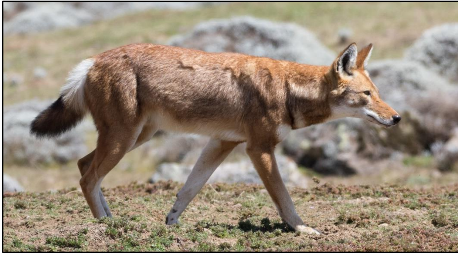
Ethiopian Wolf

Turacos and at our lunch stop, we saw Tambourine Dove, Black and White Mannikins, Green-backed Honeyguide and the beautiful African Emerald Cuckoo! We then took a three hour drive out of the forest and on to the site for the Ruspoli's Turaco. Once we arrived at the spot, we were greeted by many local people trying to help us find the bird. Finally, we got to see one bird and after many attempts to get a decent look, we eventually did, and then we had another one hundred kilometers to go to get to the town of Negele. On the way, we were very lucky to pick up views of three Kori Bustards walking through some unusually thick grass! we finally arrived at our lodge in Negele and had a great evening at a nearby local restaurant.