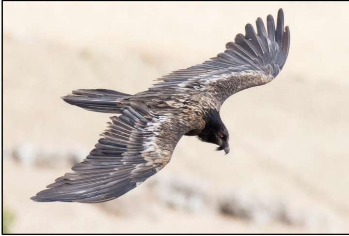
Bearded Vulture by Gareth Robbins

Today was the first full day of the tour and after an early breakfast, we left Addis Ababa just in time to miss the traffic and made our way to the town of Debre Birhan. We saw a good number of birds along the way such as Red-breasted Wheatear, the huge Thick-billed Raven, Wattle Ibis, Ortolan Buntings, a