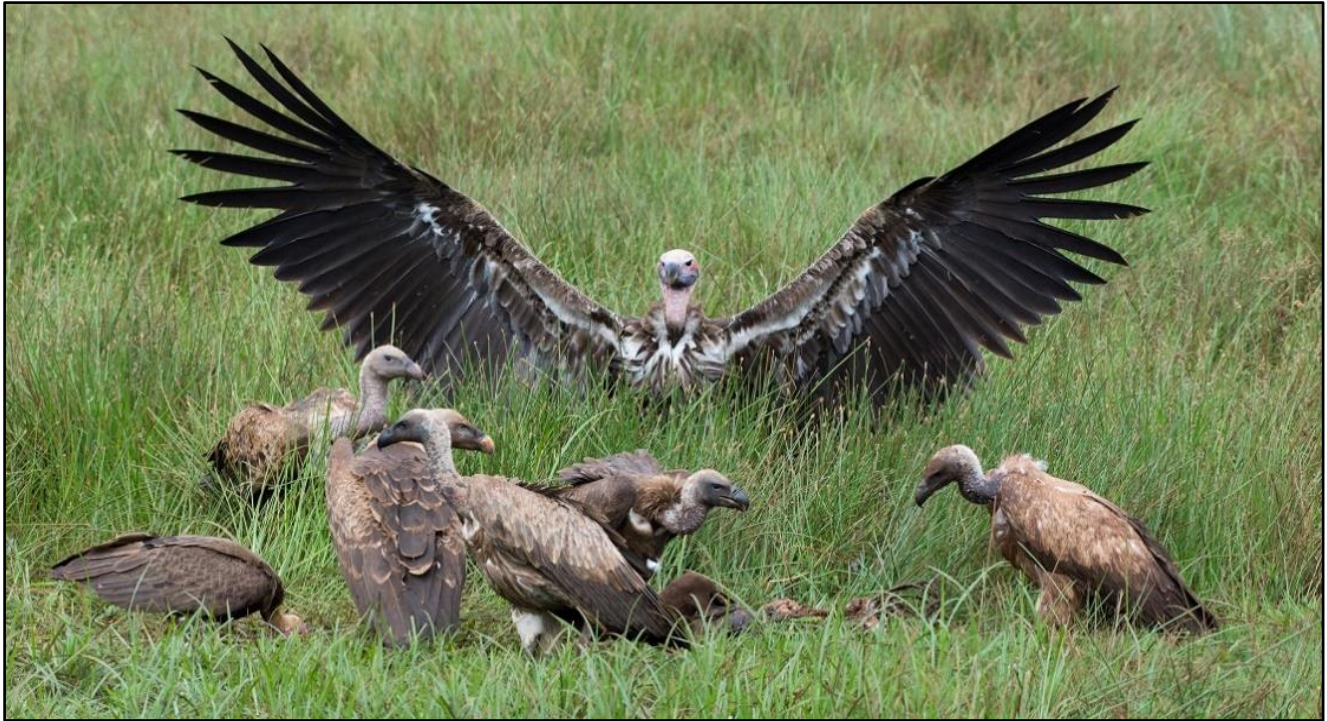
Lappet-faced, Rüppell's and White-backed Vultures feeding on roadkill by Gareth Robbins