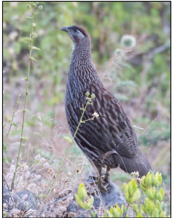
Erckel's Francolin

We met our drivers in the early hours of the morning and took the two-hour drive to the Jemma Valley. By the time we arrived, there was good enough light and we could hear the Erckel's Francolins calling. We met the local farmers who took us to a good vantage point overlooking the valley and it didn't take long to get our first sighting of a Harwood's Francolin calling from the top of a small boulder. We then walked back up the road to see if we could get views of the very vocal Erckel's Francolin calling above from the rockface. We finally managed to get great looks at one bird! We also saw Speckled Mousebird, Abyssinian Wheatear, Singing Cisticola, Slender-billed Starlings, Yellow-rumped Seedeater, Rüppell's Black Chat, Mocking Cliff Chat and Brown-rumped Seedeater. The drivers prepared a bush breakfast for us, so we left the birding for a few minutes to enjoy a well-deserved meal and coffee! After breakfast, we walked to a tiny waterfall and found White-billed Starlings and Mountain Wagtails. We then climbed back into the 4x4's and drove down to the Jemma