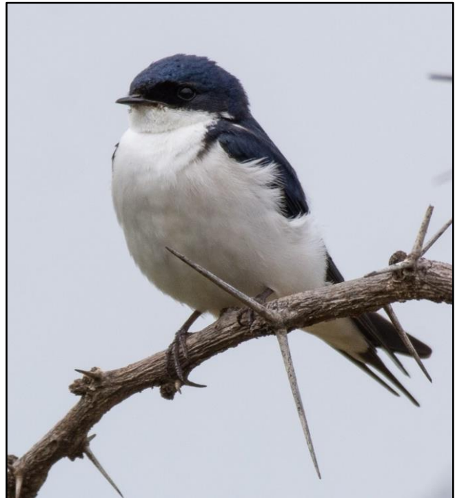
White-tailed Swallow