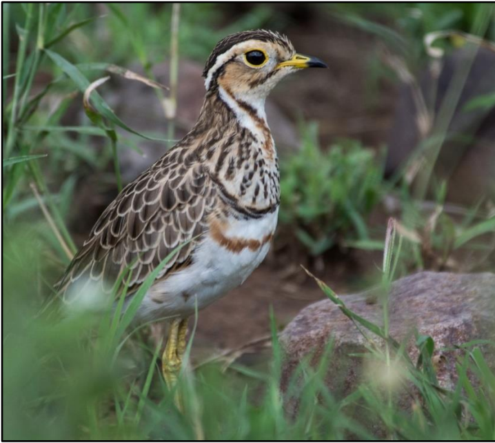
Three-banded Courser