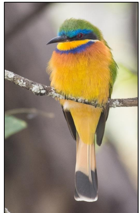
Blue-breasted Bee-eater

River getting Dark-chanting Goshawk, Hemprich's Hornbill, Black-winged Red Bishop and African Harrier-Hawk and Speckled-fronted Weavers on the way down. We took a walk along the Jemma River where we saw Black-billed Barbets, Sahel Bush Sparrows, Pygmy Kingfisher, African Paradise Flycatcher, Woolly-necked Stork, Spur-winged Lapwing, Upcher's Warbler, Pied Kingfisher and a very shy Pearl-spotted Owl! We walked back to the vehicles getting Black-headed Heron, Little Bee-eater and two Peregrine Falcons along the opposite side of the river. We revisited the small waterfall on the way back up out of the valley and this time we got Common Chiffchaff, Nyanza Swift and a juvenile Greater Honeyguide. We stopped for lunch at a small local hotel and had some traditional shiro and injera before making the long and bumpy drive back to Addis Ababa. We made several