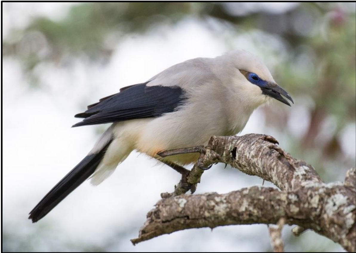
Stresemann's Bush Crow