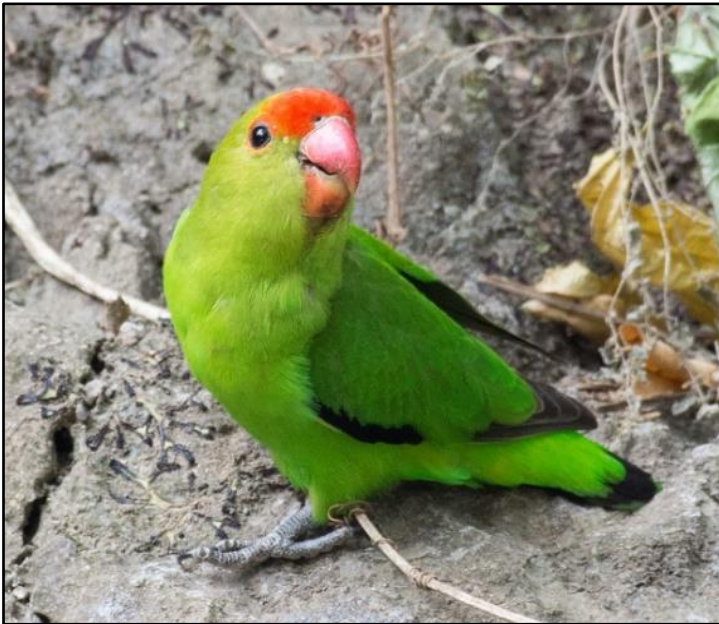
Black-winged Lovebird by Gareth Robbins

flybys of Black-winged Lovebirds. Black-headed Gull, White-breasted Cormorants and Pink-backed Pelicans were also seen. We then left the Bishoftu area and drove to Lake Koka, getting good looks at