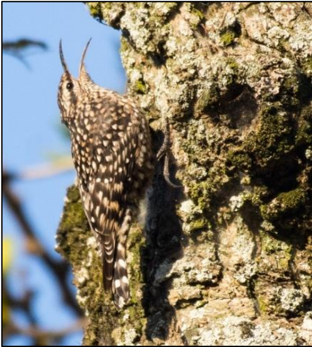
African Spotted Creeper by Gareth Robbins

Buzzards and Blue-winged Geese. A little further on we got to see three Ethiopian Wolves running off in the distance and we finally got to catch up with them. We spent some good time watching these beautiful animals running across the plains and we also watched them as they had a small dispute with two other Wolves. In total, we saw six Ethiopian Wolves making us a very lucky group! We then stopped for an early lunch and then gradually made our way back along the plateau. Some excellent spotting got us onto Red-billed Chough, Wattled Cranes and Ruddy Shelducks. After coming down from the Sanetti Plateau we got some views of Cinnamon-breasted Warbler, excellent looks at an Ethiopian Cisticola and some more White-backed Black Tits. Overall, we had a successful day with perfect weather and fantastic scenery. This was one of the best days of the tour so far!