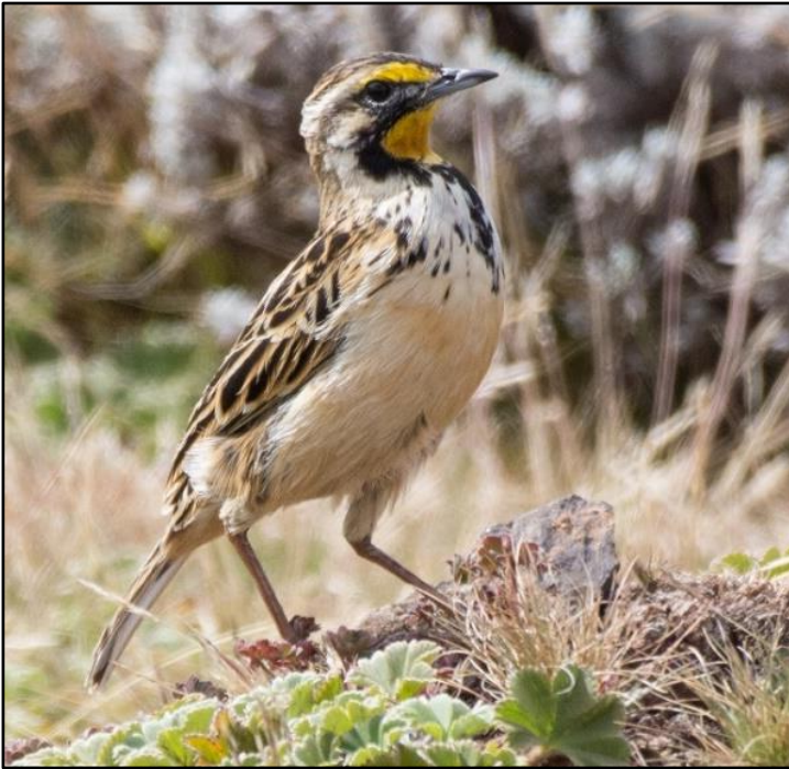
Abyssinian Longclaw

stops along the way getting better views of Blue-winged Geese and Red-throated Pipit, Erlanger's Lark, Rock Martins and Red-rumped Swallows! We finally made it back to Addis Ababa during rush hour, which was interesting, but our drivers skilfully managed to get through the traffic unscathed. After an entertaining dinner, we all went to bed early to catch up on some much-deserved sleep.