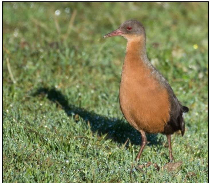
Rouget's Rail

After breakfast, we set out for our drive up to the Sanetti Plateau in the Bale Mountains National Park. As we made our way up, we came across a decent number of Rouget's Rails close to the roadside and we also managed to get decent views of Chestnut-naped Francolins too. We made it up to the start of the Sanetti Plateau which was around four thousand metres above sea level and with some good fortune, we managed to successfully find three Moorland Francolins. The pretty Spot-winged Lapwings were our next new endemic to see and this was followed by a couple of views of Steppe Eagles, Augur