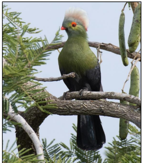
Ruspoli's Turaco

We had a long drive to Yabelo today, so another early start was needed, and we had loaded up the tour vehicles and made the long journey to Yabelo. There was plenty of good birding habitat most of the way and so we made the most of one spot because there were some Golden-