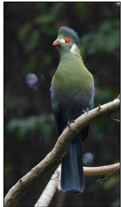
White-cheeked Turaco by Gareth Robbins

We had a long travel day scheduled for us and just after leaving Yabelo, we made a stop which turned out to be very productive. We had duetting Rosy-patched Bushshrikes, Striped Kingfisher, more Golden-breasted Starlings, and a very inquisitive Acacia Tit. We continued in the direction of Shashemene town and after an enjoyable breakfast for once, we got back into our vehicles and came across a spectacular event with Vultures feeding on a carcass on the side of the road. We had White-headed, White-backed, Rüppell's, Hooded and the