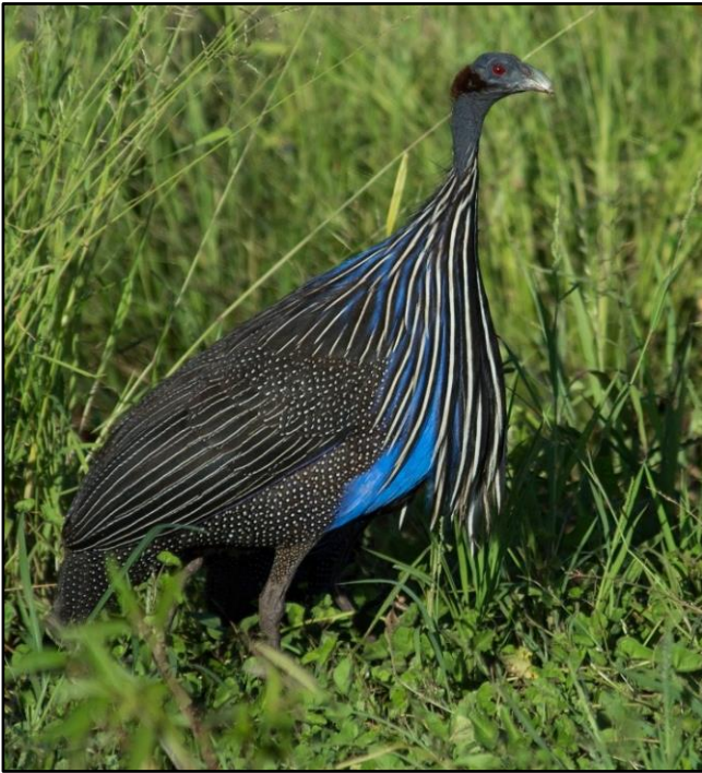
Vulturine Guinea fowl

huge Lappet-faced Vultures busy feeding and fighting over the dead animal and they allowed us to enjoy this spectacle at close range. We arrived in the town of Shashemene and after lunch, we met Tyson who guided us around some of the University grounds and nearby areas of Wondo Genet. We had great looks at White-cheeked Turacos as they bounced around from tree to tree, we also got good views of Slender-billed Starlings, Blue-breasted Bee-eaters, Scaly Francolin, Little Rock Thrush, Tambourine Dove and ended off the day with a sighting of the beautiful Narina Trogon which was busy feeding from the tops of the large trees!