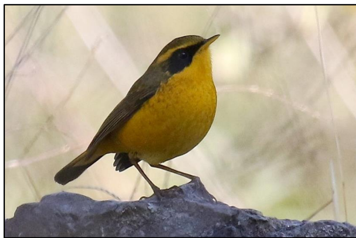
Golden Bush Robin

primarily focussed around improving on our sightings of tiger as well as adding many of the reserve's other 'special' mammals and birds. We explored zones one through five and were afforded the opportunity to explore zone three for a second time. Tiger was seen incredibly well by all; first, we encountered Arrowhead and her two cubs in some long grass, then we found the cubs for a second time and finally we enjoyed the breath-taking sight of the female returning from her hunt and roaring to call her cubs. An entirely different tiger was also glimpsed briefly by some right beside the entrance gate, taking the total number