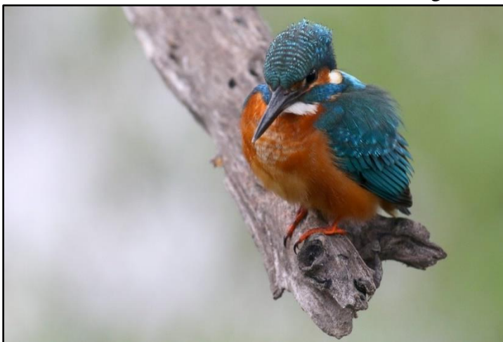
Common Kingfisher by Daniel Keith Danckwerts

outside our hotel. Here we encountered the Desert and Variable Wheatears, Painted Sandgrouse, Lesser Whitethroat, both Common and Large Grey Babblers, Blyth's Pipit, Indian Bush Lark, Rufous-fronted Prinia, Red-headed Bunting, and Eurasian Wryneck. Finally, our night explorations in the area gave us Spotted Owlet.