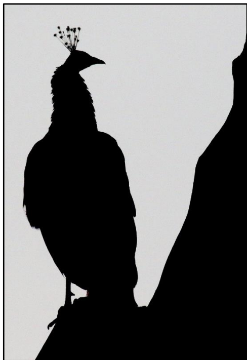
Indian Peafowl by Daniel Keith Danckwerts

The next day, we began with a short walk along the Kosi River. Here, we located an incredible three Tawny Fish Owls on their day roost – a real treat! The river itself produced Brown Dipper while flocks of Slaty-headed Parakeets flew noisily overhead. En route back to the lodge, we then enjoyed a small mixed-species foraging flock containing the Red-breasted Flycatcher, Lemon-rumped Warbler, Grey-headed Canary Flycatcher and Bar-winged Flycatcher Shrike. Loading up after a quick breakfast, we then drove to the entrance to Jim Corbett National Park. The remainder of the morning was then spent driving to Dhikala with many fantastic species seen along the way. Highlights included the diminutive Collared Falconet, Blue Whistling Thrush, Pallas's Fish Eagle, Kalij Pheasant, and Red Junglefowl. We arrived in time for lunch but were quickly distracted by the numbers of birds on the lake below; flocks of well over a hundred River Terns, several Black-necked Storks, and Eurasian Teals were just some of the highlights. It was here that we also viewed our first Gharials while Smooth-necked Otter was something of a surprise. Suddenly, we got the news that a Tiger had been seen nearby. Needless to say, we were off like a flash. We arrived at