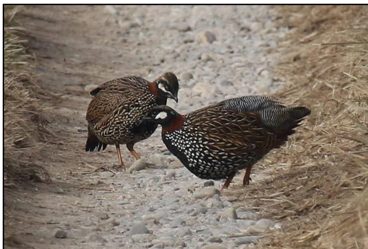
Black Francolin

An extremely early morning, the following day, had us waiting in the pre-dawn gloom atop the Pangot Road. As expected, a Koklass Pheasant began to call as the sky lightened up. It didn't take long to find the bird but, quite unexpectedly, it soon left its calling perch and began walking uphill and in our direction. To our delight, we were treated to fabulous point-blank views as it crossed the road and appeared to circle us from above; a rare treat, even for us guides! Thrilled with our success, we headed further up to a spot for the tricky Cheer