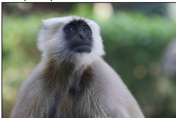
Tarai Grey Langur

beautiful backdrop – we enjoyed sightings of Brown Fish Owl, several more Himalayan Rubythroats, Small Niltava, Maroon Oriole and some especially cooperative Kalij Pheasants. Finally, we settled in for the evening.