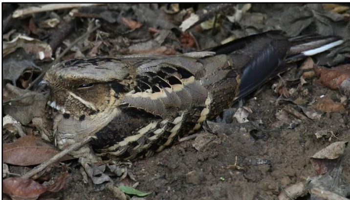
Large-tailed Nightjar by Daniel Keith Danckwerts

The following morning, we took a day trip down to the Sattal area; located at a slightly lower altitude, just to the south of Nainital. We arrived before first light with time enough to track down Brown Wood Owl. Thereafter, we entered a small hide where we spent several hours. White-crested and White-throated Laughingthrushes were by far the most numerous visitors to the feeding station but we also enjoyed sublime looks at Rufous-chinned Laughingthrush. A single Red Junglefowl came in to feed briefly, in the company of many Oriental Turtle Doves. However, by far the best birds of the morning were Grey-winged Blackbird and the unbeatable Common Green Magpie. As we were leaving, a large party of noisy Grey Treepies arrived together with both Grey-headed and Brown-fronted Woodpeckers. A most enjoyable morning indeed! Next, we walked along the road into Sattal before taking a small forest trail into the forest itself. Here we enjoyed the abundance of Slaty-headed Parakeets and Black Bulbuls; both feeding in the expansive lantana thickets. Other notable sightings included Pygmy Cupwing, Bronzed Drongo, Green Sandpiper, Grey-sided Bush Warbler and Common Kingfisher. Thereafter, we slowly made our way back uphill. In an area of scrub, we located