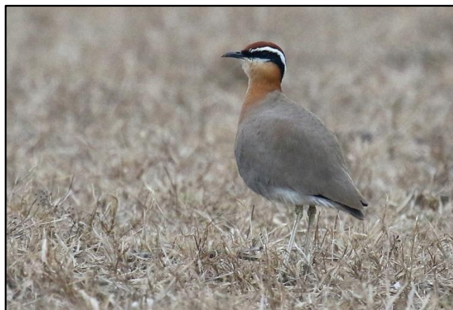
Indian Courser by Daniel Keith Danckwerts

confiding Desert Wheatear, several Tawny Pipits, Great Grey Shrike, and Barred Buttonquail. We arrived in Bharatpur with time enough to visit the temple area of Keoladeo National Park. Here we noted many Citrine and White Wagtails, Spotted Owlet, Indian Grey Hornbill, both Common and Green Sandpipers, Common Redshank, Bluethroat, and a quick Brooke's Leaf Warbler. At sunset, we waited in position along a long straight gravel road where we viewed Indian Crested Porcupine, Small Indian Civet (guide only), and Golden Jackal. A single Striped Hyena was also seen tremendously far off, but the sighting was most unsatisfactory, in the fading light, and was thus left from our species list. Some were also lucky enough to see Short-eared Owl on the rickshaw ride back to the entrance. From there, we transferred on to our hotel for the evening.