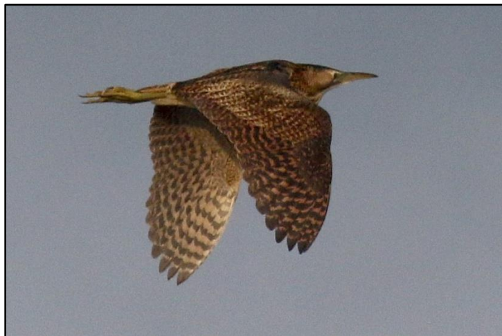
Great Bittern

With another day to explore the Nainital area, we started at the nearby village of Mangoli. Within minutes of arriving, we had located our first target of the day; the diminutive Asian Barred Owlet. It turned out that there was no need to worry about this species as, through the course of the day, we stumbled upon