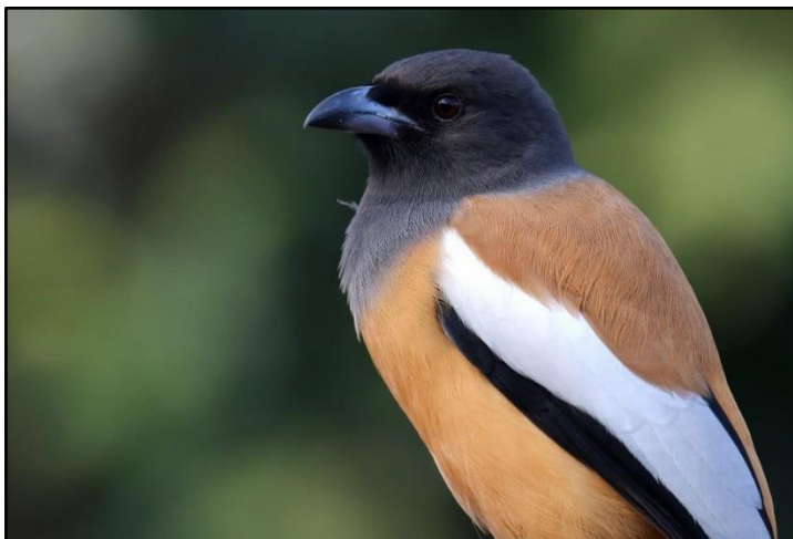
Rufous Treepie by Daniel Keith Danckwerts

The next day we had a full day to explore the Jim Corbett National Park. Here we enjoyed a fine day of birding with many important targets and a number of surprises. We started off in the grasslands where, after considerable effort, we were finally able to track down a pair of Black Francolins feeding in the road. We were even treated to a rare display, seeing the male droop and quiver his wings to impress the female. While she ran back for cover, we were certainly left impressed. Other highlights in the grasslands included the Water, Richard's and Paddyfield Pipits, White-browed and Citrine Wagtails, the skulking Ruddy-breasted Crake, several quick Crested Buntings, Oriental Skylark, Lesser Coucal, Black-throated Thrush, and Common Rosefinch. At the wetland edge, we were treated to a cracking Great Bittern flying overhead; a real highlight for all. From there, we then explored the forest edge. The best birds here were a Large-tailed Nightjar at its day roost, Green-billed Malkoha and Himalayan Rubythroat. After lunch, we visited the forest bordering the Ramganga River. With the most