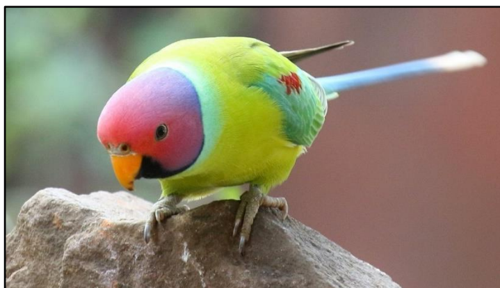
Plum-headed Parakeet

were tremendously shy and we soon lost sight of them. Other notable sightings on the river included the Sand Lark, River Lapwing, Great Stone Curlew, Temminck's Stint, both River and Black-bellied Terns, and Pallas's Gull. We also found several Gharials and Mugger Crocodiles, as well as Yellow-bellied Tent Turtles. Finally, we returned to the hotel for dinner. After dinner, a couple of us explored the gardens and quickly found Common Palm Civet.