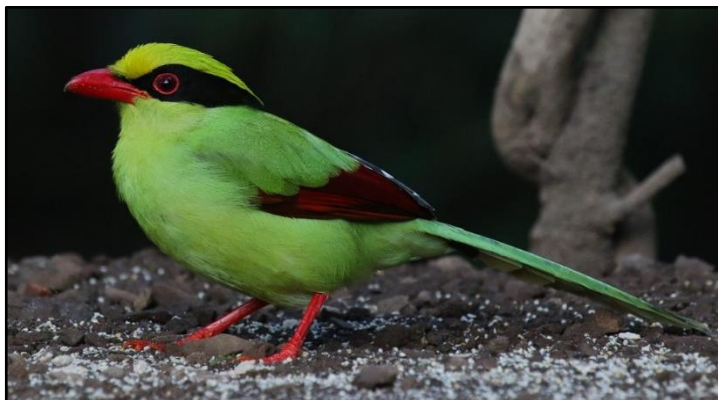
Common Green Magpie