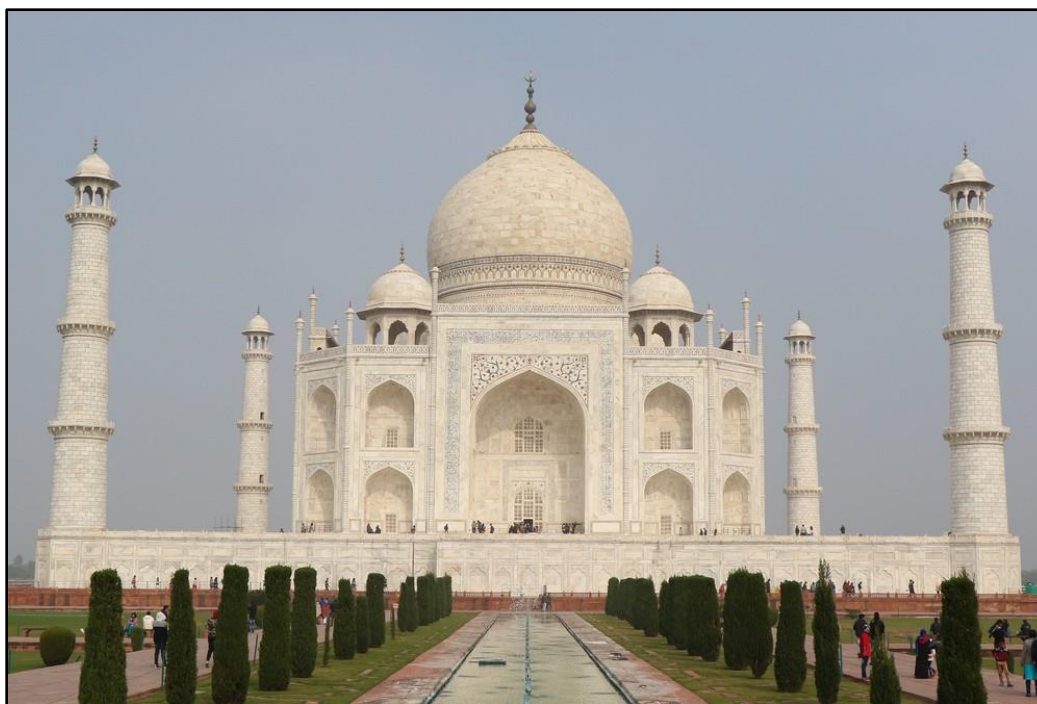
Taj Mahal