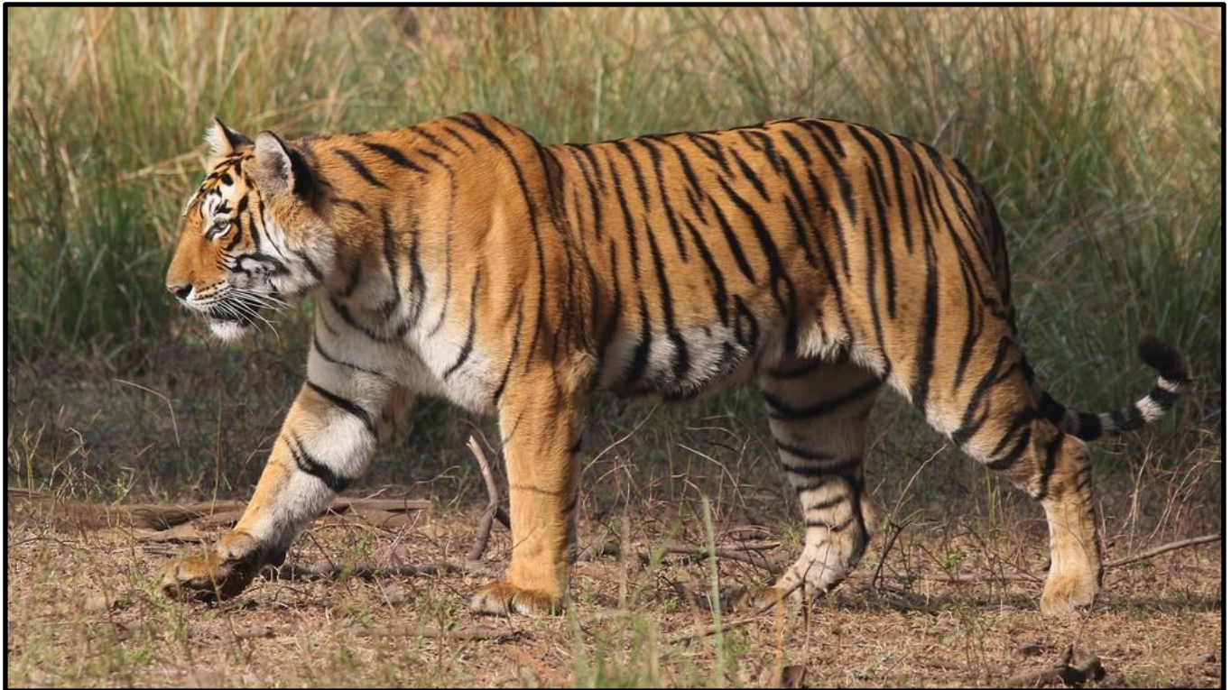
Tigress 'Arrow-head'