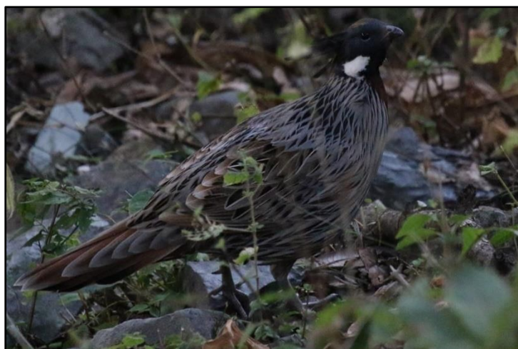
Koklass Pheasant

Speckled Piculet, Black-headed Jay, Common Rosefinch, Scaly-breasted Munia and Grey-backed Shrike. Finally, we visited Chafi where we found Slaty-backed Forktail and Scaly-breasted Cupwing.