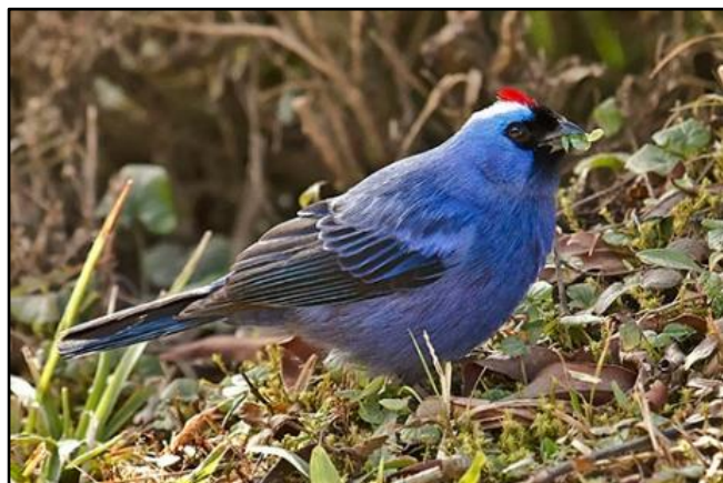
Diademed Tanager

closer! We did have some luck though, with great views of both male and female Pin-tailed Manakins, White-collared Foliage-Gleaner, Yellow-eared Woodpecker, Streaked Xenops, Lesser Woodcreeper and after a lot of effort, Cryptic Antthrush finally showed itself. Unfortunately, a very responsive Spot-billed Toucanet chose not to show and stayed hidden in the canopy calling back at us. We also picked up Mottle-cheeked Tyrannulet, Yellow-olive Flatbill and Bilal got a photo of a juvenile White-necked Thrush. Crested Oropendola was seen from the decking area in front of the Lodge late in the evening,