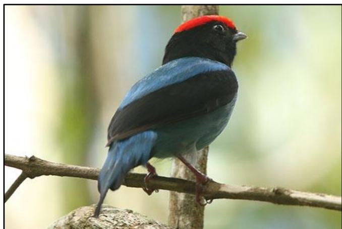
Blue Manakin

Parakeets, Ruby-crowned Tanager, Rufous-collared Sparrow, Brazilian Ruby and Violet-capped Woodnymph. After a short break, we met up again, ready for our first walk into the forest. We set off along the White Trail and were soon picking up our first Atlantic forest endemics, including some stunning Brassy-breasted Tanagers, Ochre-rumped Antbird and Blue Manakin, together with a couple of Variable Antshrikes. Close by, a Giant Antshrike called, we quickly used some playback and soon after a beautiful female Giant Antshrike appeared and gave an excellent show for us all! We also picked up a couple of Chestnut-crowned Becards followed by good views of a pair of Orange-eyed Thornbirds and shortly afterwards, a rather uncooperative Buff-fronted Foliage-gleaner and a White-rimmed Warbler.