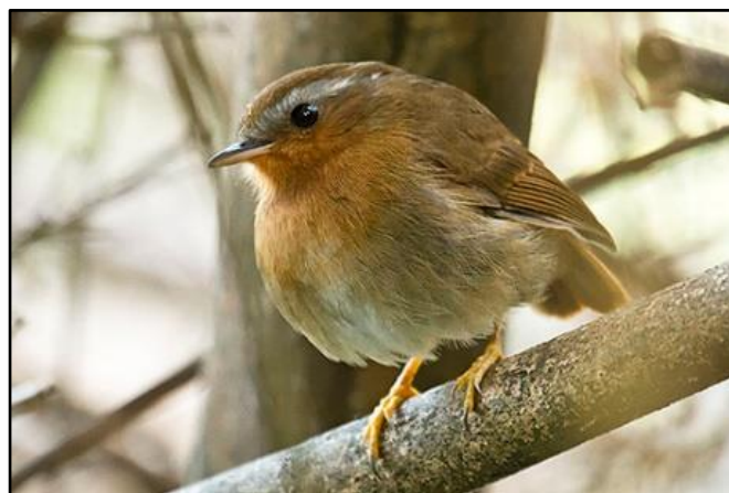
Rufous Gnateater