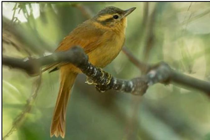
Ochre-breasted Foliage-Gleaner