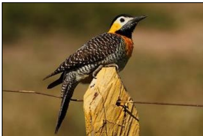
Campo Flicker by Glen Valentine

decided to continue up the rest of the steps for a view of Tres Picos, whilst the rest of us walked slowly down for lunch. It's amazing how good sandwiches taste after a long walk! After lunch we continued on down, stopping at various places to try for Grey-winged Cotinga, the only bird we were missing from the site's target list! We had a few responses to playback and a bird actually came quite close at one point, but unfortunately, it wasn't to be and after a lot of effort, we had to give up our search for this difficult cotinga!