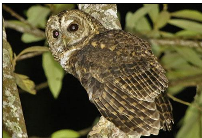
Rusty-barred Owl

Wednesday, 25 th January - The group arrived on 4 different flights and were met by our driver, Serginho, at 12:00 at Terminal 2 of Rio's International Airport. They departed from the intense heat of Rio at 12:10, seeing Magnificent Frigatebirds and Great Egret as they drove around the Guanabara Bay. After a smooth journey, they arrived at the Lodge to a much cooler climate. After the minibus was unpacked, a well-deserved lunch was served and the group were then shown to their rooms. The feeders had been quite quiet due to the abundance of fruit in the surrounding forests, but we did pick up Maroon-bellied