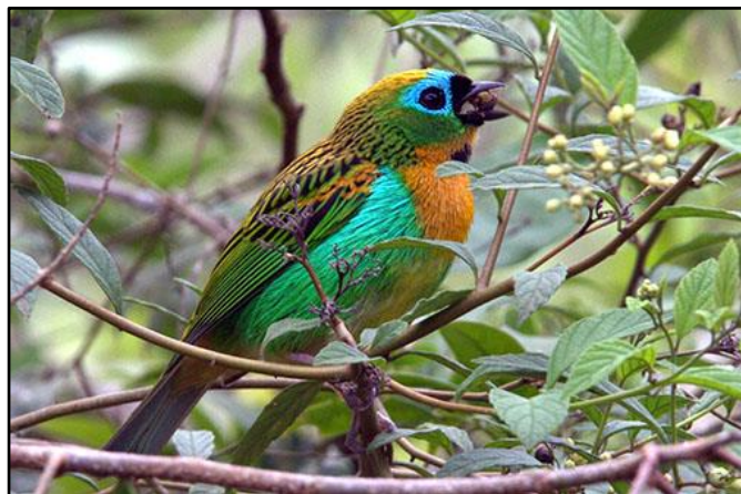
Brassy-breasted Tanager