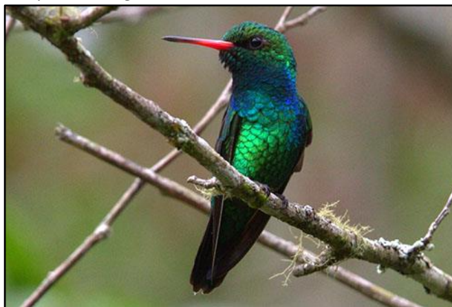
Glittering-bellied Emerald