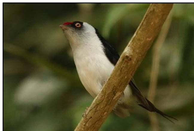
Pin-tailed Manakin

It turned out to be quite a slow afternoon, lots of birds calling about an hour into the walk but nothing much wanted to respond and come any