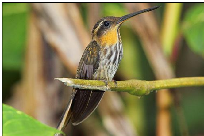
Saw-billed Hermit

thankfully we eventually did! Now for a great bird, we had been sporadically playing Spot-backed Antshrike as we walked down the trail, finally one came in, and although high up in the canopy, we all got good views of this great endemic, we also had good views of a couple of Black-throated Grosbeaks.