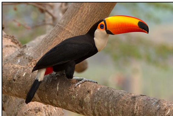
Toco Toucan

it flew just a few feet above his head as it came through in response to playback!