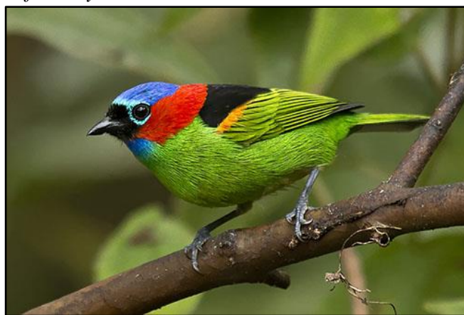
Red-necked Tanager by Dušan Brinkhuizen

The clouds were slowly building up as it got hotter during the day, we decided to drive to the end of the trail and work our way backwards just in case the weather suddenly changed and torrential rain set in - as it often does mid-afternoon at this time of the year. We drove for around 30 minutes and came to our final birding spot. We had a handful of targets here, and the area certainly didn't disappoint! First up we picked up Slaty Bristlefront, then a real flurry of birds that included White-bibbed Antbird, Surucua Trogon, both male and female Spot-billed Toucanets and Star-throated Antwren. It