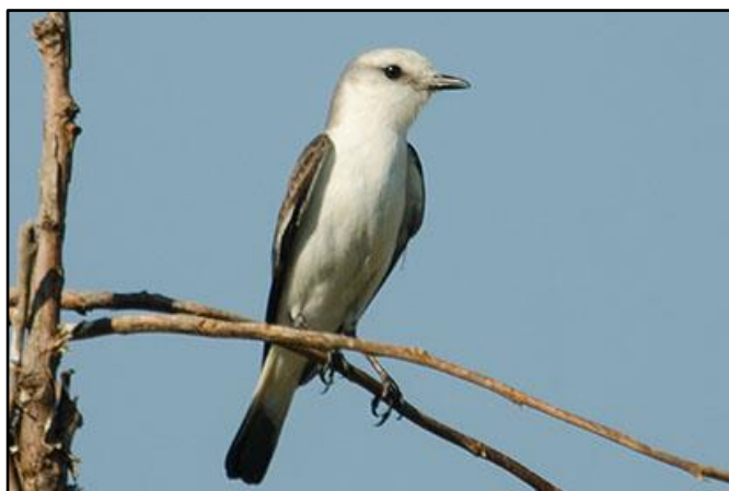
White-rumped Monjita by Forrest Rowland

just before Duas Barras, where we saw White-rumped Monjita and Grassland Yellow Finch.