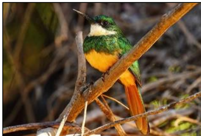
Rufous-tailed Jacamar