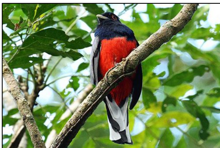
Surucua Trogon by Glen Valentine

Monday, 30 th January - Yet another clear day with sunshine - hard to believe this is the summer with no real rain yet! Today we headed off on a 30-minute drive to the start of the track leading to Macae de Cima. We had high expectations for today, good weather, nice and cool, with the potential of seeing a lot of new species. All started well at our first stop where I played for Tufted Antshrike, within a few minutes, we had a beautiful male right in front of us! We took a short walk up the road and soon picked up several Saffron Toucanets, Planalto Woodcreeper, Yellow-lored Tody-Flycatchers and amazing scope views of Bare-