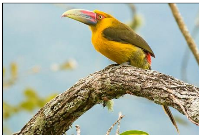
Saffron Toucanet by Dušan Brinkhuizen

Tuesday, 31 st January - So, here we are on the last full day of the tour, where had the week gone? Time had passed so quickly! We had breakfast as usual at 06:00, picking up good views of a Scaled Woodcreeper off of the decking area before our departure at 06:30 for the Cedae Trail, just a 35-minute drive away from the Lodge. We had a lot of targets for this trail that runs through good primary forest at an altitude of 550 metres. All started well with a female Chestnut-bellied Euphonia, followed shortly afterwards by a couple of White-eyed Foliage-Gleaners that gave us a good run around trying to see them, which