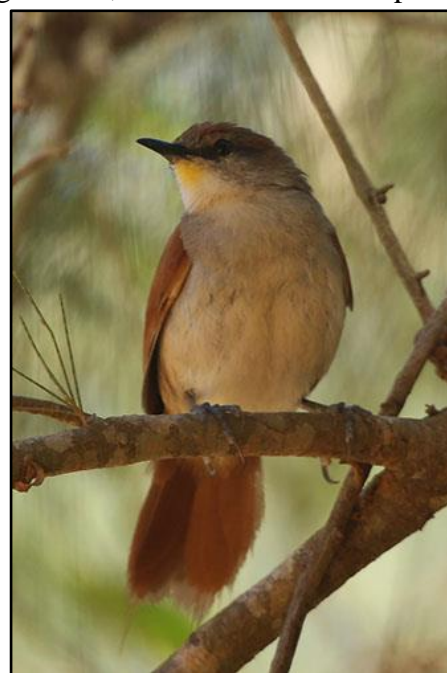
Yellow-chinned Spinetail by Andy Foster

Saturday, 28 th January - We awoke to another beautifully clear day. Today we were to spend the day birding in open country, a nice change to forest birding. Just before leaving, we picked up several Sick's Swifts flying over the Lodge. We set off at 06:30 and drove for around an hour until our first stop, just south of a small town called Duas Barras. We eagerly got out of the minibus and started to scan over a small valley of open grassland with scattered trees and a nice marsh in the bottom of the valley. We soon picked up both Rufous and Band-tailed Horneros, Streamer-tailed Tyrant, Grey-headed Kite, and White-bellied Seedeater. A couple of Blue-winged Macaws flew over high but unfortunately refused to respond to playback and come any closer, we also had our first Yellow-chinned Spinetail of the day and also a Swallow-tailed Hummingbird.